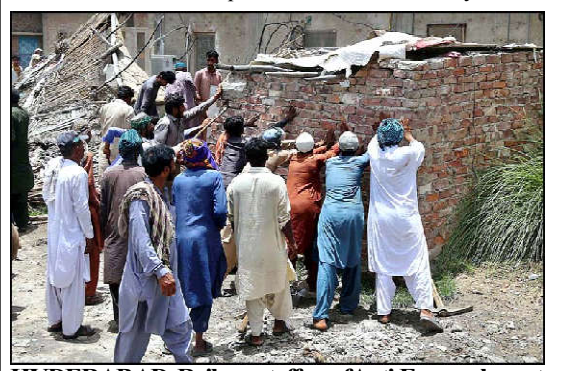
HYDERABAD: Railway staffers of Anti-Encroachment Cell demolishing encroachments at Makkhi Shah area.