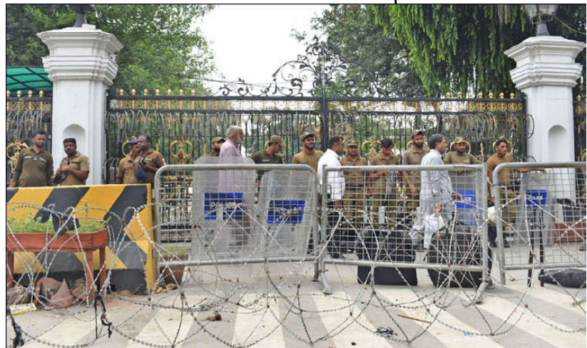
LAHORE: Police personnel stand guard during the protest of Government Employees of Punjab outside Civil Secretariat in Provincial Capital.