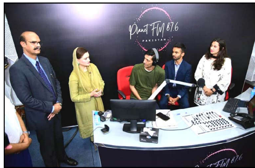
Ms. Marriyum Aurangzeb, Federal Minister for Information and Broadcasting inaugurating a podcast studio titled "Planet FM 87.6" at Radio Pakistan, Islamabad.

No better example can be found than Germany and Japan which were destroyed by powerful bombs but today these countries stand among the developed countries of the world.