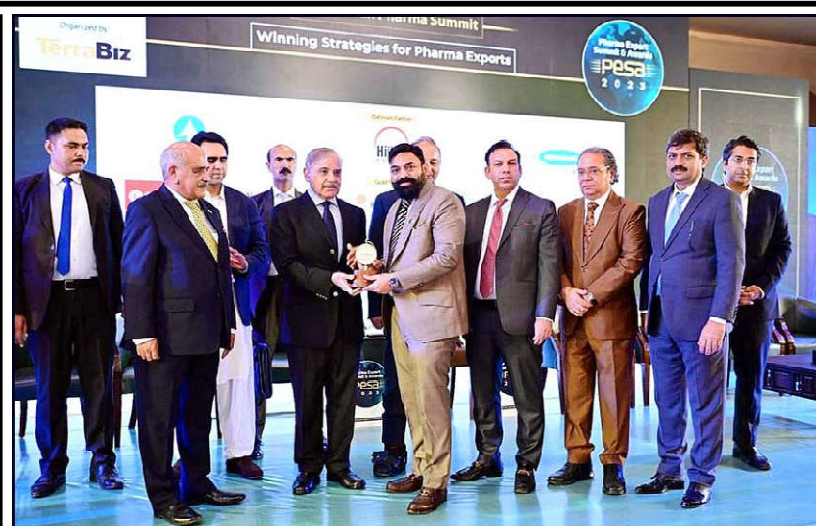
ISLAMABAD: Prime Minister Muhammad Shehbaz Sharif distributes awards among the highest exporters of Pharmaceutical Industry in Pakistan.