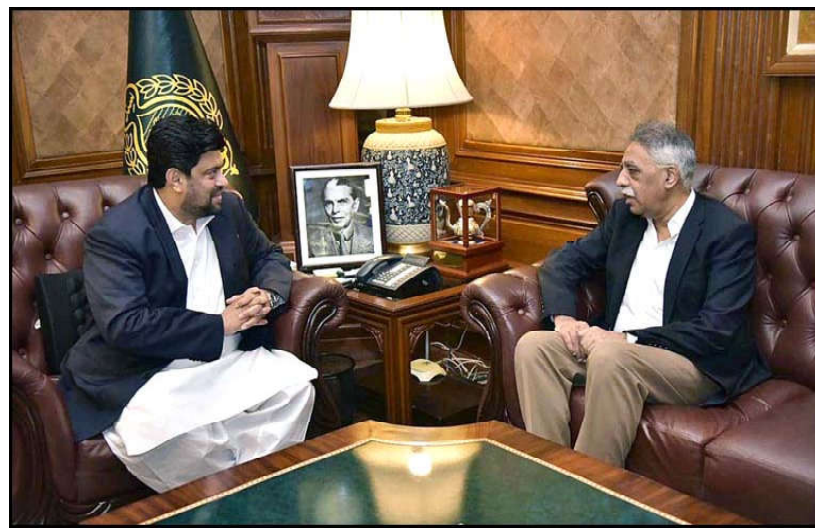
KARACHI: Former Sindh Governor Muhammad Zubair calls on Sindh Governor Kamran Khan Tessori at Governor House.

Mohsin Naqvi disclosed that snake bite treatment vaccines and other essential medicines were made available in the medical camps. He said that he had also sought a report from Commissioner Faisalabad about flood in River Chenab.