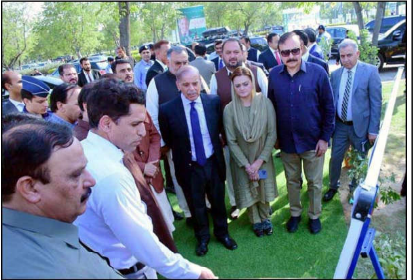
ISLAMABAD: Prime Minister Muhammad Shehbaz Sharif being briefed about Monsoon Tree Plantation Drive 2023.

ment. He wanted the country to default, but with the blessings of Almighty and efforts of the coalition government, such an eventuality was averted, the prime minister added. Pm Shehbaz said not a single corruption scandal had been reported during the current government's tenure of over one year, rather billions of rupees were saved by reaching big deals such as import of wheat and the agreement of a nuclear power project with China. The cost of the nuclear power project remained the same as agreed with the then prime minister Nawaz Sharif in 2018, besides a discount of Rs 30 billion, he added.