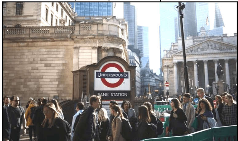
People walk outside the Bank of England in the City of London financial district in London, Britain.

"None of the investigations has been concluded and at this point, it is still not possible to say when they will be concluded. The nature of the acts of sabotage is unprecedented and the investigations are complex," the three wrote in a joint letter, dated Monday.