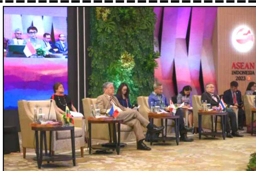
Philippine's Foreign Secretary Enrique Manalo, Singapore's Foreign Minister Vivian Balakrishnan and Thailand's Foreign Minister Don Pramudwinai attend the Association of Southeast Asian Nations (ASEAN) Foreign Ministers' Interface With ASEAN Intergovernmental Commission on Human Rights Representatives as the seat reserved for Myanmar is left unoccupied at the ASEAN Foreign Ministers' Meeting in Jakarta, Indonesia.

minutes before it fell into the Sea of Japan about 155 miles west of Okushiri Island in Hokkaido around 11:13 a.m. The missile, which was launched at a lofted trajectory, was estimated to have traveled 620 miles and reached a maximum altitude of about 3,725 miles. Matsuno said that it landed outside Japan's exclusive economic zone and that there were no reports of damage in the area.