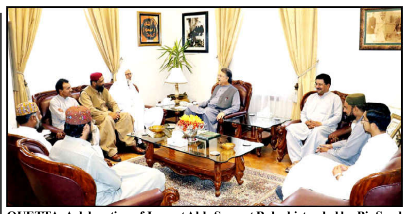
QUETTA: A delegation of Jamaat Ahle Sunnat Balochistan led by Pir Syed Habibullah Chishti meeting with Governor Balochistan Malik Abdul Wali Khan Kakar

While condemning the desecration of the Holy Quran, they argued the OIC initiative was designed to safeguard religious symbols rather than human rights. An Iraqi immigrant to Sweden desecrated the Holy Quran outside a Stockholm mosque last month, sparking outrage across the Muslim world and demands by Muslim states for action.