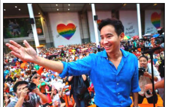
Move Forward Party leader Pita Limjaroenrat greets supporters during a rally to thank voters ahead of the vote for a new prime minister, in Bangkok, Thailand.

A South Korean presidential official has said the Fukushima water discharge plan could be discussed at the meeting. South Korea's government said on Friday it respected the IAEA's report and that its own analysis had found the release will not have "any meaningful impact" on its waters.