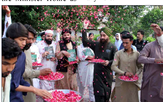
PESHAWAR: Members of Minority Community are expressing solidarity with Muslims as they are holding protest demonstration against desecration of Holy Quran in Sweden, at Gor Kathri Parkin

Moreover, strongly condemned the incident of killing and expressed deep grief and sorrow over it. He also asked the police and levies force to take steps as he can't see blood-shed in the province