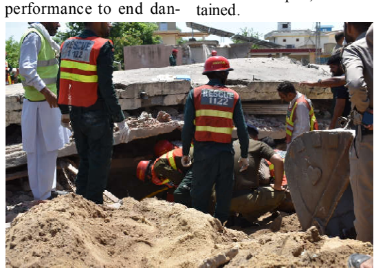
JHELUM: A view of site of gas cylinder explosion flattens three-storey building

Moreover, an effective system of the checking on entry and exit routes should also be developed, he main-