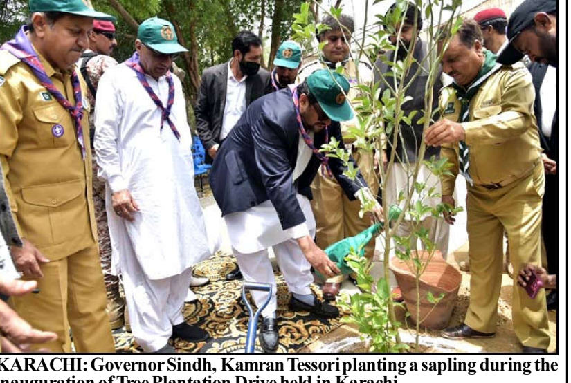
KARACHI: Governor Sindh, Kamran Tessori planting a sapling during the inauguration of Tree Plantation Drive held in Karachi.

HYDERABAD: Residents of Radio Pakistan area are blocked road and burn tires as they are holding protest demonstration against prolong electricity load shedding in their area, in Hyderabad