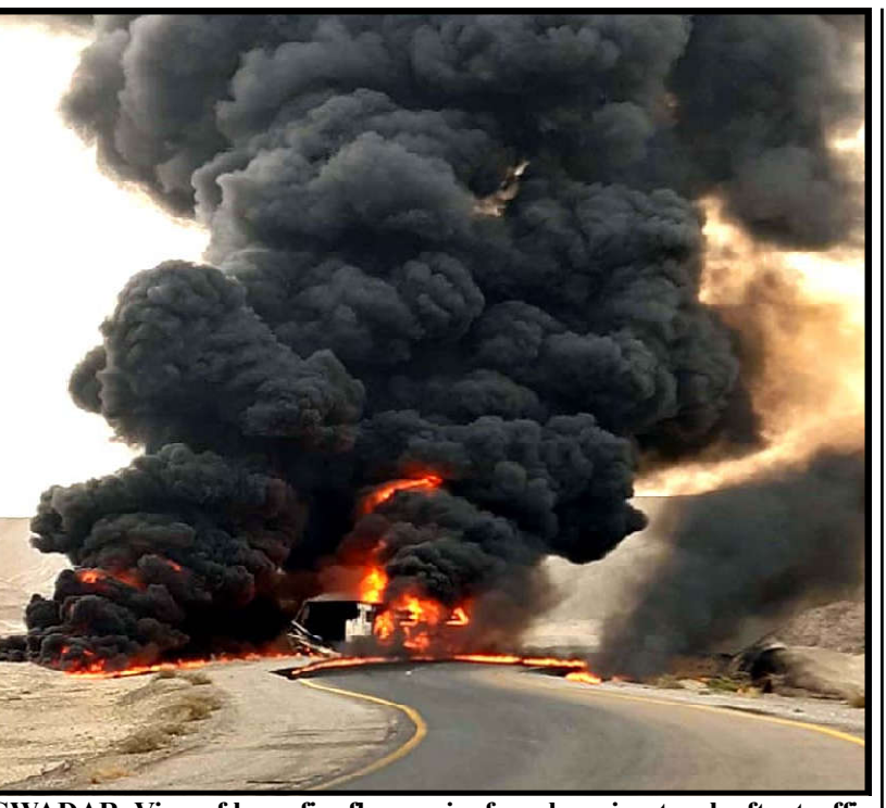
GWADAR: View of huge fire flames rise from burning truck after traffic accident due to over speeding, at Makran Coastal Highway in Gwadar.