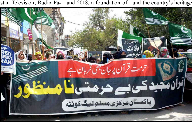
QUETTA: Activists of the Pakistan Muslim League Women's Wing hold a protest against the desecration of the Quran in Sweden in front of the press club.

The minister said that for the first time, slogan was raised in the Parliament to auction PTV and Radio Pakistan buildings and these organizations. She said that those behind such slogans did not know the signifi-She said that in 2017 cance of national brodeasters