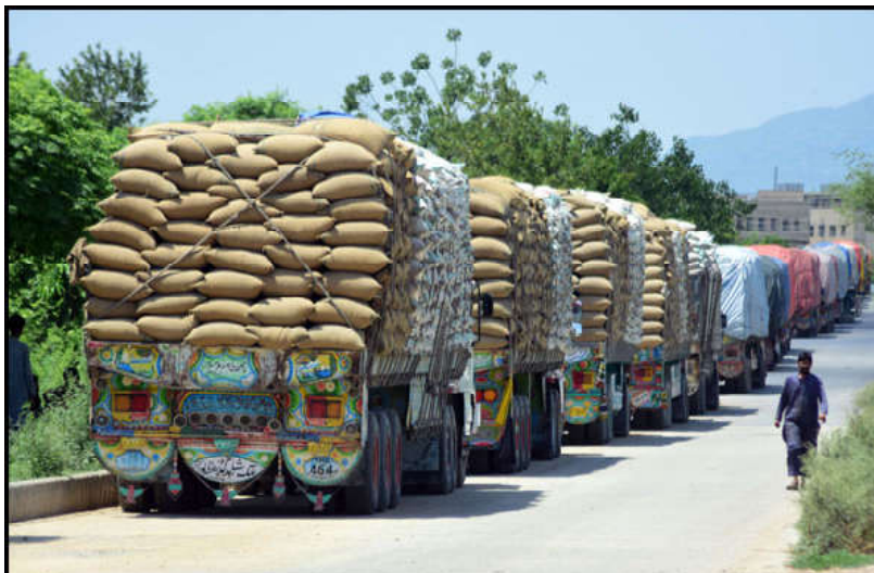
ISLAMABAD: A view of the trucks parked outside Floor mills at Sector I-11 as waiting for laborers to unload them, in Federal Capital.