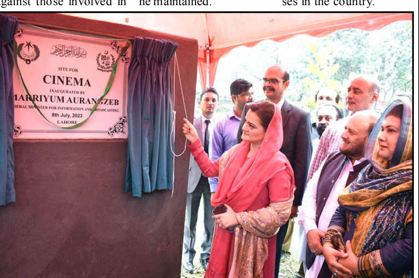
LAHORE: Federal Minister for Information and Broadcasting, Ms. Marriyum Aurangzeb Inaugurating the foundation stone for the construction of cinema building of projects at Radio Pakistan Station building.

The entire nation was standing behind its armed forces and its chief and resolved not to allow the disappointed and panicked elements to create new crises in the country.