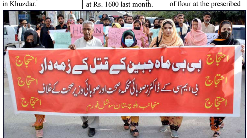
QUETTA: Activists of Balochistan National Social Forum hold a protest rally in favour of their demands

had directed the district administration to ensure sale of flour at the prescribed