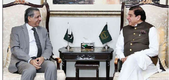
ISLAMABAD: Federal Minister for Law & Justice Senator Azam Nazir Tarar called on Speaker National Assembly Raja Pervez Ashraf.

The president asked the ambassador to create awareness in Ethiopia about the rising tide of Islamophobia in the world and the need for collective efforts to promote inter-faith harmony and mutual respect. He also urged the newly-appointed envoy to highlight the human rights violations and atrocities being committed by India in the Indian Illegally Occupied Jammu and Kashmir (IIOJK) as well as the maltreatment of minorities.