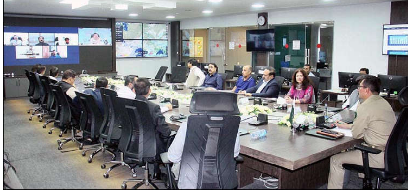
ISLAMABAD: Chairman NDMA presiding Special Session of NEOC on monsoon situation.

He instructed relevant departments to prepare resource contingency plans, implement early warning systems and disaster mitigation interventions in hazard-prone areas by learning from the experiences of Floods 2022. He noted that proactive measures are essential in mitigating disaster impact and called for tangible actions before disaster strikes. The DG PMD briefed on rainfall data in last 24 hours and upcoming monsoon spell. He informed that next monsoon spell is expected to bring heavy rains in the upper parts of the country from July 31 st to August 6 th , triggering urban flooding.