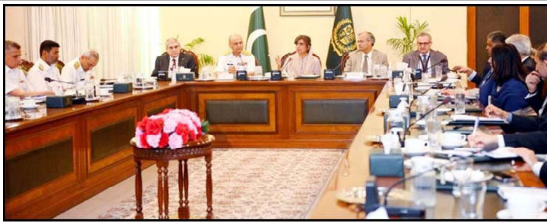
ISLAMABAD: Minister of State for Foreign Affairs Hina Rabbani Khar speaking at annual talks between Ministry for Foreign Affairs and Pakistan Naval Headquarters.

The counsel asked the witness that whether the Form-B mentioned by him was also prepared by him.