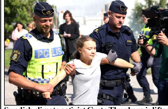
Swedish climate activist Greta Thunberg is lifted away by police when she takes part in a new climate action in Oljehammen in Malmo, Sweden.

the most vulnerable will pay the highest price," Guterres told the U.N. Food Systems summit in Rome on Monday. "When food prices rise, everybody pays for it." Since Russia quit the deal and began attacking Ukrainian food-exporting ports on the Black Sea and Danube river, global wheat and corn futures have risen sharply. "This is especially devastating for vulnerable countries struggling to feed their people," Guterres said. Guterres had written to Putin on July 11 in a final effort to save the deal.