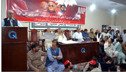
QUETTA: Awami National Party (ANP) Leader, Dr. Inayatullah Kasi addresses during the inauguration ceremony of Provincial Election Commission Membership held at Quetta press club.

The agreement will be signed between the governments of the UAE and Pakistan. The CCoIGCT considered summary of Ministry of Maritime Affairs regarding G2G agreement between the Governments of UAE & Pakistan on Cooperation for the Development of Bulk and General Cargo Terminal at East Wharf at Karachi Port under Inter-Governmental Commercial Transaction.