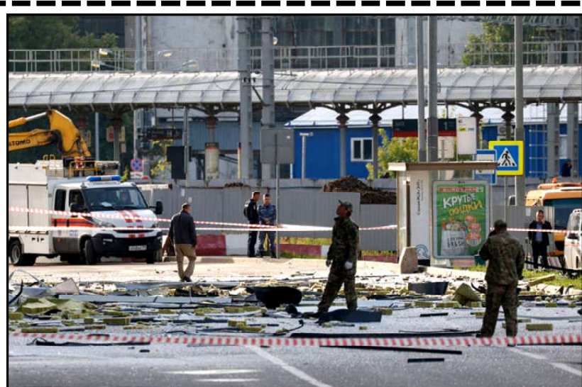
Members of the security services investigate the site of a damaged building following a reported drone attack in Moscow, Russia.