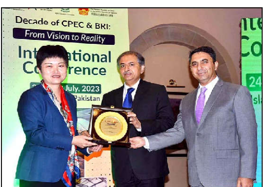
ISLAMABAD: The two-day International conference, organized by the Ministry of Planning Development & Special Initiatives in collaboration with Embassy of the Republic of China, kicked off on Monday with the theme "Decade of China Pakistan Economic Corridor (CPEC) & Belt & Road Initiative (BRI) from vision to reality to mark the 10-year celebrations of CPEC.