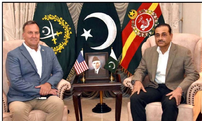
RAWALPINDI: Chief of Army Staff (COAS), General Syed Asim Munir exchanging views with General Michael Erik Kurilla, Commander United States (US) CENTCOM during meeting held at General Headquarters (GHQ) in Rawalpindi.