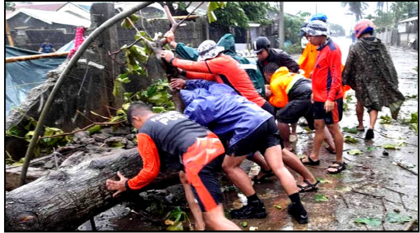
Members of the Philippine Coast Guard remove a fallen tree from a road following the onslaught of Typhoon Doksuri in Buguey, Cagayan province, Philippines.