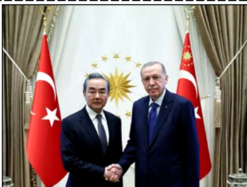
Turkey's President Tayyip Erdogan meets with Chinese Foreign Minister Wang Yi at the Presidential Palace in Ankara, Turkey.

During his talks with Wang, Erdogan voiced hope that Turkey and China would intensify their cooperation as both countries play important roles in global and regional issues, Erdogan's office said in a statement released after the meeting. Fidan and Wang also touched on the development of economic and trade relations between Turkey and China, the Turkish foreign ministry source said. Their discussions included "harmonisation of the initiatives of (China's) Belt and Road and Middle Corridor", as well as nuclear energy, agriculture and civil aviation, the source added.