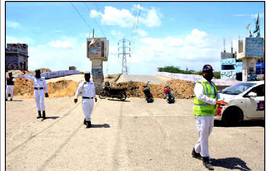
KARACHI: View of closed Korangi Causeway road for traffic that was completely destroyed while security and rescue officials stand alert to avoid untoward incident after flood flowed in Korangi Drain River after heavy downpour of monsoon season, in Karachi.