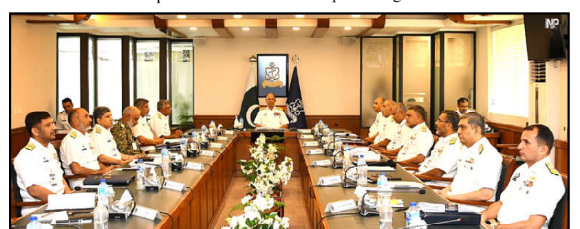
ISLAMABAD: Chief of the Naval Staff Admiral Muhammad Amjad Khan Niazi chairing the Command & Staff Conference of Pakistan Navy held at Naval Headquarters.

The court, in its judgment, stated that the appointment of Coordinators and spokespersons to CM and GoB by the respondent No. 1 means Chief Minister has financially burdened the province of Balochistan, which is already suffering from financial crises / deficit budget.