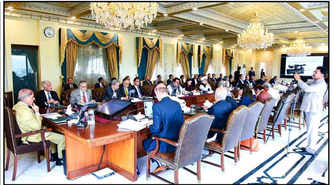
ISLAMABAD: Prime Minister Muhammad Shehbaz Sharif chairs Federal Cabinet Meeting.

APP adds: The Joint sitting of Parliament on Wednesday passed much-awaited amendments in the Election (Amendment) Bill, 2020 which aimed to improve the election law and ensure smooth and transparent elections.