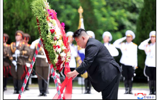
North Korean leader Kim Jong Un visits the Chinese People's Volunteer Army Martyrs' cemetery in this photo released by North Korea's Korean Central News Agency (KCNA).

Monitoring Desk SEOUL: After years of pandemic isolation, North Korea has invited its friends back this week, hosting senior Chinese and Russian delegations for 70 th anniversary commemorations of the Korean War and the struggle against the United States and its allies. The visiting dignitaries, which include Russian Defence Minister Sergei Shoigu and Chinese Communist Party Politburo member Li Hongzhong, are expected to be presented with one of North Korea's signature events: a massive military parade showcasing its latest weaponry. Analysts say the spectacle will likely include the North's nuclear-tipped missiles banned by the United Nations Security Council, where Russia and China are permanent members. The visits are the first known foreign delegations to visit North Korea since the COVID-19 pandemic began, and come as Pyongyang has looked to deepen its ties with Beijing and Moscow, finding common ground in their rivalries with Washington and the West. Thursday's holiday, in which North Korea celebrates what it sees as a victory over U.S.-led allied forces in the 1950-1953 Korean War, provides a chance for Pyongyang to highlight the Cold War days when North Korean troops fought with Chinese and Russian support.