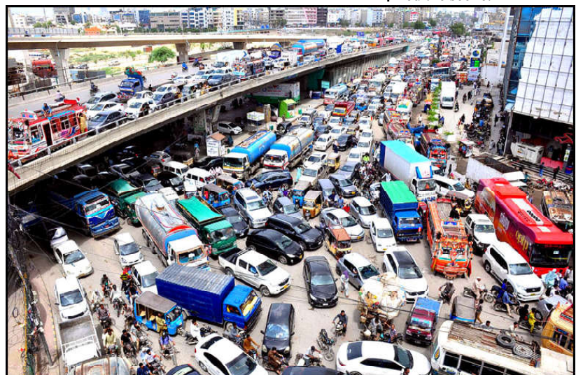
KARACHI: A view of the massive traffic jam at Qayyumabad area due to the closure of the road because of the flooded conditions on Korangi road in Provincial Capital.

PESHAWAR (INP): Khyber Pakhtunkhwa Deputy Education Officer District Khyber Shahid Ali Khan and other officials participated in the meeting. The provincial minister said that the caretaker government is taking practical steps for the promotion of education and besides the provision of facilities in educational institutions; scholarships are also being paid to both boys and girls students. He expressed these views while discussing the education sector projects in merged districts during a meeting with Education Adviser Rahmat Salam Khattak.