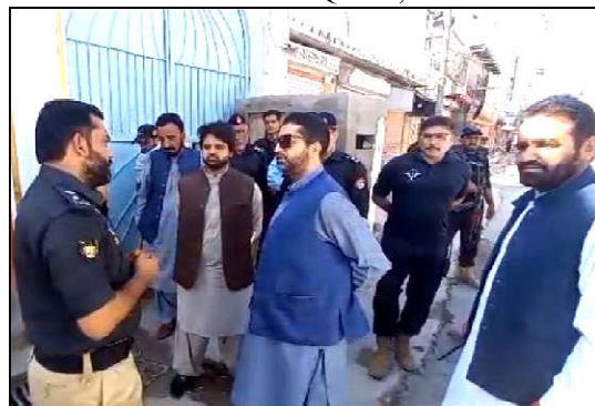
Haram. The Minister Home was speaking on occasion of the visit of Quetta city about the security arrangements made for the procession of 7th Muharrumul Haram in the provincial metropolis.