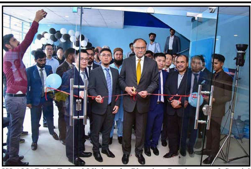
ISLAMABAD: Federal Minister for Planning, Development & Special Initiatives, Prof. Ahsan Iqbal cutting ribbon to inaugurate Hyper Future E-Commerce Operations Center.

ISLAMABAD (APP): The 100-index of the Pakistan Stock Exchange (PSX) continued with bullish trend on Wednesday, gaining 265.19 points, a positive change of 0.57 percent, closing at 46,682.53 points against 46,417.34 points the previous trading day. A total of 429,515,564 shares were traded during the day as compared to 319,893,485 shares the previous day, whereas the price of shares stood at Rs 14.137 billion against Rs 10.259 billion on the last trading day.