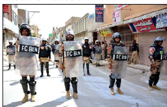
QUETTA: Security officials stand high alert on route to avoid any untoward incident as security has been tightened during mourning procession of 7th Muharrumul-Haram

He expressed the hope that all parties involved in the BSGI would engage in constructive dialogue to revive the Initiative. In this regard, the Foreign Minister reiterated Pakistan's support for international efforts for restoring the deal by addressing the concerns of all sides.