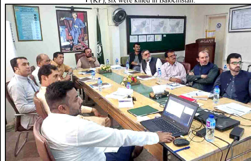
QUETTA: Provisional Election Commissioner Shareefullah chairs the Election Management Training Session in Provincial Capital.

ISLAMABAD (INP): The recent torrential rains across the country have so far killed 133 besides leaving 215 injured and causing damages to houses and infrastructure. The National Disaster Management Authority (NDMA) data stated that so far 133 deaths and 215 injuries to people have been reported, which includes 21 women and 55 children. As many as 368 houses have also been damaged as torrential rain continued to play havoc across the country, it added. Punjab has the most number of people who died where 65 people were killed in the heavy rains and 35 lost their lives in Khyber Pakhtunkhwa (KP), six were killed in Balochistan.