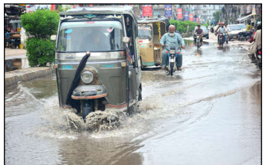
HYDERABAD: Rain water accumulated on the road at Latifabad.