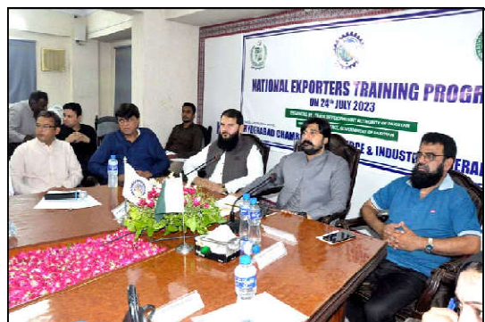
LAHORE: Prime Minister Muhammad Shehbaz Sharif signing the plaque of the groundbreaking of the Smart Special Economic Zone Sheikhupura, in Provincial Capital.

He said the commitment by the private sector to attract investment worth billions of rupees was also laudable, besides their plans to set up a three-megawatt solar power plant and other allied facilities like the vocational training center. He hoped that the interim government would also take all possible measures to keep the national economy on track of progress, as the incumbent one was already making necessary legislation to pave the way for future course of action.