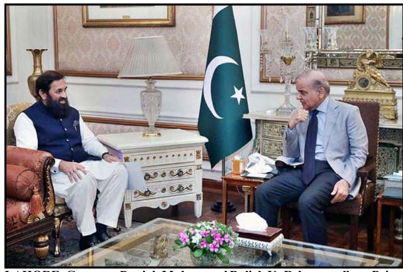
LAHORE: Governor Punjab Muhammad Baligh Ur Rehman calls on Prime Minister Muhammad Shehbaz Sharif.

RAWALPINDI (APP): Anti-Narcotics Force (ANF) in its operations against drug-traffickers managed to recover 37 kg narcotics and arrested four accused, said an ANF Headquarters spokesman. He informed that in an operation, ANF recovered 1.5 kg Ice drug being sent to a foreign country through a parcel booked at International Mail Office Rawalpindi. Ice was concealed in Hot Pots.