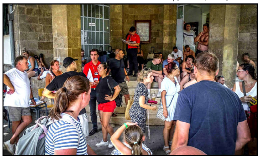
Tourists are seen after being evacuated following a wildfire on the island of Rhodes, Greece.

Monitoring Desk COPENHAGEN: Two protesters set fire to a copy of the Koran, Islam's holy book, in front of the Iraqi embassy in the Danish capital on Monday, risking a further deterioration of relations between the two countries. Protests have raged across Iran and Iraq after Denmark and Sweden allowed the burning of the Koran under rules protecting free speech.