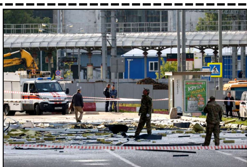
Members of the security services investigate the site of a damaged building following a reported drone attack in Moscow, Russia.