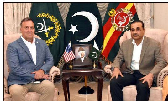
RAWALPINDI: Chief of Army Staff (COAS), General Syed Asim Munir exchanging views with General Michael Erik Kurilla, Commander United States (US) CENTCOM during meeting held at General Headquarters (GHQ) in Rawalpindi.

ISLAMABAD (APP): Minister for Information and Broadcasting Marriyum Aurangzeb on Monday said the caretaker prime minister would be appointed as per the procedure enshrined in the Constitution. The announcement for the purpose would also be made accordingly, the minister said in a news statement. According to the Constitution, the prime minister and the opposition leader would finalize the interim PM's appointment after consultation, Marriyum noted.