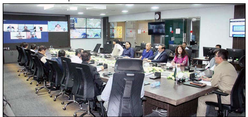
ISLAMABAD: Chairman NDMA presiding Special Session of NEOC on monsoon situation.