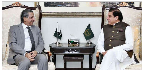
ISLAMABAD: Federal Minister for Law & Justice Senator Azam Nazir Tarar called on Speaker National Assembly Raja Pervez Ashraf.

chairman of all the local government bodies to activate the councilors so as to take necessary preventive measures in view of the rains and flashflood in any area. In this regard, all chief officers of the municipal corporations and committees have also been directed to take necessary measures through special communications.