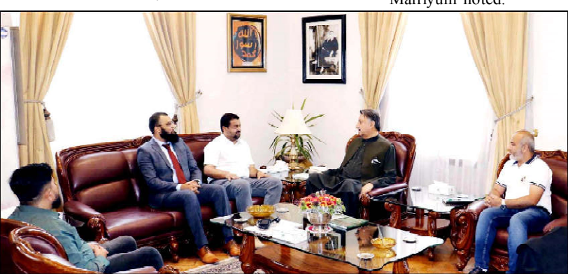
QUETTA: A delegation led by IT Advisor to Governor Sindh Muzammil Atar meeting with Governor Balochistan Malik Abdul Wali Khan Kakar

QUETTA (INP): An earthquake measuring 3.0 on the Richter scale jolted Quetta and its adjoining areas Balochistan province in the wee hours of Monday. People came out of their homes in panic and started reciting verses from the Holy Quran. No loss of life and property was reported from any part of Quetta due to earthquake. According to National Seismic Monitoring Centre, Islamabad, the epicenter of the earthquake was located in the 25 kilometres North-west of Quetta at the depth of 15 kilometres.