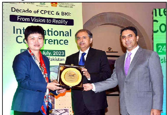
ISLAMABAD: The two-day International conference, organized by the Ministry of Planning Development & Special Initiatives in collaboration with Embassy of the Republic of China, kicked off on Monday with the theme "Decade of China Pakistan Economic Corridor (CPEC) & Belt & Road Initiative (BRI) from vision to reality to mark the 10-year celebrations of CPEC.

ISLAMABAD (APP): A two-day international conference, themed "Decade of China Pakistan Economic Corridor (CPEC) and Belt & Road Initiative (BRI): From Vision to Reality," started here on Monday to mark the 10-year celebrations of CPEC. The Ministry of Planning, Development and Special Initiatives has organized the conference in collaboration with the Chinese Embassy in Pakistan, a news release said. The key objective of the conference is to bring together policymakers, scholars, practitioners and other stakeholders to exchange ideas and insights related to the economic, social, environmental and geopolitical impacts of CPEC and BRI.