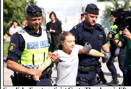
Swedish climate activist Greta Thunberg is lifted away by police when she takes part in a new climate action in Oljehammen in Malmo, Sweden.

the most vulnerable will pay the highest price," Guterres told the U.N. Food Systems summit in Rome on Monday. "When food prices rise, everybody pays for it." Since Russia quit the deal and began attacking Ukrainian food-exporting ports on the Black Sea and Danube river, global wheat and corn futures have risen sharply. "This is especially devastating for vulnerable countries struggling to feed their people," Guterres said. Guterres had written to Putin on July 11 in a final effort to save the deal.