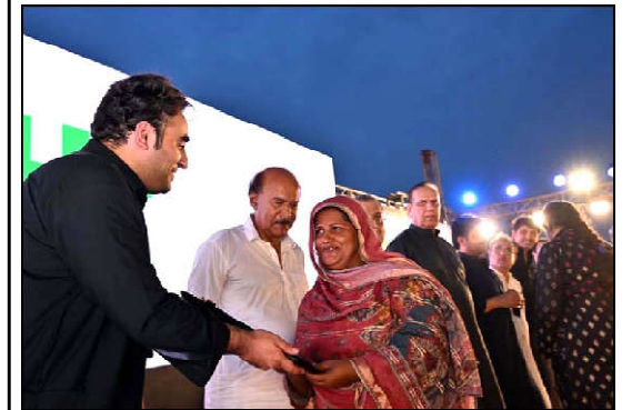
LARKANA: Peoples Party (PPP) Chairman, Bilawal Bhutto Zardari distributes Land Titles among flood affectees during the ceremony of Distribution of Land Titles for Flood Affectees held in Larkana.

we are bringing revolutionary projects for the public". He pledged to adopt the ideology of former prime minister Benazir Bhutto to every nook and cranny of the Sindh districts. Bhutto-Zardari asserted: "By winning the general elections, we will expand the projects". The foreign minister took a swipe at the Pakistani Tehreek-e-Insaf (PTI) chief, saying, "The PTI's doctrine is to make the rich even richer."