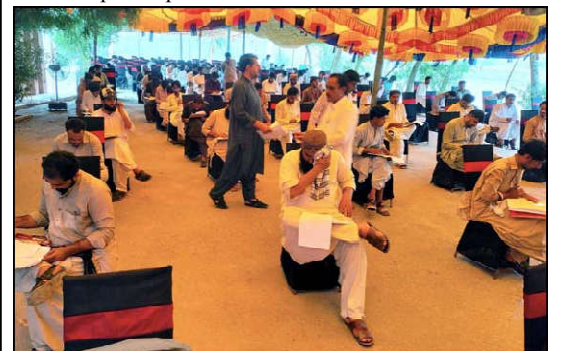
NASEERABAD: Participants are solving paper during examination for various vacant posts of Revenue Department Naseerabad Division.