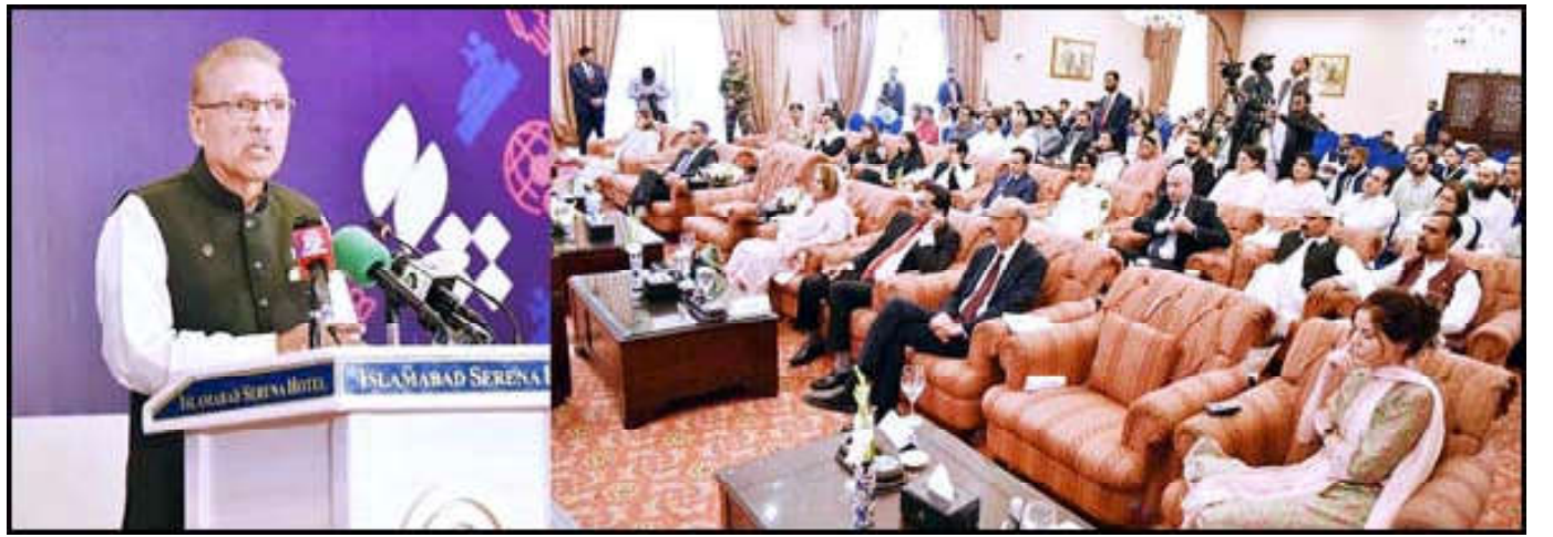
ISLAMABAD: President Dr Arif Alvi addressing the concluding ceremony of the Global Rehabilitation Leadership Institute Course.

Similarly, he also lauded the contribution and efforts by First Lady Samina Alvi on the issues including her traveling and interactions with the people on multiple health-related issues.