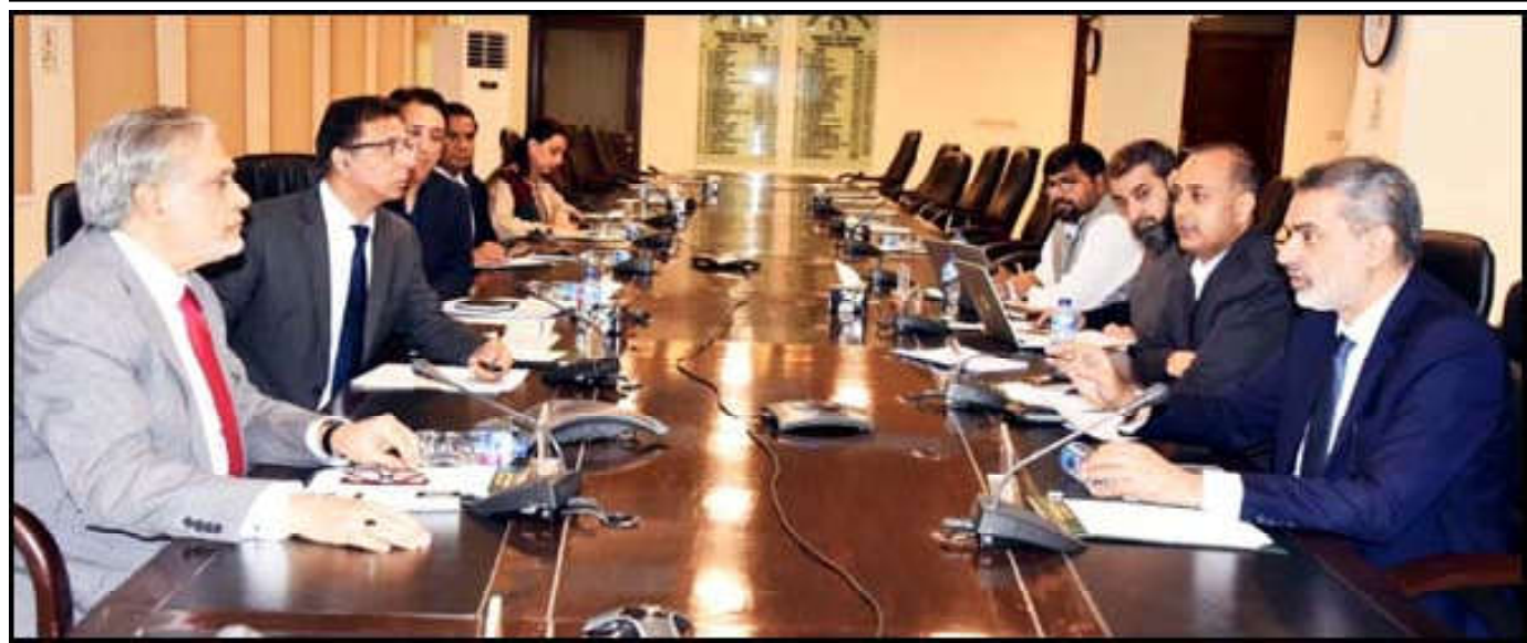
ISLAMABAD: Federal Minister for Finance and Revenue, Senator Mohammad Ishaq Dar chaired a meeting on the establishment of Pakistan Sovereign Wealth Fund (PSWF), at Finance Division in Islamabad.