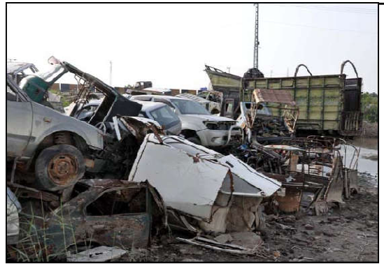
HYDERABAD: Impounded vehicles are ruining outside Hatri Bypass Police Station, showing the negligence of concerned authorities, in Hyderabad.