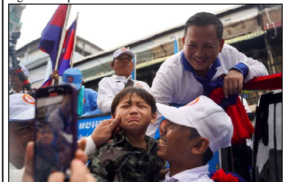
Hun Manet, son of Cambodia's Prime Minister Hun Sen, attends the final Cambodian People's Party (CPP) election campaign for the upcoming general election in Phnom Penh, Cambodia.

Moscow says it will return to the deal only if its demands are met for easier access for its own food and fertiliser exports to world markets.