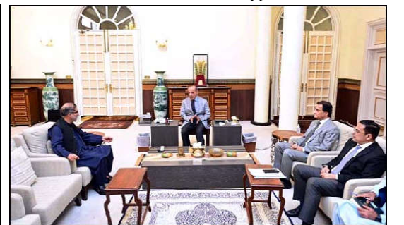
ISLAMABAD: Member National Assembly & Chairman Balochistan National Party Sardar Akhtar Mengal call on Prime Minister Muhammad Shehbaz Sharif.

In a statement issued here on Friday, the Minister Home said that we would succeed in the elections on the basis of public service. He said that we have always served the masses and would continue to do so in future, he maintained.