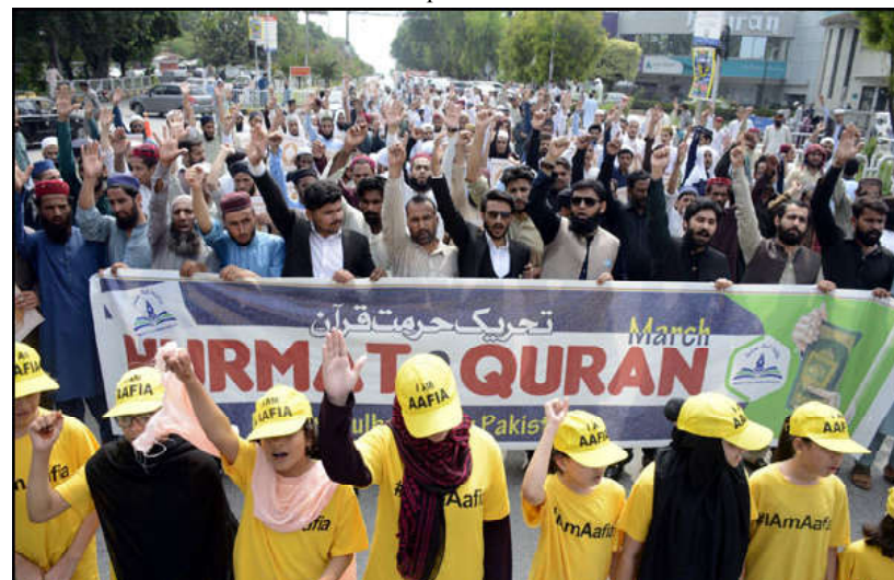
ISLAMABAD: Activists of Muslim Talba Mahaz shouting slogans during protest at Aahpara Chowk, against the burning of the Quran in Sweden.

He said, "It is very important to introduce global energy standards in the industrial sector and, in this regard, the government has not only banned the manufacturing of substandard bulbs but also increased the duty on the import of its raw materials." The federal minister said, "In this short period of time, the regulations of electrical appliances used in homes have been approved."