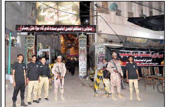
HYDERABAD: Security officials are standing high alert to avoid untoward incident during the Shiite Muslims mourning procession in connection of 2nd Muharram-ul-Haram, at Qadam Gha Mola Ali (R.A) in Hyderabad.

He said that a health screening certificate would be made compulsory for participating in the examination of the 9th class. He said that special focus was being paid on research work in medical institutes of the province. Earlier, the committee gave approval to different initiatives including the construction of the statue of Nishtar Medical University.