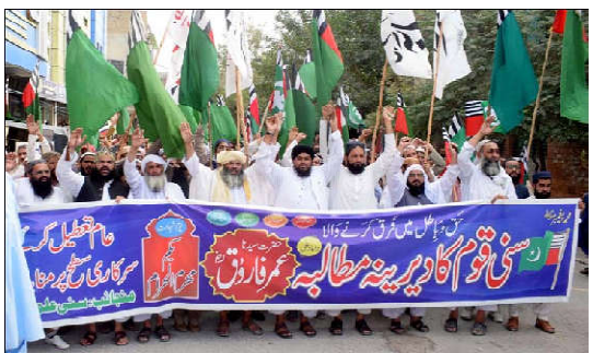
QUETTA: Members of Sunni Ulema Council are holding a rally in connection of first Muharram-ul-Haram the day of Martyrdom of 2nd Muslim Caliph Hazrat Umar Farooq (R.A).