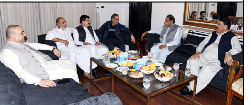
QUETTA: Chairman Senate Muhammad Sadiq Sanjrani meeting with Balochistan Chief Minister Mir Abdul Qudus Bizenjo. Speaker Balochistan Assembly Mir Jan Muhammad Jamal, MNA Mir Khalid Khan Magasi, Senator Naseebullah Bazai and Senator Abdul Qadir are also present.

ISLAMABAD (APP): Prime Minister Muhammad Shehbaz Sharif on Thursday highlighting the significant global impact of the Ukraine conflict hurting economies of many countries, stressed the need for a negotiated and diplomatic settlement in line with the UN Charter. The issue was discussed in a meeting between Prime Minister Shehbaz and Foreign Affairs of Ukraine Dmytro Kuleba, who is on a bilateral visit to Pakistan from July 20-21. They recalled the warm and friendly relations between their countries ever since Ukraine gained its independence.