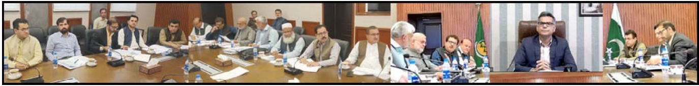
QUETTA: Balochistan Chief Secretary Abdul Aziz Uqaili presiding over the meeting to review outstanding dues of QESCO.

Colonel Hafiz Kashif and SSP Khuzdar Fahad Khosha. According to an official hand out issued here, it is an endeavour of the administration to normalize the situation. The efforts are also being made to stop the two-side firing and improve law and order in the area. On the other hand, the contacts are also being made with both the groups to resolve the issue. In the meantime, two private check posts set up by the tribal groups on the highway have been removed and the check posts of Balochistan constabulary and Levies are being set up there.