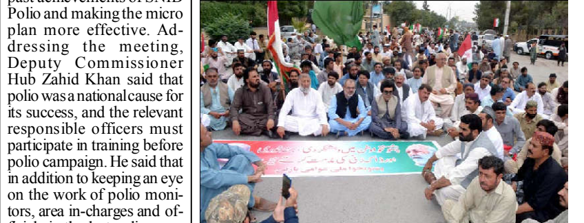
QUETTA: Members of Pashtunkhwa Milli Awami Party (PKMAP) are holding protest demonstration against unrest law and order situation in city, outside Balochistan Assembly building.

QUETTA (APP): Balochistan Health Department appointed 12 medical officers (BPS-17) including four lady medical officers for various jails of the province on an ad-hoc basis. The Health Department source on Thursday told APP that these appointments were made by Health Department in order to provide health facilities to prisoners in respective jails of Balochistan saying that prisoners were deprived of health care facilities for a long time in the jails. The source further said that prisoners' patients had shifted to nearby hospitals for treatment in the past saying that Balochistan Govt took initiatives and recruited medical officers for 11 jails of the province so that prisoners would not face difficulties during medical aid.