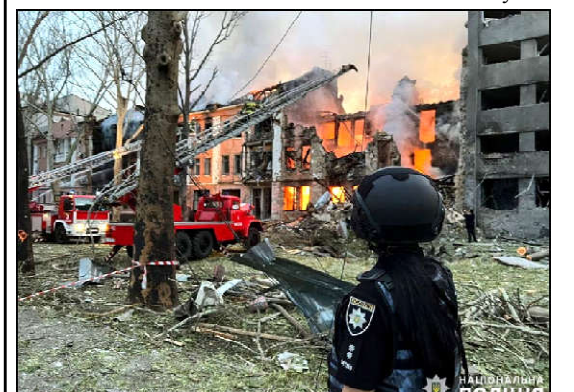
Emergency services personnel work at the site of a building that was damaged by a Russian missile strike, amid Russia's invasion of Ukraine.

brokered deal to let Ukraine export grain. The signals that Russia was willing to use force to reimpose its blockade of one of the world's biggest food exporters set global prices soaring. Moscow says it will not participate in the year-old grain deal without better terms for its own food and fertiliser sales. The United Nations says Russia's decision threatens food security for the world's poorest people. Kyiv is hoping to resume exports without Russia's participation. But no ships have sailed from its ports since Moscow pulled out of the deal on Monday.