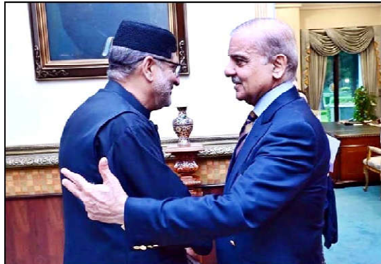
ISLAMABAD: Member National Assembly and Chairman of Balochistan National Party, Sardar Akhtar Mengal, calls on Prime Minister Muhammad Shehbaz Sharif.

on the caretaker set-up besides discussing the organizational matters of the party. It was decided that the candidates of party would be fielded in all constituencies. Similarly, it was also decided to make alliance with other political parties and seat adjustment. The parliamentary board would be formed for distribution of tickets, it was decided further. The meeting also decided to conduct a party meeting on July 26 to review the formation of parliamentary board and other party matters. The members of national and provincial assemblies and Senate were directed to ensure their participation in the meeting. The senior party leadership expressed complete confidence on its central President.