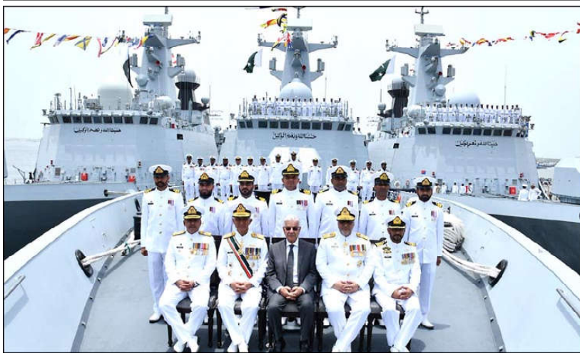
KARACHI: Federal Minister for Defence Khawaja Muhammad Asif in a group photo with Chief of the Naval Staff Admiral Muhammad Amjad Khan Niazi and ship crew during induction ceremony of two newly constructed PNS Shahjahan & Tippu Sultan held at Karachi.