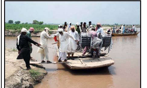
BAHAWALPUR: Floodwater forced people to travel in overloaded boats along with motorcycles in Patan Mangwani Mouza.

public in Khyber Pakhtunkhwa with full force while the business community were also receiving calls for ransom due to which the residents of the province were feeling insecure. He said that strict action should be taken against those who were calling the terrorists fighters and brought them back under secret agreement, adding that exemplary punishment should be given to the perpetrators of the recent attacks. The ANP leader expressed grief over the losses of precious lives in the terrorist attack and sympathized with the bereaved families.