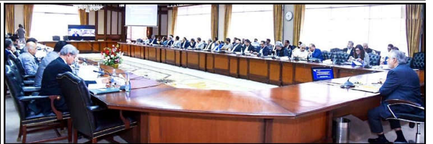
ISLAMABAD: Federal Minister for Finance and Revenue, Senator Mohammad Ishaq Dar chaired the meeting of the Economic Coordination Committee (ECC) of the Cabinet.

The three top-trading companies were WorldCall Telecom with 185,190,828 shares at Rs 1.43 per share; Bank of Punjab with 19,500,000 shares at Rs 4.20 per share and K-Electric with 15,889,256 shares at Rs 2.01 per share. Sapphire Fiber witnessed a maximum increase of Rs 61.00 per share price, closing at Rs 1295.00.