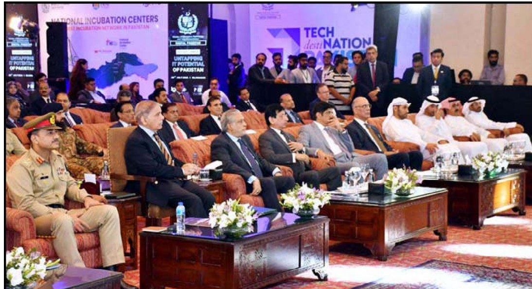
ISLAMABAD: Prime Minister Muhammad Shehbaz Sharif attends the National IT seminar as Chief Guest. Chief of Army Staff General Syed Asim Munir attended the seminar as Guest of Honor.

Ph: 2841470/2841473 Vol: XVI No. 70, Muharramul Haram 02, 1445 AH Friday July 21, 2023, Pages 08, Price Rs.15