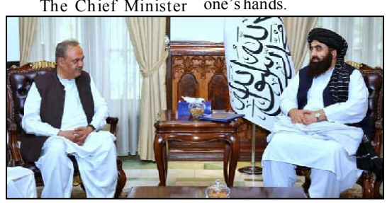
KABUL: Pakistan's Special Representative for Afghanistan Asif Durrani called on Taliban's interim Foreign Minister Amir Khan Muttaqi.

QUETTA: The Chief Minister Balochistan, Mir Abdul Qudus Bizenjo has expressed concern over the situation in Wadh area of Khuzdar. In an official statement issued here on Thursday, it was mentioned that the Chief Minister has been getting himself acquainted about the current situation of Wadh. He also appealed to both groups to demonstrate patience and tolerance. He said that it is also responsibility of the tribal and political elders along with the government to maintain law and order situation of the area.