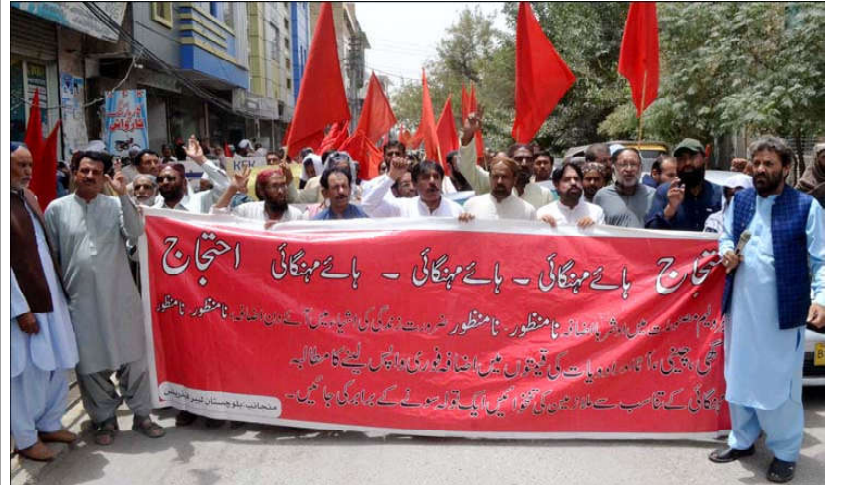
QUETTA: Members of Balochistan Labour Federation are holding protest demonstration against IMF Policies and massive unemployment, increasing price of daily use products and inflation price hiking.