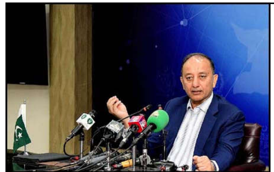
ISLAMABAD: Minister of State for Petroleum Dr. Musadik Malik addressing the press conference.