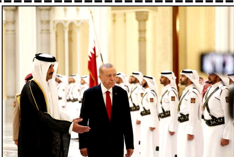
Turkish President Tayyip Erdogan and Qatar's Emir Sheikh Tamim Bin Hamad Al-Thani attend a welcoming ceremony in Doha, Qatar.

that Turkiye-Qatar relations reflect "deep-rooted" historical ties built on political and social foundations. "The current strategic partnership between the Republic of Turkiye and the State of Qatar is fruitful at all levels, and the two countries have similar approaches on most regional and international issues," it added. Economic and commercial cooperation between the two countries has witnessed steady growth over the past few years, it added. Qatari Emir Sheikh Tamim bin Hamad Al Thani welcomed Erdogan with an official ceremony.