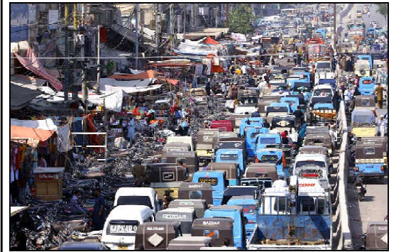
KARACHI: A large numbers of vehicles stuck in traffic jam due to negligence of traffic police staffs and illegal parking, at Liaquatabad in Karachi.