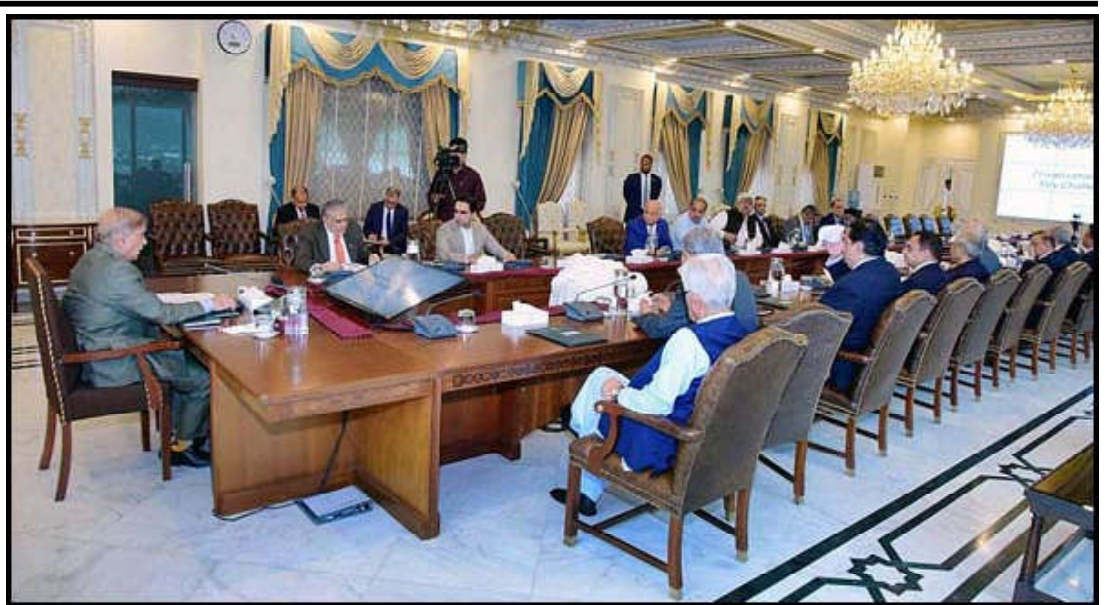
ISLAMABAD: Prime Minister Muhammad Shehbaz Sharif chairs a meeting to review the progress regarding the ongoing SOE reforms.