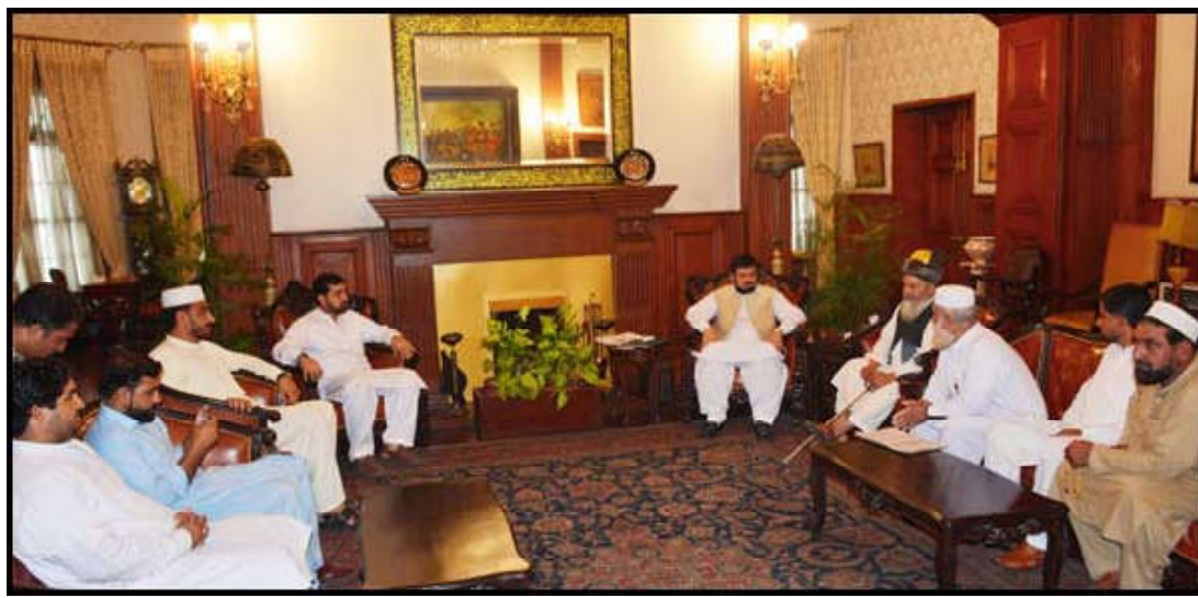
PESHAWAR: A delegation of public representatives of District Khyber Tehsil Bara meting with Khyber Pakhtunkhwa Haji Ghulam Ali.