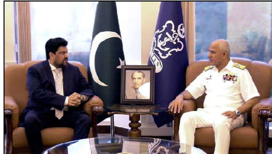
ISLAMABAD: Chief of the Naval Staff, Admiral Muhammad Amjad Khan Niazi exchanging views with Kamran Tessori, Governor Sindh during meeting held at Naval Headquarters in Islamabad.

programme would promote sports across the country through the training of talented youth, he added. The prime minister hoped that future governments would ensure the continuity of the programme in best interest of the youth. Shehbaz Sharif a day earlier launched multiple initiatives for promoting sports culture and welfare of the sports persons including the Rs 5 billion Pakistan Sports Endowment Fund with seed money of Rs 5 billion. The other initiatives include the soft launch of the first dedicated Sports University, the Elite Sportspersons Development Programme and the sports development programme.