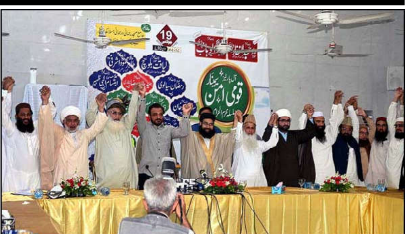
LAHORE: Chairman Pakistan Ulema Council and Special Representative of Prime Minister of Pakistan for Interfaith Harmony and Middle East Hafiz Muhammad Tahir Mahmood Ashrafi series of All Parties National Peace Seminar at Rahmani Islamic Center Model Town hand in hand for peace and unity on the occasion of Muharram.

the Senate of Pakistan's cooperation, ensuring a strong partnership between PHF and the Climate Change Parliamentary Caucus. In line with this commitment, he pledged that two representatives from PHF will be provided representation in the Caucus to enhance coordination between the two bodies. Furthermore, Chairman Senate stressed the need to raise awareness among the public to protect the future of our children. He pledged to provide PHF and similar organizations with appropriate platforms to support their initiatives effectively. Recognizing the significance of sustainable development in Balochistan, Chairman Senate proposed organizing a donor conference to channel resources towards the development of the province. Highlighting the critical role of the private sector, Chairman Senate called for their support in generating employment opportunities.