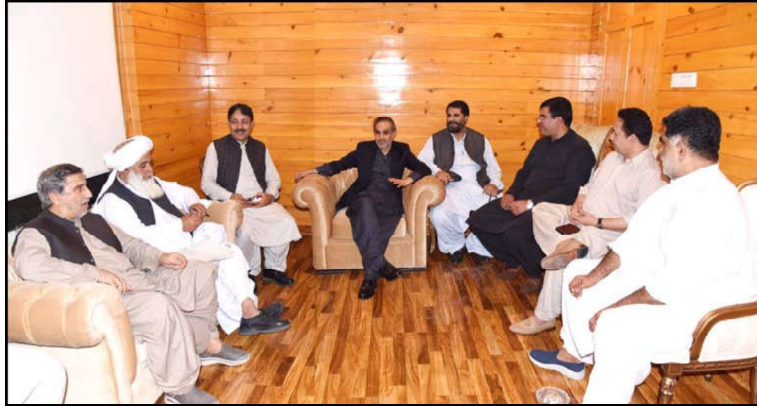
QUETTA: Balochistan Chief Minister Mir Abdul Qudus Bizenjo holding consultative meeting with Opposition MPAs regarding caretaker setup

Ph: 2841470/2841473 Vol: XVI No. 69, Muharramul Haram 01, 1445 AH Thursday July 20, 2023, Pages 08, Price Rs.15