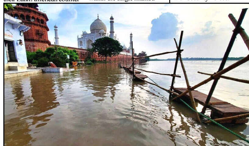
Flooded banks of river Yamuna along the Taj Mahal in Agra.

Monitoring Desk TOKYO: North Korea launched two ballistic missiles eastward early on Wednesday, Japan's and South Korea's militaries said, just hours after a U.S. ballistic missile submarine arrived in a South Korean port for the first time in four decades. The incident took place inside a sewage treatment plant established in the Himalayan state's Chamoli district as part of a flagship programme of the federal government that focuses on conserving the river Ganga. cease such launches. "We strongly condemn North Korea's successive ballistic missile launches as grave provocative acts that undermine the peace and stability of the Korean Peninsula as well as the international community, and are a clear violation of U.N. Security Council resolutions," the JCS said in a statement. The U.S. military said it was aware of the missile launches and was consulting closely with its allies and partners.