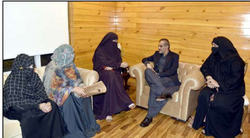
QUETTA: A delegation of women MPAs meeting with Balochistan Chief Minister Mir Abdul Qudus Bizenjo.

lowers fought against the injustice and sacrificed their lives to uphold the sanctity of truth. Dr Alvi prayed that may Allah Almighty make the new Islamic year a source of His blessings for Pakistan, the nation, Islamic community and the entire world. "May the new Islamic year bring for us the peace, prosperity and happiness and lead us towards a better future ahead," he said. Meanwhile on the advent of the new Islamic year on Wednesday, Prime Minister Shehbaz Sharif urged countrymen to strive for emulating the noble teachings of the Holy Prophet Muhammad (PBUH) and his companions besides building a society featuring principles of social justice and equality. "Let us pledge today that we will strive to emulate the noble qualities established by our Prophet Muhammad (PBUH).