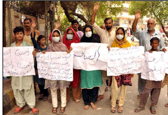
HYDERABAD: Residents of Tando Jam are holding protest demonstration against high handedness of influential people, at Hyderabad press club.

RAWALPINDI (APP): Caretaker Chief Minister Punjab Mohsin Naqvi on Wednesday directed the authorities concerned with the district administration to utilize all available resources and immediately complete the rainwater drainage operation. According to a district administration spokesman, the chief minister had issued special instructions to Rescue-1122, PDMA and the district administration directing them to ensure immediate drainage of water in low-lying areas of Rawalpindi following heavy rain on Tuesday night. The CM said that immediate actions should be taken on an emergency basis for drainage of rainwater. The officers of the administration and related institutions should remain in the field until the drainage work is completed, he ordered.