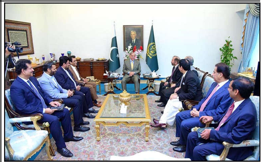
ISLAMABAD: A delegation of MQM led by the Convener Dr. Khalid Maqbool Siddiqui calls on Prime Minister Muhammad Shehbaz Sharif.

He held “Imran Khan obtained cypher from me on May 09 and later he said cypher has been misplaced when I asked him to return. Imran Khan sowed the seed of hatred among the people against national security institutions. He waved a secret letter among the people to serve personal interest despite the fact he was forbidden to do so. Cypher was given wrong color of nexus between national security institutions and US deliberately.