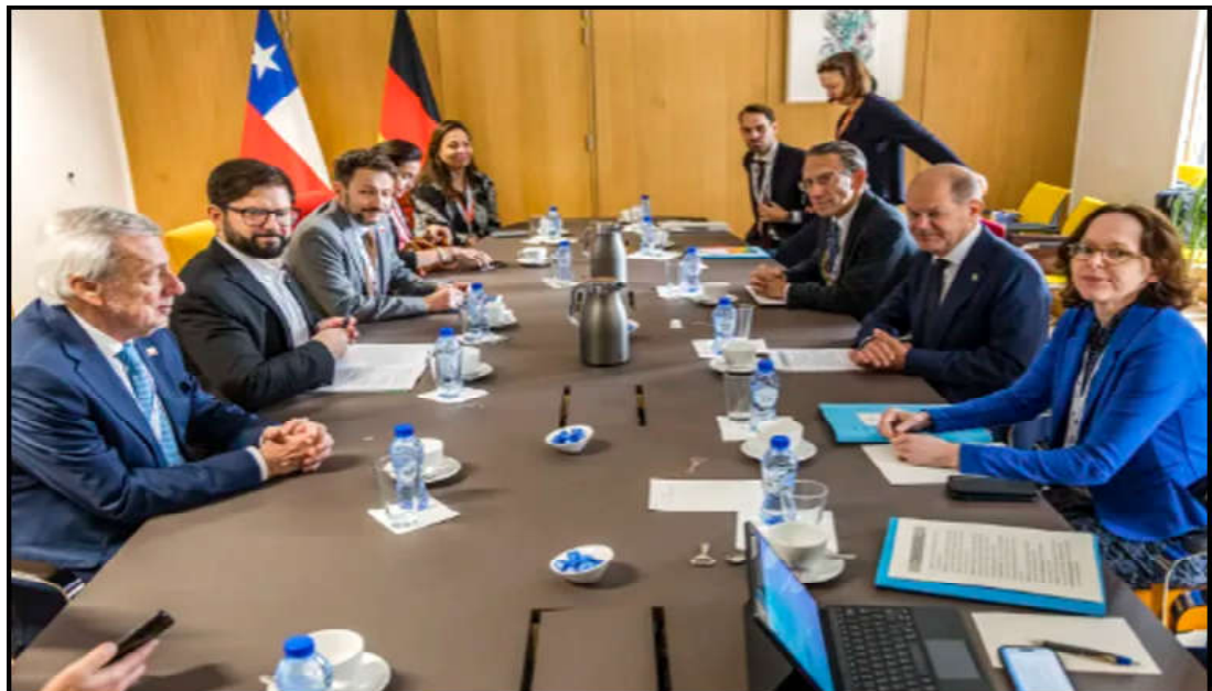
Germany's Chancellor Olaf Scholz and Chile's President Gabriel Boric sit during their bilateral meeting during the third EU-CELAC summit that brings together leaders of the EU and the Community of Latin American and Caribbean States, in Brussels, Belgium.

Tebboune visited Beijing after a state visit to Russia last month, during which he appealed to Russian President Vladimir Putin to support Algeria becoming a member of BRICS, a group of emerging markets comprising Brazil, Russia, India, China and South Africa.