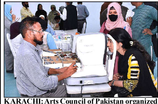
KARACHI: Arts Council of Pakistan organized "Free Medical Camp" at Haseena Moin Hall.

The Chief Secretary said that along with the prices of commodities, their supply and demand should also be closely monitored. He said that the special branch would provide support to the administration for taking action against hoarders.