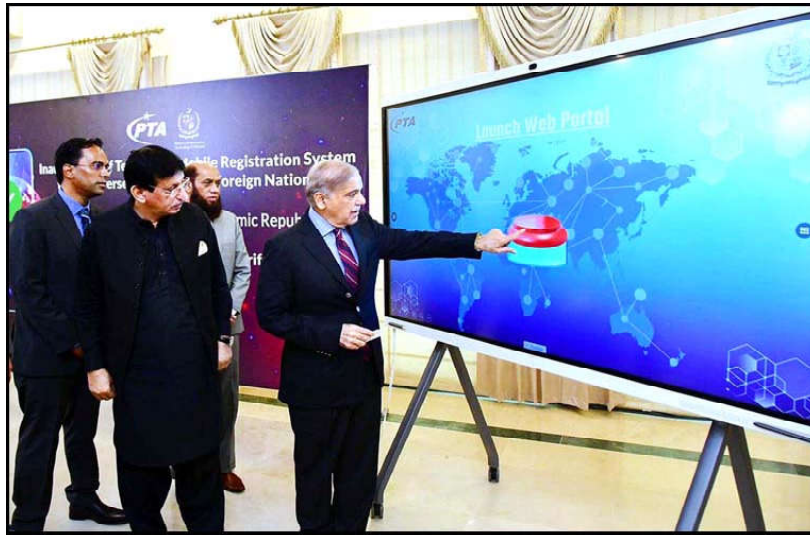
ISLAMABAD: Prime Minister Muhammad Shehbaz Sharif pushing a button to inaugurate temporary Mobile Registration System for overseas Pakistanis & Foreign Nationals.