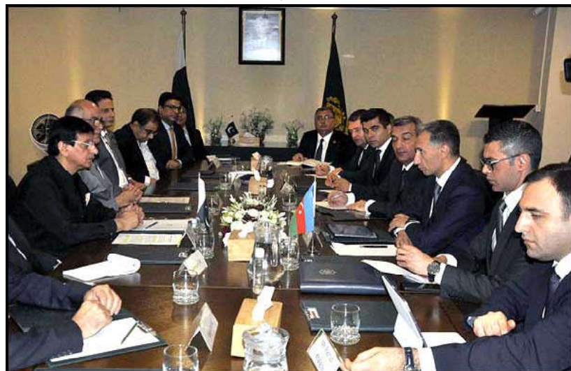
ISLAMABAD: Federal Minister for IT and Telecommunication Syed Amin Ul Haque chair a meeting along with Azerbaijan Minister for Digital Development & Transport Mr. Rashad Nabiyeu at IT Ministry.

The price of 10 grams of 24 karat gold also increased by Rs5,316 to Rs 189,472 from Rs 184,156 whereas the price of 10 grams 22 karat gold went up to Rs 173,683 from Rs 168,810, the All Sindh Sarafa Jewellers Association reported.