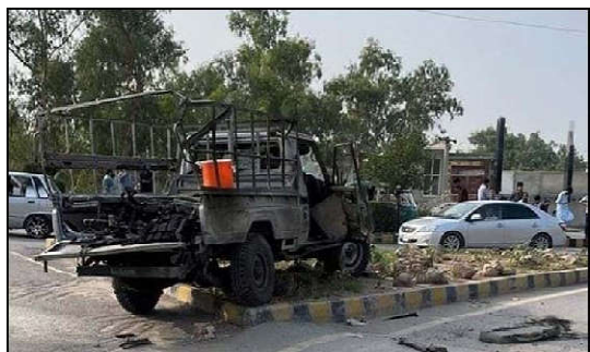
PESHAWAR: View of the site after bomb attack that targeted Frontier Corps (FC) convoy, at Hayatabad area in Peshawar.

ISLAMABAD (APP): Interior Minister Rana Sanaullah Khan and Italian Ambassador in Pakistan Andreas Ferrarese have agreed to strengthen cooperation between their countries' interior ministries, implementing better strategies and measures to prevent cross-border crimes. In a meeting, they both expressed a shared commitment to enhancing bilateral relations and fostering stronger ties. Italian Ambassador expresses sorrow and regret over the tragic Greek ship incident during the meeting. The Interior Minister describes the loss of valuable lives of Pakistanis as an extremely mournful event. The Interior Minister emphasized that there will be no tolerance for the perpetrators involved and strict actions are being taken against them. He urged European countries not to provide any shelter to those who have illegally entered.