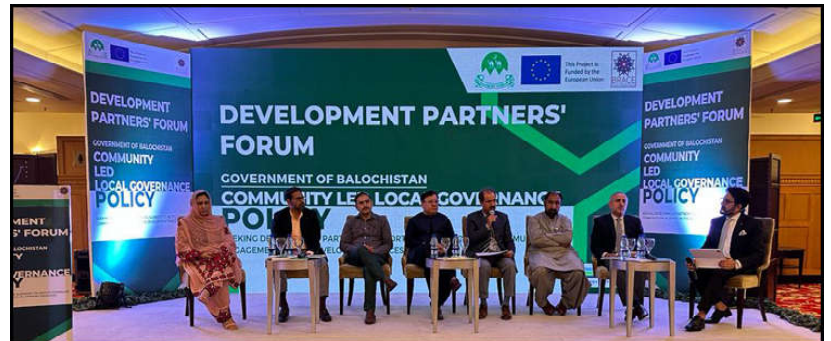
Governance (CLLG) Policy, and then developing an outline of PKR.9.2 Billion in PSDP 2023-24 where GOB

education livelihoods, community infrastructure and other sectors will gradually improve. The Secretary of Local Government & Rural Development also gave a detailed briefing to the participants regarding the CLLG policy. He said that the launch of the policy is a remarkable achievement of BRACE Technical Assistance Team. Establishing and implementing this policy is very important particularly for the development of rural areas of Balochistan. He said that the House appreciated the cooperation and role of the Local Government & Rural Development of Balochistan and its representatives and also concluded that the European Union will support the Local Government.