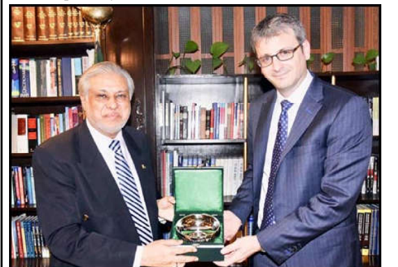
ISLAMABAD: Brent Neiman, Deputy Under Secretary of the US Department of Treasury called on Federal Minister for Finance and Revenue, Senator Muhammad Ishaq Dar at Finance Division.

To achieve the milestone, the USF had diligently laid fiber optic cables and installed 4G and 3G towers in remote and previously unreserved areas, he added.