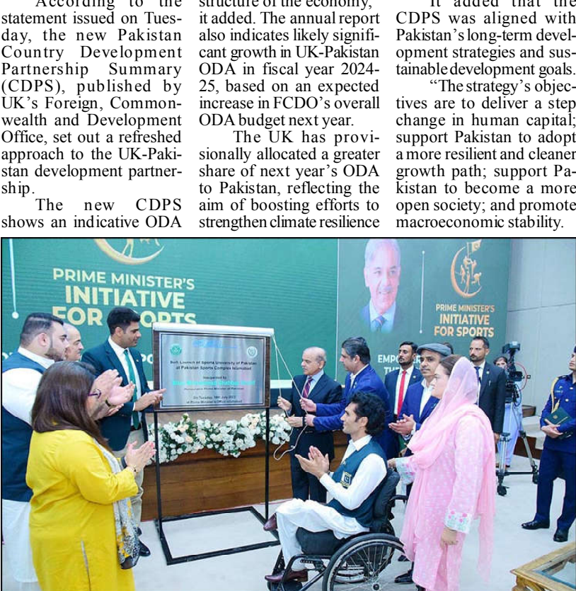
ISLAMABAD: Prime Minister Muhammad Shehbaz Sharif along with veteran sportspersons performing the soft launch of Pak first Sports University.