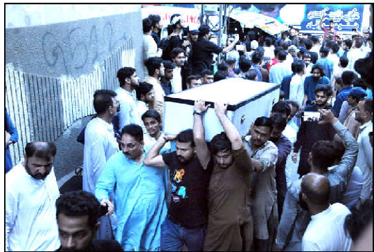
HYDERABAD: Relatives and others busy shifting the bodies of the 4 tourists to their home, who died in Gilgit due to a coach fall into a ditch.

He said Masajid, Imambargahs and Dargahs were spreading the message of harmony which was the soul.