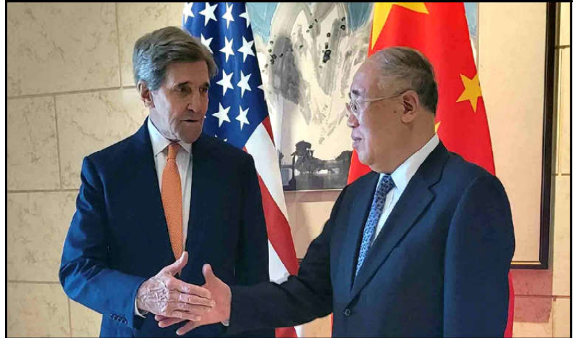
US Special Presidential Envoy for Climate John Kerry shakes hands with his Chinese counterpart Xie Zhenhua before a meeting in Beijing, China.