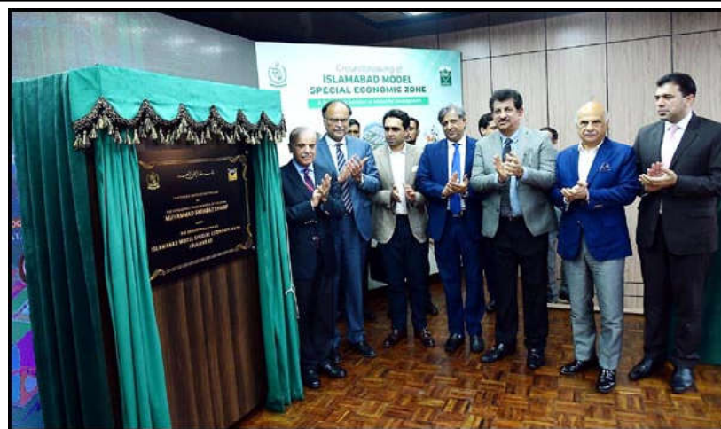
ISLAMABAD: Prime Minister Muhammad Shehbaz Sharif unveiling a plaque to mark the groundbreaking of Islamabad Model Special Economic Zone.