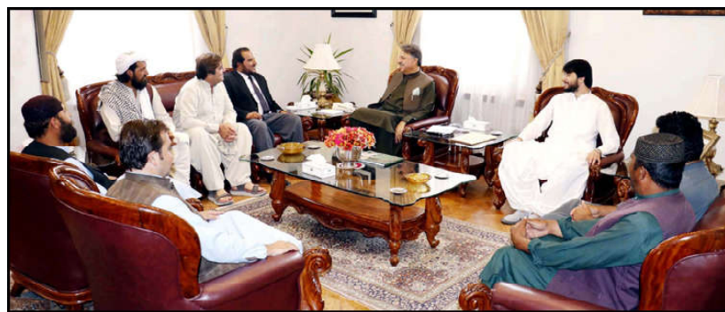
QUETTA: A delegation of Hanna Urak Sahibzada Tahir Khan Kakar meeting with Governor Balochistan Malik Abdul Wali Khan Kakar

and reduce humanitarian risks following last year's devastating floods. According to the statement, 56 per cent of the programmes under the CDPS are primarily or significantly geared towards promoting gender equality, and 26pc of the programs are primarily or significantly focused on disability inclusion. It added that the CDPS was aligned with Pakistan's long-term development strategies and sustainable development goals. "The strategy's objectives are to deliver a step change in human capital; support Pakistan to adopt a more resilient and cleaner growth path; support Pakistan to become a more open society; and promote macroeconomic stability.