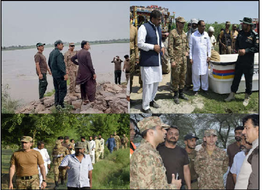
Pak Army along with Rangers and Civil Administration continue its flood relief/evacuation efforts in flood area of Bahawalnagar Chishtian and Sulmanki.

Shehbaz Sharif said Muslims were left behind in different fields of education while the West moved ahead and it was time for reflection and action in the right direction.