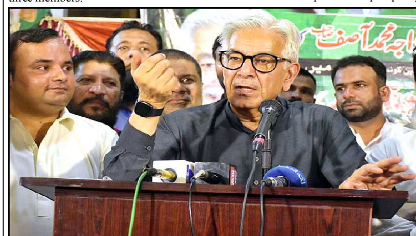
SIALKOT: Defense Minister Khawaja Muhammad Asif is addressing the workers convention of PML-N at Union Council Water Works.

Tehreek-e-Insaf (PTI) was in front of them. During the planned attacks on 9th May, the memorials of martyrs were insulted, he said, adding "we stand with our martyrs and Ghazis" and those who insulted the memorials of martyrs would be brought to justice under the law. Khawaja Asif said that during the Pakistan Muslim League-Nawaz (PML-N) government before 2018 election, the country's economy was getting stable, but then the premier Nawaz Sharif was disqualified under a conspiracy. He said that Prime Minister Muhammad Shehbaz Sharif was working very hard for the stability of the country's economy and he hoped that they would soon be able to put the country on road to development and prosperity.