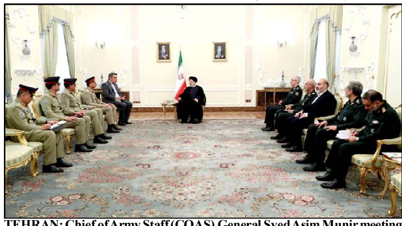
TEHRAN: Chief of Army Staff (COAS) General Syed Asim Munir meeting with President of the Islamic Republic of Iran, Ebrahim Raisi

preciated the organizers for holding the conference on vital topic of Azmat-e-Qura'an and Istehkam-e-Pakistan, which he added, speaks high about their deep affiliation with Islam and patriotism. He said that the only solution to our sufferings is that we must understand Holy Qura'an and follow its teachings. He said that the objective behind holding conference also invites us to make ourselves accountable instead of merely expressing happiness on it. In the end, the Governor prayed that may Allah Almighty create unity among our ranks in the country and province besides serving them.