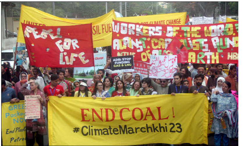
KARACHI: Participants hold banners during Climate March at Frere Hall in Provincial Capital.

"But, we are now really looking forward to developing our agriculture sector based on new technologies.