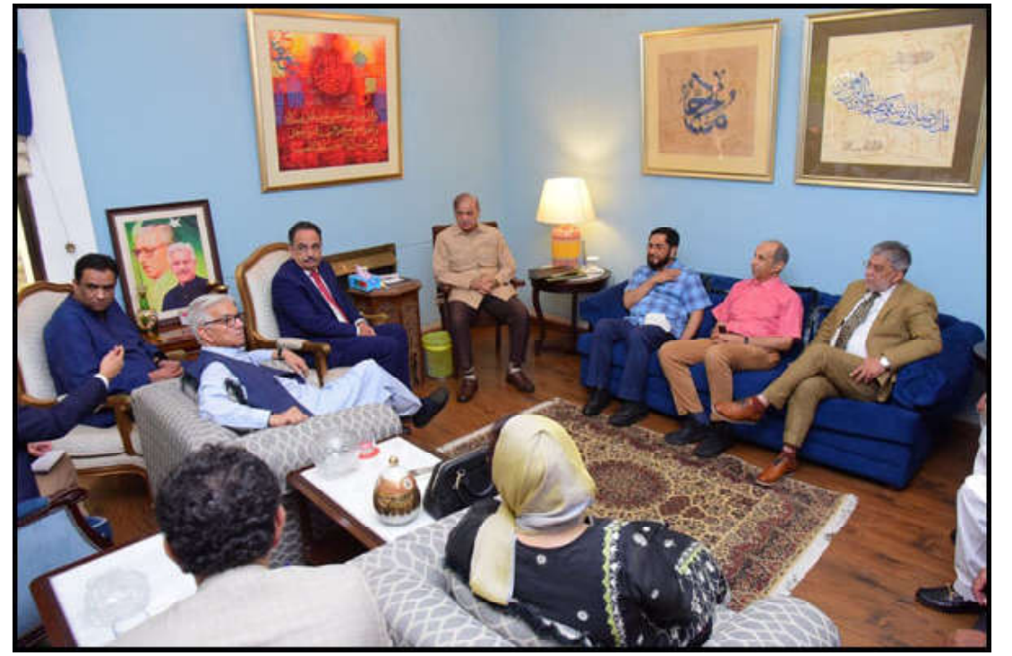
A delegation of Sialkot Chamber of Commerce called on Prime Minister Muhammad Shehbaz Sharif in Sialkot. Minister of Defence, Khawaja Muhammad Asif was also present.