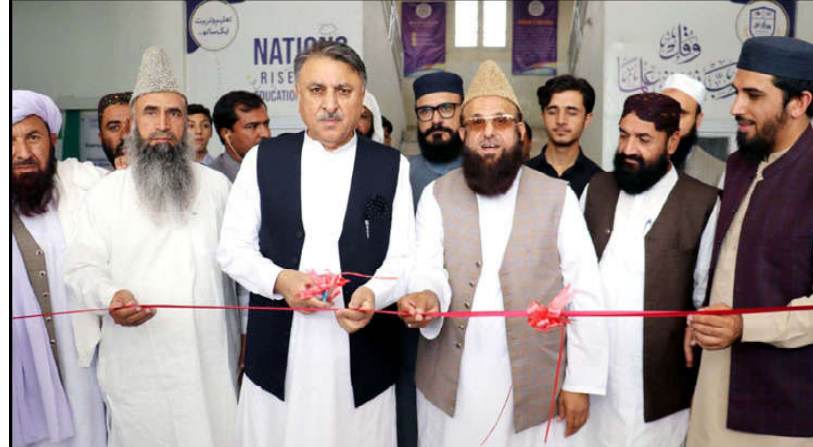
QUETTA: Governor Balochistan Malik Abdul Wali Khan Kakar inaugurating Science & Computer Lab at Darain Educational System School & College Quetta

Therefore, the notice stated, Khattak's basic membership of Pakistan Tehreek-e-Insaf (PTI) has been terminated.