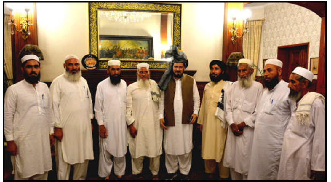
PESHAWAR: Khyber Pakhtunkhwa Governor Haji Ghulam Ali in a group photo with delegation of public representatives of District Mohmand.

said that PTI's chief politics was irrelevant now and PTI has been shattered in groups due to the negative politics of Niazi. He said Prime Minister Muhammad Shehbaz Sharif had brought the country back on track of development and if voted to power would change the destiny of people. Amir Muqam said that former Prime Minister Muhammad Nawaz Sharif had restored peace, abolished load shedding and made defence of Pakistan impregnable.