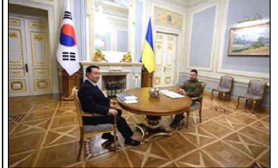
Ukraine's President Volodymyr Zelenskyy and South Korean President Yoon Suk Yeol attend a meeting, amid Russia's attack on Ukraine, in Kyiv, Ukraine.

Monitoring Desk NEW DELHI: India has signed an agreement with the United Arab Emirates that will allow it to settle trade in rupees instead of dollars, boosting India's efforts to cut transaction costs by eliminating dollar conversions. During a visit by India's Prime Minister Narendra Modi to the UAE on Saturday, the two countries also agreed to set up a real-time payment link to facilitate easier cross-border money transfers. The two agreements will enable "seamless cross-border transactions and payments, and foster greater economic cooperation", said a statement from the Reserve Bank of India on Saturday. India, the world's third biggest oil importer and consumer and whose central bank last year announced a framework for settling global trade in rupees, currently pays for UAE oil in dollars. Bilateral trade between the two countries was $84.5 billion in the year from April 2022 to March 2023. An official with knowledge of the details of the agreement said India could make its first rupee payment for UAE oil to Abu Dhabi National Oil Co (ADNOC). Reuters reported on Friday.