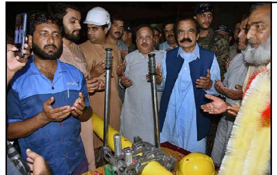
FAISALABAD: Interior Minister Rana Sana Ullah Khan offering 'dua' after inaugurating sui gas supply at Chak No. 4 JB Ram Diwali.