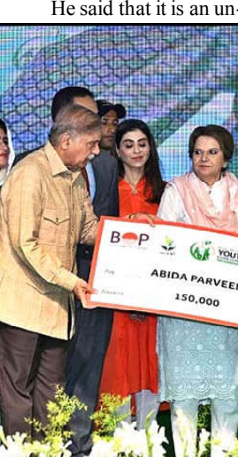
LAHORE: Prime Minister Muhammad Shehbaz Sharif distributing cheques among the recipients of Prime Minister's Youth Business and Agriculture Loan Scheme.

nancial issues being confronted by the province and mentioned that the matter of arrears of the province against Pakistan Petroleum Limited (PPL) is also yet to be resolved. He said that it is an un-