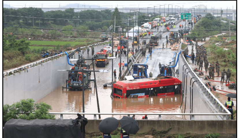
South Korean rescue workers search for missing persons near a bus along a deluged road leading to an underground tunnel where some 15 cars were trapped in flood waters after heavy rains in Cheongju.

Monitoring Desk NEW YORK: Nearly a month after the sinking of an overloaded boat off the Greek coast where 700 people, including Pakistanis, were killed, a prominent global humanitarian body has called on the European Union (EU) to ensure a "full, transparent" investigation into the tragedy. "So far, there have been no moves to launch such an investigation into the shipwreck — one of the deadliest on record in the Mediterranean Sea.