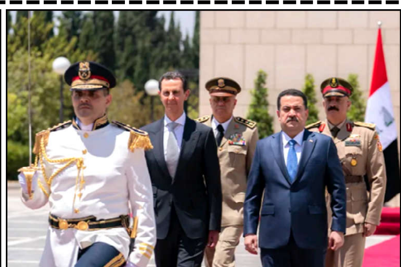
Syrian President Bashar Assad and Iraq's Prime Minister Mohammed Shia al-Sudani review a military honour guard during a welcome ceremony in Damascus, Syria.

the battlefield. They are banned by numerous countries — notably in Europe — that are signatories to a 2008 Oslo Convention, to which neither Russia, the United States nor Ukraine are parties. Humanitarian groups have strongly condemned the US decision to supply cluster munitions to Ukraine. US President Joe Biden said the decision was "very difficult" but stressed Ukraine needed extra ammunition to refill its depleted stocks.