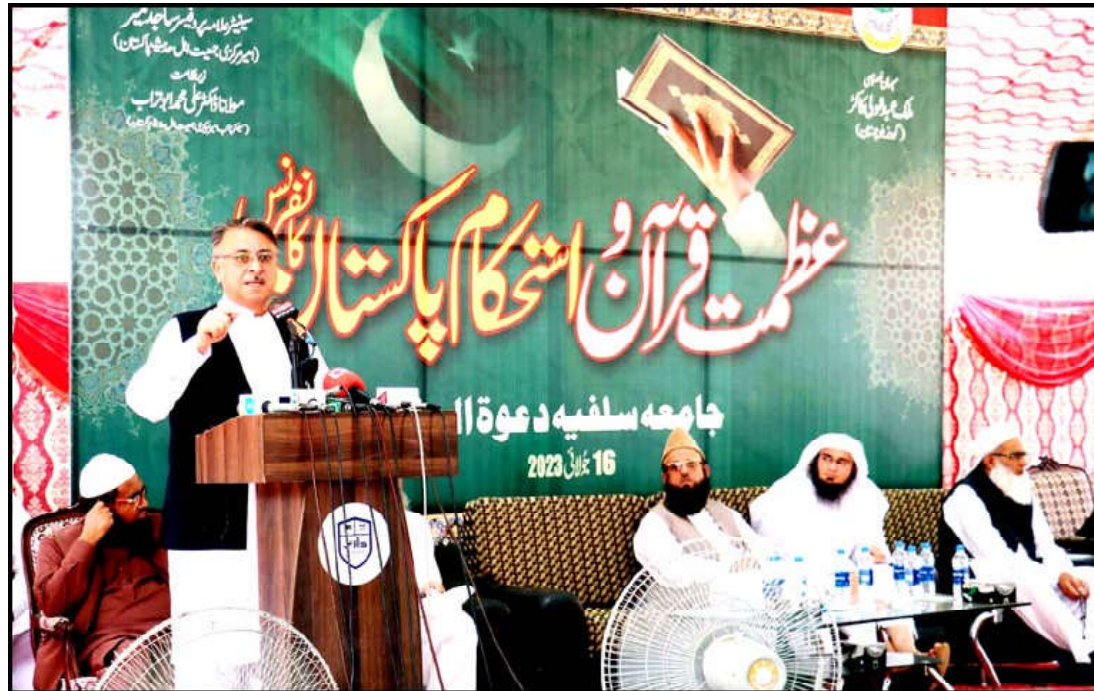
QUETTA: Governor Balochistan Malik Abdul Wali Khan Kakar addressing Azmat-e-Quran and Istehkam-e-Pakistan Conference organized by Markazi Jamiat Ahle Hadith Balochistan

Ph: 2841470/2841473 Vol: XVI No. 66, Zil Hajj 28, 1444 AH Monday July 17, 2023, Pages 08, Price Rs.15