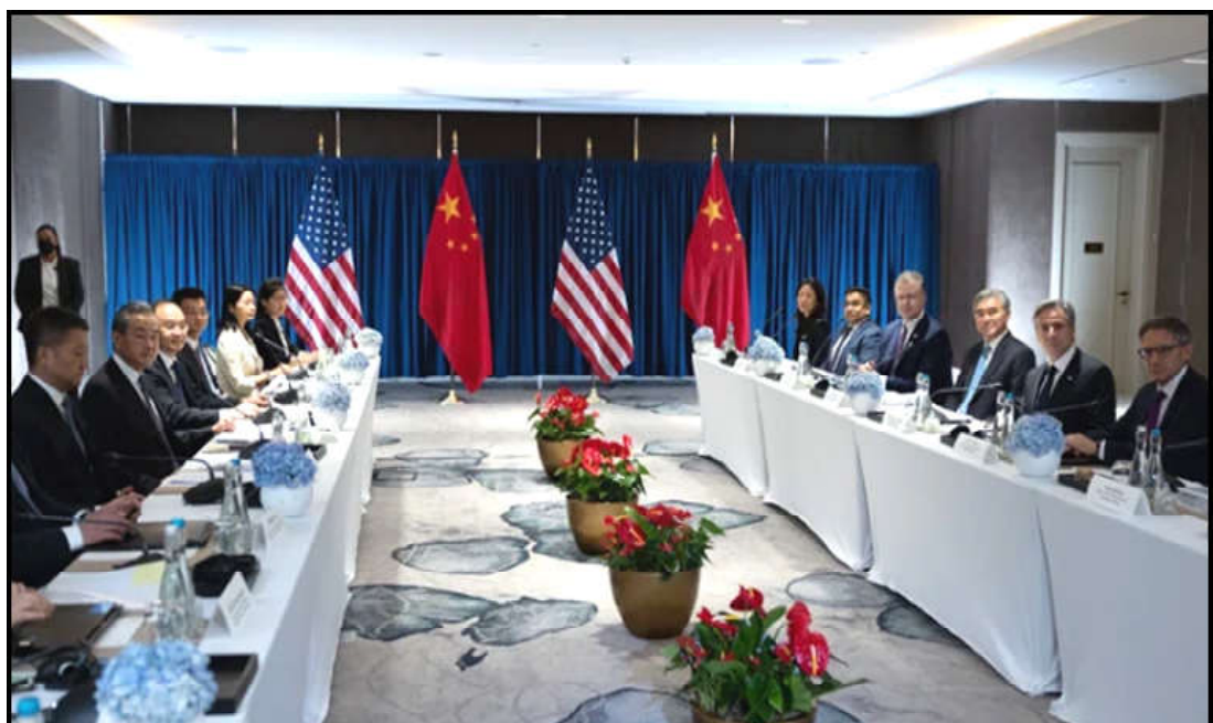
US Secretary of State Antony Blinken sits at a table with advisors across from Director of the CCP Central Foreign Affairs Office Wang Yi and his advisors.

attend such meetings, is ill, according to China's foreign ministry. Blinken told Wang to convey his "best wishes" to Qin, another US official said. Incidents have repeatedly impacted efforts to repair US-China relations, with Blinken scrapping his first planned trip to Beijing in February after Washington said it detected a Chinese espionage balloon over the US mainland. Blinken eventually visited in mid-June, becoming the first US secretary of state in China in nearly five years, opening a flurry of diplomacy since then.