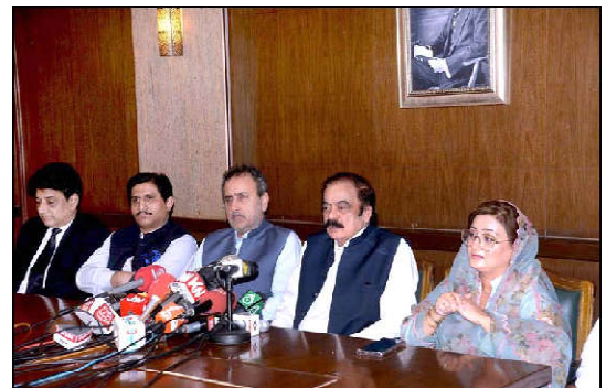
LAHORE: Federal Interior Minister Rana Sanaullah is addressing a press conference

the Khyber Pakhtunkhwa (KP) Board of Revenue, augmenting its capacity for accurate land measurements, said a communique. Following the recent International Monetary Fund's (IMF) approval of a programme for Pakistan's support, the US has been welcoming towards the agreement between the country and the money-lending institution.