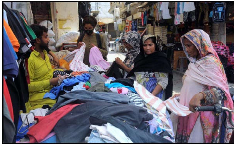
MULTAN: Female customers selecting and purchasing old clothes displayed by the roadside vendor to attract the customers.