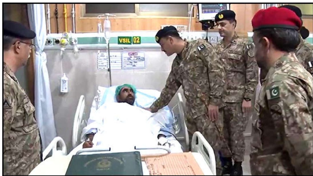
QUETTA: Chief of the Army Staff, General Syed Asim Munir enquiring about health of soldier injured in Zhub Garrison attack at CMH Quetta

Ph: 2841470/2841473 Vol: XVI No. 65, Zil Hajj 26, 1444 AH Saturday July 15, 2023, Pages 08, Price Rs.15