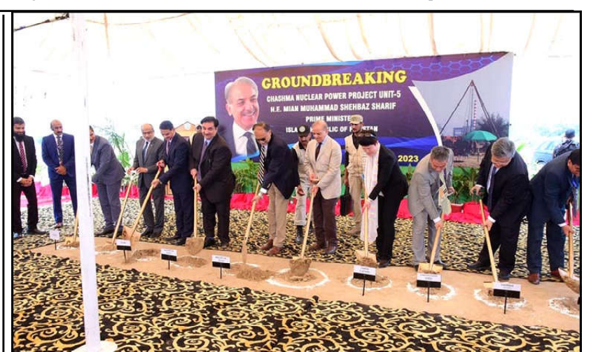
MIANWALI: Prime Minister Muhammad Shehbaz Sharif, Federal Ministers, dignitaries from China and PAEC officials performing the ground breaking of the 5th Unit of Chashma Nuclear Power plant (C-5) in Chashma.

On June 30, 2023 the prime minister had witnessed the signing of Memorandum of Understanding (MoU) on the C-5 project between China National Nuclear Corporation Overseas Ltd (CNOS) and Pakistan Atomic Energy Commission (PAEC). Addressing the ground breaking ceremony, the prime minister said keeping in mind the country's requirements of clean and cheap energy sources, the project should be completed before the given schedule. Terming it a huge milestone and a symbol of co-operation between the two great friends China and Pakistan, Shehbaz Sharif said the project would help the country promoting clean, efficient and comparatively cheaper energy. He said after a pause of many years, the China Pakistan Economic Corridor (CPEC) was going again in full swing. He gave the credit of concluding the agreement of C-5 to the coalition government and the SPD for their hard efforts. "Our detractors had been fabricating rumours all around that Pakistan was going to default on its sovereign commitments but we crossed all turbulent waters in just 15 months," he added.