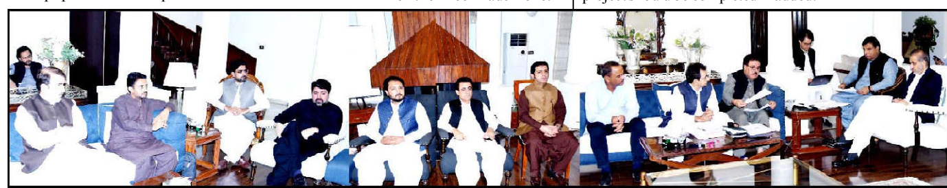
QUETTA: Balochistan Chief Minister Mir Abdul Qudus Bizenjo presiding over a high level meeting held to review the matters and issues of Gwadar