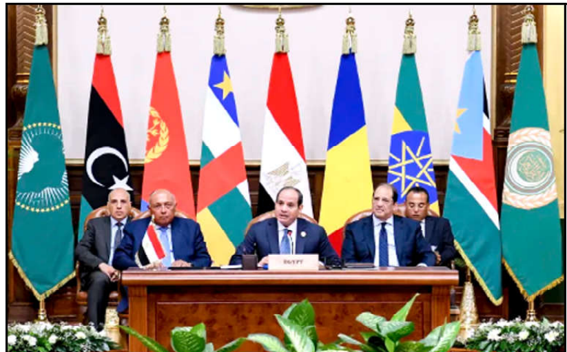
Egyptian President Abdel-Fattah el-Sissi speaks during the summit on the Sudan conflict, at the Presidential Palace in Cairo, Egypt.