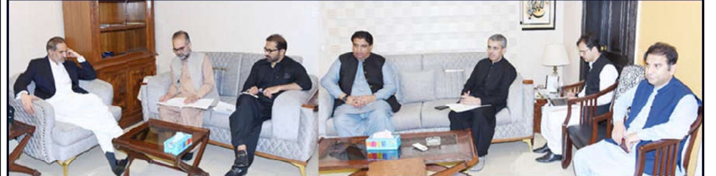
QUETTA: Balochistan Chief Minister Mir Abdul Quddus Bizenjo presiding over a meeting to review budget and financial affairs.

Moreover, efforts are also being made to provide facilitation to the women approaching the police, the IGP added.