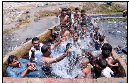
LARKANA: People along with children enjoying bathing in the watercourse to get some relief from hot weather in Ghulam Bhutto Village.