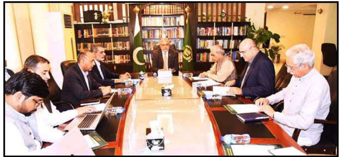
ISLAMABAD: Federal Minister for Finance and Revenue Senator Mohammad Ishaq Dar chaired a meeting on the establishment of Pakistan Sovereign Wealth Fund, at Finance Division.

development and long-term business partnerships between Pakistan and China. He said that Pakistan was establishing many special economic zones under CPEC and it was a good opportunity for Chinese companies to transfer technology to Pakistan and set up joint ventures in areas of interest. He said that ICCI is working on a new industrial estate in the region.