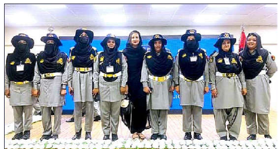
QUETTA: Police personnel pose for group photo in new uniform of the traffic police.

At the end of the seminar, a symbolic walk was also organized.