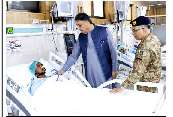
QUETTA: Governor Balochistan Malik Abdul Wali Khan Kakar enquiring about health of personnel injured in Zhub Garrison attack at CMH Quetta

QUETTA (INP): The Deputy Collector Headquarters of Balochistan Customs House has written a letter to the officers, instructing them to enhance the security measures in their respective offices. The letter emphasizes the need to tighten security at customs field offices and strictly regulate access. It states that private individuals should not be permitted to enter the offices without proper verification.