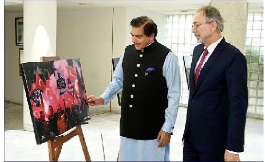
ISLAMABAD: Speaker National Assembly Raja Pervaiz Ashraf witnessing Türkiye Art Exhibition displayed on the occasion of Turkish Democracy and National Unity Day.