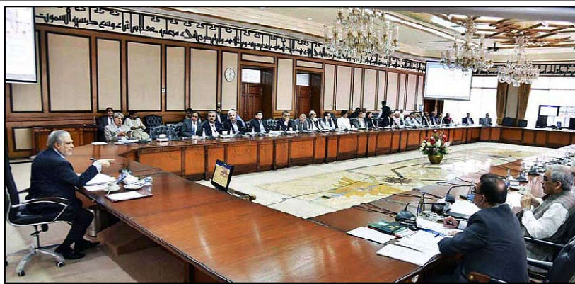
ISLAMABAD: Federal Minister for Finance and Revenue Senator Mohammad Ishaq Dar chaired the meeting of the Executive Committee of the National Economic Council (ECNEC).