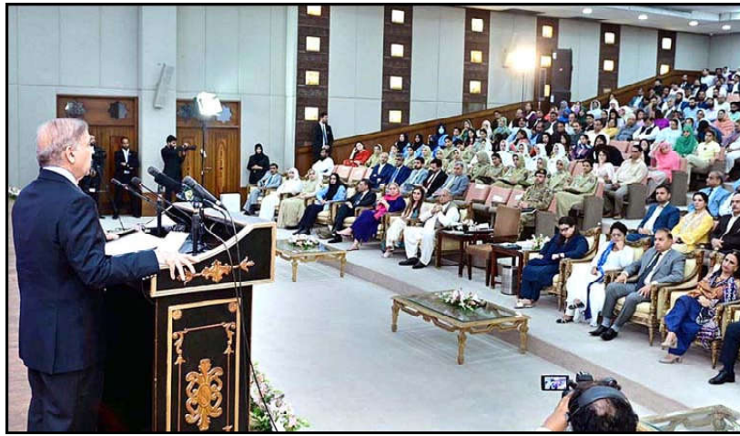
ISLAMABAD: Prime Minister Muhammad Shehbaz Sharif addresses the ceremony of Prime Minister's Initiatives on Women's Empowerment.

During one to one meeting with Chairman NDRC, Mr Zheng Shanjie, the Planning Minister conveyed felicitations of Prime Minister Shehbaz Sharif to Chairman Zheng on assuming his new role and assured him of full support in smooth implementation of CPEC projects.