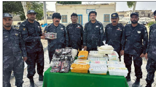
GWADAR: Customs Authority shows seized drugs to media at Panni Customs House in City.