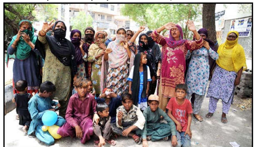
HYDERABAD: Women and children belong to Oadh tribe hold a protest against demolishing their makeshifts during an anti-encroachment drive on Autobahn road.