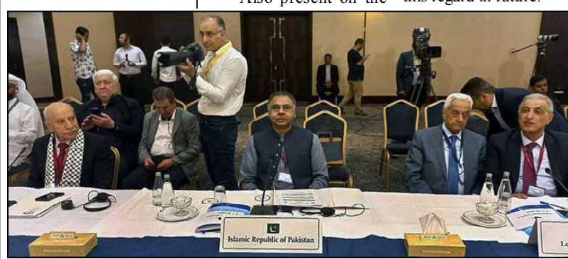
TEHRAN: Pakistan Delegation led by Senator Saifullah Abro is attending Asian Parliamentary Assembly (APA) standing committee on Budget and Planning.