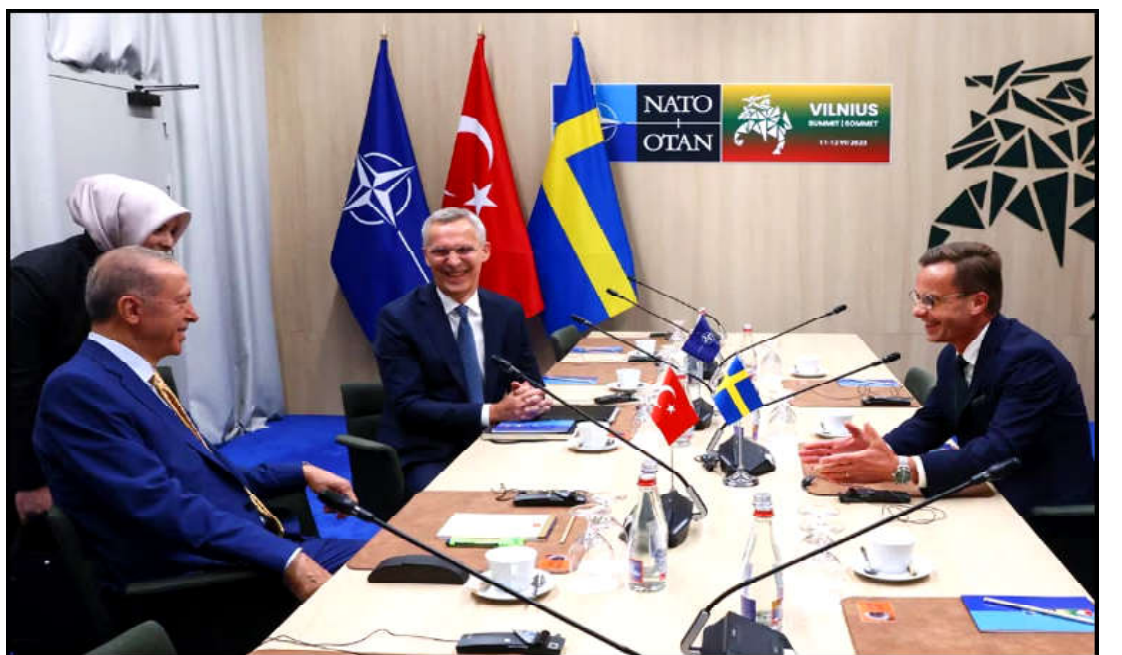
NATO Secretary-General Jens Stoltenberg, Turkish President Tayyip Erdogan and Swedish Prime Minister Ulf Kristersson react during a meeting, on the eve of a NATO summit, in Vilnius, Lithuania.

Stockholm has been working to join the bloc at the alliance's summit in the Lithuanian capital Vilnius, which begins on Tuesday. "I'm glad to announce... that President Erdogan has agreed to forward the accession protocol for Sweden to the grand national assembly as soon as possible, and work closely with the assembly to ensure ratification," NATO Secretary General Jens Stoltenberg told a news conference, describing it as a "historic" step. He had convened Erdogan and Swedish Prime Minister Ulf Kristersson for several hours of talks on the eve of the summit as he sought to finally break the deadlock.