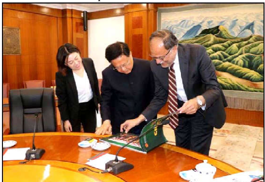
BEIJING: Federal Minister for Planning, Development and Special Initiatives, Prof. Ahsan Iqbal met with Mr. Zheng Shanjie, Chairman, National Development and Reform Commission (NDRC). They reviewed progress on ongoing CPEC projects and exchanged views on its future direction in line with the important consensus between the leadership of the two brotherly countries.

She said he created hype of the so-called conspiracy, based on the cipher, and blamed the former army chief for that at first place and eventually shifted its to acting Punjab Chief Minister Mohsin Naqvi.