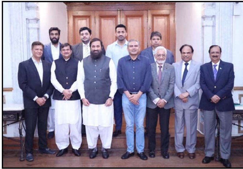
LAHORE: Punjab Governor Muhammad Baligh ur Rehman in a group photo with Caretaker Chief Minister Punjab Mohsin Naqvi along with his cabinet members after meeting.

Shehbaz Sharif said that the laptops scheme was launched for all the talented students of the country including KP that was being distributed strictly on merit. No favoritism or nepotism would be tolerated in its distribution, he added. The prime minister said that 100,000 laptops would be distributed among students in the country this year. A total of one million laptops were distributed so far among students under the PM scheme in the country.