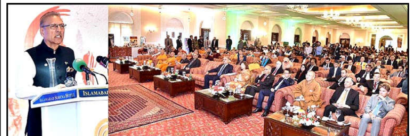
ISLAMABAD: President Dr. Arif Alvi addressing the International Gandhara Symposium 2023.

We have to bring revolution in agriculture and national industries, he stated.