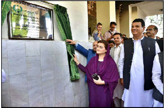
PESHAWAR: Federal Minister for Information and Broadcasting Ms. Marriyum Aurangzeb inaugurating Rehabilitation of Radio Pakistan Peshawar building after the incident of 9th May.

Armed with the crutches of disabled inmates, more than 15 prisoners overwhelmed the on-duty officers, managed to snatch an official Kalashnikov from a sentry posted at the main gate, and opened fire. In the ensuing chaos, one police officer was injured and has since been hospitalized. The prisoners then shot open the main gate's lock, enabling their escape. The group of escapees included more than 12 prisoners.