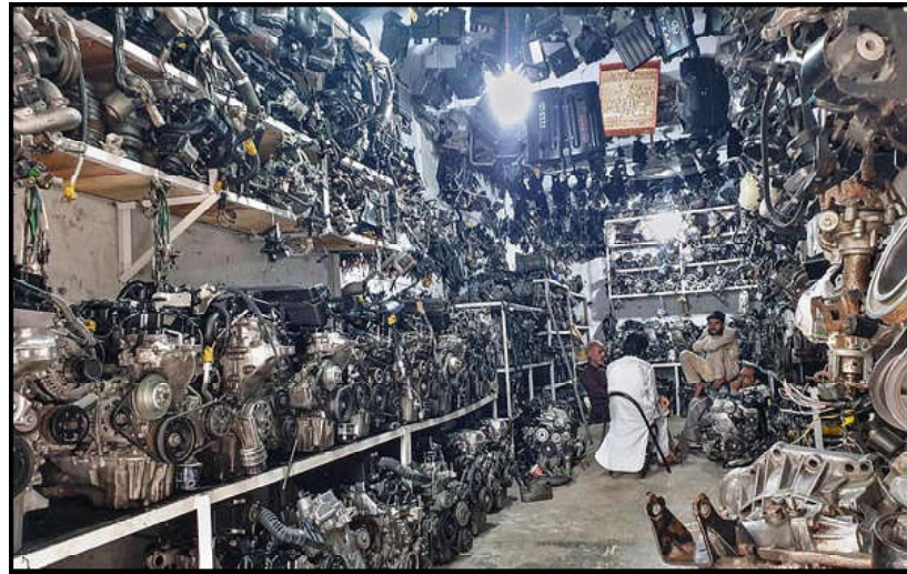
RAWALPINDI: Vendors displaying old vehicles' engines to attract the customers in shop at Chah Sultan.