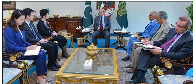
ISLAMABAD: 11 - Pang Chunxue, The Charge D' Affaires of the Chinese Embassy in Pakistan calls on Prime Minister Muhammad Shehbaz Sharif.