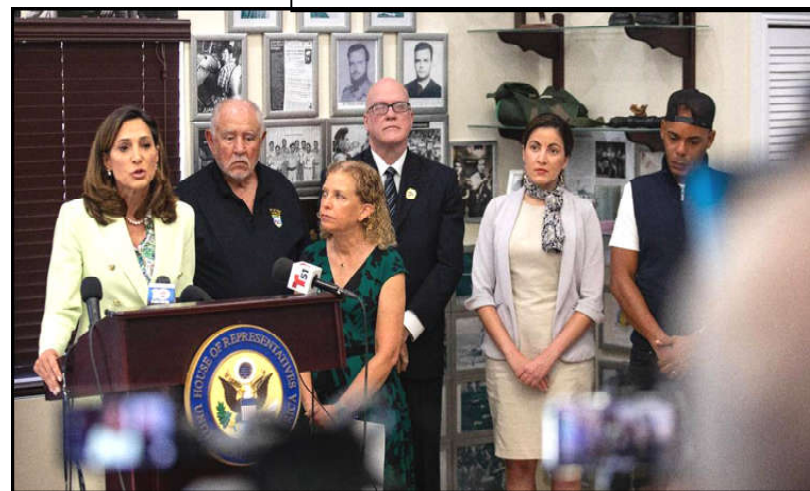
Rep. Maria Elvira Salazar speaks during a press conference after the roundtable discussion between elected officials and Cuban activists about political prisoners at the Assault Brigade 2506 Museum.