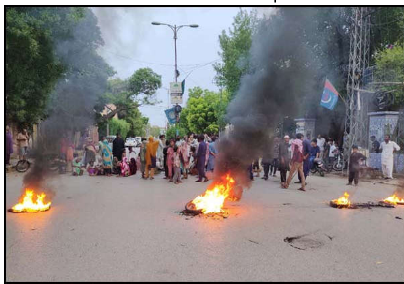
HYDERABAD: Residents of Radio Pakistan area are blocked road and burn tires as they are holding protest demonstration against prolong electricity load shedding in their area, in Hyderabad

SIALKOT (APP): Deputy Commissioner Sialkot Adnan Mehmood Awan on Sunday said that there was low level flood in River Chenab with 1,14,000 upstream and 98,430 downstream flood water at Head Marala-Sialkot. According to handout issued here, the water level recorded 1,14,000 cusecs upstream in River Chenab at Head Marala-Sialkot while the downstream flood water was 98,430 cusecs in River Chenab near Head Marala.