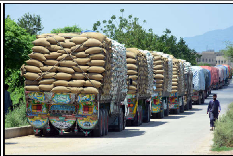
ISLAMABAD: A view of the trucks parked outside Floor mills at Sector I-II as waiting for laborers to unload them, in Federal Capital.

"China stands ready to work with Pakistan to build on the past achievements and follow the guidance of the important common understandings between the leaders of the two countries on promoting high-quality development of CPEC to boost the development of China and Pakistan and the region and bring more benefits to the people of all countries," the official said.