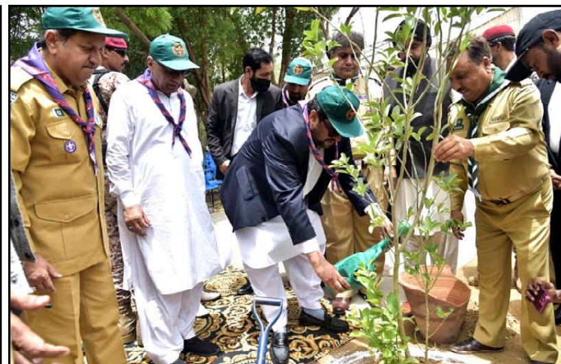
KARACHI: Governor Sindh, Kamran Tessori planting a sapling during the inauguration of Tree Plantation Drive held in Karachi.