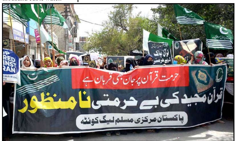
QUETTA: Activists of the Pakistan Muslim League Women's Wing hold a protest against the desecration of the Quran in Sweden in front of the press club.

ISLAMABAD (APP): At least five people were killed and many others received critical injuries when a three-storey building collapsed suddenly due to a powerful LPG cylinder blast in Jhelum on Sunday. Administration issued alerts. According to flood control room water flow in Chenab river was 60,000 cubic feet on Saturday morning and continues rise in water flow threatens high level flooding. Gujranwala district administration declared 20 villages sensitive. Beraj administration said Marala Barrage Sialkot have the capacity of 11 thousand cubic water. Rescuers arrived at the site and cordoned off the area. An emergency has been declared in the District Headquarters Hospital (DHQ) Jhelum. Dust was seen rising from the rubble of the collapsed building in the surrounding streets for a long time. Meanwhile Prime Minister Shehbaz Sharif has expressed deep grief and sorrow over the incident of building collapse in Jhelum that resulted in death of five persons. In a statement issued on Sunday, the Prime Minister commiserated with the bereaved families and prayed for eternal peace of the deceased.