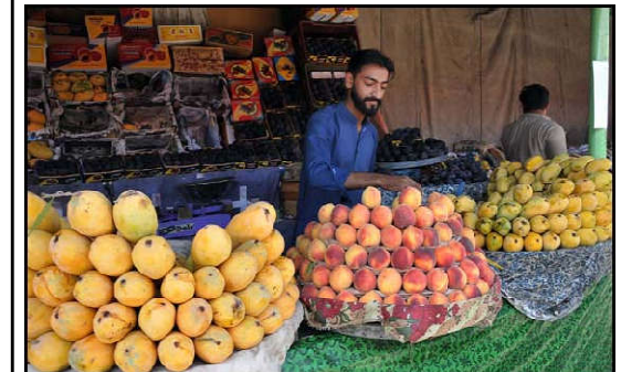
ISLAMABAD: A vendor selling fruits on his stall at weekly Sunday bazaar Peshawar Morr in Federal Capital.

Pindi Shaikh Musa district Faisalabad said these factors affected productivity and contributed to food insecurity, said a press release. He said food insecurity continues to be a significant issue in many parts of South Asia. While on the other hand, the region has made progress in recent years in reducing poverty and improving overall food security, several factors contribute to the persistent challenges faced by many countries including Pakistan, he added.