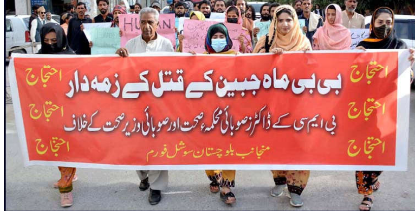
QUETTA: Activists of Balochistan National Social Forum hold a protest rally in favour of their demands.

that with PTI, there has always been strong consensus on taking CPEC forward, and under Imran Khan's leadership they successfully implemented the important projects, deepening Pakistan's commitment to CPEC under the PTI government. Faisalabad Rashakai Industrial zones were made operational during PTI government and the Dhabaji Industrial zone was finalised, which was under construction, he revealed.