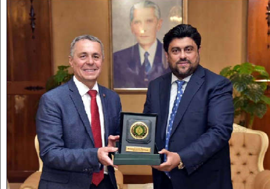
KARACHI: Governor Sindh, Kamran Iessori presenting shield to Ignazio Cassis, Swiss Foreign Minister during meeting held at Governor House in Karachi.

quality public transport system to Quetta. The inauguration ceremony would be graced by a member of the general public who actively utilizes public transportation. In his tweet, the Chief Minister described the launch of Green Bus Service as a great news for the citizens of Quetta especially students. Moreover, he said that the elderly women, children and students would benefit from the facility. He mentioned that the Green Bus Service project was delayed for long time. However, by the grace of Allah, it is going to be functional, he added.