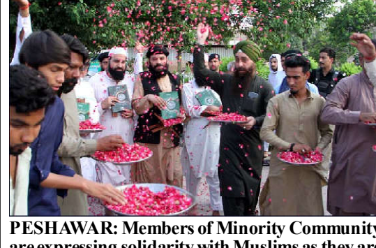
PESHAWAR: Members of Minority Community are expressing solidarity with Muslims as they are holding protest demonstration against desecration of Holy Quran in Sweden, at Gor Kathri Park in Peshawar.

Ramesh Kumar Vankani and Minister for Religious Affairs and Interfaith Harmony Senator Talha Mehmood will also address its different sessions, besides keynote by different foreign and local dignitaries, said a press release issued here Sunday. The delegates will also call on President Dr Arif Alvi. The symposium is jointly organized by PM's Task Force on Gandhara Tourism, the Ministry of Religious Affairs and Interfaith Harmony, Pakistan Tourism Development Corporation (PTDC), the National Heritage and Culture Division and Archeology Departments of Punjab and Khyber Pakhtunkhwa.