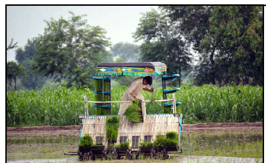
FAISALABAD: Farmer using modern agriculture machine for seedling of rice crop in his field.