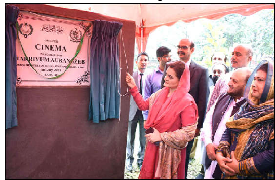
LAHORE: Federal Minister for Information and Broadcasting, Ms. Marriyum Aurangzeb Inaugurating the foundation stone for the construction of cinema building of projects at Radio Pakistan Station building.

She said that through using platforms like Pakistan Television, Radio Pakistan, Lok Virsa and Pakistan National Council of Arts, the people especially, the youth could be connected with the country's heritage. She said that infotainment and entertainment were highly required for people especially the younger generation because during the last four years, hatred and intolerance had been promoted in the country. Marriyum said that it was a high time when people and especially youngsters should be provided an alternative through which they could engage themselves in positive activities. She said that in 2017 and 2018, a foundation of the country's first culture policy and film policy was laid, adding that implementation of the policy was started in the 2018 budget which was given by PML-N government.