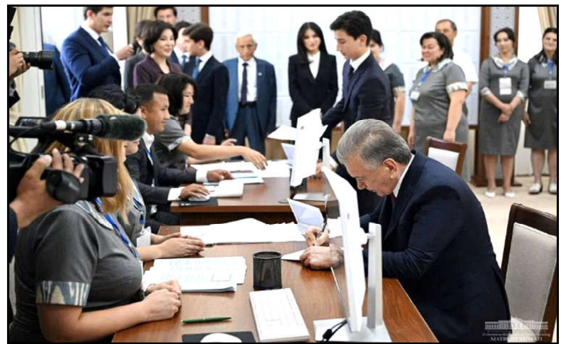
Uzbekistan's President Shavkat Mirziyoyev votes during an early presidential election in Tashkent, Uzbekistan.

industrial or other policies that Washington and other governments say violate Beijing's free-trade commitments. On Saturday, he said Washington should "adopt a rational and pragmatic attitude" to improve relations. On Sunday, Yellen announced no agreements on major disputes or plans for future activity but said her department and Chinese officials would have "more frequent and regular" communication. U.S.-China political strains are adding to uncertainty that is dampening the willingness of consumers and businesses to spend and invest.