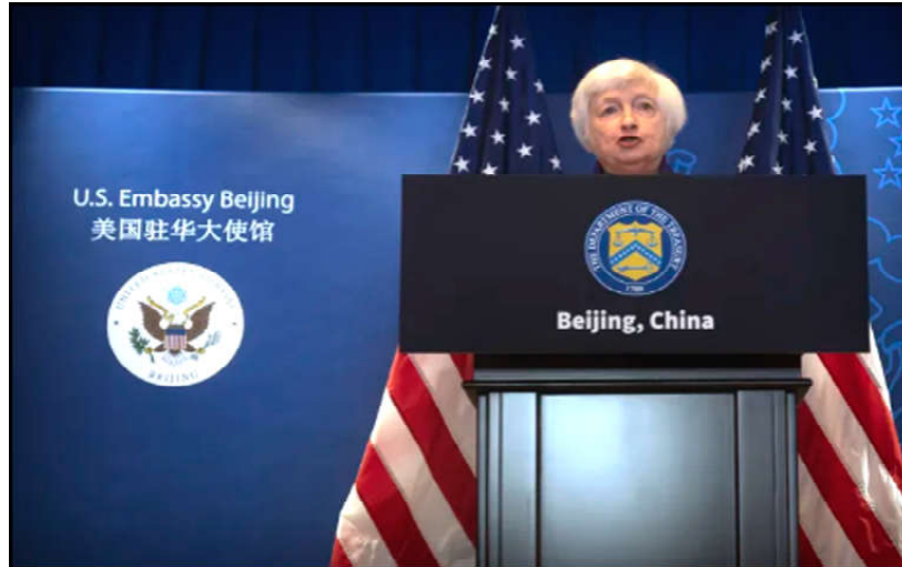
Treasury Secretary Janet Yellen speaks during a press conference at the U.S. Embassy in Beijing, China.