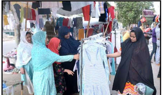
KARACHI: Women busy in selecting and purchasing used clothes from a roadside vendor.

Guddu-Shikarpur Transmission Line project had been completed with total contract cost of USD $ 13.108 million, and this transformative project addresses operational problems and system bottlenecks that plagued the previous transmission line, he claimed. This vital project would strengthen the connection between Guddu and Shikarpur, resulting in improved stability and reliability of the power transmission network.