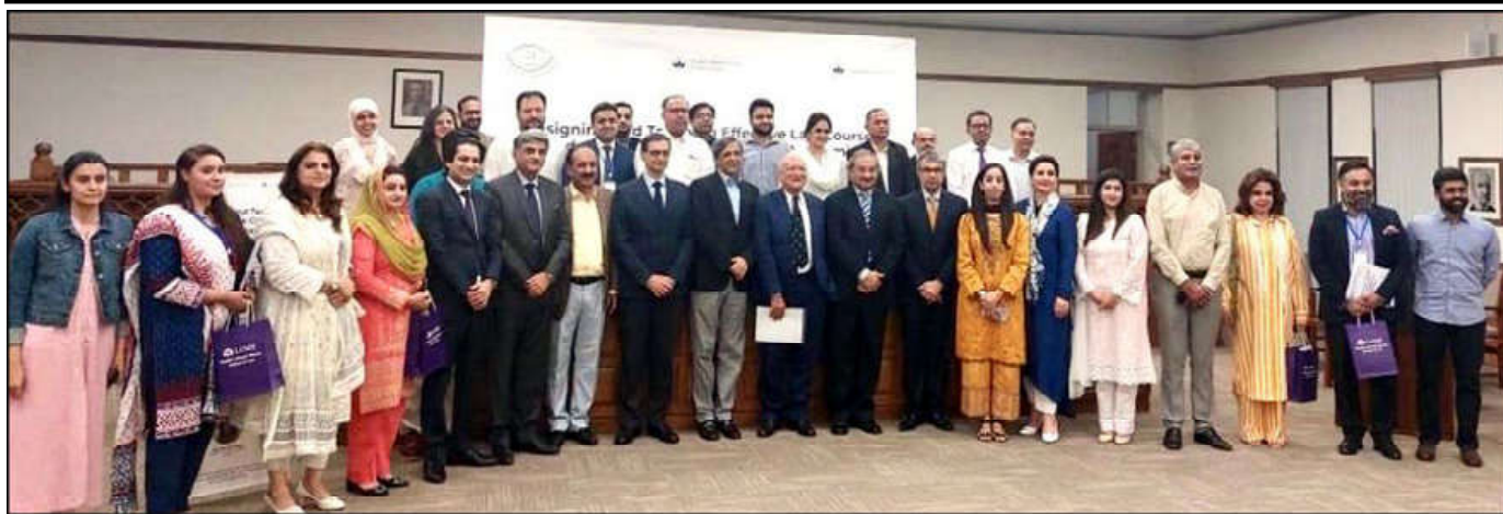
Federal Minister for Law & Justice Senator Azam Nazir Tarrar attended the closing ceremony of first ever 3 day teacher training workshop for law faculty members "Designing and Teaching Effective Law Courses for Legal Academics" as a Chief Guest.