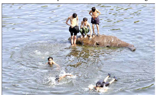
ISLAMABAD: Youngsters swimming to get some relief from hot weather at Rawal Lake spill way stream.

The NUMS admission test will be considered at par with the national MDCAT to be applicable only for admission in all armed forces-administered medical and dental colleges.