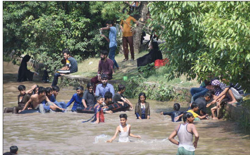
LAHORE: Youngsters are swing in water Spill ways, to cool off during high temperature, in Provincial Capital.