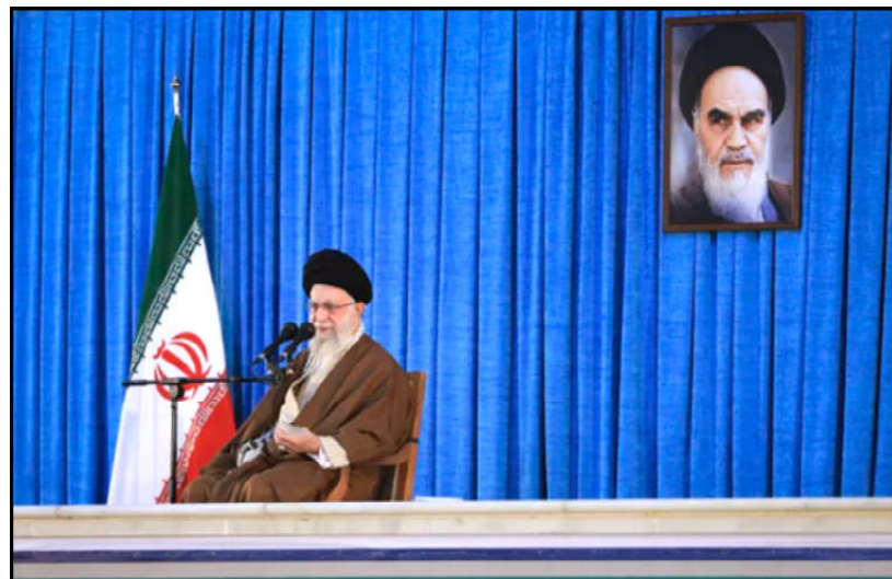
Supreme Leader Ayatollah Ali Khamenei speaks during a ceremony commemorating the death anniversary of the late revolutionary founder Ayatollah Khomeini at his mausoleum just outside Tehran, Iran.

ponents for negotiating in good faith and promised Americans that he had never felt more optimistic. Biden said that Congress has now preserved "the full faith and credit of the United States." But even with the House and Senate putting aside differences to finally rush through the agreement over the last week, the US economy's reputation took a hit. Ratings agency Fitch said Friday that it is keeping the United States' "AAA" credit rating on negative watch, despite the deal. The debt ceiling is usually an uncontroversial accounting manoeuvre approved yearly by Congress. It allows the government to keep borrowing money to pay for bills already incurred.