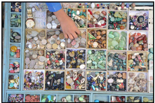
RAWALPINDI: A man is busy in selecting and purchasing gemstone and rings from roadside vendor in the city.

Last week, a truck loaded with cold chain containers from Pakistan arrived at Kashgar city in Northeast China's Xinjiang Uygur Autonomous Region via a cross-border land route. This is the first time that seafood containers from Pakistan have been transported by road from Karachi to Kashgar city along the China-Pakistan Economic Corridor (CPEC), a flagship project of the Belt and Road Initiative (BRI).