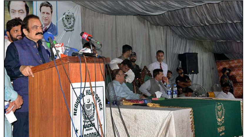
FAISALABAD: Interior Minister Rana Sana Ullah Khan addressing a public gathering during inaugural ceremony of NADRA Registration Center Aminpur Bangla and Passport Counter in Chak No.30-JB on Narwala-Aminpur Road.