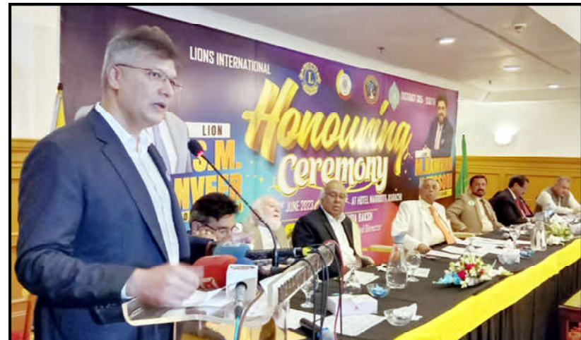
LAHORE: Provincial Minister of Industry, Commerce, and Energy SM Tanveer address at the Karachi New MJF Lions Club ceremony.

They said that the stock market was a highly documented segment and a major contributor to the national exchequer. They gave certain proposals to encourage people to invest in the stock market. The Finance Minister expressed his concerns at the erosion of PSX index. He noted that PSX was at one time one of the best performing stock markets and assured the group that their concerns would be addressed and measures would be taken to encourage investment in Pakistan.