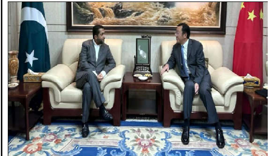
KARACHI: Provincial Home Minister Mir Ziaullah Langau meeting with Chinese Consul General Yundong.

Meanwhile, the Minister also thanked the Chinese government for donating 9,000 food packages for the flood affected people of Balochistan.