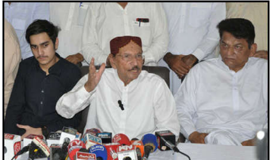
HYDERABAD: Former Chief Minister Sindh and senior leader Pakistan People's Party (PPP) Syed Qaim Ali Shah addressing a press Conference at Ansari House.