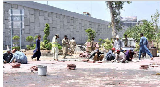
ISLAMABAD: Workers working on 9th Avenue Flyover at IJP Road during development work in the city.

Two weeks before Khalistan Referendum voting in Sydney, PM Modi was in Australia where he met the Australian gov't authorities and urged them to stop Sikhs from going ahead with voting but the Australian gov't told Modi that the whole Canberra respected India's position it was not in position to stop its own citizens from expressing their legal and democratic right. Pro-Khalistan Sikhs for Justice (SFJ) booked Khalistan Referendum voting at four different venues but all venues ended up cancelling the booking citing security and organisational issues as Hindutva groups, backed by the Indian gov't, raised false alarms of potential violence between Sikh and Hindutva groups with the centres. Large-sized banners and posters hung outside the venue with the following slogans: "Khalistan Referendum Australia, Shimla Capital secession of Punjab from India"; "1984 Sikh Genocide, 100+ Sikhs burnt alive in furnaces by India's Hindu mobs"; "Khalistan Rerendum."