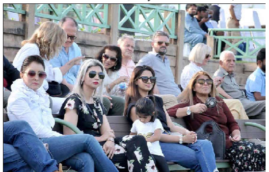
ISLAMABAD: Spectators watching final of Junior Polo Exhibition Match played between Islamabad Club Junior and Dubai Polo and Equestrian Club Junior teams at Islamabad Club Polo Ground.

The Minister said that plastic waste finds its way into our soil and waterways, and each year, an estimated 3.3 million tonnes of plastics are wasted in Pakistan, equal to the height of two K-2 mountains.