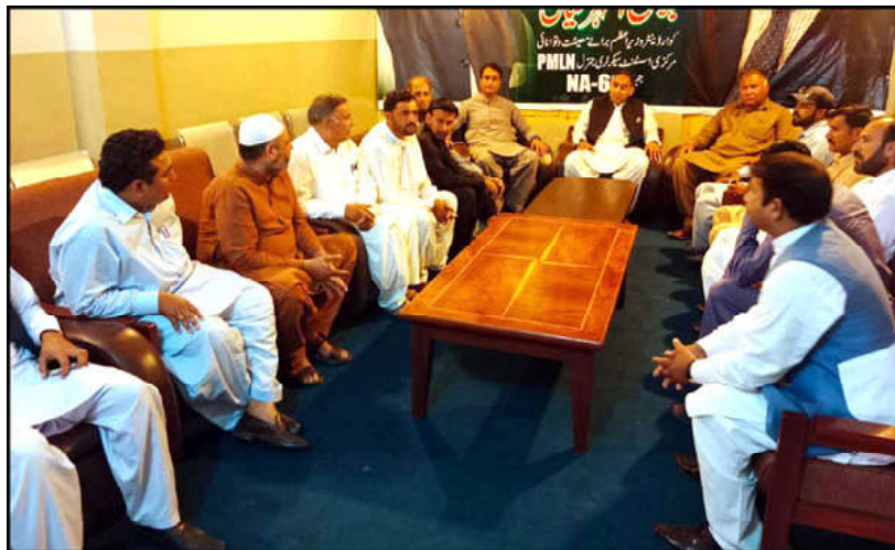
JEHLAM: Prime Minister's Coordinator for Economy and Energy, Bilal Azhar Kayani meeting with people during an open katchery (court).

He also appreciated the UK government's concessions to Pakistan on Developing Countries Trading Scheme (DCTS) facility, resulting in zero duty on over 92 percent of Pakistan's exports to the UK. Qamar provided an overview of Pakistan's policy landscape and economic performance, including increased revenue mobilization and investment promotion. Concluding his speech, Naveed Qamar expressed the confidence in further enhancing trade and investment relations between Pakistan and the UK. He encouraged businesses from both countries to capitalize on existing opportunities and collaborate on optimal utilization strategies. The UK businesses expressed keen interest in engaging with Pakistan for business opportunities.