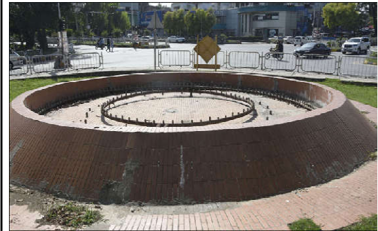
ISLAMABAD: A view of dilapidated fountain on a green belt at Aabpara Chowk, as needs to attention for concern authority, in Federal Capital.

"There is a dire need to educate the masses to play a role in this sector of the economy which needs to be explored and maintained." "The awareness cannot be created merely through lectures, but the media should play its role in making films, writing stories, and short film festivals having stories and information about Buddhists who visit Pakistan.