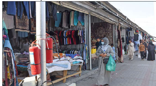
ISLAMABAD: A view of fire extinguisher install bed shop keeper outside his shop at H-9 Sunday Bazar as after fire in weekly Sunday Bazar shop-keepers are taking care by their own.

The Leshan city was hit by heavy rain over the two days before the incident, weather tracking data indicated.