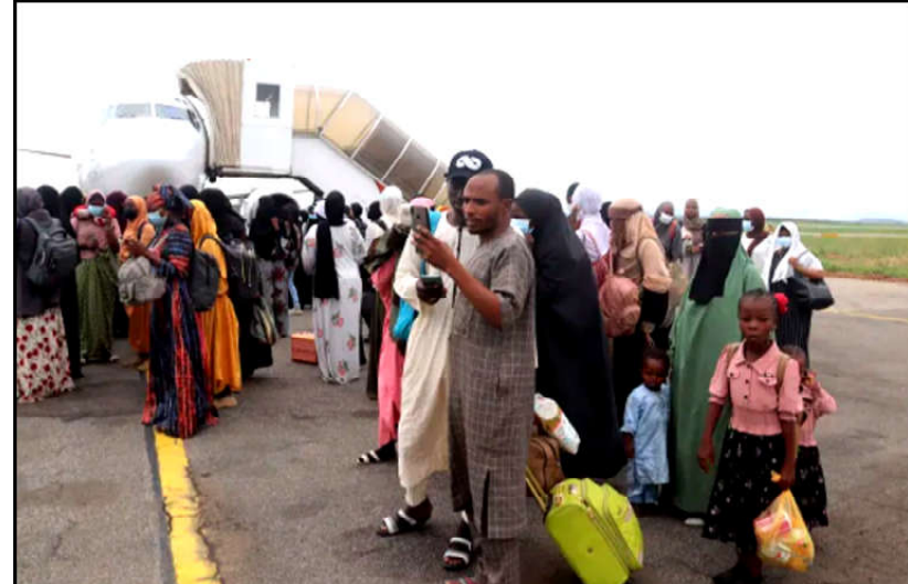
Nigerians who were evacuated from Sudan arrive at the Nnamdi Azikiwe International Airport in Abuja, Nigeria.

man standing alone on a street corner with a candle. "The regime wants you to forget, but you can't forget ... It (China) wants to whitewash all history," said Chris To, 51, who visited the park in a black t-shirt and was searched by police. "We need to use our bodies and word of mouth to tell others what happened." Hong Kong activists say such police action is part of a broader campaign by China to crush dissent in the city that was promised continued freedoms for 50 years under a "one country, two systems" model when Britain handed it back in 1997. Security is significantly tighter across Hong Kong this year, with up to 6,000 police deployed, including riot and anti-terrorism officers, according to local media. Senior officials have warned people to abide by the law, but have refused to clarify if such commemoration activities are illegal under a national security law China imposed on Hong Kong in 2020 after sometimes violent mass pro-democracy protests.