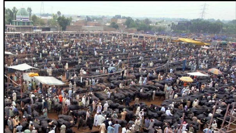
PESHAWAR: Sacrificial animals wait for their buyers at a make-shift sacrificial animals cattle market established for the upcoming festival Eid-ul-Azha, located on GT road in Peshawar.