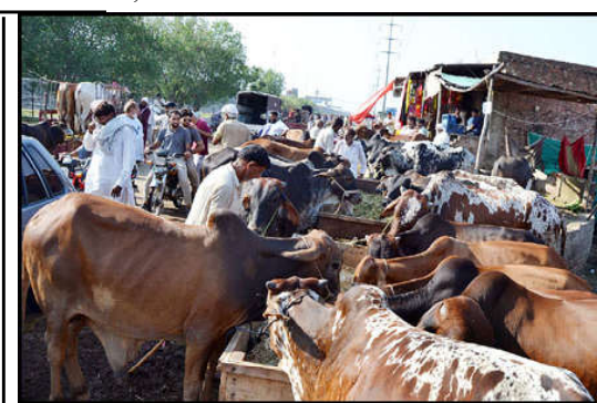
LAHORE: Vendors displaying sacrificial animals to attract the customers in connection with upcoming Eid ul Adha at Sacrificial Animal Market.

The Japanese Yen lost one paisa to close at Rs 1.99, whereas a decrease of Rs 1.05 was witnessed in the exchange rate of the British Pound.