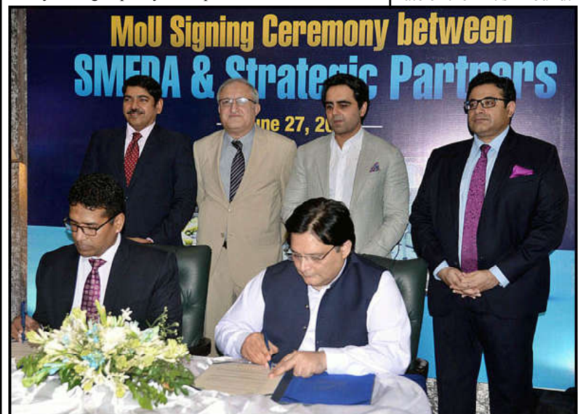
LAHORE: Federal Minister of Industries & Production Syed Murtaza Mehmood witnessing the signing ceremony of MoU between SMEDA & Strategic Partners.

To get out of the economic crisis, the government should formulate short, mid and long-term policies, he added. He said the business community had been supportive of the government's initiatives, which should adopt such measures to provide a conducive environment for business. He said the business community across the country, including the ICCI, had demanded reduction of the interest rate in the budget proposals, which was supported by the parliamentary committees and Finance Minister Ishaq Dar.