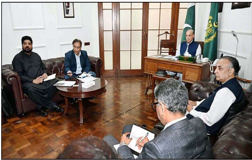
LAHORE: Prime Minister Muhammad Shehbaz Sharif chairs a meeting in connection with the pre-monsoon rains during Eid days in Punjab.

Ph: 0300-3898091 Vol: 05. No. 193 Zil Hajj 09, 1444 AH Wednesday June 28, 2023 Pages 04 Price Rs. 12.00