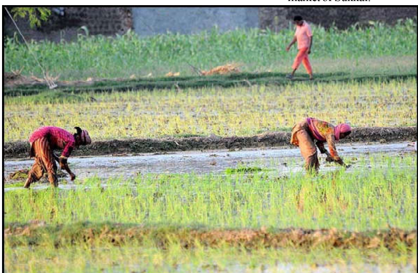
MULTAN: Women farmers bus in seedling the rice crop in their field in the outskirts of the city.

Interns would be deputed as additional field assistants by July 3.