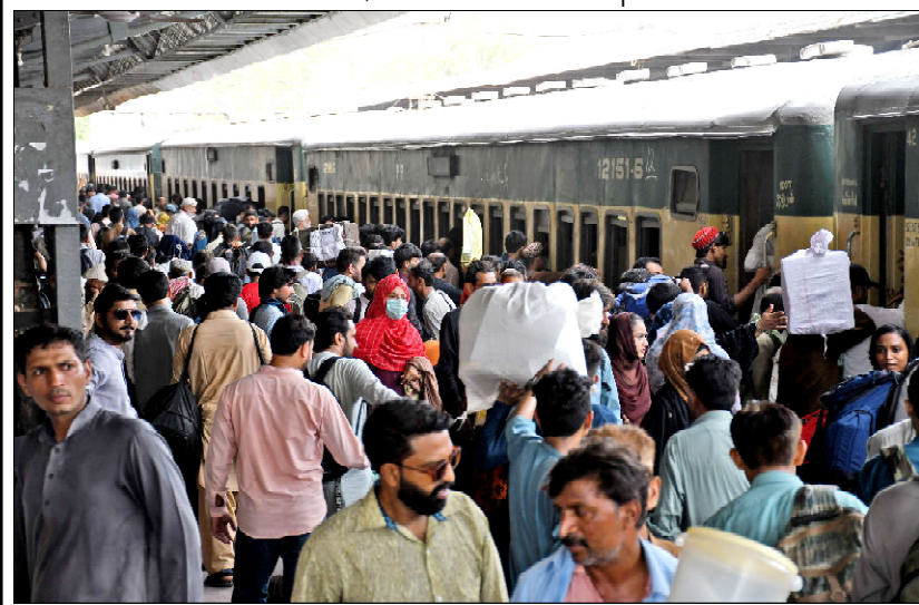
KARACHI: View of the hustle and bustle of passengers at Cantt Railway Station as people are boarding into train for leaving to their native villages for celebrating Eid-ul-Adha with great Zeal.

Matthew Miller said that the US recognizes that Pakistan has taken some important steps to counter terrorist groups in line with the completion of its Financial Action Task Force (FATF) actions plans.