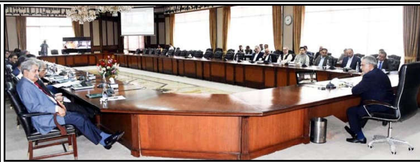
Federal Minister for Finance and Revenue, Senator Mohammad Ishaq Dar chaired the meeting of the Economic Coordination Committee (ECC) of the Cabinet, Islamabad.

SUKKUR (APP): The trade of sacrificial animals has picked up momentum in the Sukkur and other districts of the Sukkur division as the faithfuls are finalize the purchasing of different animals in cattle markets because only two days are remaining in Eidul Azha. It is the second Muslim ritual that commemorates the supreme sacrifices of Hazrat Ibrahim (AS) and his son Hazrat Ismail (AS). Apart from domestic traders, the businessmen of Sindh and Punjab have also brought their sacrificial animals in large number to fully exploit the market of Sukkur.