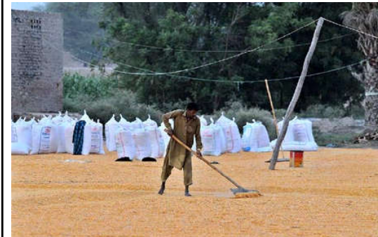
MULTAN: A laborer busy in spreading corn seeds for drying purpose in his field.

Cargo throughput of 160,017 tonnes, comprising 117,850 tonnes imports Cargo and 42,167 tonnes export cargo, including containerized cargo carried in 3,646 Containers (1,809 TEUs Imports and 1,837 TEUs export).