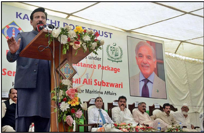
KARACHI: Federal Minister for Maritime Affairs, Syed Faisal Sabzwari addressing a ceremony to hand over letters to KPT employees for regularization of service under PM's Assistance Package.

For safe disposal of offal of sacrificial animal excavation has been made at two landfill sites of Karachi - Gondpads and Jam Chakru - and Sharafi Goth GTS and garbage collected from streets will be shifted to collection points and then to landfill sites for safe disposal.