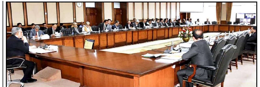
ISLAMABAD: Federal Minister for Finance and Revenue, Senator Mohammad Ishaq Dar chairing the meeting of the Executive Committee of the National Economic Council (ECNEC).

The cases had been registered under sections of Pakistan Penal Code and Section 7 of the Anti-Terrorism Act, 1997.