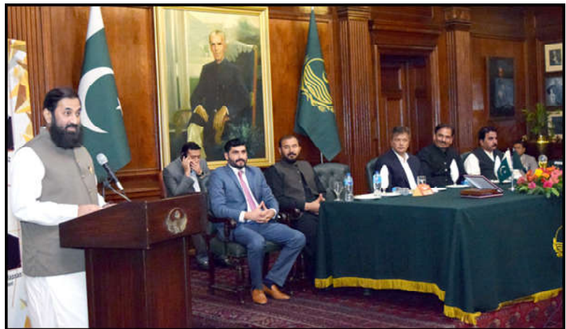
LAHORE: Governor Punjab Muhammad Balighur Rehman addressing the first Achievement Award Ceremony of Rahim Yar Khan Chamber of Commerce and Industry at Governor House.

Kundi said that Dera Ismail Khan has been included in the districts of the pilot project under which the beneficiaries would be paid through banks by next month. Moreover, he said Rs 70 billion were given to the flood victims. He said a NADRA office had been opened in Paroa Tehsil despite the obstacles and now he had demanded the Interior Ministry to immediately establish the same facility in Paniala. "We inaugurated the rehabilitation work on Chashma Right Bank Canal (CRBC) last month and issued instructions to the contractor to complete the work within one month.