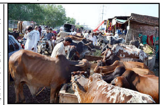
LAHORE: Vendors displaying sacrificial animals to attract the customers in connection with upcoming Eid ul Adha at Sacrificial Animal Market.

ISLAMABAD (APP): Pakistani Rupee on Tuesday gained 71 paisas against the US Dollar (USD) in the interbank trading as it closed at Rs285.99 against the previous day's closing of Rs 286.70.