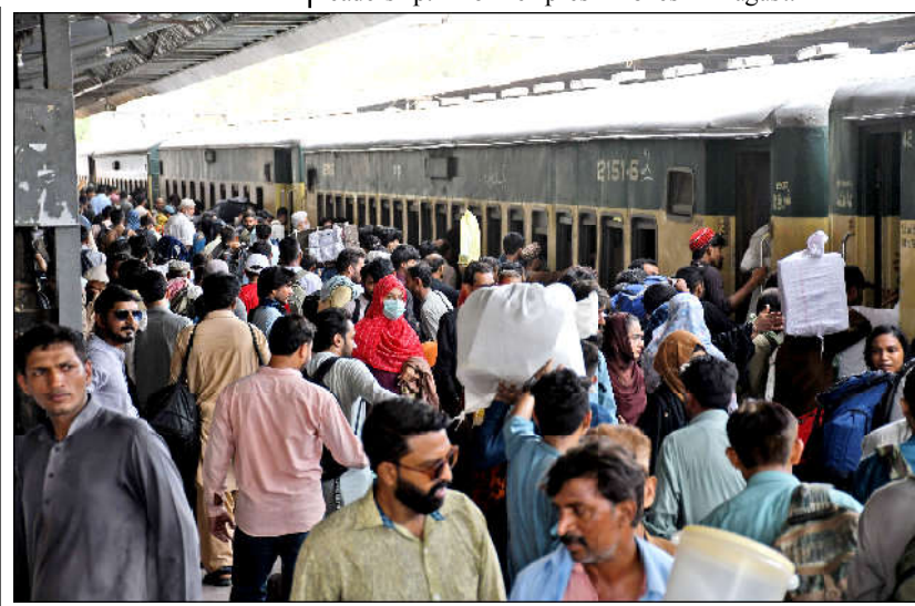
KARACHI: A view of the hustle and bustle of passengers at Cantt Railway Station as people are boarding into train for leaving to their native villages for celebrating Eid-ul-Adha with great Zeal.

logue. He said that the people of Pakistan have suffered tremendously from terrorist attacks over the years and added that US remains committed to working with Pakistan to address the shared threat posed by terrorist groups throughout the region. Matthew Miller said that the US recognizes that Pakistan has taken some important steps to counter terrorist groups in line with the completion of its Financial Action Task Force (FATF) actions plans.