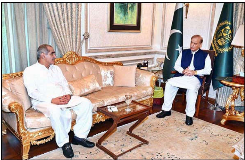
LAHORE: Federal Minister for Railways and Aviation, Khawaja Saad Rafique calls on Prime Minister Muhammad Shehbaz Sharif.

necks and facilitate SMEs, which could also be turned into a multi-national companies and 'this is our vision and focus.' He was of the view that government should not be intervening and interfering but it should be facilitating, incentivizing and focusing on making policies. "I am very lucky to have a best SMEDA team and we worked together. Today, we have signed MoUs with public sector organizations," he maintained. The Federal Minister also appreciated the very important incentives introduced with regards to single window operation like MoU was signed between Punjab government and SMEDA. "I think, more has to be done when I see different organizations working on Pakistan's single window; they all are working on single window but actually there is no one platform for the single window."