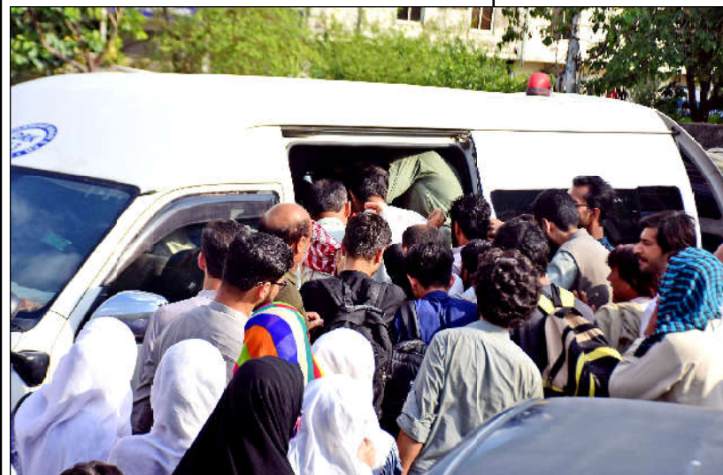
ISLAMABAD: A view of the hustle and bustle of passengers at Karachi Company Bus Stand as people are boarding into busses for leaving to their native villages for celebrating Eid-ul-Adha with great zeal.

"Eid Mubarak and all the blessings of the Almighty for you and your loved ones".