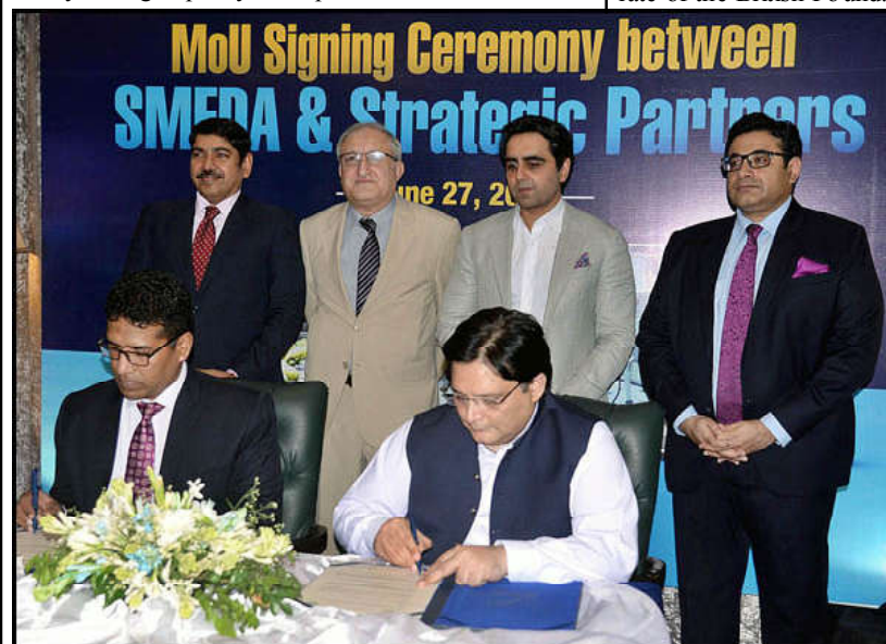
LAHORE: Federal Minister of Industries & Production Syed Murtaza Mehmood witnessing the signing ceremony of MoU between SMEDA & Strategic Partners.

timely payment of financial commitments which is not significantly vulnerable to foreseeable events. PMIC, incorporated in 2016, is licensed to carry out investment finance services as a Non-Banking Finance Company (NBFC) under the NBFC Rules, 2003 and NBFC Regulations 2008. The strong sponsors, Pakistan Poverty Alleviation Fund (49%), Karandaaz (38%) and KfW, a German development Bank (13%) strengthen the financial profile of PMIC.