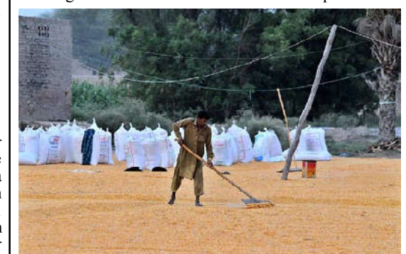
MULTAN: A laborer busy in spreading corn seeds for drying purpose in his field.

KARACHI (APP): Four ships namely, OOCL Le Havre, MSC Mundra, Lana and Milaha Ras Laffan carrying Containers and LNG, berthed at Qasim International Container Terminal and Pakistan Gas Terminal respectively. Meanwhile four more ships, MSC Letizia, Maersk Columbus Yankul Silver and Al-Maha with Containers, Palm oil and LPG also arrived at outer anchorage of the Port Qasim during the last 24 hours. A total of 09 ships were engaged at PQA berths during the last 24 hours, out of them four ships, MSC Mundra, Sadah Silver, Bochem Pegasos and Opera sailed out to sea on Tuesday morning on Tuesday and two more ships, Lana and Star Bovarius are expected to sail on today. Cargo throughput of 160,017 tonnes, comprising 117,850 tonnes imports Cargo and 42,167 tonnes export cargo, including containerized cargo carried in 3,466 Containers (1,809 TEUs Imports and 1,837 TEUs export).