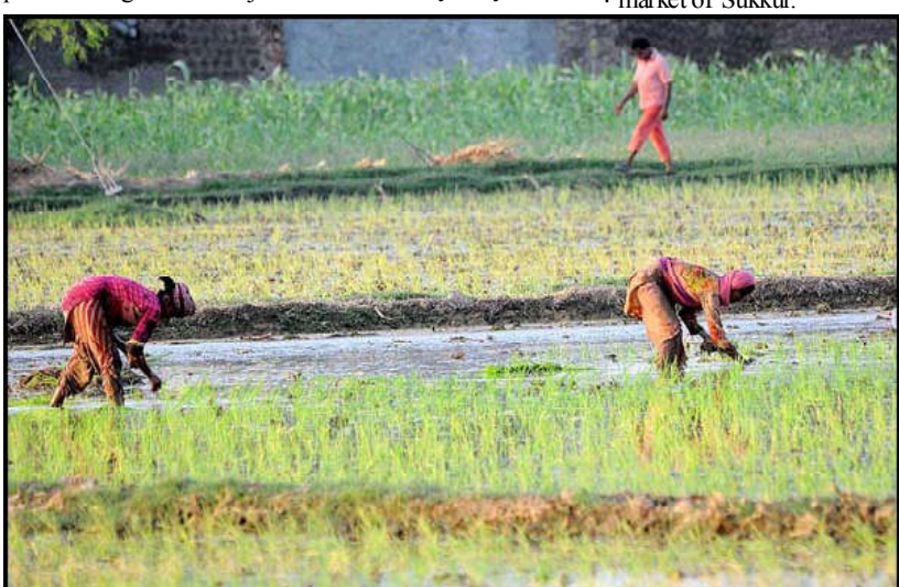
MULTAN: Women farmers bus in seedling the rice crop in their field in the outskirts of the city.