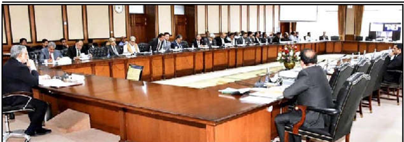
ISLAMABAD: Federal Minister for Finance and Revenue, Senator Mohammad Ishaq Dar chairing the meeting of the Executive Committee of the National Economic Council (ECNEC).

The Sarwar Road police, Gulberg police and Shadman Town police had registered three different cases against PTI leaders and workers in connection with May 9 riots after the arrest of the party chairman.