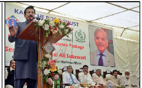
KARACHI: Federal Minister for Maritime Affairs, Syed Faisal Sabzwari addressing a ceremony to hand over letters to KPT employees for regularization of service under PM's Assistance Package.

The deceased were said to be from the same family.