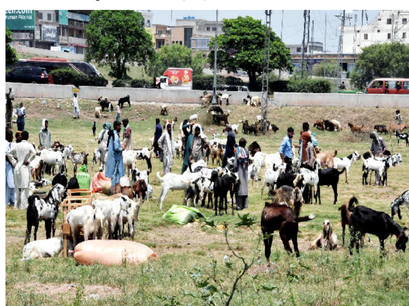
ISLAMABAD: Vendors displaying sacrificial animals to attract the customers in connection with upcoming Eid ul Adha at Sacrificial animal Market.

eral public, including approved cattle markets. Special attention will also be given to recreational areas, parks, and cemeteries to ensure a secure environment for everyone.