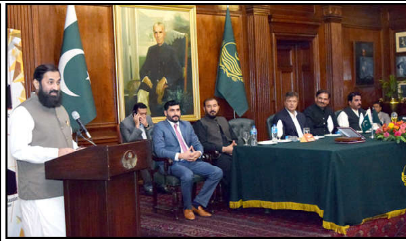
LAHORE: Governor Punjab Muhammad Balighur Rehman addressing the first Achievement Award Ceremony of Rahim Yar Khan Chamber of Commerce and Industry at Governor House.