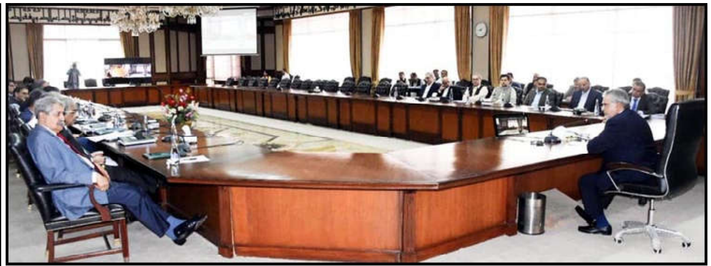
Federal Minister for Finance and Revenue, Senator Mohammad Ishaq Dar chaired the meeting of the Economic Coordination Committee (ECC) of the Cabinet, Islamabad.