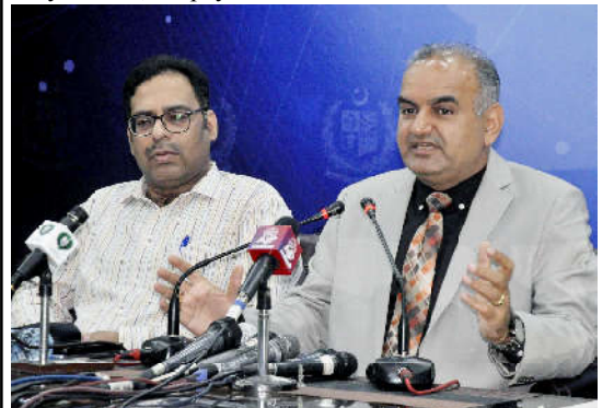
ISLAMABAD: Minister of State, chairman for Prime Minister Task Force on Gandhara Tourism, Dr. Ramesh Kumar Vankwani addressing a press conference at PID