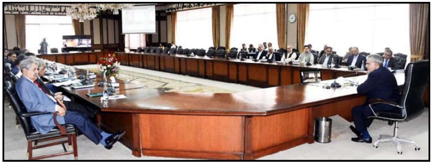
Federal Minister for Finance and Revenue, Senator Mohammad Ishaq Dar chaired the meeting of the Economic Coordination Committee (ECC) of the Cabinet, Islamabad.

SUKKUR (APP): The trade of sacrificial animals has picked up momentum in the Sukkur and other districts of the Sukkur division as the faithfuls are finalize the purchasing of different animals in cattle markets because only two days are remaining in Eidul Azha. It is the second Muslim ritual that commemorates the supreme sacrifices of Hazrat Ibrahim (AS) and his son Hazrat Ismail (AS). Apart from domestic traders, the businessmen of Sindh and Punjab have also brought their sacrificial animals in large number to fully exploit the market of Sukkur.