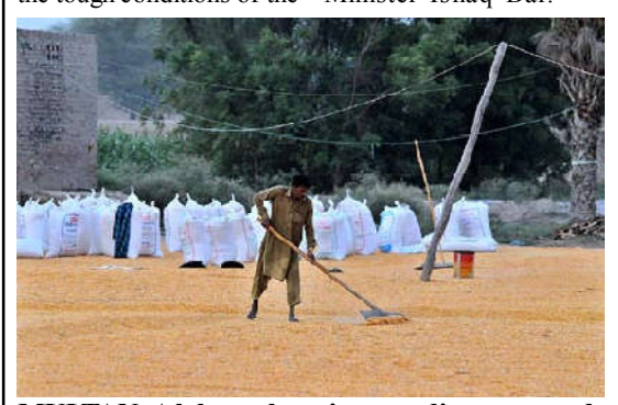
MULTAN: A laborer busy in spreading corn seeds for drying purpose in his field.

KARACHI (APP): Four ships namely, OOCL Le Havre, MSC Mundra, Lana and Milaha Ras Laffan carrying Containers and LNG, berthed at Qasim International Container Terminal and Pakistan Gas Terminal respectively. Meanwhile four more ships, MSC Letizia, Maersk Columbus Yankul Silver and Al-Maha with Containers, Palm oil and LPG also arrived at outer anchorage of the Port Qasim during the last 24 hours. A total of 09 ships were engaged at PQA berths during the last 24 hours, out of them four ships, MSC Mundra, Sadah Silver, Bochem Pegasos and Opera sailed out to sea on Tuesday morning on Tuesday and two more ships, Lana and Star Bovarius are expected to sail on today. Cargo throughput of 160,017 tonnes, comprising 117,850 tonnes imports Cargo and 42,167 tonnes export cargo, including containerized cargo carried in 3,646 Containers (1,809 TEUs Imports and 1,837 TEUs export).