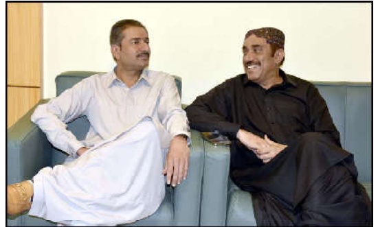
QUETTA: MPA Mir Hamal Kalmati meeting with Provincial Minister Mir Sikandar Ali Umrani

Similarly, the sub-divisional officers outside Quetta will be present in their office from 5 pm to 11 pm during the Eid holidays to ensure the timely resolution of customer complaints. In addition, customers can call 118 directly or send a message to 8118 from their mobile phones. On SMS their complaints would be registered. All city and district headquarters outside Quetta city will not have load shedding from 7 am to 12 pm.