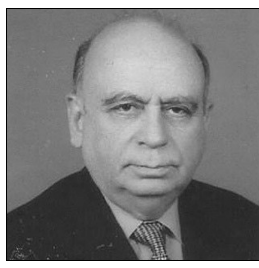
Afzal Ali Shigri

"Those creating hurdles in the way of making this process reach its logical conclusion will be dealt with strictly," he warned. With the Supreme Court currently hearing a case challenging the legality of trying civilians under military courts, the implications of the warning seemed rather ominous. However, considering how many times the DG ISPR stressed the armed forces' deference to the Constitution and the state, it is hoped that the security establishment will take the legal challenges to military courts not as a provocation, but as a procedural hurdle that must be crossed.