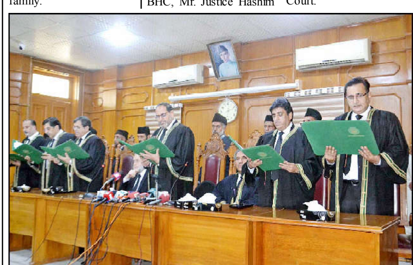
QUETTA: Chief Justice Balochistan High Court Mr. Justice Naem Afghan administering oath to newly regularized judges of BHC

option and the government exercise the powers whenever required. His comments were in reference to the government stance that the PTI used social media as a tool to incite hatred and violence against the state institutions in the country. The same argument was repeated by the defence minister who said use of social media platforms was instrumental in inciting people to resort to violence, leading to the attacks on military installations and other state assets on May 9. Khawaja Asif argued that the social media platforms were regulated in China and even in the developing world like Europe.