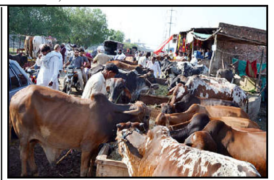
LAHORE: Vendors displaying sacrificial animals to attract the customers in connection with upcoming Eid ul Adha at Sacrificial Animal Market.

ISLAMABAD (APP): Pakistani Rupee on Tuesday gained 71 paisas against the US Dollar (USD) in the interbank trading as it closed at Rs285.99 against the previous day's closing of Rs 286.70. However, according to the Forex Association of Pakistan (FAP), the buying and selling rates of dollars in the open market stood at Rs 287.5 and Rs 290 respectively. The price of the Euro went up by 71 paisas to close at Rs 312.93 against the last day's closing of Rs 312.22, according to the State Bank of Pakistan (SBP). The Japanese Yen lost one paisa to close at Rs 1.99, whereas a decrease of Rs 1.05 was witnessed in the exchange rate of the British Pound.