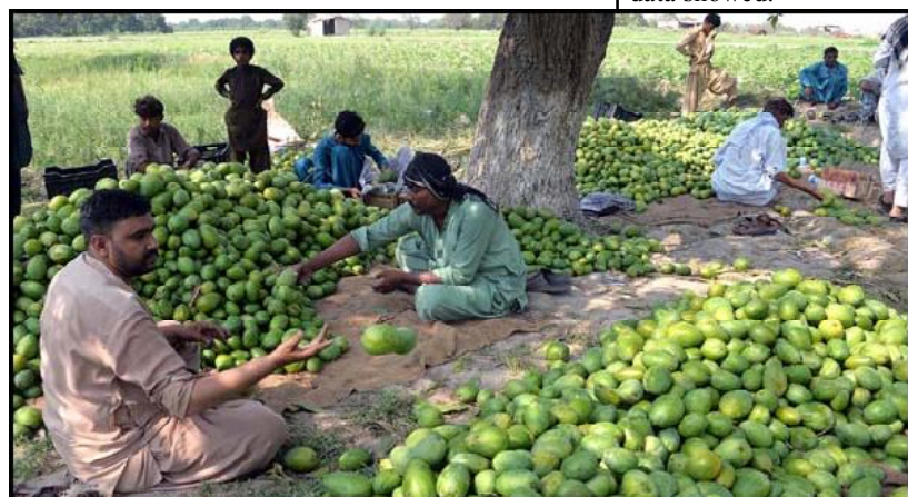
HYDERABAD: Labourers busy in packing mangoes in boxes before transporting to fruit markets in Tandojam.

In such circumstances, no new schemes have been started in any sector but in-time completion of ongoing schemes was focused by the caretaker government so that the benefits could be provided to the people.