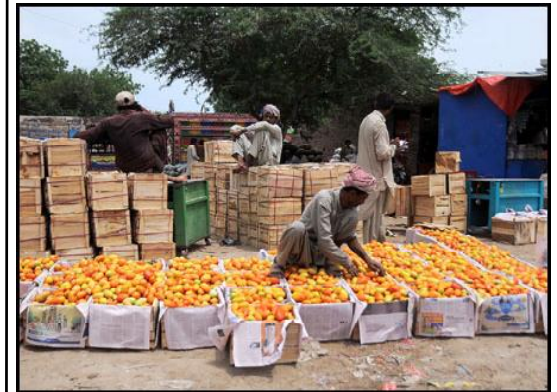
MULTAN: Labourer busy in packing tomatoes in wooden boxes at Vegetable Market.

He also reaffirmed the government's willingness to address the issues being faced by the business community and investors.