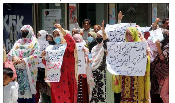
QUETTA: Members of Government Teachers Association are holding protest demonstration for upgradation and acceptance of their demands, held at Manan Chowk.

He said that the youth have understood after May 9 that who is the country.