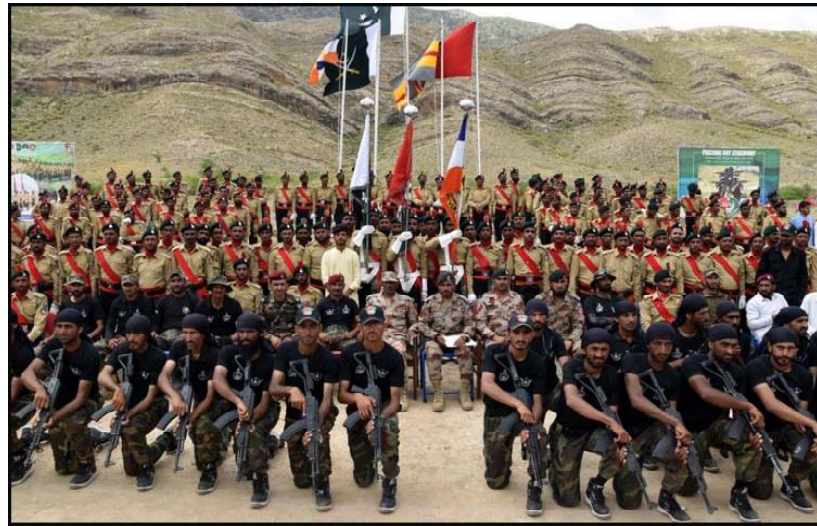
A group photo of Balochistan Levies Force on the eve of Passing Out Parade of 8th batch of Levies Recruit held at FC Headquarter Maiwand Rifles Kohlu.