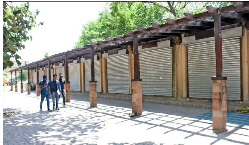
ISLAMABAD: A view of the shops at Sector F-8, which was developed by CDA to set a Flowers Market, but that are still waiting for auction after cancellation of allotment by Ex-Chairman, in Federal Capital.