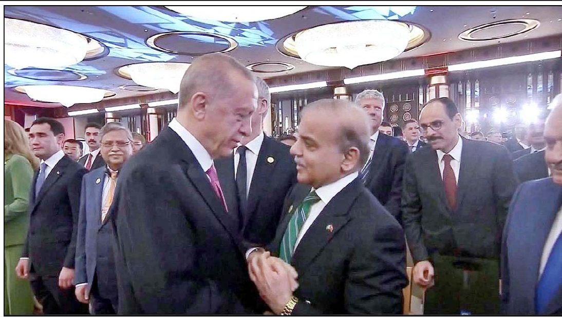
ANKARA: Prime Minister Muhammad Shehbaz Sharif greets Turkish President Recep Tayyip Erdogan at his inauguration ceremony

He expressed these views while addressing the Pillars of Pakistan Awards