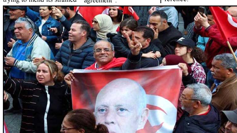
Tunisian president suggests taxing rich as solution to fiscal problem.