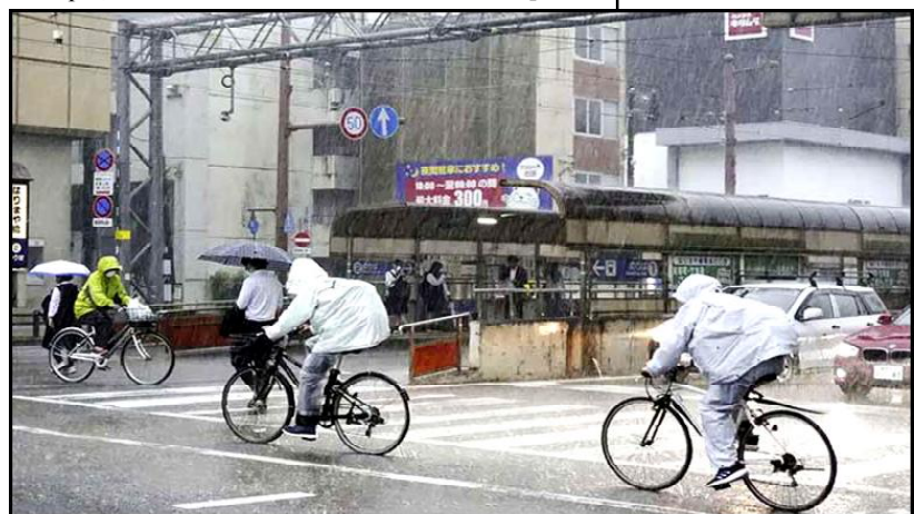
Tropical Storm Mawar brings heavy rains, landslide risk to Japan.