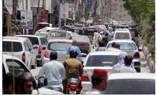
QUETTA: A large number of vehicles stuck in traffic jam due to negligence of traffic police staffs and illegal parking, need attention of concerned department during a hot & shiny day of summer season.

Speaker office has made confirmation of contacts made by majority of the members who have resigned with NA speaker.