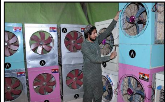
ISLAMABAD: A worker preparing room coolers for costumers at his workplace.

He said that May 9 was a day of national shame and it was less to condemn it, adding that those involved in the May 9 incident were being arrested and would be dealt in accordance with the law and the constitution.