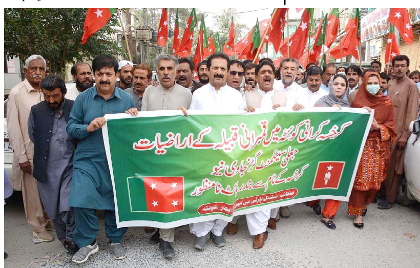
QUETTA: Activists of National Party holding a protest rally