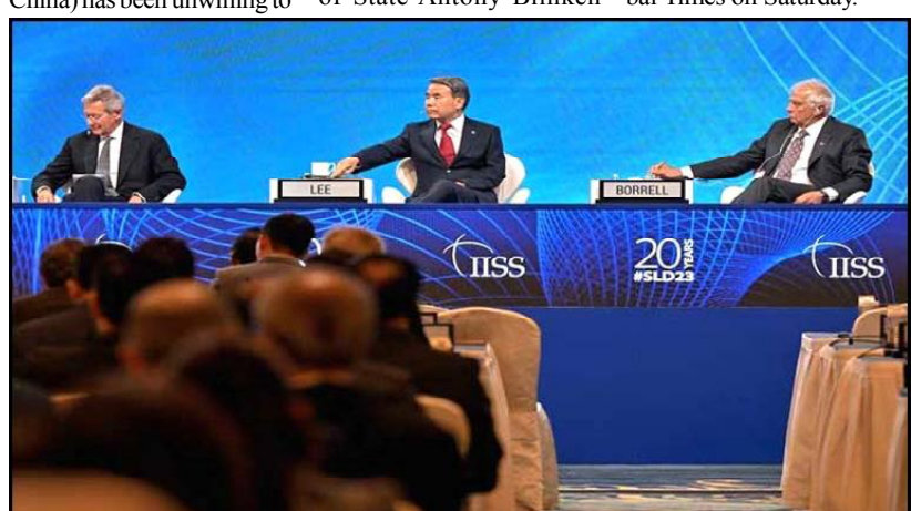
EU's top diplomat discusses Ukraine's ammunition needs with South Korea.

Reuters in April, signalled the prospect of a change, saying it might be difficult for Seoul to adhere to only providing humanitarian and financial support if Ukraine faced a large-scale attack on civilians or a "situation the international community cannot condone." Hundreds of thousands of South Korean artillery rounds are on their way to Ukraine via the United States, after Seoul's initial resistance toward arming Ukraine, the Wall Street Journal reported last month.