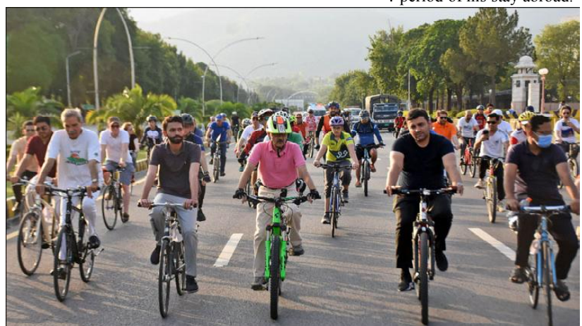
ISLAMABAD: Diplomats and Civil Society is participating in the cycle rally at D-Chowk as Organized by Embassy of Turkmenistan in Collaboration with Serena Hotels, to mark the World Bicycle Day, in Federal Capital.