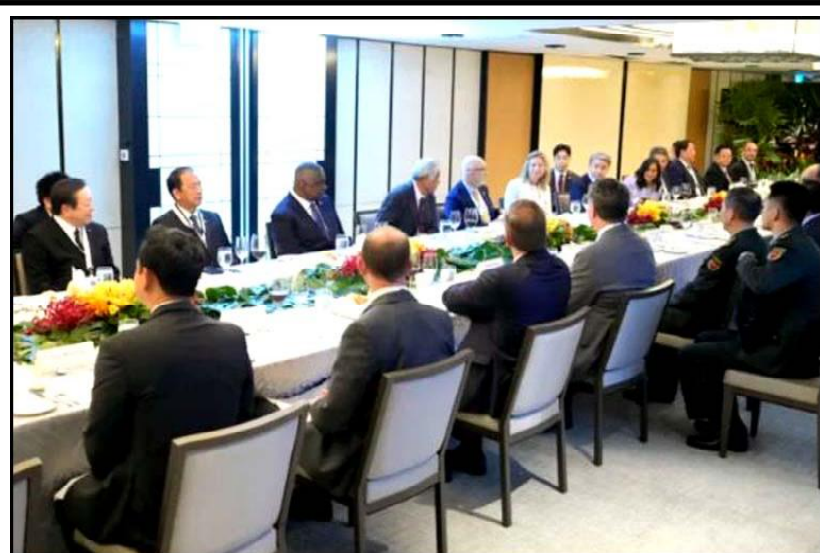
China's Defense Minister Li Shangfu and U.S. Secretary of Defense, Lloyd Austin together with others defense leaders attend the ministerial roundtable session during the 20th International Institute for Strategic Studies (IISS) Shangri-La Dialogue, Asia's annual defense and security forum in Singapore.