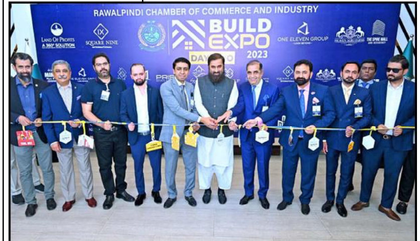
RAWALPINDI: Governor Punjab Baligh-Ur-Rehman cuts the ribbon along with others to inaugurate Property Expo under the banner of Chamber of Commerce (RCCI), in City.

the import of oil and energy from Russia, which not only contributes to reducing the cost of petroleum products but also strengthens energy security. They said under the barter trade arrangement, the principle of "import followed by export" would be followed, ensuring that exports match the value of imported goods. This innovative trade approach opens up opportunities for Pakistani businesses to export 26 identified goods including milk, eggs, cereal, meat and fish products, fruit and vegetables, rice, salt, pharmaceutical products, leather apparel, footwear, steel, and sports goods to Afghanistan, Iran, and Russia. Simultaneously, Pakistan can import a range of products, including fruits, vegetables, spices, minerals, coal, rubber items, cotton, pulses, wheat, petroleum oils, fertilizers, plastic and rubber articles, metals, chemicals, and textile machinery from these countries, they said.