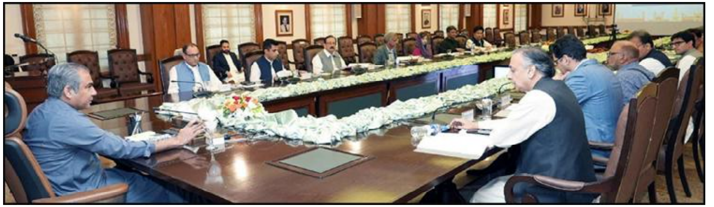
LAHORE: Caretaker Chief Minister Punjab Mohsin Naqvi presides over the meeting of governing body of Lahore Development Authority.