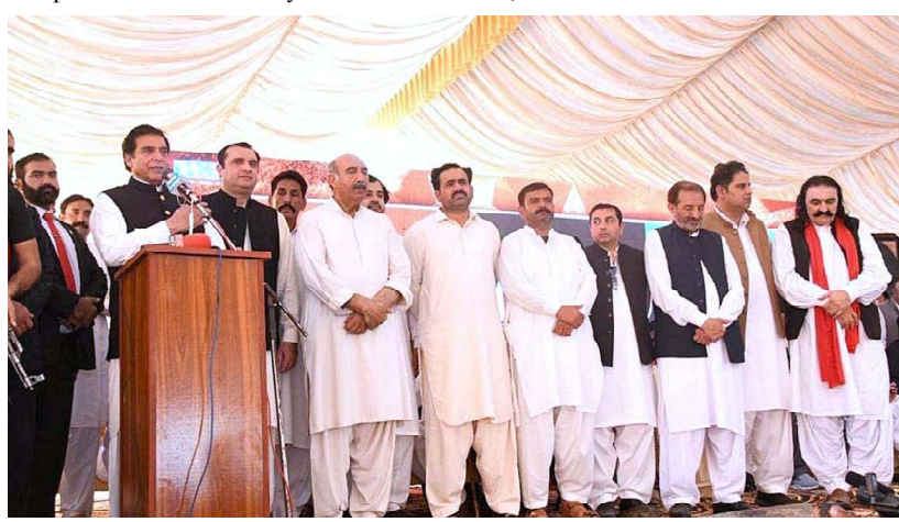
KHUSHAB: Speaker National Assembly Raja Pervaiz Ashraf addressing a public gathering during the ceremony organized in connection with the Golden Jubilee Celebration of the 1973 Constitution.