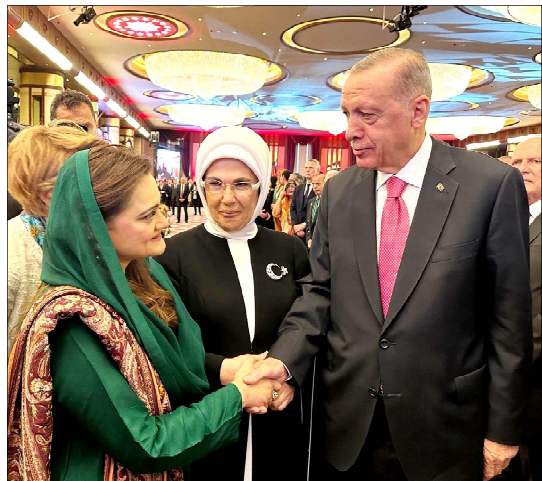
ANKARA: Federal Minister for Information and Broadcasting Marriyum Aurangzeb greets Turkish President Recep Tayyip Erdogan at his inauguration ceremony