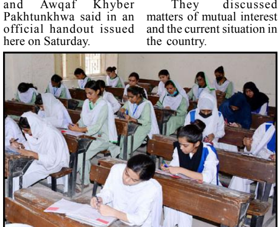
HYDERABAD: Students solving question paper during annual examination of HSSC (Part-II) at Government Degree Girls College at Latifabad.

From the teachings of saints and Sufis, we get the lesson of philanthropy, barrister Feroz Jamal Shah said. The spiritual retreats of the Sufis are the fountains of growth and guidance, Caretaker Minister of Information and Awqaf Khyber Pakhtunkhwa said in an official handout issued here on Saturday.