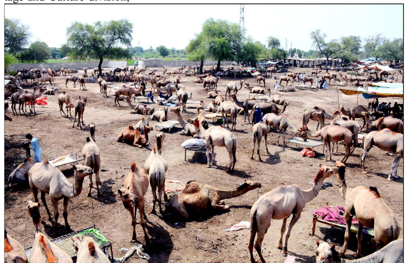
HYDERABAD: Camels are being selling at a make-shift sacrificial animals cattle market established for the upcoming festival Eid-ul-Azha

Speaking on the occasion "Provincial Minister said, what a proud moment and despite the heat, I am not feeling hot, I am a witness of your work, you guys have worked on my area in a fire emergency, your performance is excellent". Provincial Minister congratulated the passed-out rescuers, their families & instructors of Emergency Services Academy and said the role of Rescue 1122 in providing a sense of safety to the society is self-explanatory.