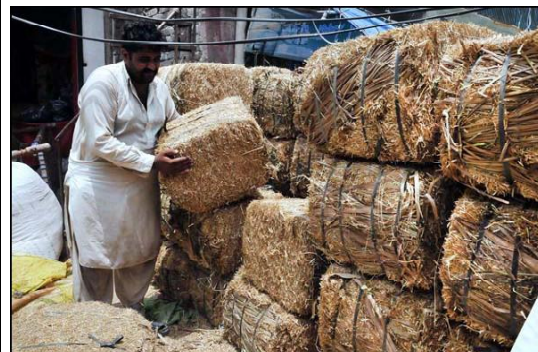
ISLAMABAD: A vendor loading dry fodder for sacrificial animals as per demand of customers ahead of Eidul Adha.

He said that the former president's vision regarding regional connectivity was commendable.