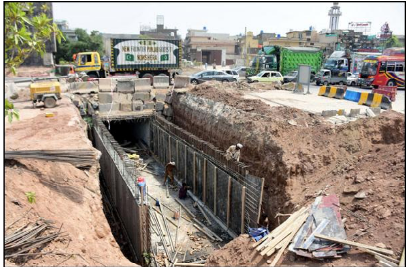
ISLAMABAD: Laborers are busy in their work at Kernal Sher Khan Shaheed Road as it is a surprising for people that after inauguration by PM, they uproot the newly constructed road for making underpass for Eidgah road, which is a question mark on the performance of concern authority.

He said that to enhance bilateral relations between both countries, the people-to-people exchanges were significant as it would connect the people and provide an opportunity to understand each others' culture. Moreover, journalists can play a vital role in highlighting the countries' bilateral relations and economic development, he added.