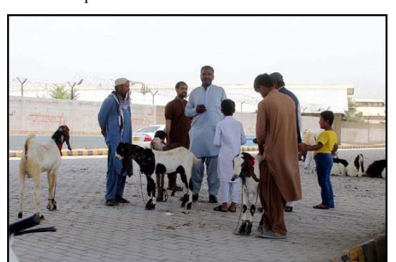
QUETTA: Sacrificial animals are being selling at a roadside for the upcoming festival Eid-ul-Azha, at Koyla Phattak in Quetta.

In contrast, she claimed that corruption had increased under the PTI government. Recognizing the potential of the country's youth, she emphasized that approximately 68 percent of Pakistan's population consists of individuals under the age of 30. She underscored the government's commitment to addressing the issues faced by young people and expressed their dedication to leading the youth towards significant improvements through various initiatives. She elaborated on the Prime Minister's Youth Program, which aimed to empower the youth through multiple initiatives such as the PM Youth Business.