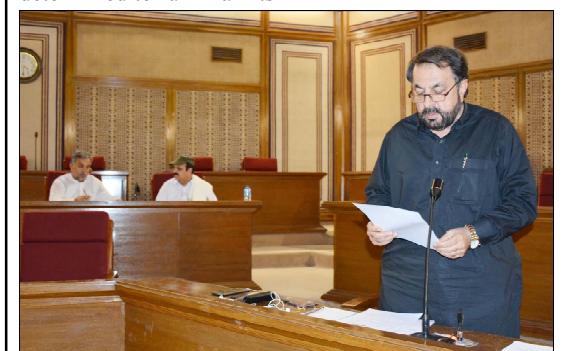
QUETTA: Provincial Finance Minister Engr. Zamrak Khan Achakzai presenting Balochistan Finance Bill in the Balochistan Assembly

An exchange of fire took place between the assailants and the police after the attackers after which they fled the scene.