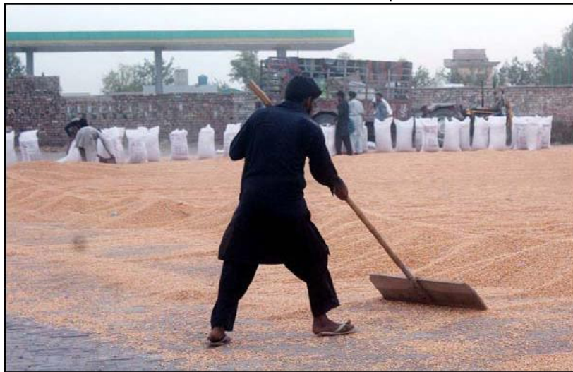
MULTAN: Labourer busy in filling Corn kernel in the bags after drying at his workplace.

SHANGHAI (Xinhua/APP): The balance of loans in Shanghai, including all currencies, stood at 10.83 trillion yuan (about 1.51 trillion U.S. dollars) at the end of May, up 8.8 per cent year on year, official data showed. The balance of loans in Chinese yuan rose 10.8 per cent year on year to 10.18 trillion yuan at the end of last month, according to the People's Bank of China Shanghai Head Office. The balance of loans in foreign currencies reached 91 billion U.S. dollars at the end of May, down 20.3 per cent year on year. At the end of last month, the balance of Shanghai's deposits climbed 7 per cent on a yearly basis.