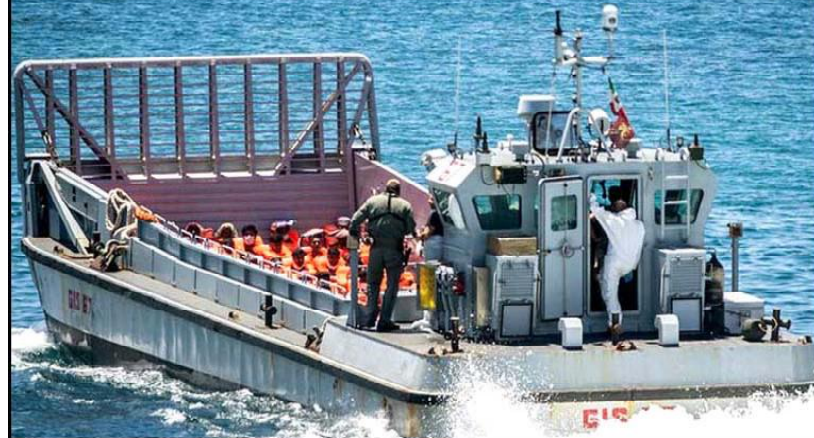
Vessel Sfax in Tunisia and was carrying 46 migrants from Cameroon, Burkina Faso and Ivory Coast.