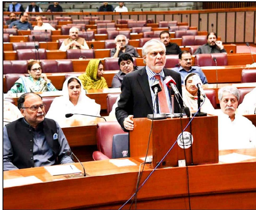
ISLAMABAD: Finance Minister Senator Mohammad Ishaq Dar addresses the Federal Budget 2023-24 winding up debate in the National Assembly

Ph: 2841470/2841473 REG: No. BC-116 B/ID-445 Vd: XXIV No. 305, Zil Hajj 06, 1444 AH Sunday June 25, 2023 Pages 12, Price Rs.15