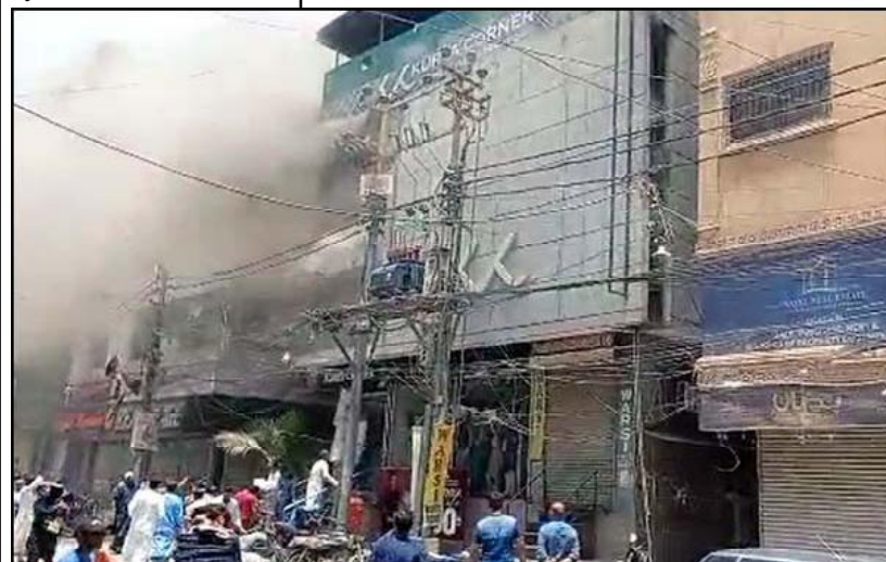
KARACHI: View of site after fire eruption in a clothes shop and warehouse due to unknown reasons after a fire broken out incident as the people and fire brigade officials are busy in extinguishing fire, located on Tariq road area.

GILGIT (APP): The Government of GB is proud to announce a groundbreaking collaboration with Karandaaz Pakistan, a prominent organization funded by the Melinda and Bill Gates Foundation, and the National Institute of Banking and Finance (NIBAF), said a press release issued by the GB Information Department on Saturday. "The collaboration aims to promote financial education and equip the youth of GB with essential financial skills for a prosperous future." It further said, "Karandaaz Pakistan has generously financed the development of 'Financial Literacy' content in partnership with NIBAF. This content will be incorporated into the training curriculum for Master Trainers, who will subsequently impart this vital knowledge to students across GB."