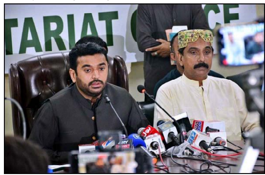
HYDERABAD: Mayor Hyderabad Kashif Shoro addressing to press conference at Mayor Office.