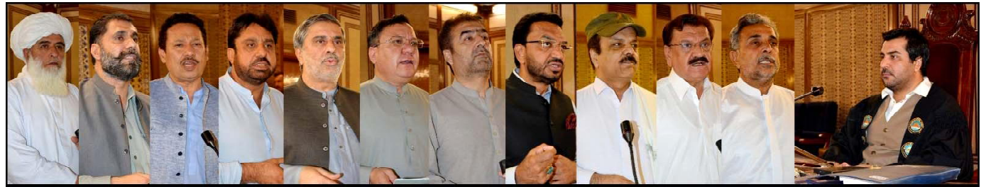
QUETTA: Provincial Ministers, Parliamentary Secretary and MPs expressing their views on budget 2023-24

Other areas of the province including Nokundi, Turbat, Sibi also remained hot. With this, the normal routine life has been affected badly forcing the people to stay inside their homes. The Met office has predicted that the heat wave would continue to prevail during next 24 hours in the province.