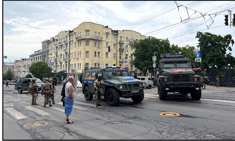
Fighters of Wagner private mercenary group stand guard in a street near the headquarters of the Southern Military District in the city of Rostov-on-Don, Russia.