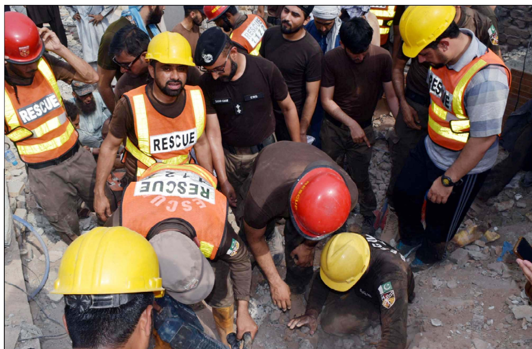
PESHAWAR: View of damages after gas cylinder blast occurred at residential building while rescue operation and investigation is underway, at Kohat Road in Peshawar