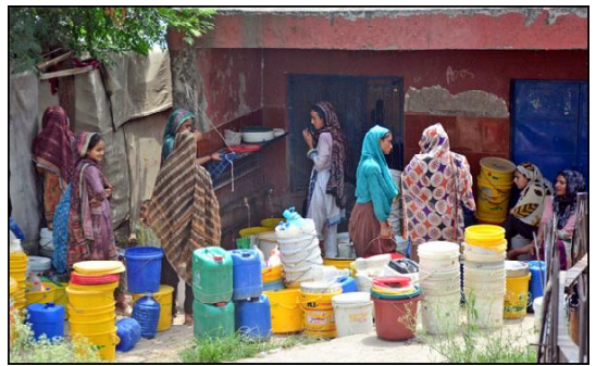
ISLAMABAD: Women are filling water bottles from Filtration Plant along the Railway Road, as after increasing temperature people are also facing the problem of water in City.

The Secretary BISP further said that Pakistan and Yemen are two brotherly countries and enjoy close cordial relationship.