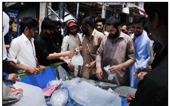
ISLAMABAD: A throng of people purchasing ice from a roadside vendor during a scorching weather in the twin cities.

Similarly, these expense included Rs.4,017,000,000 for Superannuation Allowance and Pensions, Rs. 26,400,000,000 for Grants, Subsidies and Miscellaneous Expenditure, Rs.10,000,000 for Pakistan Post Office Department, Rs.50,000,000 for Foreign Mission, Rs.369,105,000 for Law and Justice Division, Rs.4,000,787,000 for National Assembly, Rs.3,281,840,000 for Senate, Rs.596,646,000 for Staff, Household and Allowance of the President (public), Rs.812,380,000 for Staff, Household.