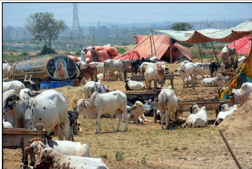
ISLAMABAD: Vendors displaying sacrificial animals to attract customers at I-15 sector Cattle Market in connection with upcoming Eid ul Azha.

According to the special instructions of the Punjab government, he said that government was paying Special attention on cotton cultivation because it is a profitable crop which is in demand by foreign countries and it can make the farmers economically stable. He said that cotton was cultivated on 180,000 acres in Sargodha division this year and requires cultivation target had been achieved.