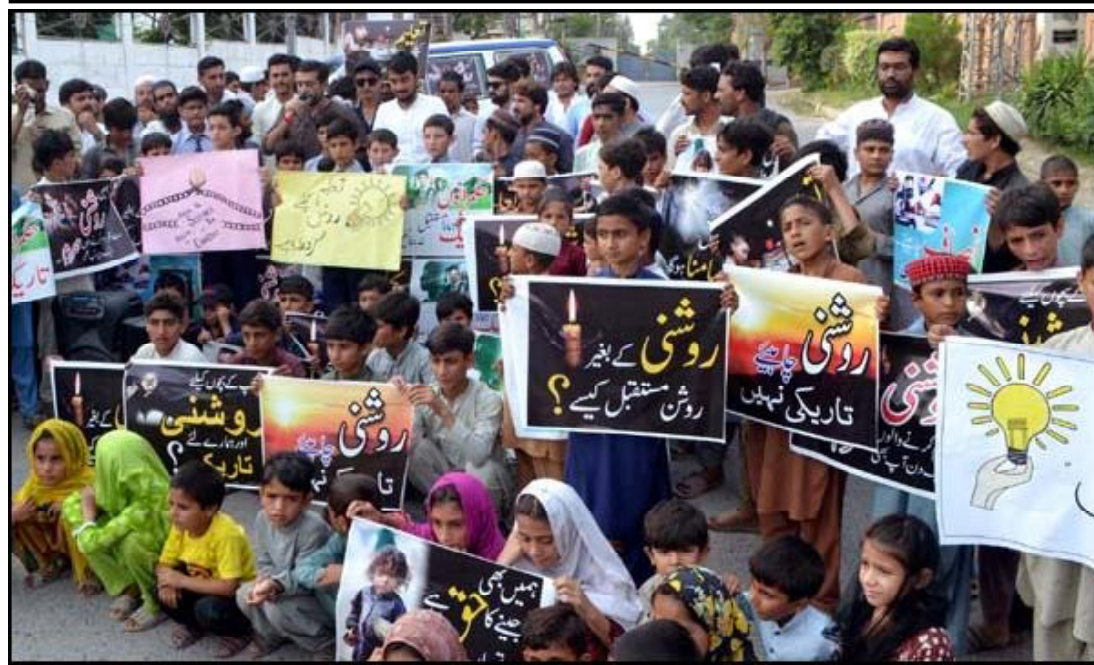
PESHAWAR: Residents of Mathra are holding protest demonstration against prolong electricity load shedding in their area, held at Peshawar press club.