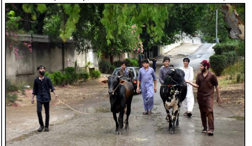
ISLAMABAD: People are wondering with their sacrificial animals during rain as sudden rain makes people smile in twin Cities.

Islamic Relief Worldwide and the United Nations (UN) were specifically recognized and deeply appreciated for their vital role in guiding Pakistan's climate action. Their initiatives have facilitated the development of climate-resilient infrastructure, improved disaster risk management systems, and promoted sustainable livelihoods. Encouraging the government of Pakistan to strengthen collaboration with international organizations, the House emphasized the potential benefits of leveraging their expertise and resources to enhance the country's climate change mitigation policies and disaster risk reduction strategies. It also called upon the international organizations to continue supporting Pakistan's efforts in tackling climate change through knowledge sharing. The House further acknowledged the invaluable contributions of Pakistani philanthropists both abroad and within Pakistan towards national economic growth.