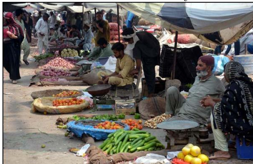
GUJRANWALA: Vendor sells vegetables to earn his livelihood as the customers are not willing to buy vegetable due to price hike at Vegetable Market in Gujranwala.

He said that the project would tap the potential of olive industry in the country, adding the continued growth of olive industry would help contribute significantly to the national economy and promote socioeconomic development, reduce poverty and create employment opportunities in the country.