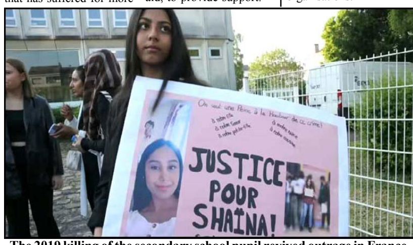
The 2019 killing of the secondary school pupil revived outrage in France.