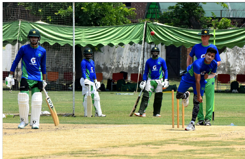
LAHORE: Pakistan Cricket Players are in action during PCB Special Camp at LCCI Cricket Ground in Provincial Capital

These regions hosted Division 2 Qualifiers in 2022 to determine the teams that will compete in the second and final qualifying event, the Regional Qualifier, with events taking place in 2023. Only the winning teams from the Regional Qualifiers will qualify to compete at the U19 Men's Cricket World Cup Sri Lanka 2024.