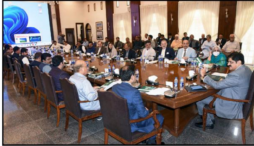
KARACHI: Chief Minister Sindh Syed Murad Ali Shah presides over a pre-budget Cabinet meeting at CM House in Provincial Capital.