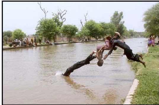
MULTAN: Children diving in canal to get relief from the scorching hot weather in the city.