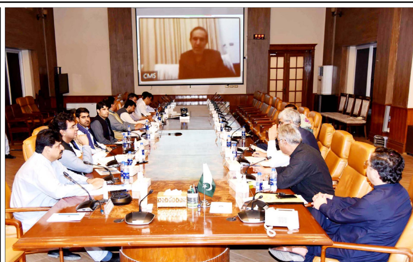
QUETTA: Balochistan Chief Minister and Chairman Quetta Development Authority (QDA) Mir Abdul Quddus Bizenjo presiding over meeting of Governing Body of QDA

June 09, it was 1100km away from the coast. Climate minister Sherry Rehman directed provincial disaster management authorities to be prepared with stock to ensure public safety of coastal area communities. Provincial disaster management authority (PDMAs) of Sindh and Balochistan were alerted and fishermen were stopped from any venture into sea.