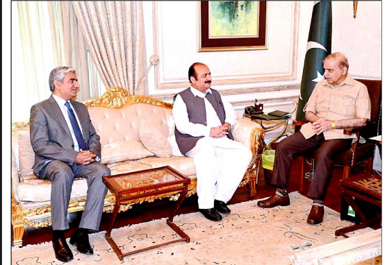
LAHORE: Vice President PML N Punjab, Rana Mashhood Ahmad Khan calls on Prime Minister Muhammad Shehbaz Sharif

The prime minister in a lengthy tweet referred to the laying of the fiscal budget 2023-24 said that it represented the beginning of the process to fix the economy's long-term ailments. The coalition government had prioritized the right areas that have the potential to spur economic growth, attract investment and make the economy self-sufficient, he added. The prime minister said the making of budget