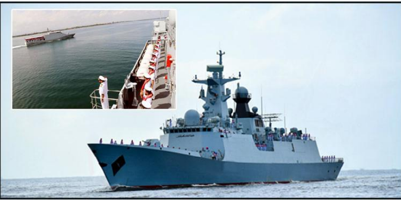
Commandant Officer PNS TIPPU SULTAN presenting ceremonial salute to Commander of Indonesian National Armed Forces during International Fleet Review at Multilateral Exercise KOMODO-23 Indonesia.