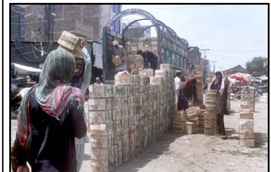
MULTAN: Laborers off loading fruit crates from delivery truck at the fruit market.

He said that the business community of the entire country, including the Islamabad Chamber, demands a Charter of Economy.