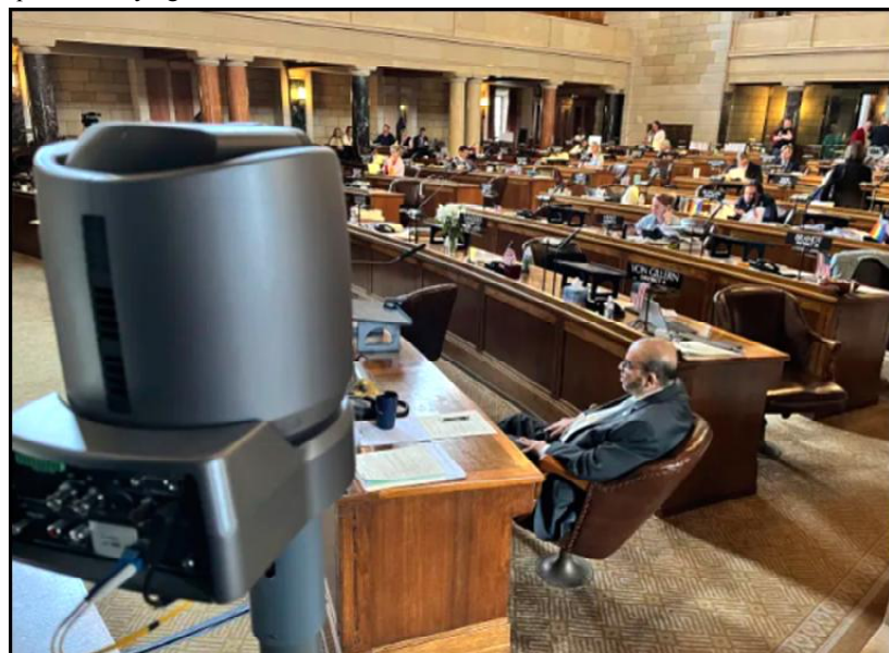
One of several cameras set up to capture live debate in the chamber of the Nebraska Legislature is shown in Lincoln, Neb.

Meanwhile, state media stated that injured personnel had been transported to nearby hospitals, and regional governor Vahap Sahin said that no more employees or staff members were still trapped in the rubble. However, many are reportedly in critical condition. Sahin told reporters that the explosion was the result of a chemical reaction, according to technical staff, and that it happened at 08:45 am local time (05:45 GMT). Alpaslan Kavaklioglu, the deputy defence minister, said in a statement that investigators had reviewed a video taken inside the structure just before the explosion and found nothing out of the norm up to the moment of the explosion.