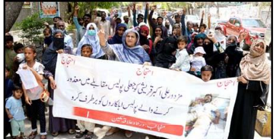
HYDERABAD: Family members of a suspect stage a protest demonstration against Phuleli police for injuring the suspect in a fake encounter outside press club Hyderabad.

09 May violent incidents were planned conspiracy of former prime minister in which arsons burned state assets and army installations, which is black day of history.