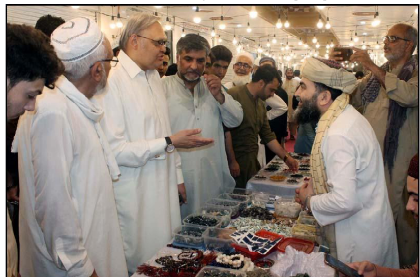
PESHAWAR: Khyber Pakhtunkhwa Caretaker Minister Jibran Adeel along with others take keen interest at stall during Gems and Jewelry Exhibition held in Peshawar.

The new CRELs fell by 6.0 percent monthly to 2.37 billion patacas. Within this total, new CRELs to