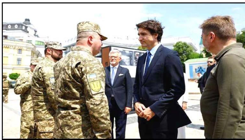
Canada's Trudeau visits war-time Kyiv, announces military aid

reconnection of Russian Agricultural Bank (Rosselkhozbank) to the SWIFT international payment system. While Russian exports of food and fertilizer are not subject to Western sanctions, Moscow says restrictions on payments, logistics and insurance have amounted to a barrier to shipments. Russia's foreign ministry said in a statement that U.N. representatives' attention was drawn to obstacles facing Russian agricultural producers and suppliers. "(They) are still forced to overcome numerous restrictions and barriers provoked by illegal anti-Russian sanctions associated with bank payments.