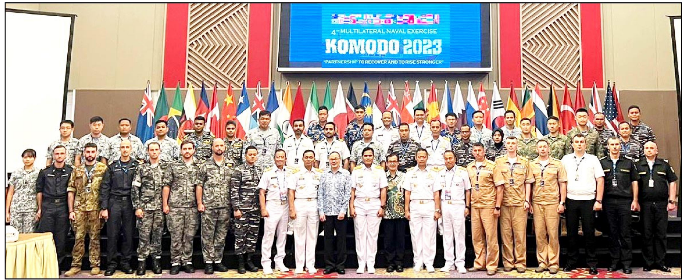
Group photo of Pakistan Navy officials along with participating navies during Multilateral Exercise KOMODO-23 in Indonesia

In the video, the judge can also be seen apologising to Nawaz Sharif and expressing his regret for convicting Nawaz Sharif.