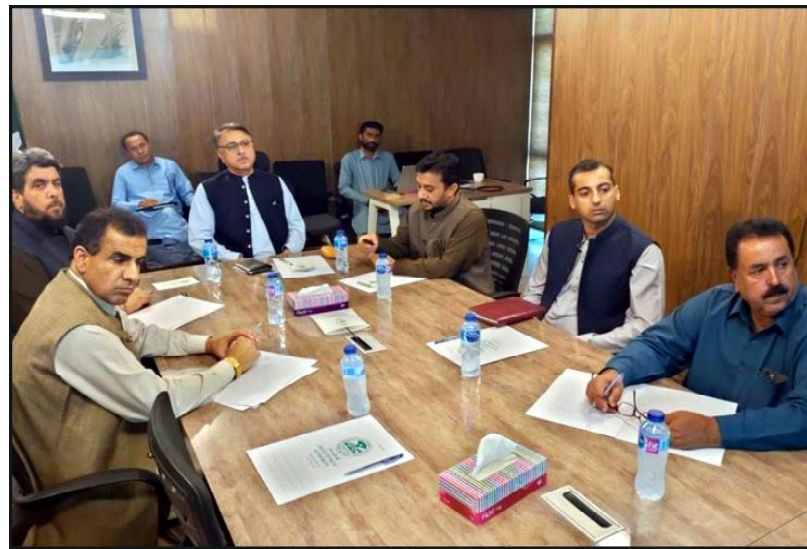
GWADAR: Governor Balochistan Malik Abdul Wali Khan Kakar presiding over a meeting regarding ongoing development projects.

For long, Chinese companies are overstressed by overpriced power production by 8.5 MW generators in Gwadar Free Zone against the backdrop of non-availability of power supply from government.