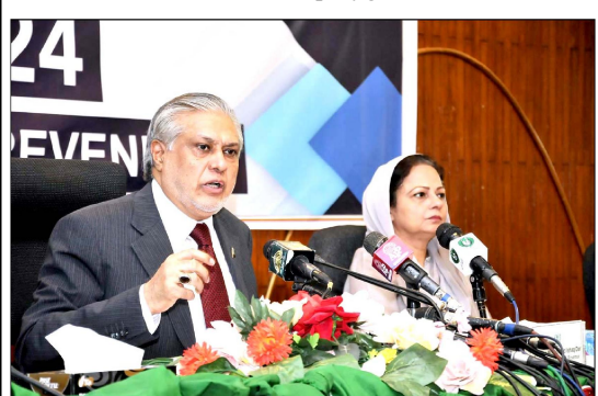
ISLAMABAD: Finance Minister Senator Muhammad Ishaq Dar addresses the Post Budget press conference at Ministry of Planning.