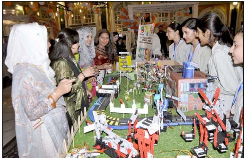
ISLAMABAD: Students visiting a stall at the closing session of International EdTech Conference.

to perform the important religious duty of Jumma prayers for the 198th consecutive week besides not being able to carry out his official duties. It strongly protested against the nearly four-year-long detention of the Mirwaiz and barring him from preaching from the pulpit of the historic mosque. The Anjuman hoped that Mirwaiz Umar Farooq would be released before the holy days of Hajj and the festive occasion of Eid-ul-Azha, so that he could be able to resume his political activities.