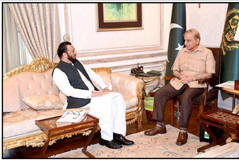
LAHORE: Chairman LESCO Hafiz Nauman calls on Prime Minister Muhammad Shehbaz Sharif.

"We welcome quality agricultural products from Pakistan to enter China's market and stand ready to continue to work with Pakistan to boost our trade through land transportation, achieve sustainable growth, bilateral trade and deliver more benefits to our two peoples," the Chinese foreign ministry spokesperson added.