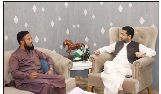
QUETTA: Deputy Commissioner Kalat Munir Ahmed Durrani meeting with Home Minister Mir Ziaullah Lango

NADRA offices located in areas where dedicated passport offices are not available besides the online renewal of passports within the country and the launch of the e-passport facility in Islamabad. Rana Sanaullah said that the accomplishment was the result of a collaborative effort between the DGI&P and NADRA and commended Yawar Hussain, Tariq Malik, and their dedicated teams for their hard work. Emphasizing the importance of these measures, the minister said they aim to enhance passport security and provide convenience to citizens. "The e-passport facility incorporates state-of-the-art security features, such as biometric data and digital signatures, effectively reducing the risks of passport fraud.