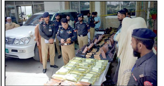
QUETTA: Deputy Inspector General of Police Ghulam Azfar Mahesar examining the ammunition, seized by Police during operation against culprits, in Provincial Capital.

The members of Gwadar Chamber of Commerce informed the governor about their difficulties and new employment opportunities.