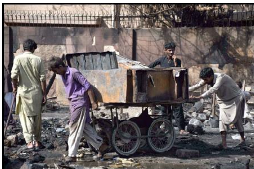
KARACHI: Residents collect their belongings from the debris of their houses after fire broke out in shanties in a slum area of Gulistan-e-Jauhar.

The IGP said that every victim who comes to the police station should be respected as a member of his family, and ensure that the problem was solved with sincerity. He said that legal aid fund had been started to help the officials who face cases during duty so that the officer or the official does not face financial difficulty.