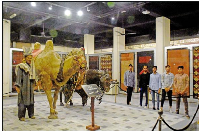
ISLAMABAD: Youngsters are taking interest in different traditional monuments of Pakistan's Culture, at Lok Versa Museum as the museum consists of several buildings as well as an outdoor museum which can accommodate up to 3000 visitors.

The letter stated that the troops were deployed in the federal capital Islamabad to maintain peace and stability, but the security situation in the is now satisfactory so there was no need for further staying of the troops. Similarly, the Punjab government has also written a letter to the Ministry of Interior, requesting the immediate withdrawal of the army.