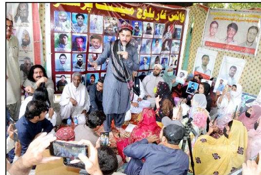
QUETTA: PTM Chief, Manzoor Pashteen addresses to express his solidarity with Members of Voice of Baloch Missing Persons during their protest camp.

He expressed the hope that the Quetta police would maintain its performance and ensure the protection of life and property of the people. He also assured every possible support and patronage to the police for curbing crimes in the metropolis.