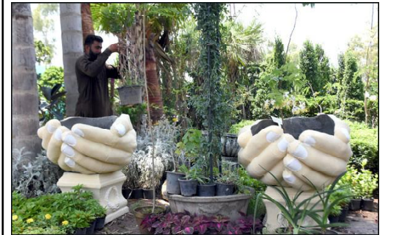
ISLAMABAD: A Gardner is busy in his work at Nursery in Sector H-9 as the huge hands shaped flowers pots are attracting customers in Federal Capital.

He also announced increasing the minimum pension fixing it at Rs 12,000 and minimum monthly wage from Rs 25,000 to Rs 32,000 within the Islamabad Capital Territory (ICT).