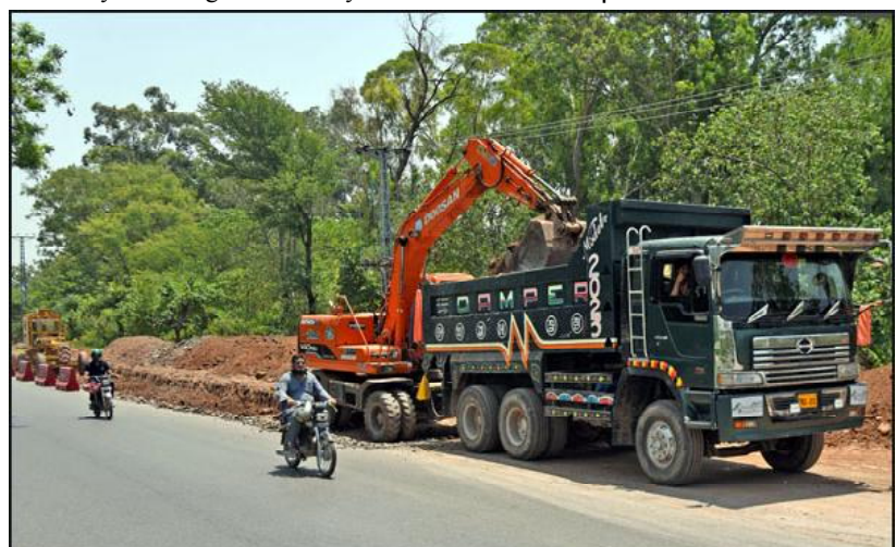
ISLAMABAD: Workers are busy with heavy machinery during the extension of the Park Road in Federal Capital.

Air Marshal Khan emphasised the criticality of political stability as a prerequisite for progress, emphasising that true security could not be achieved without ensuring the safety and well-being of the people. Therefore, he stressed the importance of adopting a human-centric approach to security as the primary focus.