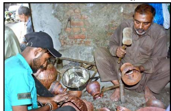
LAHORE: Skilled persons make brass and copper metal pots in traditional way at their work place.

He said Pakistan can prosper only if we generate higher exports and equitable tax revenues from real estate, agriculture, IT, textile, and retail sectors.