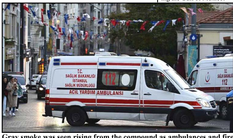
Gray smoke was seen rising from the compound as ambulances and fire trucks rushed to the area.

Monitoring Desk BANGKOK: Myanmar's junta has suspended travel authorisations for aid workers trying to reach hundreds of thousands of people in the cyclone-ravaged Rakhine state, the U.N.'s humanitarian affairs office said on Friday. Cyclone Mocha brought lashing rain and winds of 195 kilometres per hour to Myanmar and neighbouring Bangladesh last month, killing at least 148 people in Myanmar. The cyclone destroyed homes and brought a storm surge to Rakhine state, where hundreds of thousands of Rohingya minority refugees live in displacement camps following decades of ethnic conflict. Junta authorities this week suspended "existing travel authorizations... for humanitarian organisations."