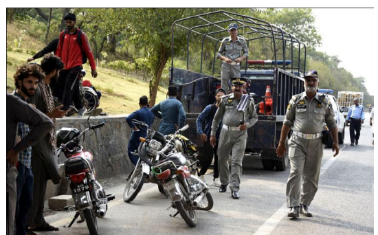
ISLAMABAD: Traffic wardens seize without registration motorcycles at Faizabad police check post in the Federal Capital.