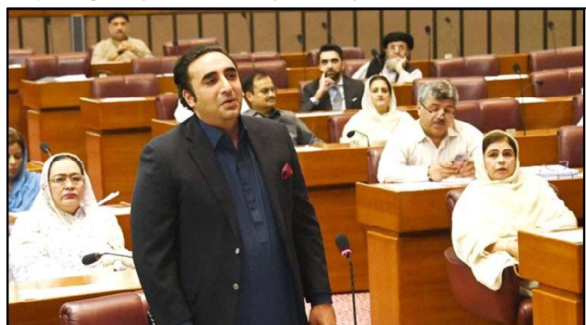
ISLAMABAD: Foreign Minister Bilawal Bhutto Zardari expressing his views in National Assembly