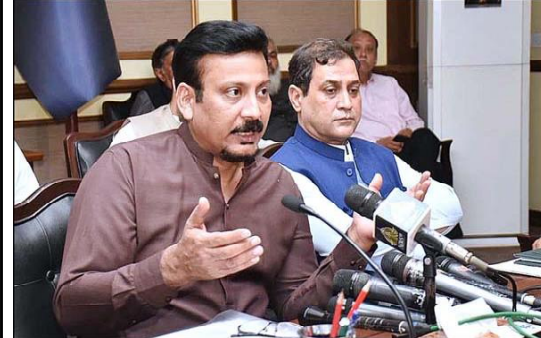
KARACHI: Federal Minister for Maritime Affairs Syed Faisal Ali Subzwari's addressing Press Conference at KPT.

PARIS (APP): Prime Minister Shehbaz Sharif on Friday urged the overseas Pakistanis to play their role to expose the anti-Pakistan propaganda in their respective countries, besides condemning the arson that took place on May 9. The prime minister, in an interaction with the representatives of the Pakistani community in France as well as the Pakistan Business Forum, told the expatriates that the arsonists of May 9 were spreading lies to instigate the people abroad. The prime minister is visiting Paris to attend the New Global Financing Pact Summit hosted by France. He said the overseas Pakistanis were Pakistan's ambassadors and an asset, and that their services for the country's development were laudable. Prime Minister Shehbaz told the community members that through