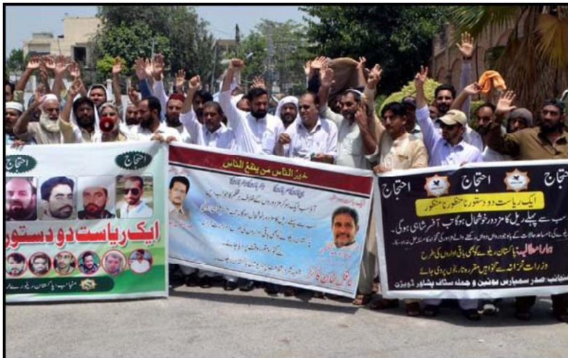
PESHAWAR: Members of Pakistan Railway Traffic Yard Staff are holding protest demonstration for acceptance of their demands, at Peshawar press club.