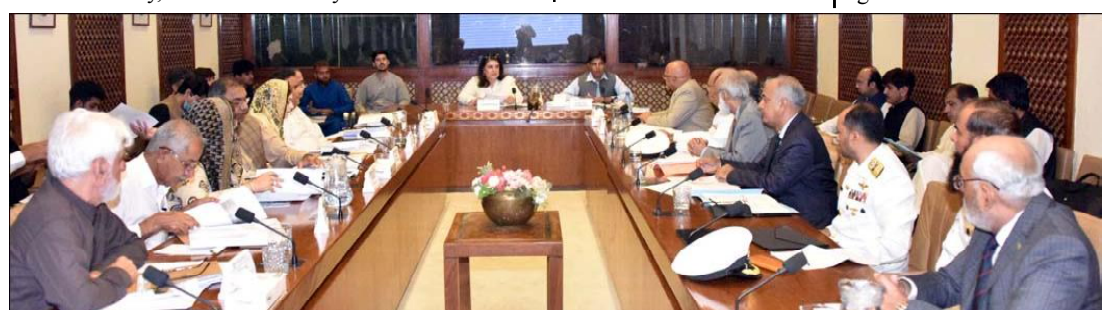
Senator Mrs. Rubina Khalid, Chairperson Senate Standing Committee on Maritime Affairs presiding over a meeting of the committee at Parliament House Islamabad