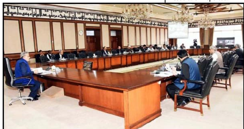
ISLAMABAD: Federal Minister for Finance and Revenue, Senator Mohammad Ishaq Dar chaired the meeting of the Economic Coordination Committee (ECC) of the Cabinet in Islamabad.

ISLAMABAD (APP): The per tola price of 24 karat gold decreased by Rs 1,500 and was sold at Rs 217,500 on Friday against its sale at Rs 218,500 the previous day. The price of 10 grams of 24 karat gold also decreased by Rs 1,285 to Rs 186,043 from Rs 187,328 whereas the price of 10 grams 22 karat gold went down to Rs 170,539 from Rs 171,718, All Sindh Sarafa Jewellers Association reported.