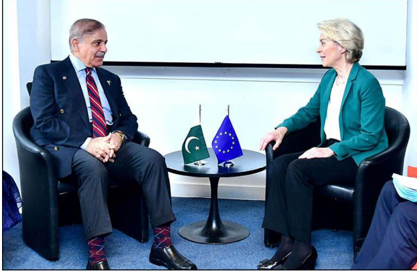
PARIS: Prime Minister Shehbaz Sharif meets President of the EU Commission Ursula Von Der Leyen on the sidelines of the New Global Financing Pact Summit.