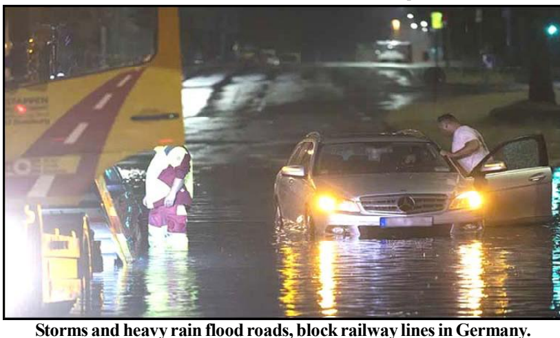
Storms and heavy rain flood roads, block railway lines in Germany.