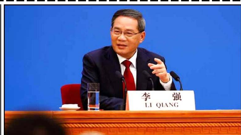
Premier Li urges China and Europe to 'rise above differences' at Paris summit.