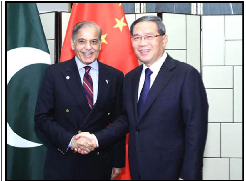
PARIS: Prime Minister Muhammad Shehbaz Sharif meeting with Chinese Premier Li Qiang on the sidelines of the New Global Financial Pact Summit

In his remarks, Premier Li said the Pakistan-China friendship was unique and had withstood the vicissitude of time due to deep fraternal ties between the peoples of the two nations. He added that as a close neighbour and iron-brother, Pakistan occupied a special position in China's neighbourhood diplomacy and that China would continue its efforts for safeguarding Pakistan's core interests and for the economic development and prosperity of its people.