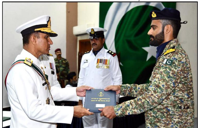
Chief of the Naval Staff Admiral Muhammad Amjad Khan Niazi awarding letter of Commendation to an officer during PN Investiture Ceremony held at Karachi.

Pakistan, he added, suffered the most from terrorism as it had lost more people than the rest of the world in the fight against terror. Exterminating terrorism and extremism was in the interest of Pakistan itself as it was the key to peace, stability and prosperity, he added.