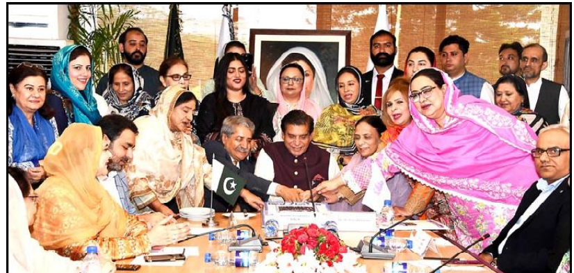
ISLAMABAD: Speaker National Assembly Raja Pervez Ashraf along with other PPP Parliamentarians cutting cake to celebrate 70th Birthday of Shaheed Mohtarma Benazir Bhutto in WPC.

gur well for the region. We hope that nothing would go wrong for the region and Pakistan," she opined. About ties with the EU, she said the GSP Plus status only could not define Pakistan's relations with them as their bilateral engagements were wider and broader at all levels, including the business contacts, institutional linkages, IT sector growth etc. She said the GSP Plus not only benefited Pakistan, but also enhanced the EU's trade with Pakistan, adding Pakistan and the EU countries were engaged at different multilateral fora.