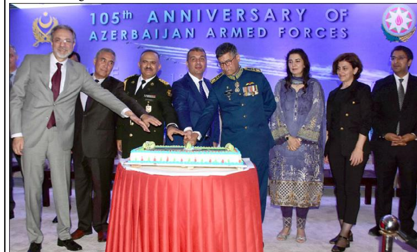
ISLAMABAD: Air Marshal Irfan Ahmed, Ambassador of the Republic of Azerbaijan Khazar Farhadov, Defense Attache Colonel Mehman Novruzov are cutting the cake along with others, on the occasion of the 105th Anniversary of the Azerbaijan Armed Forces, at Marriot Hotel in Federal Capital.

The Prime Minister's Laptop Scheme 2022-23 is aimed at providing students with modern technological resources, allowing them to enhance their educational experience and explore new avenues of knowledge. By equipping students with laptops, the scheme seeks to bridge the digital divide and empower young minds to actively participate in the digital age.