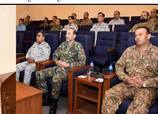
ISLAMABAD: Chief of the Naval Staff, Admiral Muhammad Amjad Khan Niazi addressing National Security & War Course members at National Defence University (NDU)

Soon PML-N will hold big gathering in London. The majority of PML-N leaders are in favor of landing by Nawaz Sharif in Lahore. The PML-N workers from all over the country will be given task to reach Lahore.