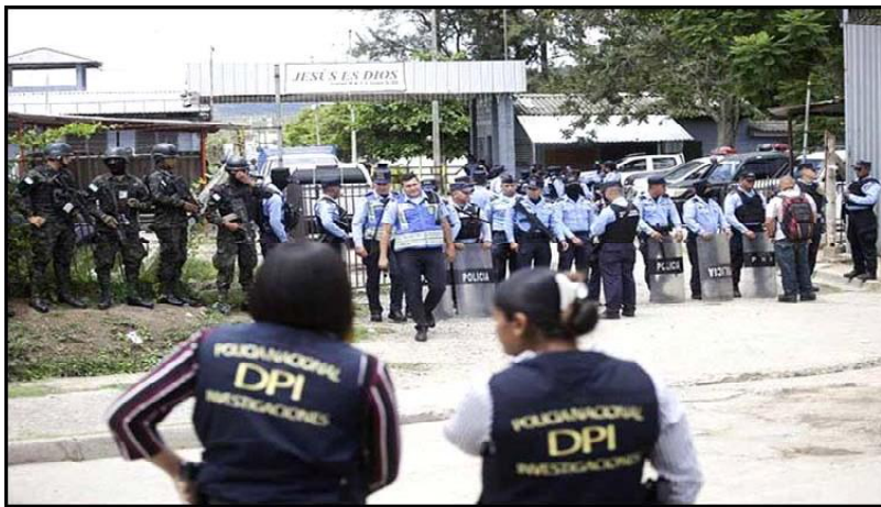
A brawl broke out at the prison between members of rival gangs Barrio 18 and the Mara Salvatrucha.

Monitoring Desk BRUSSELS: European Union countries on Wednesday agreed on a new package of sanctions against Russia for its war against Ukraine aimed at countering sanctions circumvention through third countries and businesses. The EU had previously imposed 10 rounds of sanctions on Russia since President Vladimir Putin ordered his forces into Ukraine on Feb. 24, 2022. Banks, companies and markets have been hit — even parts of the sensitive energy sector. More than 1,000 officials are subject to asset freezes and travel bans. Much work in the latest batch of sanctions has involved closing loopholes so that goods vital to Putin's war effort don't get through via nations that trade with the EU and have maintained a business-as-usual relationship with Moscow. European Commission President Ursula von der Leyen, the head of the EU's executive arm, said the new package will "deal a further blow to Putin's war machine with tightened export restrictions."