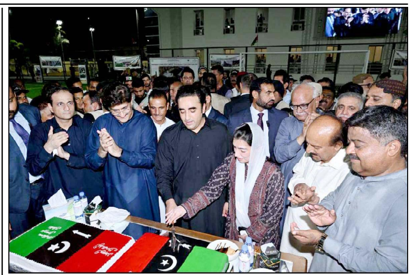
KARACHI: Bilawal Bhutto Zardari, Foreign Minister cutting cake to celebrate 70th birthday of Shaheed Mohtarma Benazir Bhutto