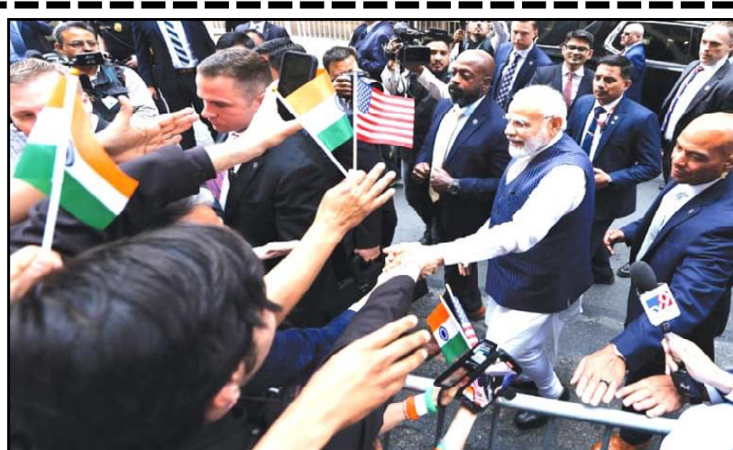
Indian PM Narendra Modi is greeted by supporters upon his arrival at a hotel in New York City.