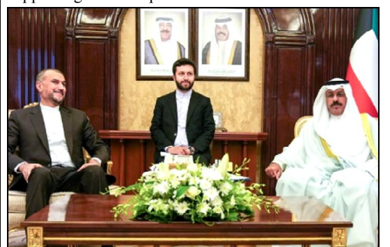
Kuwait's Prime Minister Sheikh Ahmad Nawaf al-Ahmad al-Sabah meeting with Iran's Foreign Minister Hossein Amir-Abdollahian, in Kuwait City.

Monitoring Desk SPAIN: More than 30 migrants were feared dead after a dinghy headed for Spain's Canary Islands sank on Wednesday, two migration-focused organisations said on Wednesday. Walking Borders and Alarm Phone said the dinghy was originally carrying 59 people. Helena Maleno, head of Spain's Walking Borders migrants charity, said in a tweet that 39 people had drowned, without giving further details, while Alarm Phone, which operates a trans-European network supporting rescue operations, said 35 people were missing. Earlier on Wednesday, Alarm Phone reported the boat was taking on water and three passengers were dead, adding: "We demand immediate rescue, do not let them down!" Neither Spain's coastguard nor the Moroccan authorities would confirm how many people had been on board the vessel or how many might be missing. A Spanish coastguard source told Reuters that an operation carried out by Morocco some 88 miles to the southeast of Gran Canaria island rescued 24 people.