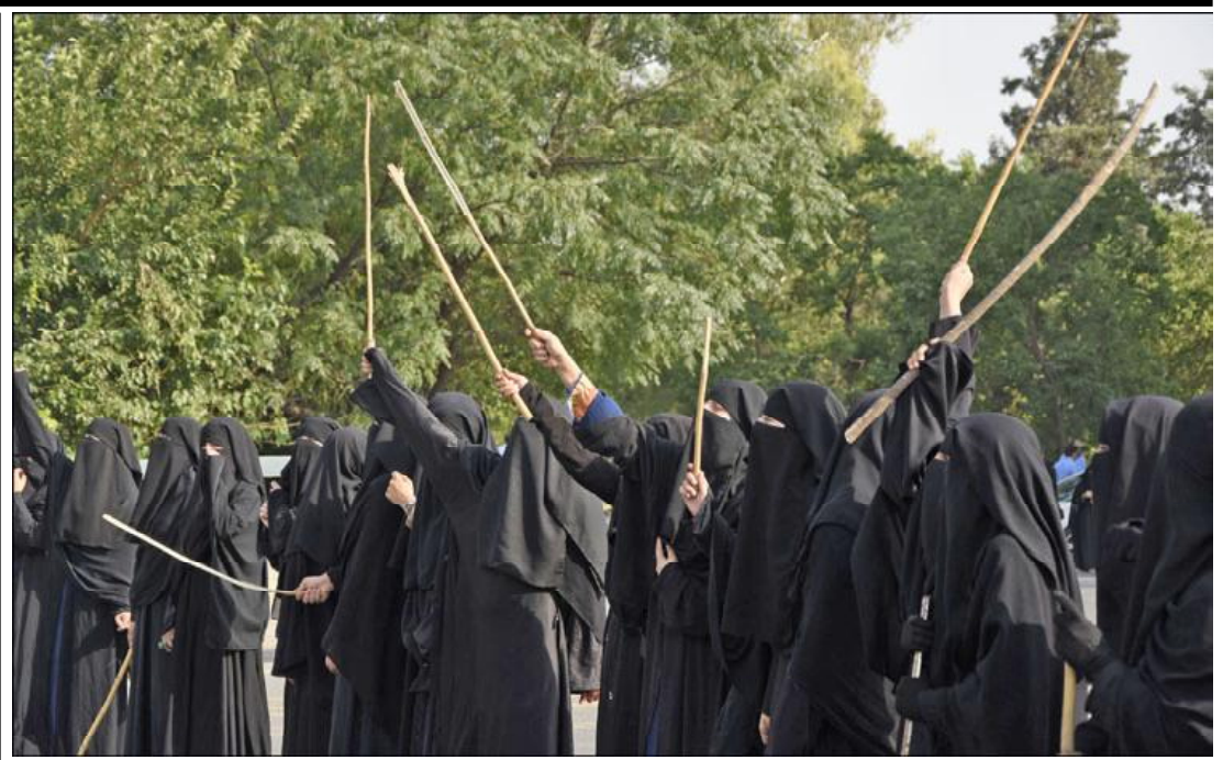
ISLAMABAD: Students of Jamia Hafsa shouting slogans during protest in favor of their demands at Blue area in the Federal Capital.