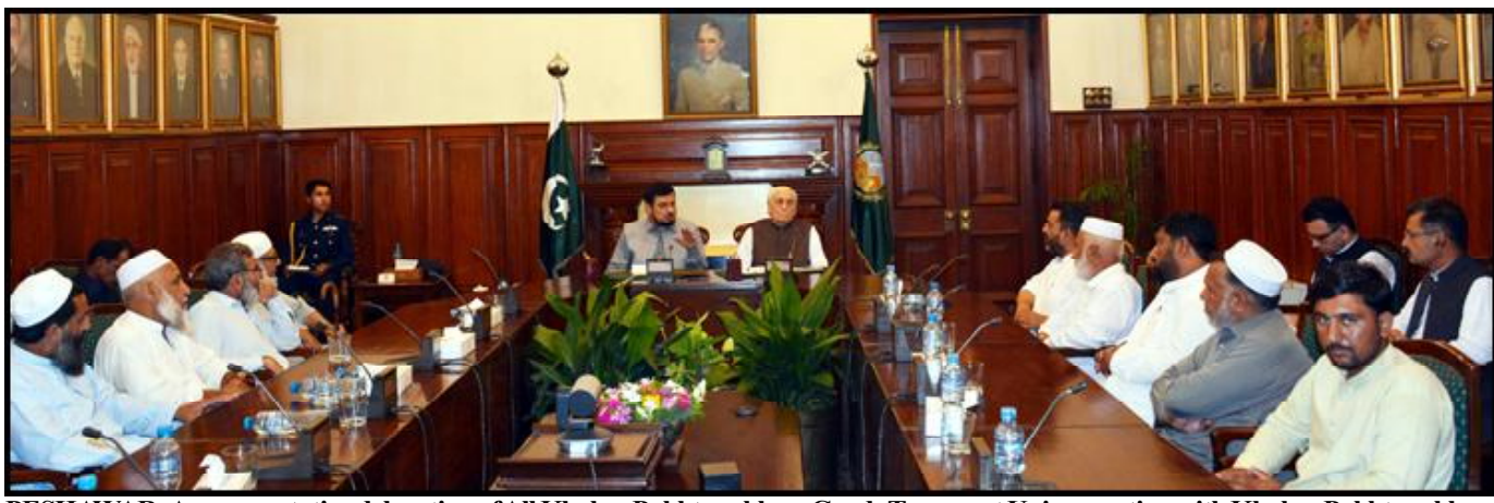
PESHAWAR: A representative delegation of All Khyber Pakhtoonkwa Goods Transport Union meeting with Khyber Pakhtoonkwa Governor Haji Ghulam Ali and Chief Minister Muhammad Azam Khan.