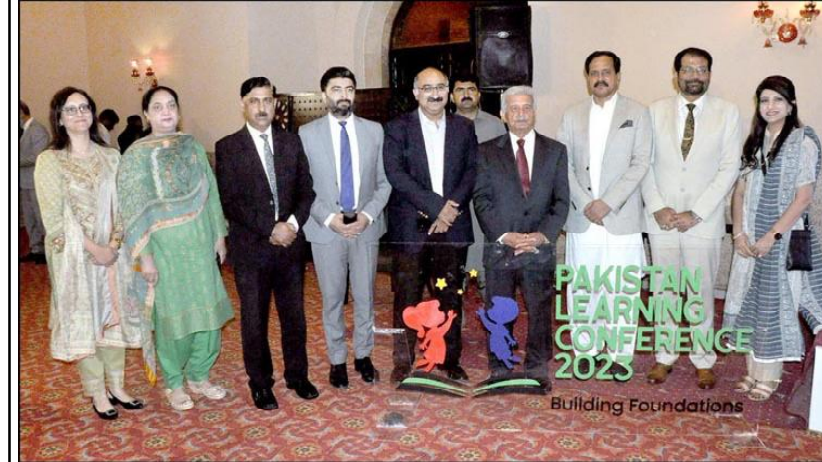
ISLAMABAD: Federal Minister for Education and Professional Training, Rana Tanveer Hussain in a group photo during the Pakistan Learning Conference organised by the Federal Ministry of FE&PT.

The government set the task of creating an army of 25 thousand people. On August 1, 1918, the Ministry of Defense of Azerbaijan was established.