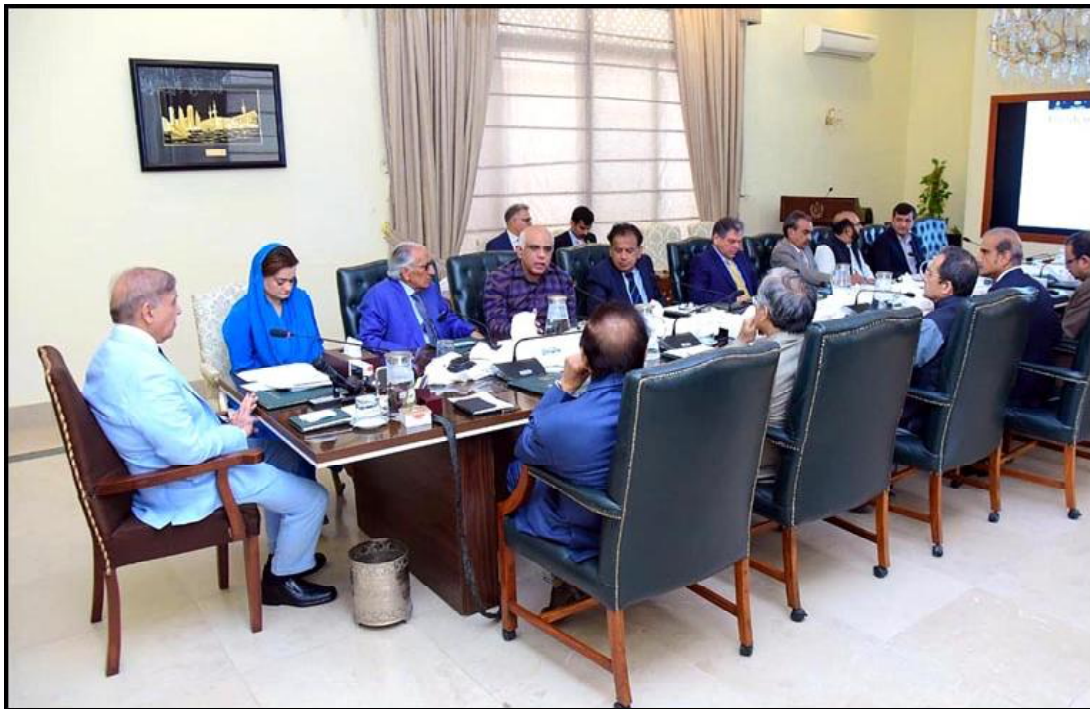
ISLAMABAD: Prime Minister Muhammad Shehbaz Sharif chairing a meeting regarding human smuggling and the recent capsizing of a boat in the Mediterranean near Greece.

Vol. XIII No. 196 Reg. mails-B / ID-445 Thursday June 22, 2023, Zil Hajj 03, 1444 A.H. Ph: 2158688, 2158997 Pages 4: Rs. 12