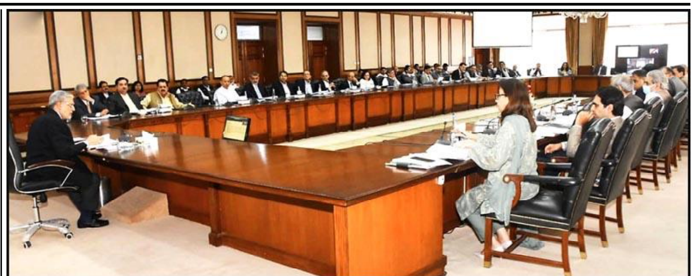
ISLAMABAD: Federal Minister for Finance and Revenue Senator Mohammad Ishaq Dar chaired the meeting of the Economic Coordination Committee (ECC) of the Cabinet.

The price of 10 grams of 24 karat gold also decreased by Rs.1,543 to Rs.187,500 from Rs.189,043 whereas the price of 10 grams 22 karat gold went down to Rs.171,875.