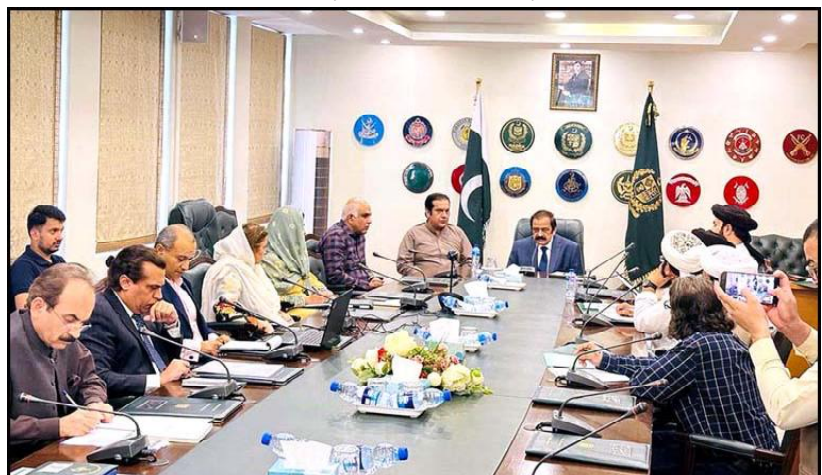
ISLAMABAD: Interior Minister Rana Sanaullah Khan chairing a meeting with Tehreek-e-Labaik Pakistan. Minister of State for Interior Abdul Rehman Kanju is also present on the occasion.

Talha expressed his utmost desire for the Memorandum of Understanding