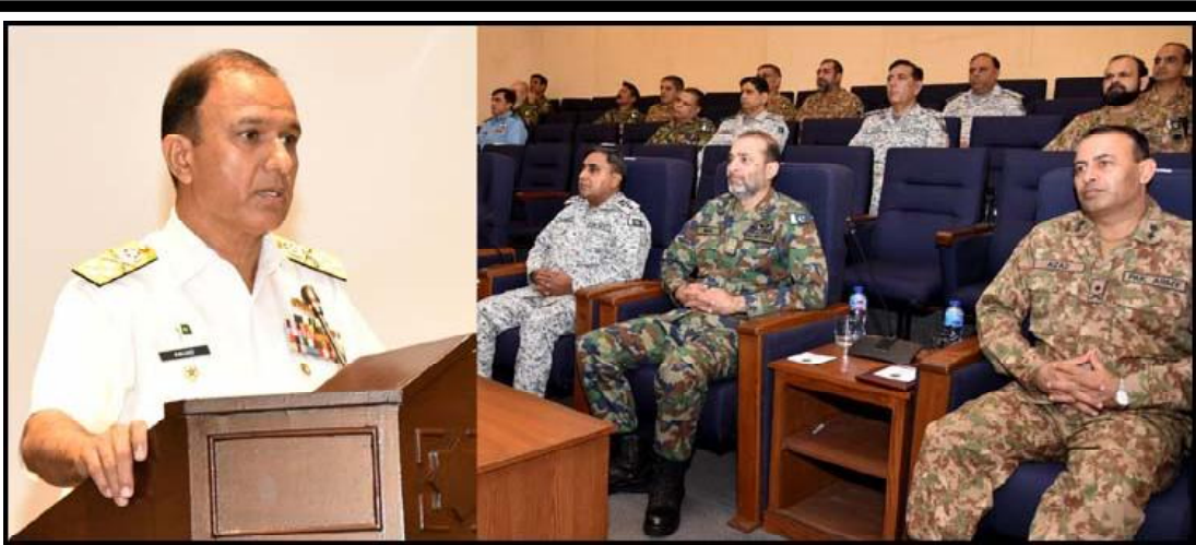
QUETTA: A group photo of participants of one day training workshop organized by Pakistan Engineering Council (PEC) Balochistan