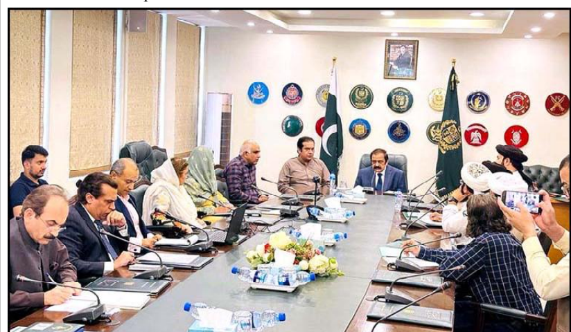
ISLAMABAD: Interior Minister Rana Sanaulah Khan chairing a meeting with Tehreek Labaik Pakistan. Minister of State for Interior Abdul Rehman Kanju is also present on the occasion.