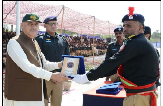
QUETTA: Governor Balochistan Malik Abdul Wali Khan Kakar giving away shield to Constable Nabi Bakhs Kurd who got first position 97th Passing Out Parade at Police Training College