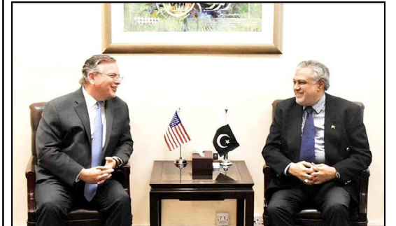
ISLAMABAD: Mr. Donald Blome, Ambassador of the United States of America to Pakistan called on Federal Minister for Finance and Revenue Senator Mohammad Ishaq Dar

ISLAMABAD (APP): Federal Minister for Finance and Revenue, Senator Mohammad Ishaq Dar said here on Wednesday that the government was committed to complete the International Monetary Fund (IMF) programme. During a meeting with Ambassador of the United States of America to Pakistan, Donald Blome who called on the minister, the minister informed him about the progress on the on-going talks with IMF, according to press statement issued by finance ministry. He said Pakistan values the deep rooted historic and durable bilateral relations with the United States on economic and trade fronts. Dar shared the economic policies and priorities of the government to address the challenging economic environment and set the economy on the path to stability and growth. He informed the US Ambassador about the government's budgetary measures to reduce the fiscal gap in order to meet its national as well as international financial obligations. The two sides also exchanged views about areas of common interest and how the existing bilateral relations between the two countries can be enhanced further.