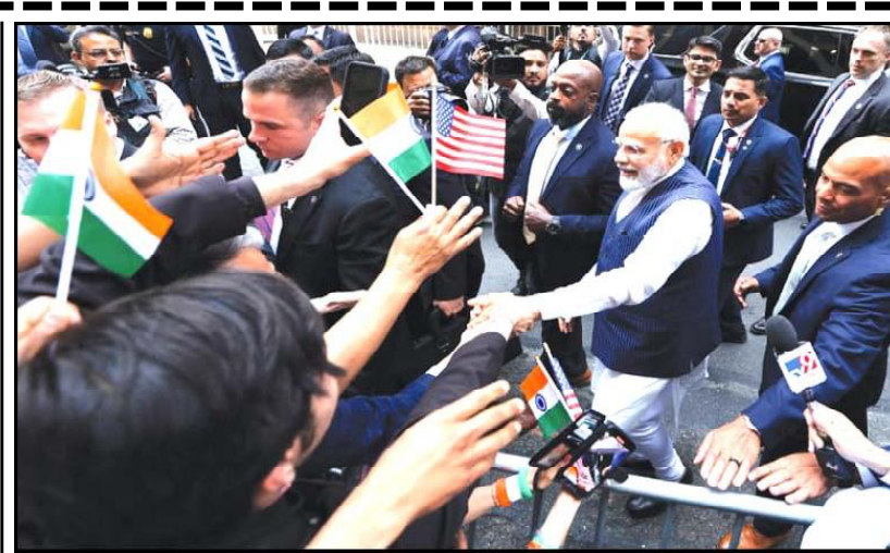
Indian PM Narendra Modi is greeted by supporters upon his arrival at a hotel in New York City.

"Ultimately, the question of where politics and the question of democratic institutions go in India is going to be determined within India by Indians. It's not going to be determined by the United States," Sullivan said. Modi has been to the United States five times since becoming prime minister in 2014, but the trip will be his first with the full diplomatic status of a state visit, despite concerns over what is seen as a deteriorating human rights situation under his Hindu nationalist Bharatiya Janata Party.