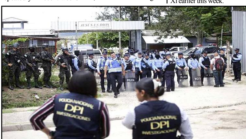
A brawl broke out at the prison between members of rival gangs Barrio 18 and the Mara Salvatrucha.

1,000 officials are subject to asset freezes and travel bans. Much work in the latest batch of sanctions has involved closing loopholes so that goods vital to Putin's war effort don't get through via nations that trade with the EU and have maintained a business-as-usual relationship with Moscow. European Commission President Ursula von der Leyen, the head of the EU's executive arm, said the new package will "deal a further blow to Putin's war machine with tightened export restrictions."