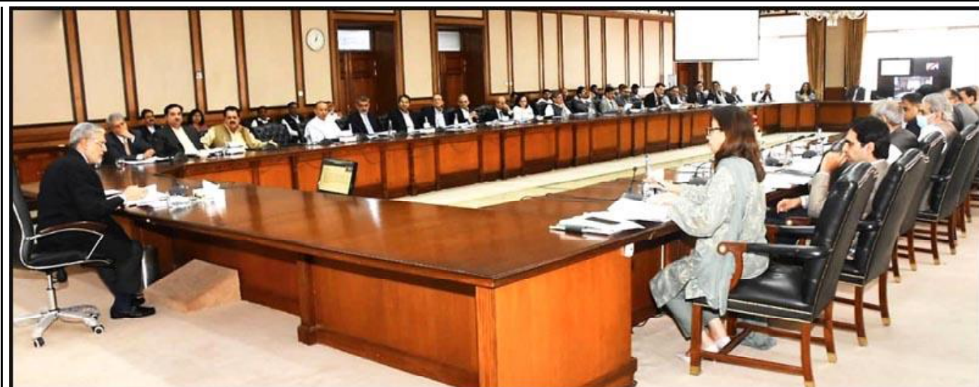
ISLAMABAD: Federal Minister for Finance and Revenue Senator Mohammad Ishaq Dar chaired the meeting of the Economic Coordination Committee (ECC) of the Cabinet.

The price of 10 grams of 24 karat gold also decreased by Rs.1,543 to Rs.187,500 from Rs.189,043 whereas the price of 10 grams 22 karat gold went down to Rs.171,875.