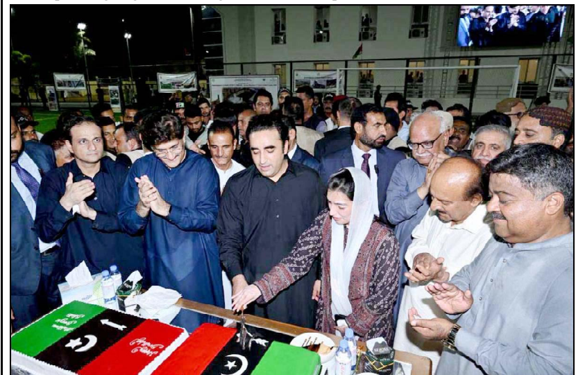
KARACHI: Bilawal Bhutto Zardari, Foreign Minister cutting cake to celebrate 70th birthday of Shaheed Mohtarma Benazir Bhutto