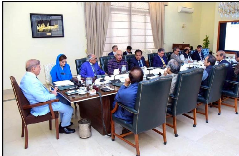
ISLAMABAD: Prime Minister Muhammad Shehbaz Sharif chairing a meeting regarding human smuggling and the recent capsizing of a boat in the Mediterranean near Greece.

Lahore and Radio Pakistan. Innocent people lost their lives and riots left a trail of destruction. The government launched a hunt for the culprits in PTI. As soon as the decision to try rioters in military court, PTI moved the Supreme Court (SC) against it, calling the decision a 'clear violation' of the constitutional guarantees of due process and fair trial. "Such trials are highly deprecated internationally and widely considered as falling short of providing fair trial," the petition stated. It stated, "They constitute a violation of Pakistan's obligations under the International Covenant on Civil and Political Rights (ICCPR) which has been ratified by the country." It added, "Trial of thousands of workers of a political party (or a political leader) through such courts is unheard of in the history of this country."