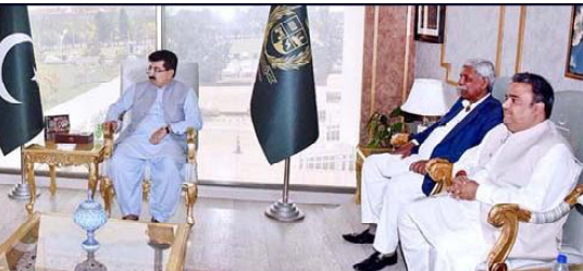
ISLAMABAD: Prime Minister Muhammad Shehbaz Sharif being briefed regarding the upgradation and rehabilitation project of Sikander e Azam Road.

ISLAMABAD (APP): President Dr Arif Alvi on Tuesday gave his assent to the Trained Paramedical Staff Facility Bill, 2023. Under the Bill, the availability of trained paramedical staff to provide first aid to children in public and private schools of Islamabad had been made mandatory, a news release issued by the President House Press Wing said on Tuesday. All the private schools in Islamabad will