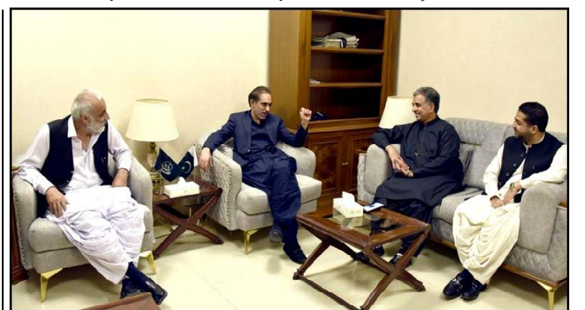
QUETTA: Provincial Ministers meeting with Balochistan Chief Minister Mir Abdul Qudus Bizenjo