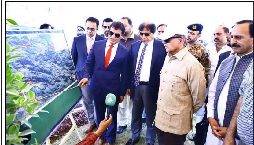
ISLAMABAD: Prime Minister Muhammad Shehbaz Sharif being briefed regarding the upgradation and rehabilitation project of Sikander e Azam Road.