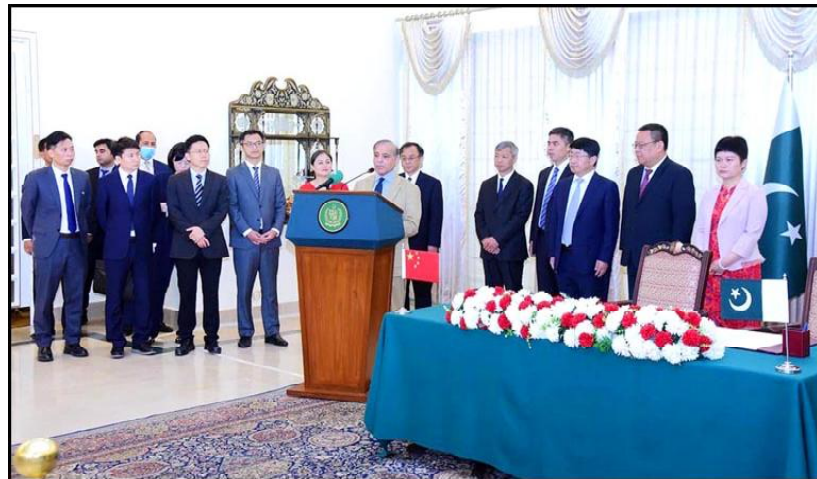
ISLAMABAD: Prime Minister Muhammad Shehbaz Sharif addressing a ceremony for signing of agreement for Unit 5 of Chashma Nuclear Power Plant (C-5).

Ph: 2841470/2841473 Vol: XVI No. 43, Zil Hajj 02, 1444 AH Wednesday June 21, 2023, Pages 08, Price Rs.15