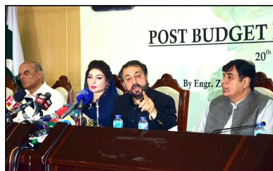
budget is Rs. 750 billion with deficit of Rs. 49 billion.