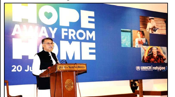
QUETTA: Governor Balochistan Malik Abdul Wali Khan Kakar addressing participants of a ceremony organized by UNHCR

He appreciated the endeavours of UNHCR for relief and rehabilitation of the Afghan refugees. He pointed out that the local population is also getting affected along with the refugees, therefore there is a dire need to take concrete steps by the international relief agencies for compensating the local settlements.