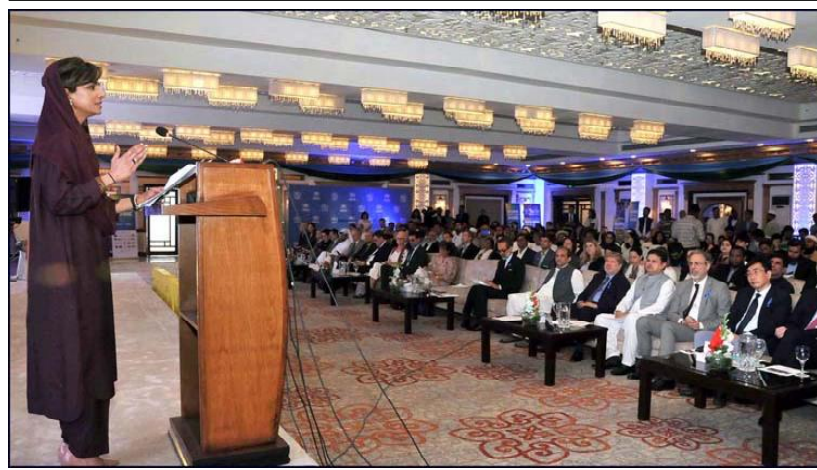
ISLAMABAD: Minister of State for Foreign Affairs, Ms. Hina Rabbani Khar addressing during World Refugee day organized by the office of the United Nations for Refugees at local hotel.