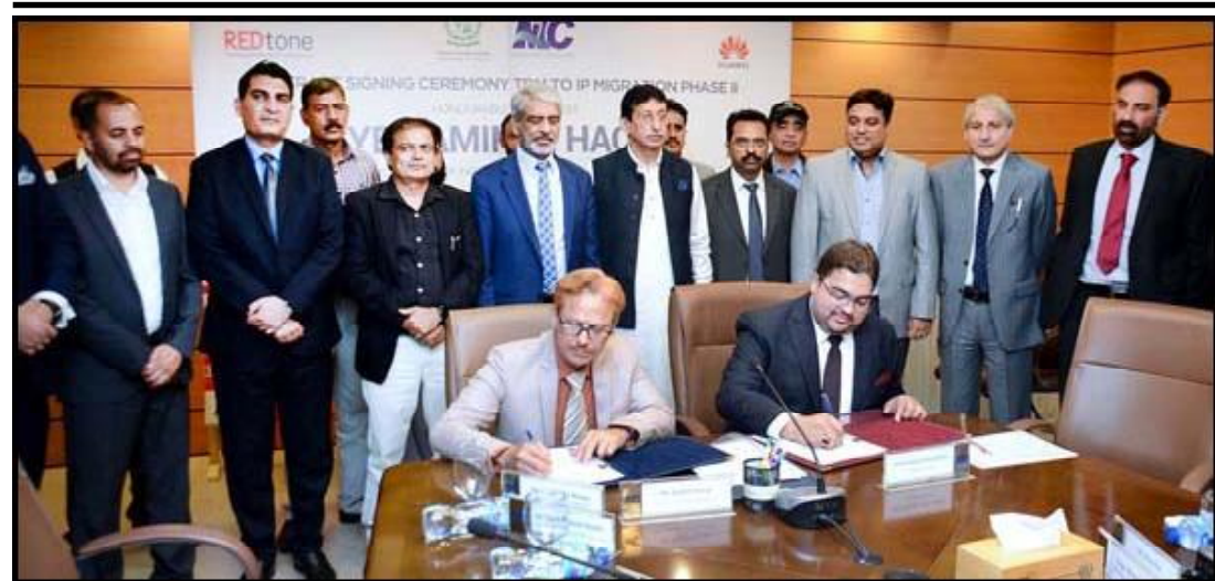
ISLAMABAD: Federal Minister for IT and Telecommunication Syed Amin Ul Haque witnessing contract signing for TDM to IP and Copper wire to Optical Fiber Cable Migration of National Telecommunication Corporation (NTC) Exchanges Phase 2.