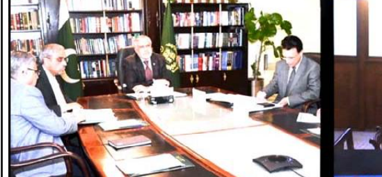
ISLAMABAD: Finance Minister Senator Mohammad Ishaq Dar held a virtual meeting with H.E. Andrew Mitchell Britain's Minister of State in the Foreign, Commonwealth & Development Office (FCDO).

In meeting Ishaq Dar informed British High