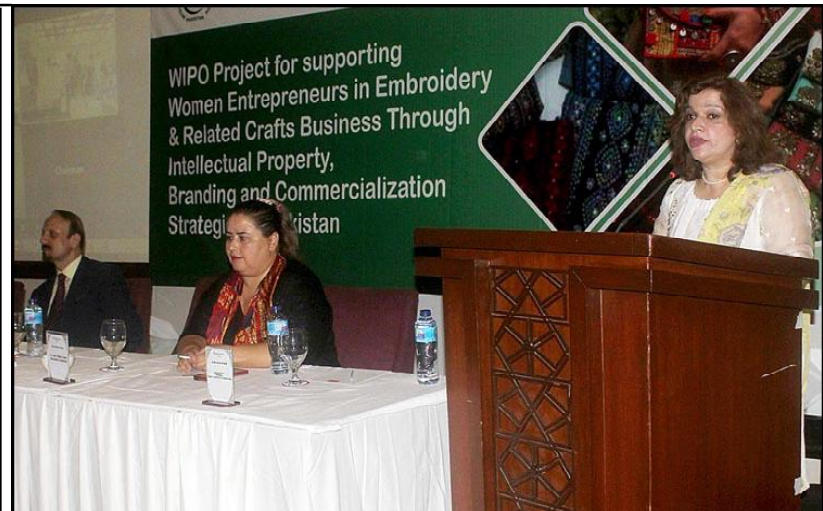
MULTAN: DG IPO Pakistan, Shazia Adnan addressing during a ceremony on Supporting Women Entrepreneurs in Embroidery and Related Carfts Business through IP, Branding, and Commercialization Strategies organized by the Intellectual Property Organization of Pakistan.

be eligible for duty-free access to the UK. This measure is expected to encourage the expansion of various sectors within the Pakistani economy, including textiles, agriculture, and manufacturing, Minister Qamar's remarked. Furthermore, Minister Qamar acknowledged that Pakistan's "Enhanced Preferences" status has been retained, providing the country with added advantages in terms of trade incentives and market access.