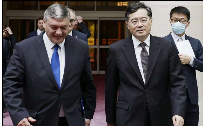
Russian Deputy Foreign Minister Andrei Rudenko and Chinese Foreign Minister Qin Gang in Beijing.