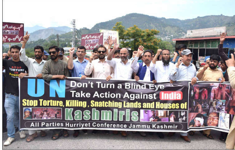
MUZAFFERABAD: Activists of All Parties Hurriyat Conference holds banner and shouting slogans during protest in the favor of their demands in the capital of AJK.

The measures have increased the upside risks to the inflation outlook, the MPC noted and viewed that additional tax measures were likely to contribute to inflation both directly and indirectly, while the relaxation in imports may exert pressures in the foreign exchange market. "The latter may result in higher-than-earlier anticipated exchange rate pass-through to domestic prices," it further added. The MPC termed the decision as necessary to keep real interest rate firmly in the positive territory on a forward-looking basis and hoped that it would help further anchor inflation expectations - which are already moderating over the last few months.