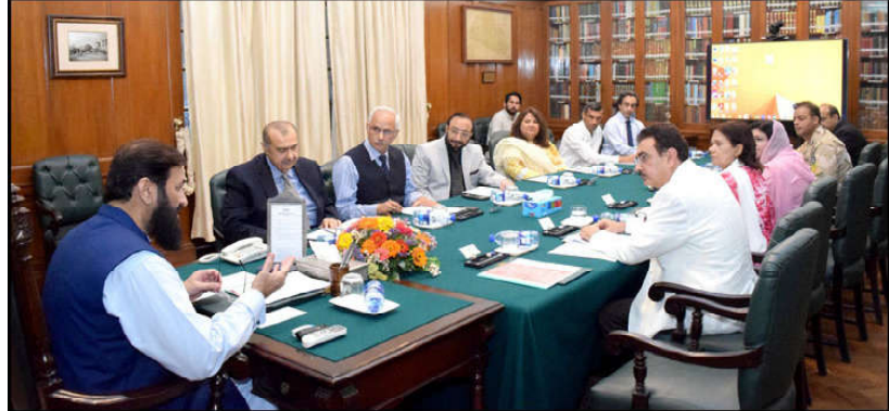
LAHORE: Governor Punjab/Chancellor Muhammad Balighur Rehman chairing a meeting of Consortium on Drug and Narcotics Control at Governor House