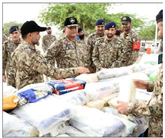
HUB: Pakistan Coast Guard Officials are showing huge apprehended drugs worth millions of rupees, during raid on local area of Kapkpar, during press conference held at PCG Headquarters.