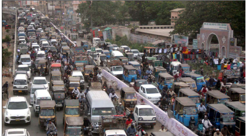
KARACHI: A large number of vehicle are stuck in the massive traffic jam at Pakistan Avenue in Provincial Capital.