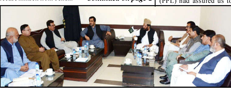
QUETTA: In light of ruling of Speaker Balochistan Assembly, QESCO Chief briefed MPAs regarding load shedding