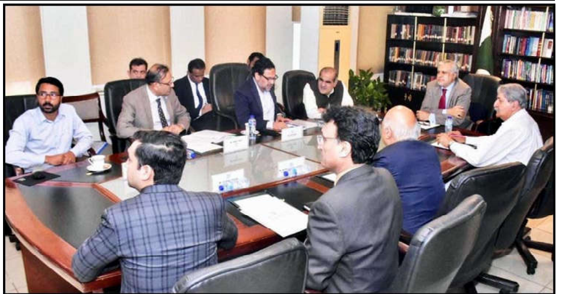
Federal Minister for Finance and Revenue, Senator Mohammad Ishaq Dar chaired a meeting of the Steering Committee to oversee the outsourcing of airports' operations, at Finance Division in Islamabad

Kashmiris are determined to see their freedom movement to its logical conclusion. The prime minister while condemning the brutal repression of Kashmiris at the hands of the Indian occupation forces, said that IOJK had been turned into an open-air prison where Kashmiris were forced to live under the shadows of guns. The Kashmiri leadership, he said, has been booked under Draconian laws and thrown behind bars.