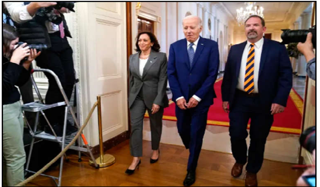
President Joe Biden arrives in the East Room with Vice President Kamala Harris and Jeff Sessions for an event about high speed internet infrastructure at the White House.

noted, virtually the entire military, economic, information machine of the West is directed against us," he said. Putin said on Saturday that the rebellion by the Wagner mercenary force had threatened Russia's very existence under threat and vowed to crush it. However, he has not publicly commented since then on the dramatic events or on the deal brokered by Belarusian President Alexander Lukashenko that defused the crisis.