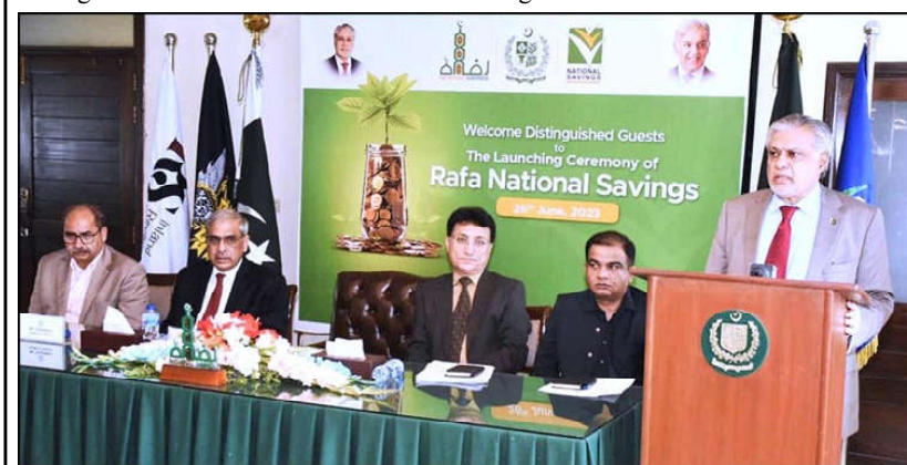
ISLAMABAD: Federal Minister for Finance and Revenue Senator Mohammad Ishaq Dar addresses the launching ceremony of Sarwa Islamic Savings Products by National Savings at Finance Division.