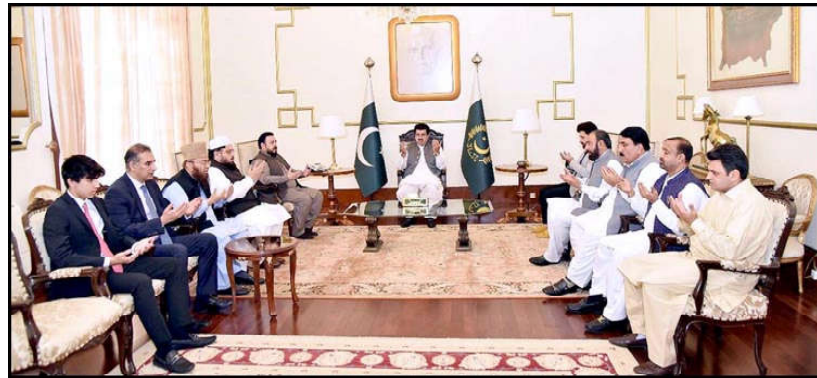
ISLAMABAD: Fateha is being offered over the sad demise of the aunt of the Acting President, Muhammad Sadiq Sanjrani, at Aiwan-e-Sadr.