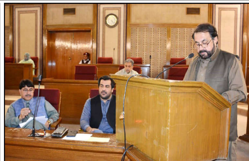
QUETTA: Provincial Finance Minister Zamrak Khan Achakzai presenting budget proposal for FY 2023-24 in Balochistan Assembly