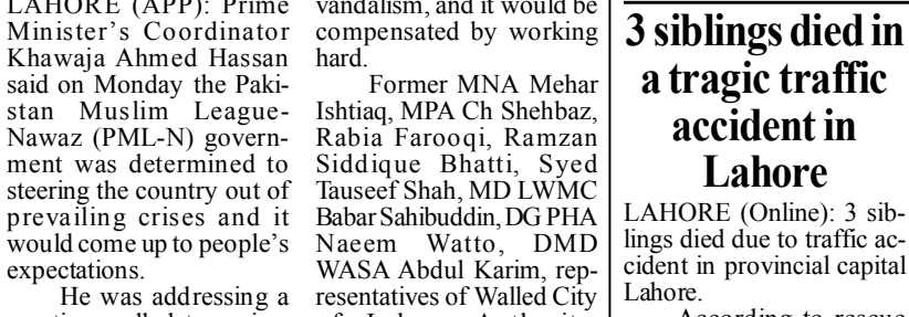
LAHORE (Online): 3 siblings died due to traffic accident in provincial capital Lahore.

The beneficiary women present there said they were grateful to BISP and Minister of State Faisal Karim Kundi. "We are being paid in a good environment near our homes," they added.