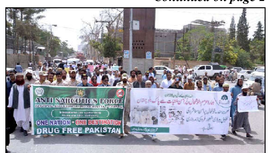
QUETTA: Rally taken out to mark International Narcotics Day under Balochistan Govt and ANF.