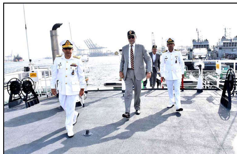
KARACHI: The Federal Minister for Planning, Development & Reform, Ahsan Iqbal visiting Karachi Shipyard.