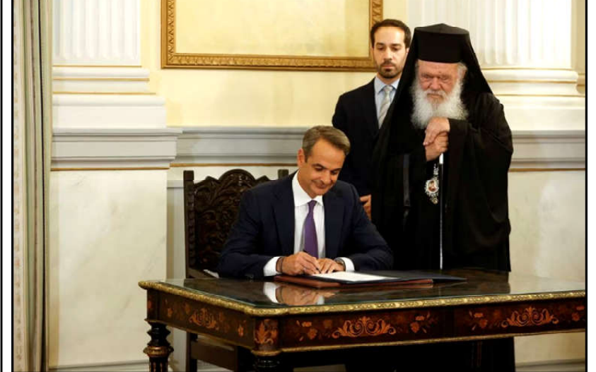
Leader of New Democracy conservative party Kyriakos Mitsotakis attends the swearing-in ceremony, to become the new Greek Prime Minister, following a general election, at the Presidential Palace, in Athens, Greece.