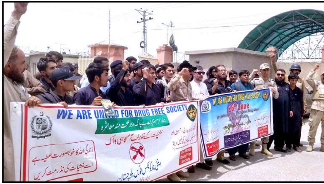
CHAMAN: A large number of people participating in ANF Rally on World Anti Narcotics Day.