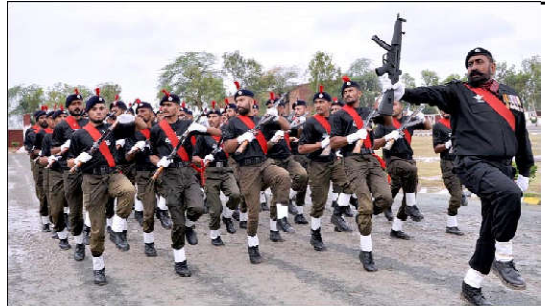
SARGODHA: Police recruiters are showing their skills during 92nd Police Passing out parade at Police Training School.

The chief guest expressed full confidence in the newly established latest security system and appreciated the KP police efforts in this regard.