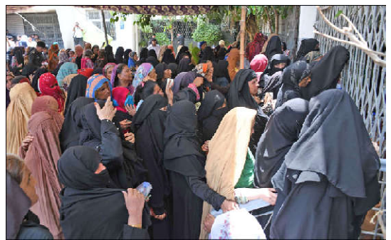
KARACHI: Woman lineup at Benazir Income Support Center after Stampede broke out during the distribution of funds of the Benazir Income Support Programme (BISP) among deserving women as several women were injured in the stampede at Benazir Income Support Center in Provincial Capital.

participated in the meeting and informed Deputy Commissioner Loralai about the recent monsoon rains. A detailed briefing was given by Deputy Commissioner Loralai Suban Salem Dashti while addressing the meeting said. "All departmental officers and their supporting staff are on alert, the machinery of all departments is on standby in case of any emergency during the rains, all government rest houses, government buildings have been reserved, the control room of police department and Levies have been restored."