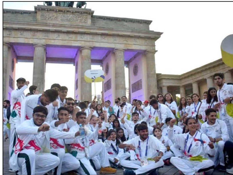
BERLIN: Participants of the 16th Special Olympic World Games Pakistan athletes in a group photo after the closing ceremony at Brandenburg Gate.