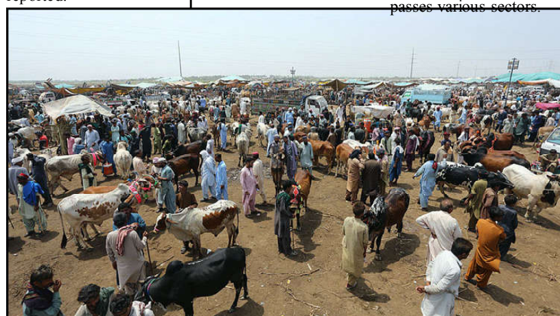
HYDERABAD: Vendors selling sacrificial animals at Animal Market Hathri Bypass in connection with upcoming Eid ul Azha.

ISLAMABAD (APP): The per tola price of 24 karat gold increased by Rs 800 and was sold at Rs 215,300 on Monday against its sale at Rs.214,500 the previous day. The price of 10 grams of 24 karat gold also increased by Rs .685 to Rs 184,585 from Rs 186,043 whereas the price of 10 grams 22 karat gold went up to Rs 169,203 from Rs 168,574, All Sindh Sarafa Jewellers Association reported. The price of per tola silver increased by Rs.50 to Rs2,550 whereas that of ten gram went up by Rs.42.87 to Rs2,186.21. The price of gold in the international market increased by $11 to $1931 from $1920, the association reported.