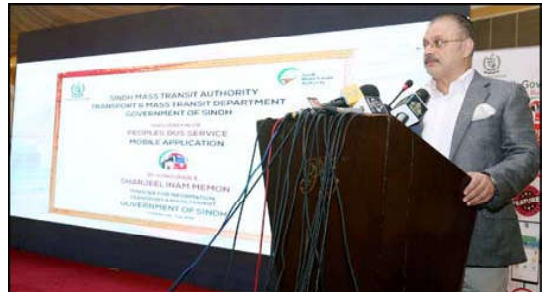
KARACHI: Sindh Minister of Information, Transport, and Mass Transit, Sharjeel Inam Memon addresses during inauguration ceremony of the Peoples Bus Service Mobile Application, held at local hotel in Karachi.

Implementation of an Intelligent Transport System to monitor and manage bus operations effectively.