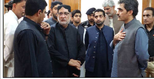
WADH: President Balochistan National Party, MNA Sardar Akhtar Jan Mengal receiving Home Minister Mir Ziaullah Lango upon arrival in Wadh