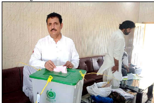
NASEERABAD: The ballot casting process is underway at polling station during Union Council Election held in Naserabad.