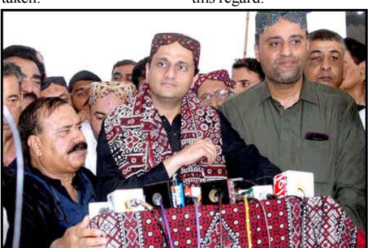
LARKANA: Newly elected Mayor of Karachi Murtaza Wahab along with Deputy Mayor Salman Abdullah Murad Baloch talking to media persons at Garhi Khuda Bakhsh.

He said that it is a big operation and millions of citizens sacrifice animals on Eid-ul-Azha. Mayor Karachi said that complaint centers will be set up in every district so that citizens could register their complaints. He said that along with Eid-ul-Azha, the staff of cleaning the drains is also going on because the monsoon season is about to start and the Meteorological Department has predicted that Karachi is likely to have more rains than the previous years, so we have to make arrangements in this regard.