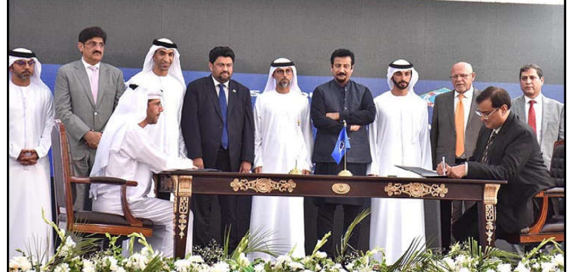
KARACHI: Federal Minister for Maritime Affairs Syed Faisal Ali Subzwari witnessing MoU Signing Ceremony between KPT & UAE during the inauguration ceremony of Karachi Gateway Terminal Limited.

He said funds amounting to $16.3 billion were required to execute the physical work like repair of damaged houses and infrastructure, under the '4RF' strategy i.e. resilient recovery, rehabilitation and reconstruction. The estimate was for the projects to be completed in 4 to 5 years, he added.