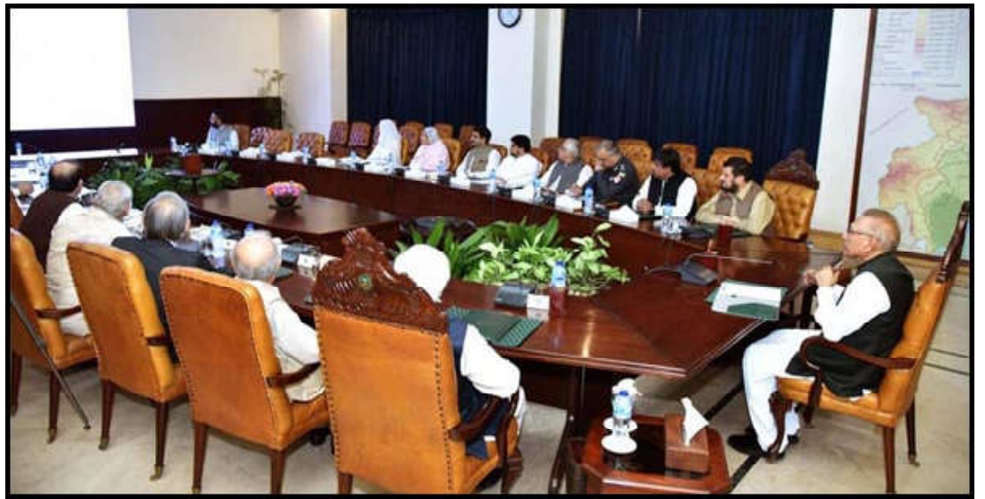
PESHAWAR: President Dr. Arif Alvi chairing a meeting on the Higher Education Sector of Khyber Pakhtunkhwa at Governor House.

were also approved. Additionally, the extension of contracts for 605 employees of the Directorate General of Literacy & Non-Formal Basic Education was approved. In terms of vehicle registration fees, a one percent reduction was approved for vehicles ranging from 1500cc to 2000cc in Punjab, aligning them with the fees in Islamabad. Regarding mining, the cabinet approved the revision of royalty rates for limestone and argillaceous clay in large-scale mining operations.