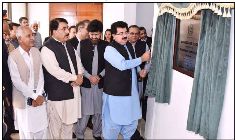
ISLAMABAD: Chairman Senate, Muhammad Sadiq Sanjrani inaugurating the newly established broadcasting room in the Senate at Parliament House.

the dissemination of legislative proceedings and other important Senate activities to the masses. By leveraging state-of-the-art broadcasting technologies, this system will enable seamless transmission of live sessions, and other significant events to the public. The Digital Broadcasting System reinforces the Senate's commitment to transparency, accountability, and inclusivity by ensuring wider access to parliamentary affairs and facilitating citizens' engagement with their elected representatives. The inauguration of the Data Center and Digital Broadcasting Center marks a significant leap towards embracing digital transformation and trends. These state-of-the-art facilities will not only enhance the efficiency of the Senate's internal operations, but also facilitate greater public engagement and transparency. The Senate remains steadfast in its commitment to uphold democratic values, harnessing the technology, and serving the people of Pakistan with utmost dedication.