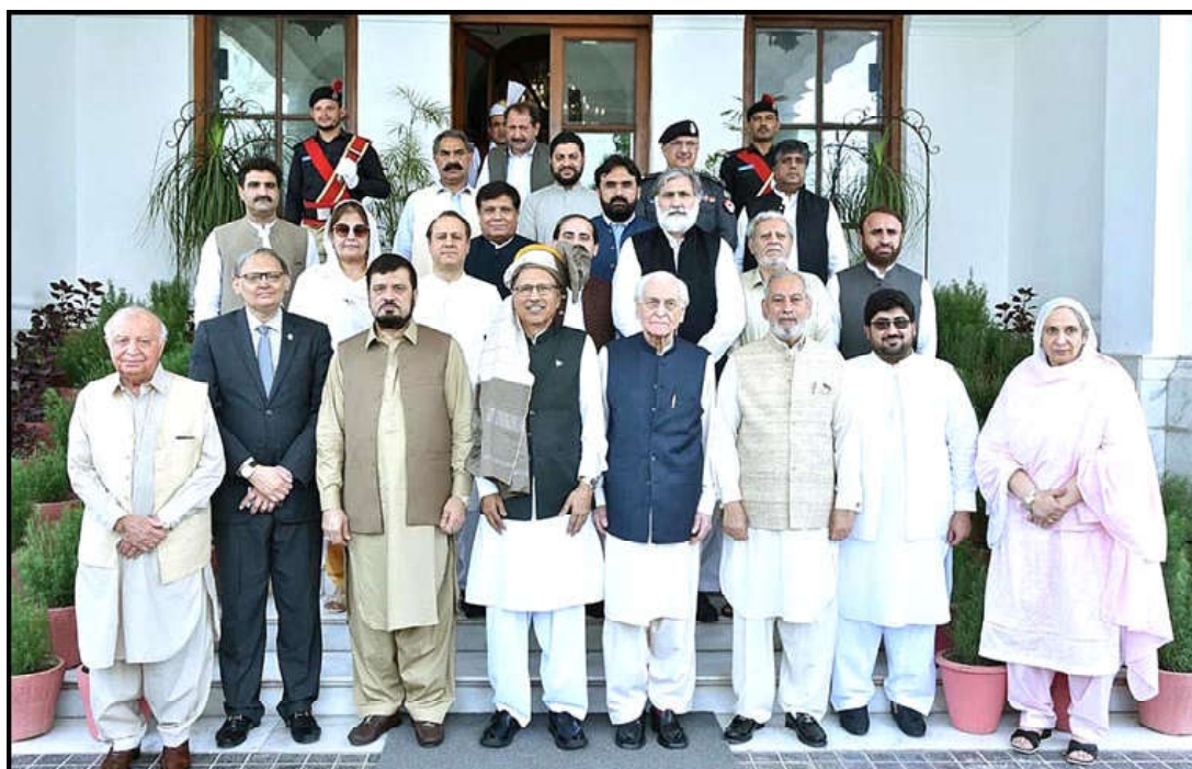
PESHAWAR: President Dr. Arif Alvi in a group photo with the Governor Khyber Pakhtunkhwa (KP), Haji Ghulam Ali, Caretaker Chief Minister KP, Muhammad Azam Khan, and members of the provincial cabinet, at Governor House.

The spokesperson said Pakistan would continue to extend political, diplomatic, and moral support to our Kashmiri brothers and sisters for the just and peaceful settlement of the Jammu and Kashmir dispute in accordance with the UN Security Council Resolutions.