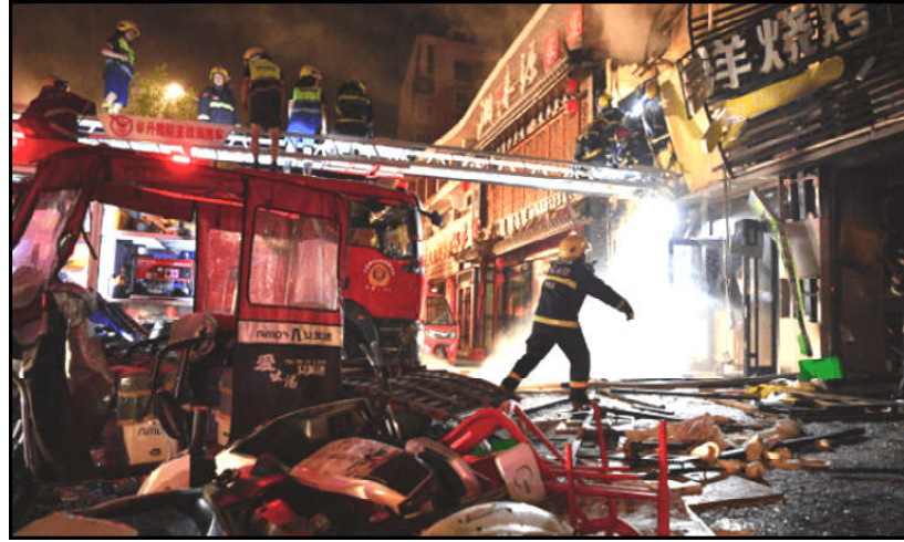
Firefighters put out fire after an explosion at a restaurant in Yinchuan, China killed at least 31 people, officials said.

But, Kavanaugh said, "In light of the treaty's text and history, we conclude that the treaty does not require the United States to take those affirmative steps."