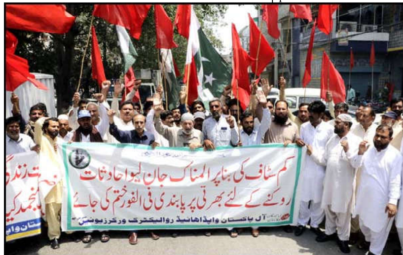
LAHORE: Members of All Pakistan Wapda Hydro Electric Workers Union are holding protest demonstration against massive unemployment, increasing price of daily use products and inflation price hiking, in Lahore.

Likewise, the exports of all other sports goods rose by 2.19 percent to US$ 91,196 million from US$ 89,239 million last year.