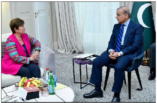
PARIS: Prime Minister Muhammad Shehbaz Sharif in a meeting with Ms. Kristalina Georgieva, Managing Director International Monetary Fund.

Addressing the ceremony, Governor Sindh said, "Karachi Gateway Terminal Limited will help modernizing the terminal with the induction of state-of-the-art facilities. He lauded the UAE's investment in key port operations would also help in stabilizing Pakistan's economy."