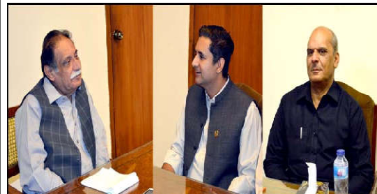
QUETTA: Secretary Information Muhammad Hamza Shaqqaat and DGPR Kamran Asad meeting with Speaker Balochistan Assembly Mir Jan Muhammad Khan Jamali

The Chief Minister said that the government is ready to play its full role for the peaceful settlement of the tribal conflict. "The tribal disputes are obstacles in the establishment of peace and the parties and the people of the region always suffer from tribal conflicts." Chief minister highlighted.