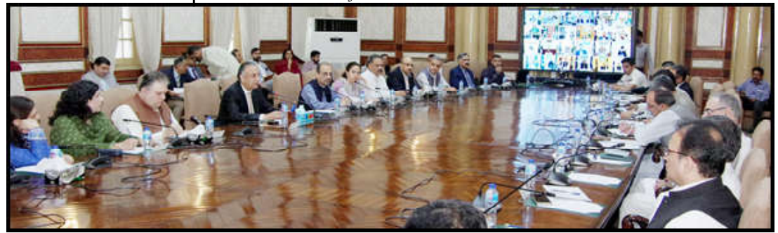
LAHORE: Chief Secretary Punjab presides over the Secretaries Conference at Civil Secretariat.

national and international organisations, development experts, researchers, SZABIST faculties and students. The SWOP urges controlling bodies to address demographic concerns and family planning must not be used as a means for achieving fertility targets but as a tool for empowering individuals particularly the women to enable them to choose if, when, and how many children they want to have. With an average annual growth rate of 2.41 percent in Sindh, the total current population is 56.3 million (2022), estimated to grow to 95.7 million by 2050, the report estimated adding that Pakistan will be among the eight countries to account for half of the projected global population growth by 2050, along with the Democratic Republic of the Congo, Egypt, Ethiopia, India, Nigeria, the Philippines and the USA.