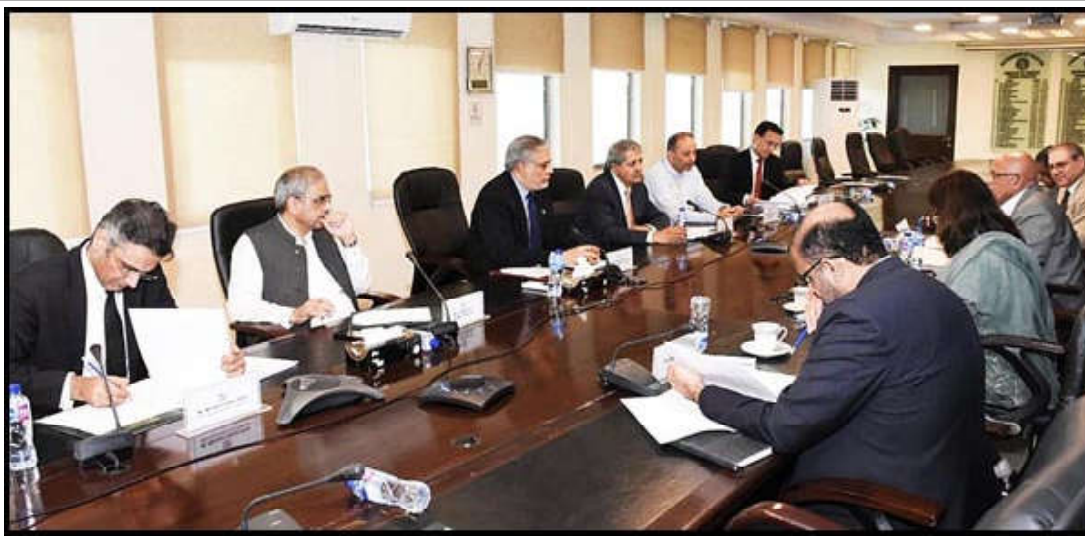
ISLAMABAD: Federal Minister for Finance and Revenue Senator Mohammad Ishaq Dar chairs the meeting of the Cabinet Committee on Inter-Governmental Commercial Transactions (CCoIGCT).

This occasion celebrates the signing of the sixth batch of the program in Pakistan. For this batch, the maximum number of slots for JDS participants in Pakistan is 17 seats for the Master's degree.