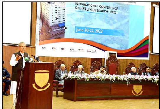
PESHAWAR: President Dr. Arif Alvi addressing the International Conference on Health Research organized by Rehman Medical Institute.

Shahbaz Sharif said he took the United Nations Secretary General to the flood affected areas where city after city was sunk. Thousands of women gave birth to children in the camps set up for the flood affectees, he recalled, adding in far flung areas, the government had to provide food, medicine, water and education at temporary camps.