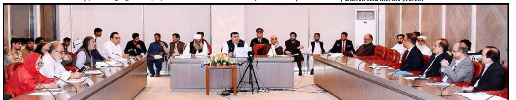
ISLAMABAD: Deputy Speaker National Assembly Zahid Akram Durrani chairing meeting of the Special Committee on Balochistan at Parliament House.

Under the plan to initiate a vocational training programme, youngsters would be trained in more than 18 trades in a short period of three years in order to produce quality technical human resources.