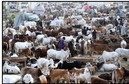
KARACHI: Sacrificial animals brought for sale ahead of Eid-ul-Azha at Super Highway Cattle Market.

This could have positive effects on the economy by increasing the availability of food and reducing the trade deficit, he added.