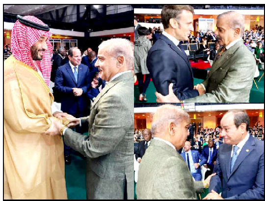
PARIS: Prime Minister Muhammad Shehbaz Sharif separately meeting with Crown Prince and Prime Minister of the Kingdom of Saudi Arabia, President of France Emmanuel Macron and President of Egypt Abdel Fattah El-Sisi during New Global Financing Pact Summit