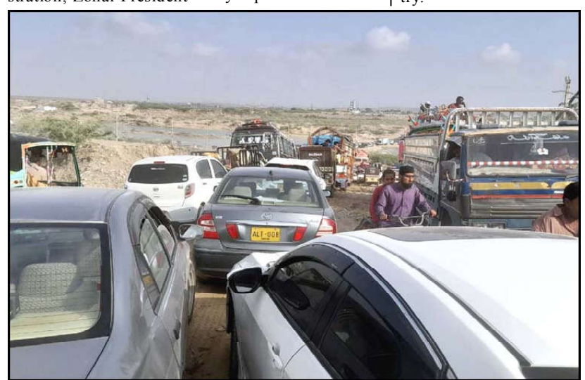
HUB: View of worst traffic jam on Hub River alternate route, showing the negligence of concerned authority in Hub.

They are supporting themselves and their children by taking loans. He is forced to take water from far away and use it for drinking at home, while hundreds of employees of TLA, who provide services daily, have been deprived of their salaries for six months now, they expressed.