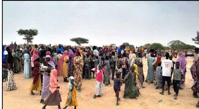
Fighting surges in Sudan's capital as three-day ceasefire expires

The war has devastated Yemen, already the Arab poorest country, and created one of the world's worst humanitarian disasters. More than 150,000 people, including fighters and civilians, have been killed. In recent months, Saudi and Houthi officials have repeatedly met for talks aimed at a negotiated settlement to the conflict.