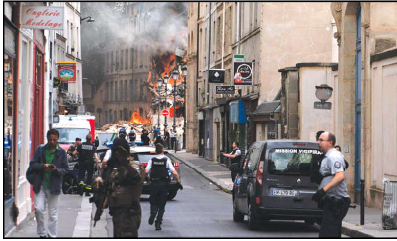
Smoke billows from the rubble of a building in Paris.

Shortly before the truce ended at 6 a.m. (0400 GMT) fighting was reported in all three of the cities that make up the wider capital around the confluence of the Nile: Khartoum, Bahri and Omdurman.