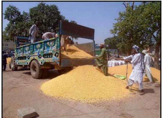
CHINIOT: Labourers busy in unloading maize from trolley at grain market.

Khurram Dasgir said the journey of development, which remained stopped for four years of Pakistan Tehreek-e-Insaf government, had restarted and it would continue after formation of the Pakistan Muslim League-Nawaz (PML-N) government for the next five years.