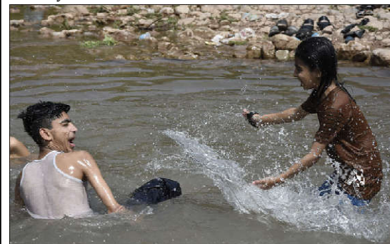
ISLAMABAD: Children are playing and enjoying bathing at Shadara picnic point during hot weather, in the Federal Capital.

ISLAMABAD (APP): Children are playing and enjoying bathing at Shadara picnic point during hot weather, in the Federal Capital.