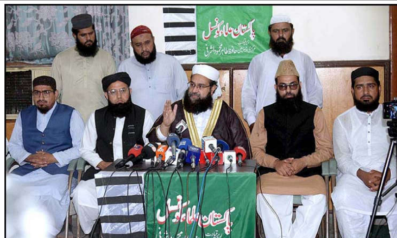
LAHORE: Special Assistant to the Prime Minister on Religious Harmony Maulana Tahir Ashrafi addressing a press conference at Begumpura.

get credit of these projects. "Today, we started work on Hyderabad-Sukkur Motorway," he said. The planners of the conspiracy have run away and the beneficiaries went missing from the scene, he said and added that the beneficiaries should have to face the nation as they halted the journey of development. He vowed that all the development projects initiated by the PDM government would be completed in stipulated time period. He paid tribute to the workers of his party, saying, they faced difficulties but always stood by their leadership. Earlier, JUI-F Chief Maulana Fazlur Rehman inaugurated rehabilitation work on two lanes 18-km long Qureshi Moor to Naivela road, two lane road from Muryali to Qureshi Moor and then to Ramak worth Rs 2.65 billion, two lane road from Mufti Mahmood Chowk to Qureshi Moor on Dera Bypass worth Rs 3 billion.