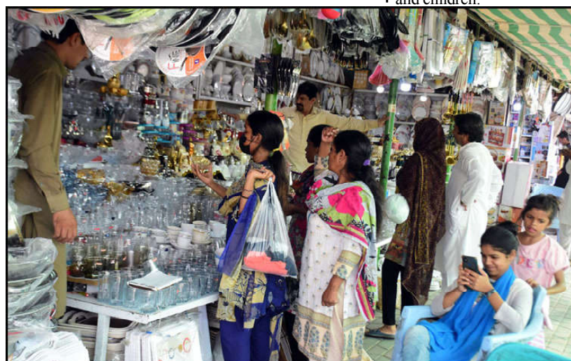
ISLAMABAD: Women are buying pots from venter at Weekly Sunday Market at Sector H-9 in Federal Capital.