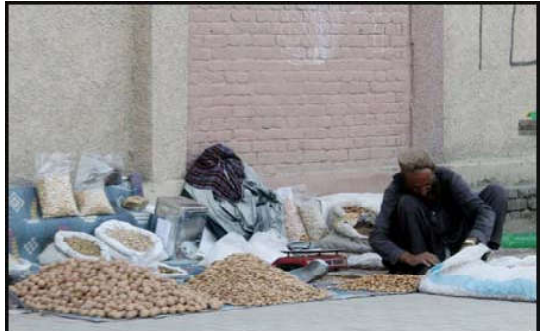
QUETTA: Vendor sells dry fruits to earn his livelihood for support his family, at a roadside stall located on Kelvin road in Quetta.

President FPCCI also suggested to allocating special space for SMEs in special economic zones, besides providing skilled and technical education. He urged the government to ensure the provision of special facilities and interest-free loans to promote SMEs in rural areas to curb migration toward the major cities.