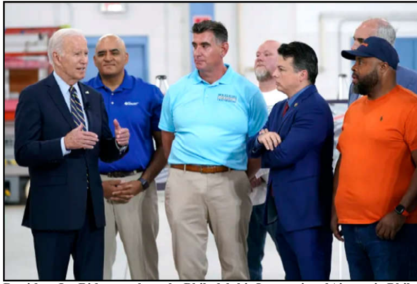
President Joe Biden speaks at the Philadelphia International Airport in Philadelphia after an aerial tour of the Interstate 95 highway collapse.

During his speech in St. Petersburg, Putin said Russia had destroyed tanks "including Leopards" at the front lines. "And if they are based abroad, but used in fighting we'll see how to hit them, and where we can hit those means that are used against us in fighting," Putin said. "This is a serious danger of further drawing NATO into this military conflict," he added. During his speech to the forum, Putin also suggested Russia's large number of nuclear weapons would "guarantee" its security — noting that Russia had more such weapons than NATO countries. Russia has a total stockpile of around 6,250 nuclear warheads as of January 2021, according to the Arms Control Association.