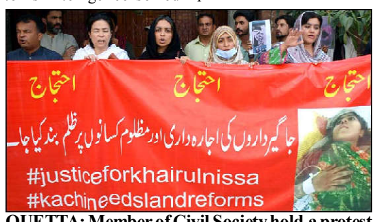
QUETTA: Member of Civil Society hold a protest in favour of their demands in front of Quetta Press Club.

Imran Khan. The minister claimed that Imran Khan looted the national kitty ruthlessly and caused irreparable damage to the country, adding that the PTI chief broke all records of obtaining the foreign loans. Rana Tanveer said Imran Khan dubbed others as 'dacoits and thieves', but his crony Farah Gogi looted the national wealth with great impunity and shifted it abroad. The minister said that Pakistanis posed confidence in the Pakistan Muslim League-Nawaz (PML-N) in 2013 when the coalition government took over the country through a no-confidence move against