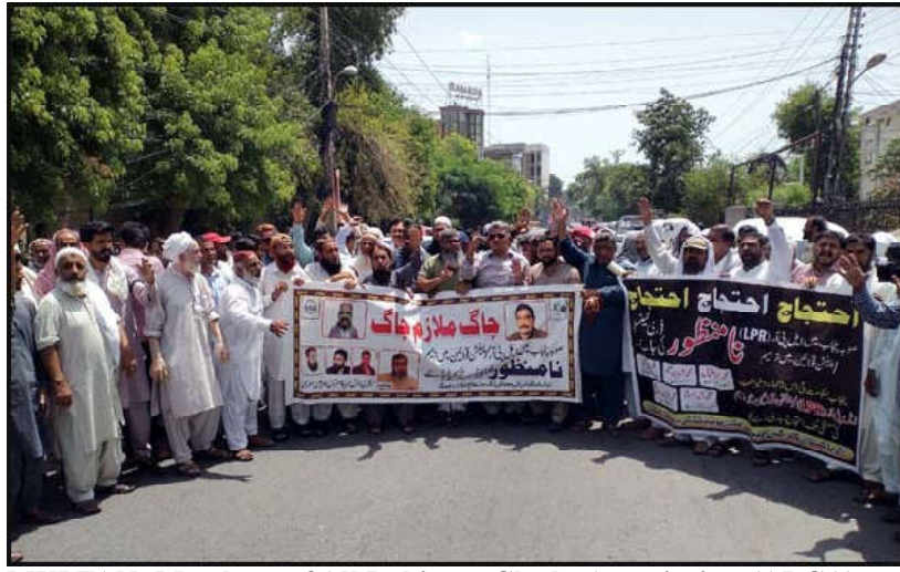
MULTAN: Members of All Pakistan Clerks Association (APCA) are holding protest demonstration for acceptance of their demands, held at Multan press club.

They informed the participants about modern research, proportionate use of fertilizers.