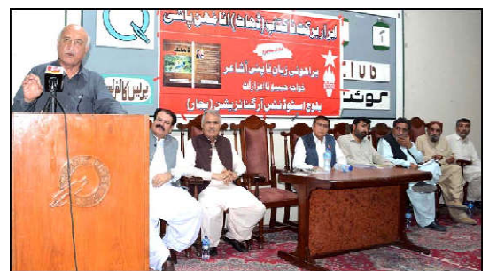
QUETTA: Former Chief Minister Balochistan Dr. Abdul Malik Baloch addressing during the book launching ceremony organized by Baloch Students Organization (PAJAR).

Planning minister said "inexperienced worker" was made the country's prime minister and that person had not planned a single project in four years stint in power.