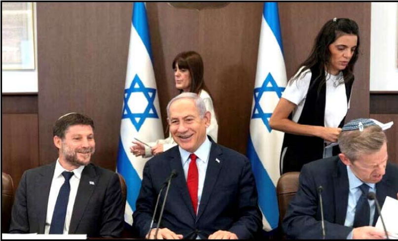
Israeli Prime Minister Benjamin Netanyahu, centre, and Finance Minister Bezalel Smotrich, left, attend a weekly cabinet meeting in the prime minister's office in Jerusalem.

of a handful that had voted for Republican Donald Trump in 2016 but flipped back to Democrats four years later. Until the rally, Biden's primary reelection campaign activity had been fundraising as the campaign tries to amass an impressive fundraising haul before the year's second quarter concludes at the end of the month. The president raised money at a private home in Greenwich, Connecticut, on Friday and soon will hold fundraisers in California, Maryland, Illinois and New York.