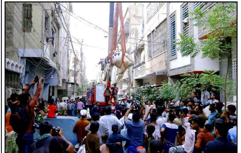
KARACHI: People use a crane to lift a young bull from the roof of a building for the upcoming festival Eid-ul-Azha, at Nazimabad in Karachi.

sia, which was also confirmed by the Russian government officials. He said Pakistan had imported 100,000 tons of oil from Russia initially with plans to gradually increase the quantity over time as the country would meet its quarterly oil requirements through utilisation of Russian oil. The state minister said the previous government made baseless claims, suggesting that the PTI government's attempt to import oil from Russia led to its alleged removal. He said the government intended to ink a $10 billion contract before the end of its tenure, so a new oil refinery could be established in Pakistan.