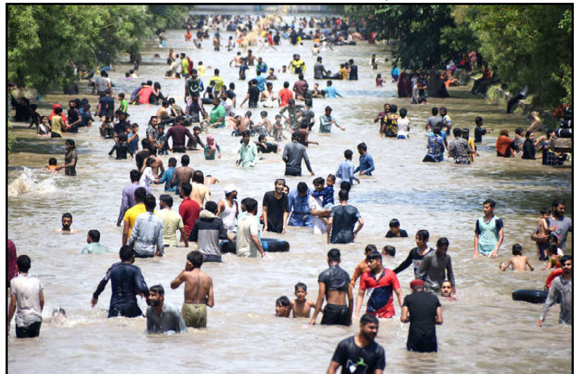
LAHORE: A large number of the people are bathing in canal to cool off during high temperature in Provincial Capital

expected in the salaries of provincial government employees in the next financial year budget, the sources informed. In the budget, Rs. 90 billion has been proposed for education sector with Rs. 60 billion for law and order and Rs. 50 billion for the health sector, the sources revealed. Similarly, sum of Rs. 5.8 billion is likely to be allocated for Health Card Programme. The allocation of Rs. 2.7 billion is proposed for provision of medicines in govt hospitals of the province while Rs. 2 & 1 billion have been proposed for Balochistan Education Endowment Fund & Balochistan Awami Endowment Fund respectively. In addition to this, the allocation of Rs. 1 billion has been proposed for the food security in the next financial year's budget.