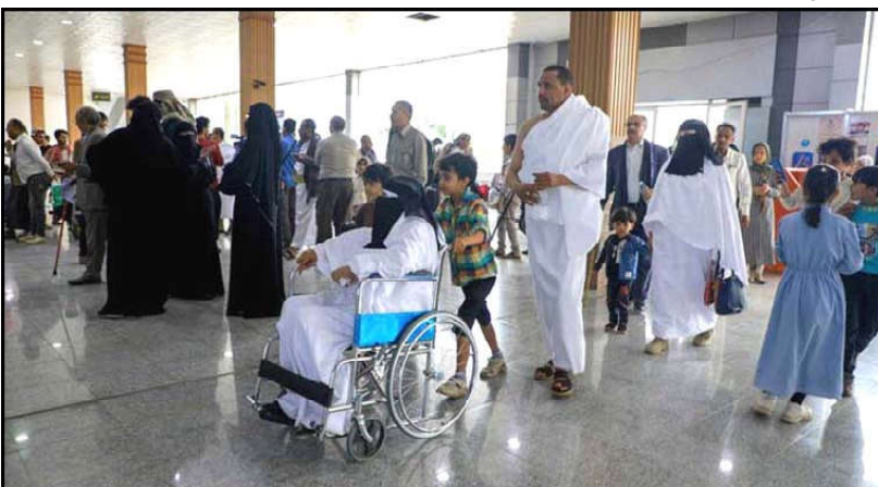
Plane leaves Yemen capital for Saudi, first since 2016.

one of the lowest corporate tax levels in the world, and the proposal, estimated to bring 2.5 billion Swiss francs ($2.80 billion) per year in additional revenue, has been backed by business groups, most political parties, and the general public. The climate law, brought back in a modified form after it was rejected in 2021 as too costly, has stirred up more debate with those campaigning against it gaining traction in recent weeks. Proponents say the law is the minimum the wealthy country needs to do to prove its commitment to fighting climate change while opponents from the right wing People's Party say it will jeopardise energy security. The projections from Sunday's referendum also suggested voter approval for an extension of some provisions of the country's emergency COVID-19 law, required under Switzerland's system of direct democracy, where legislation is put to the public vote.