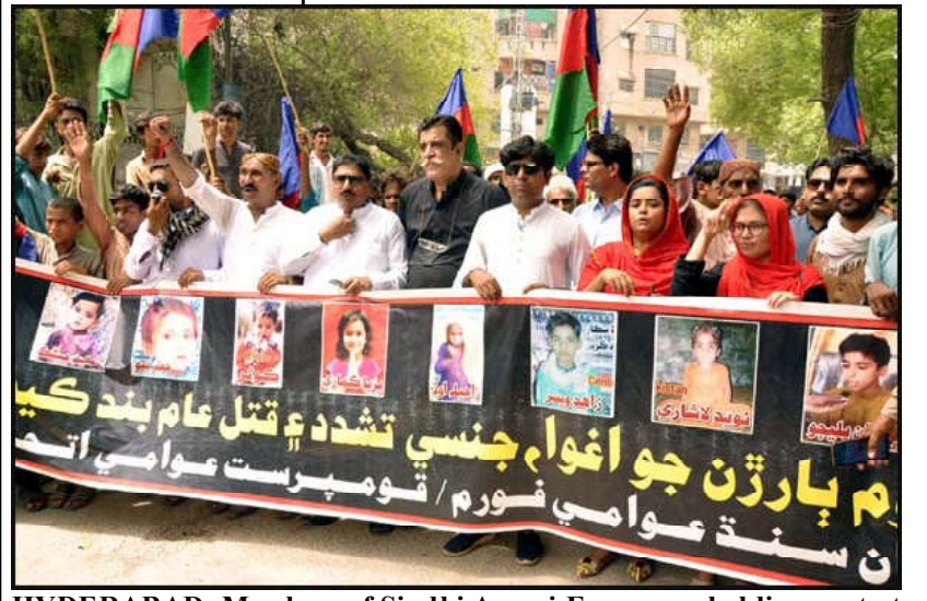
HYDERABAD: Members of Sindhi Awami Forum are holding protest demonstration against unrest law and order situation in city, held at Hyderabad press club.