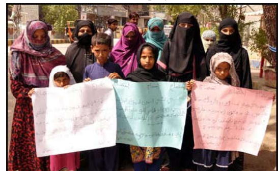
HYDERABAD: Women residents of New Saeedabad are holding protest demonstration for acceptance of their demands, held at Hyderabad press club.

Sharif effectively managed the prices of essential items, resulting in a noticeable decrease, and during Ramadan, free flour was distributed among the poor and needy. Amir Muqam highlighted that it was the PML-N government that brought reforms in the tribal areas and incorporated tribal districts into Khyber Pakhtunkhwa based on the demands of the local population and elected representatives. He assured that the future governments, both in Khyber Pakhtunkhwa and at the federal level, would be formed by the Pakistan Muslim League, ensuring the welfare of tribal communities and undertaking developmental projects in the region.