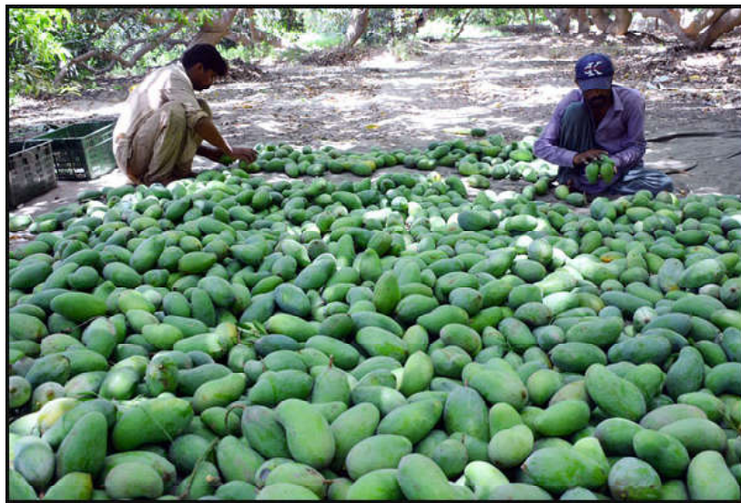
HYDERABAD: Workers busy in sorting the good quality mangoes from orchard for packing to deliver it to the fruit market at Tando jam.

During the current fiscal year 2022-23, Pakistani rupee has lost Rs81.30 against the US dollar in the interbank, while it plummeted by Rs60.86 against the greenback in the current year.