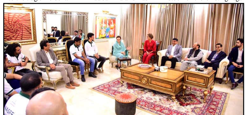
ISLAMABAD: Ms. Marriyum Aurangzeb, Federal Minister for Information and Broadcasting addressing the NASFF's high achievers who are leaving for Australia to participate in the National Amateur Film Festival Award.