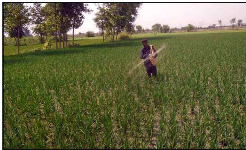
CHINIOT: A farmer spreading fertilizer in a field.

Similarly, Ether (ETH), the world's second-largest cryptocurrency by market capitalisation, slipped by 0.3 percent to reach $1,735. With this decrease in price, the market capitalisation of ETH has reached $208.7 billion.