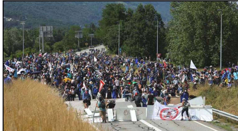
Police fire tear gas as thousands in France protest against high-speed Lyon-Turin train.