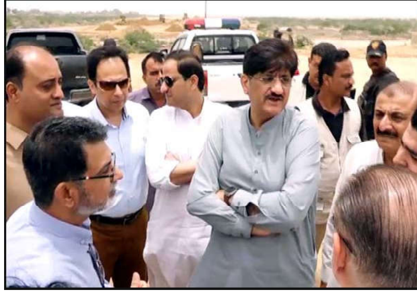
KARACHI: Sindh Chief Minister, Syed Murad Ali Shah along with others being briefed by officials about construction work of Malir Expressway road under the supervision of local government department, during his inspection visit in Karachi.