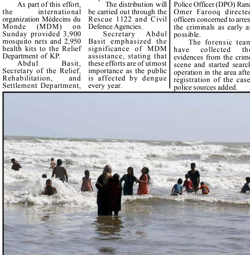
KARACHI: A large number of citizens are gathering to enjoy their holiday during pleasant evening of summer season, at Seaview Beach in Karachi.