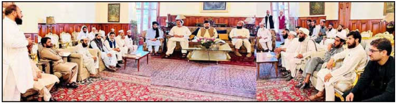
PESHAWAR: Khyber Pakhtunkhwa Governor Haji Ghulam Ali talking to 28-member delegation, consisting of elected chairpersons, councilors, and representatives from political parties.

He said that the provincial government is committed to ensure equal development in all urban and rural areas of the province. Furthermore, the federal government is also providing assistance to expedite the development process. The Governor said that local representatives are closest to the people and, therefore, funds have been allocated in the budget for elected municipal representatives to initiate developmental projects at the grassroots level. Governor Haji Ghulam Ali urged the elected representatives from all districts.