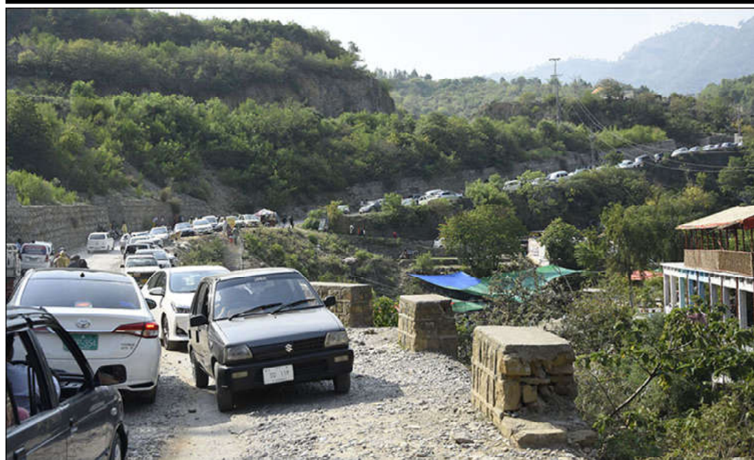
ISLAMABAD: A large numbers of vehicles stuck in traffic jam during arrival at Shadara picnic point during hot weather, in the Federal Capital.