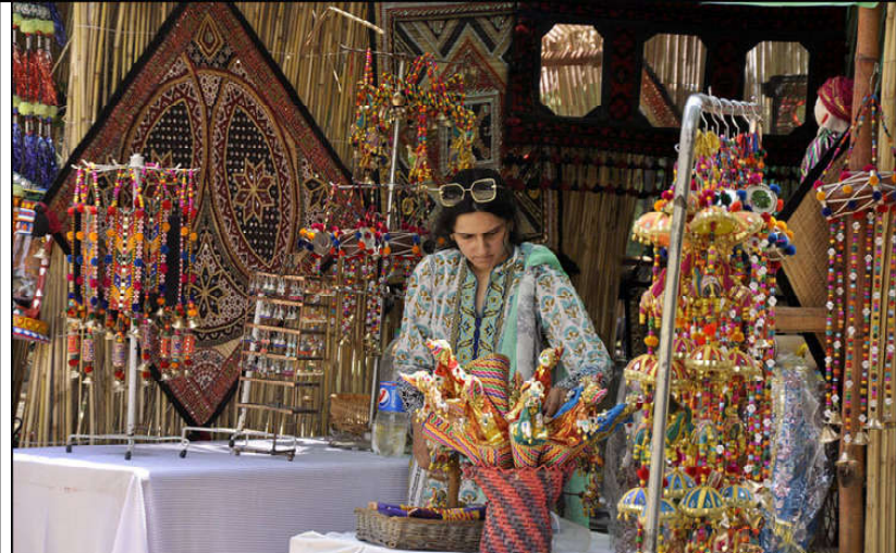
ISLAMABAD: Woman displaying traditional stuff on her stall during the Saqafati Mela promoting Pakistani culture providing entertainment to public at Lok Virsa.

pitching. This approach ensures that talented individuals from all corners of Pakistan can participate, regardless of their geographical location. The inclusion of online pitching enables a broader range of ideas to be heard and encourages a more diverse pool of talent to come forward. NUST, Islamabad has been abuzz with excitement and innovation since the competition began. Alongside the participants and esteemed jury members, officials from the HEC are present to witness the brilliant pitches and the transformative potential they hold.