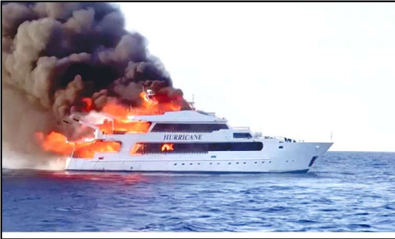
MARSAALAM: Plumes of smoke erupt from a yacht.

Turkey and the Turkish Cypriots say it would be pointless to carry on negotiations based on a federated Cyprus and have instead pushed a two-state deal as a new starting point. Greek Cypriots say they can't agree to a deal that would formalize the country's division. "The just demands of the Turkish Cypriots are clear and unequivocal. Turkish Cypriots have never been a minority and never will be," Erdogan said. The Turkish president said Ankara would also push ahead with plans to supply Turkish Cypriots with electricity through an undersea cable.