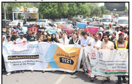
LAHORE: Activist of civil society holds a play cards during awareness walk in Provincial Capital, as world marked the World Day against Child Labour on 12th June.

He said that in addition to the Safe City project, ANPR and facial recognition cameras were installed at the entry and exit points of province besides other such measures.