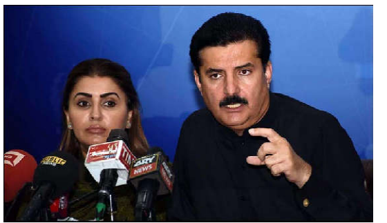
ISLAMABAD: Faisal Karim Kundi, Minister of State for Poverty Alleviation and Social Safety addressing a press conference at PID.

Under the MoU, the SDGs Secretariat and Islamic Relief Pakistan will engage in advocacy and awareness-raising campaigns to foster a deeper understanding of climate change issues among the public. The collaboration will also focus on developing innovative solutions, implementing best practices, and sharing knowledge and experiences to strengthen Pakistan's capacity to address climate challenges effectively.