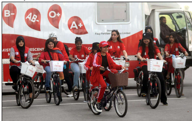
ISLAMABAD: Students from various institutions, Regular Blood Donors PRCS Staff & Volunteers Pakistan Red Crescent Society (PRCS) in collaboration with its Red Cross Red Crescent Movement partners, will organize cycling event 'Donors on Wheels' in connection with World Blood Donor Day 2023 at Jinnah Sports Complex, outside Liaquat Gymnasium.

To facilitate citizens in checking their e-challan status, a convenient online system has been established. By entering their vehicle registration number on the provided link, citizens can easily access information regarding any pending e-challans.