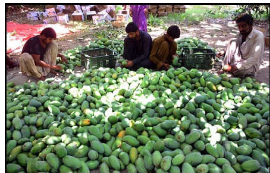
HYDERABAD: Labourer is busy in sorting good quality mangoes before packing at mangoes Orchard at tando jam.