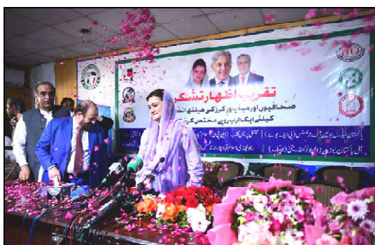
Ms. Marriyum Aurgangzeb, Federal Minister for Information and Broadcasting participating in a thanksgiving reception held in view of allocating funds for health insurance in the budget for the journalists & media workers at National Press Club, Islamabad.

As per the international practice, he said Pakistan too had the legal right to initiate proceedings against such elements under the relevant law. So, all the elements involved in the May 9 vandalism be prosecuted under the Pakistan Army Act-1952 without any delay and get them punished.