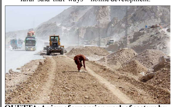
QUETTA: A view of expansion work of eastern bypass road is under process.

of cooperation between Pakistan and Russia in various fields had started to open. The arrival of Russian oil in Pakistan was the beginning of a new era of cooperation between the two countries, he added. He said that Pakistan valued relations with Russia and Russian cooperation. There was great scope for mutual investment, economic development.