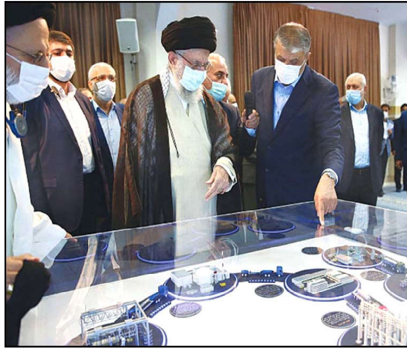
TEHRAN: Iran's Supreme Leader Ali Khamenei views a model of a nuclear facility.

Last week eastern Libya authorities deported thousands of migrants into Egypt, making them cross the border by foot.