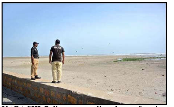
KARACHI: Policemen standing alert on Sea view beach as Cyclone Biparjoy over east central Arabian Sea had further intensified into an "extremely severe cyclonic storm (ESCS)".

According to the notification, secretary Forest South Punjab will monitor cotton crop in Multan district and secretary Housing in Khanewal while secretary School Education has been assigned district Vehari and secretary Irrigation has been allotted Lodhran district. Moreover, secretary Specialized Health care will monitor cotton crop in district Bahawalpur.