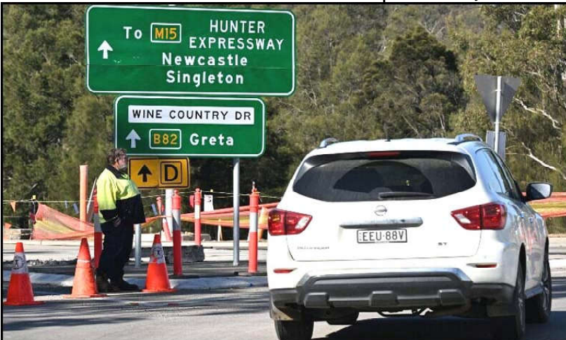
A car passes a roadblock some 500 metres from the site of a bus crash, where 10 people from a wedding party were killed, in Cessnock, in Australia's Hunter wine region north of Sydney.

The power vacuum - with neither a head of state nor a fully empowered cabinet - is unprecedented even for Lebanon, a country that has known little stability since independence.