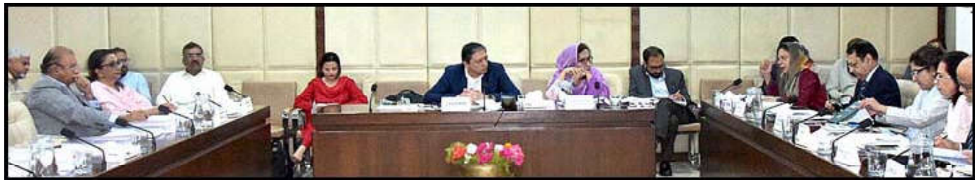
ISLAMABAD: Senator Saleem Mandviwalla, Chairman Senate Standing Committee on Finance and Revenue presiding over a meeting of the committee at Parliament House.

The three top-trading companies were Hascol Petrol with 16,367,000 shares at Rs 5.69 per share; TPL Properties with 13,004,193 shares at Rs13.52 per share and Pak Refinery with 10,796,483 shares at Rs14.67 per share.