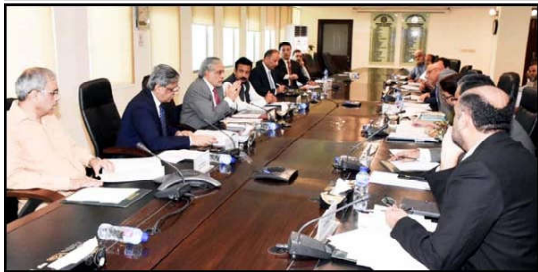
ISLAMABAD: Federal Minister for Finance and Revenue, Senator Mohammad Ishaq Dar chaired the first meeting of the Cabinet Committee on Inter-Governmental Commercial Transactions (CCoIGT), in Islamabad.