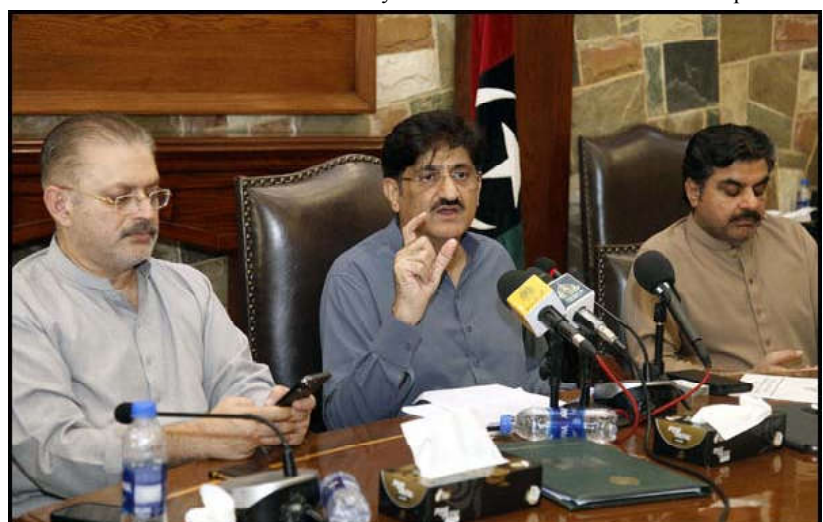
KARACHI: Sindh Chief Minister, Syed Murad Ali Shah addresses to media persons during press conference held at CM House in Karachi.