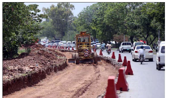
ISLAMABAD: Heavy machinery being used to expand a road at Chak Shahzad neighbourhood in the Federal Capital.

Meanwhile, Minister for National Health Services, Regulations, and Coordination, Abdul Qadir Patel said the government had strengthened the role of Border and Health Services in Pakistan to deal with any sub-variant of Covid-19.