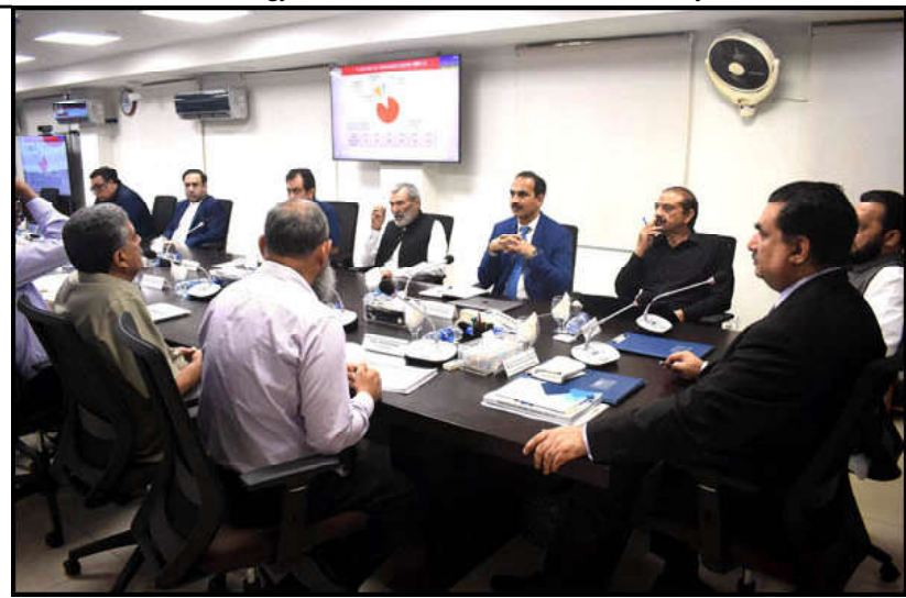
LAHORE: Federal Minister for Power Khuram Dastgir Khan presiding over the meeting of LESCO officials at LESCO Headquarter.

coalition government, he added, started various projects under CPEC especially in power sector at full speed and in the new fiscal year, Rs 900 billion relief in the electricity bills would continue to be given to targeted/ deserving consumers, while load-shedding duration would also be less than in the past years. The federal minister said the government would also give a tariff differential subsidy of Rs 150 billion.