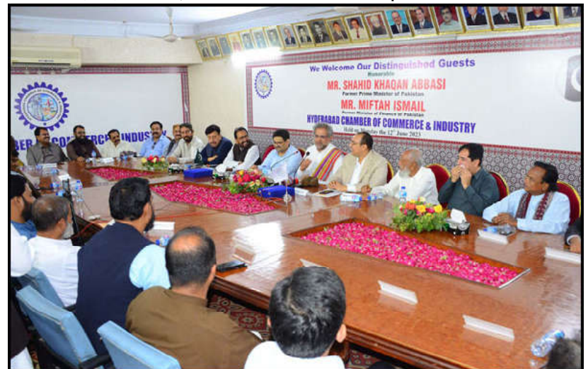
HYDERABAD: Former Prime Minister Shahid Khaqan Abbasi addressing the members of Chamber of Commerce and Industry (HCCI) in City.