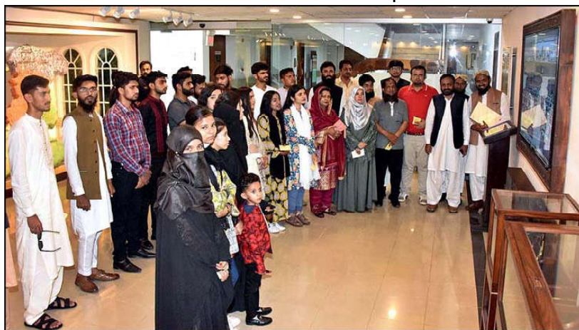
ISLAMABAD: Students and faculty members of the Legend College visiting Senate Museum at Parliament House.

Pointing out the economic challenges, Dr Shahzad Waseem called for introducing genuine reforms, curtailing unnecessary expenditure besides setting national priorities to steer the country out of the current crisis.