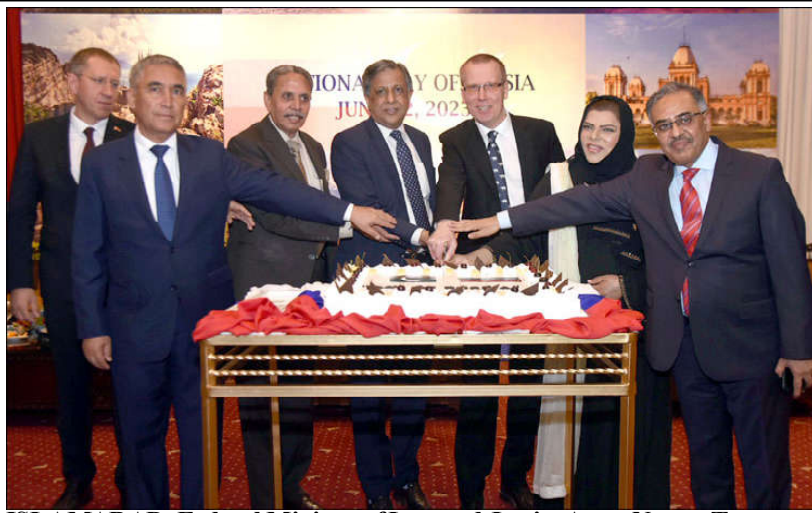
ISLAMABAD: Federal Minister of Law and Justice Azam Nazeer Tarar cuts the cake along with Ambassador of the Russian Federation in Pakistan Danila Ganich and others, on the Occasion of "National Day of Russia" at Serena Hotel in Federal Capital.

The court stated that the federal government had been issuing emergency notifications from time to time and preventive measures were taken to deal with the Coronavirus epidemic.