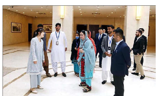
ISLAMABAD: A delegation of student of University of Gwadar visiting Chinese Consulate

ISLAMABAD (APP): Minister of State for Foreign Affairs Hina Rabbani Khar and Belgian Secretary of State for Migration and Asylum Nicole de Moor on Monday discussed enhancing of cooperation in the field of labour mobility. MoS Hina Rabbani Khar held constructive discussions with the Belgian minister in this regard. Earlier, she had arrived in Brussels on an official visit to Belgium, the Foreign Office Spokesperson said in a press statement. Minister of State Hina Rabbani Khar also met Senator Alessia Cleas, the Chair of the Pakistan-Belgium Parliamentary Friendship Group. The discussions focused on fostering stronger ties between the two nations and exploring avenues for increasing trade and investment cooperation.