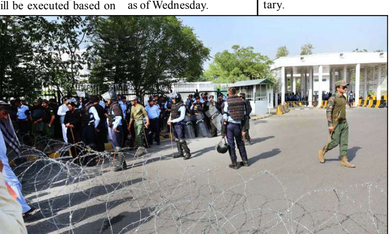
ISLAMABAD: Alarge number of police officials standing outside Parlia-

that the transportation of pilgrims from Madinah commenced on Dhu Al Qa'ida 6, with 26 buses journeying towards Makkah. As the influx of pilgrims to Madinah increases, so does the number of transportation, with approximately 700 buses having transported over from air and land ports. This will be executed based on as of Wednesday.