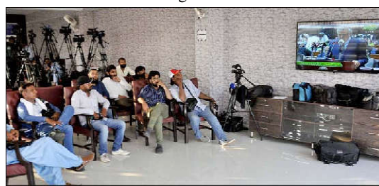
ISLAMABAD: Media persons listening the Federal Budget speech by Finance Minister Senator Mohammad Ishaq Dar on TV at Parliament House.

The participants also discussed matters regarding the training courses for lawyers. The participants of the meeting appreciated the efforts of the Law Minister for giving special attention to the education and training of young lawyers to improve the quality of service in the legal profes-