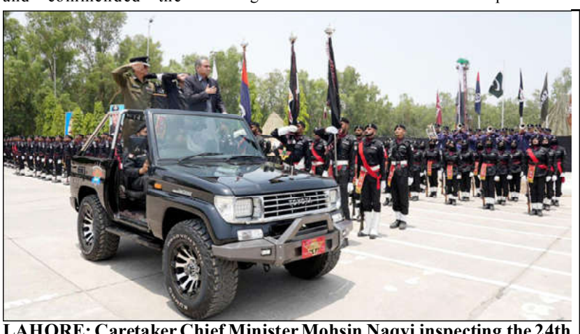
LAHORE: Caretaker Chief Minister Mohsin Naqvi inspecting the 24th passing out parade of Basic Elite Combat Course at Elite Police