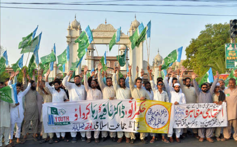
FAISALABAD: Workers of Jamat-e-Islami (Youth Wing) are shouting slogans holding banner and flags during protest to show solidarity with Aafia Siddiqui, at District Council Chowk in City.