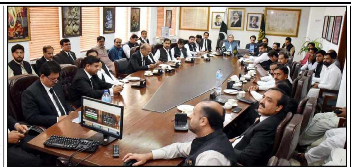
Federal Minister for Law and Justice Senator Azam Nazir Tarar in a meeting with Lawyers from different Bar Associations from Punjab. Meanwhile, Secretary Law Raja Naeem Akbar gave a briefing regarding the website " Pakistan Code".

The report said that what happening in India today was "clearly demonstrates that India is on a dangerous trajectory to becoming a Nazi-inspired fascist, majoritarian state, where its minorities and particularly its more than 200 million Muslims, face treatment of the Muslim an impending danger of