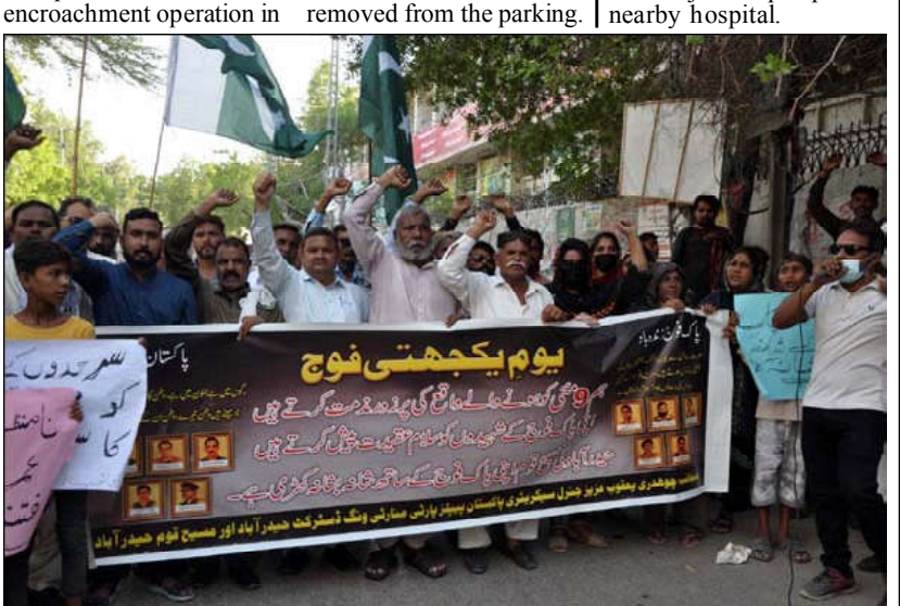
HYDERABAD: Members of Christian Community are holding demonstration in support of Pakistan Armed Forces, at Hyderabad press club.

two people were killed and two other sustained injuries when a car and a tractor trolley collided near Chowk Sarwar Shaheed at Multan Mian Wali road on Friday afternoon According to details, rescue 1122 said, the tragic accident took place on Mian Wali road due to over speeding. Rescue teams and police reached the spot and shifted the deceased