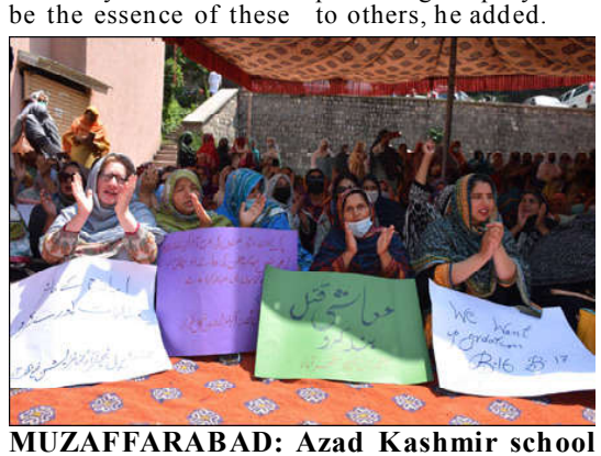
teachers are holds a banner shouting slogan during protest due to up gradation of teachers at Azadi Chowk.

Wani said, "Our aim was to equip our young minds with entrepreneurial spirit because entrepreneurs are the future." They were the ones that will not only be making a mark in the world but also providing employment