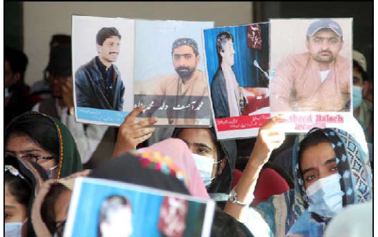
QUETTA: Relatives of missing persons are holding pictures of victims during a seminar.

gives me great pleasure to be here today to address such an esteemed gathering at the launch of the Community Led Local Governance Policy Launch Event. As we all know, governance is a critical issue facing the entire country, particularly the Balochistan province where the problem of governance is contributing to many socio-economic and political problems and directly impacts the daily life of its ordinary citizens. In order to ensure that the government is able to provide its citizens with the necessary services and amenities, it is essential that the problems of governance are addressed. The Local Government Act 2010 of Balochistan was an important step towards improving local governance in the province. However, with the passage of time further reforms were needed to improve the functioning of the system.