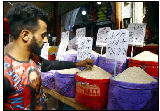
KARACHI: Daily use items are being selling at shop while people are being worried for purchasing, as the price of daily used general items have touched up to sky due to price hiking in country and citizens are expecting relief in upcoming Budget 2023-24, at Jodia Bazar in Karachi.

realized from income tax. The major contributions of income tax have come from contracts, imports, and profit payout. The tax payments with tax declaration and collection on demand have also shown high growth, it added. The gross and net sales tax collection during the period under review has Rs 2327.5 billion and Rs 2090 billion showing growths of around 1.7 percent and 1.2 percent, respectively. Around 64 percent of total sales tax was contributed by sales tax on imports during the same period, while the rest was contributed by the domestic sector. According to the Economic Survey, the collection of Federal Excise Duty (FED) during the ten months of FY2023.