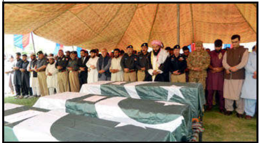
SWAT: Funeral prayers of policemen who was martyred during firing by terrorists near Sabzi Mandi being offered at Javed Iqbal Shaheed Police Line.

The IGP said that early completion of different projects including Safe City Rawalpindi would be ensured.