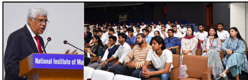
NIMA conducts seminar on sustainable resource and blue economy on the occasion of world oceans day.