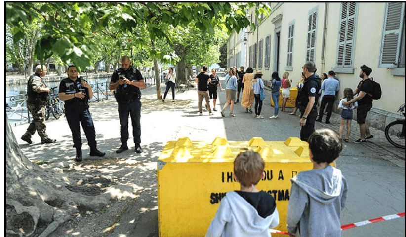
French police personnel maintain a secure cordon in Annecy, south-eastern France, following a mass stabbing in the French Alpine town.

Monitoring Desk MEXICO CITY: Iranian President Ebrahim Raisi will visit Cuba, Nicaragua and Venezuela next week, Iran's state news agency IRNA announced on Wednesday, adding that the upcoming tour stemmed from invites from the presidents of each of the Latin American nations. IRNA said documents to expand bilateral cooperation will be signed between Iran and the three countries during Raisi's visit, mentioning economic, political and scientific issues.