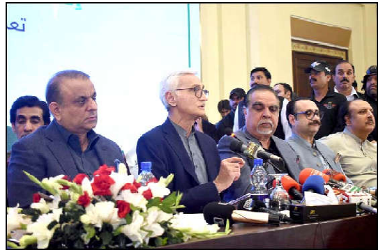
LAHORE: Senior Politician Jahangir Tareen announces new political party named 'Istehkam-e-Pakistan Party' (IPP) during a press conference.

needs hope the most so this country could achieve its true potential. No one can be allowed to attack state institutions in shape of mobs. It is not just about attacking institutions but most importantly people are losing hope." "We have to make a Pakistan where establishment, judiciary, political forces and all stakeholders are on the same page. We all want to take Pakistan towards prosperity," he added. "Today, we need to change how politics is conducted in our country. It needs a new direction. We will make joint efforts to achieve that." He emphasised that to take Pakistan out of economic turmoil, focus has to be shifted towards increasing exports and incentivising the IT sector.