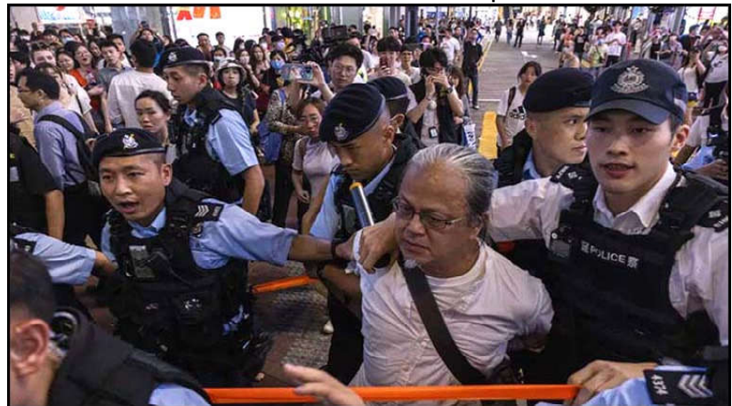
Police said in a statement arrests have been made on suspicion of breaching public peace.