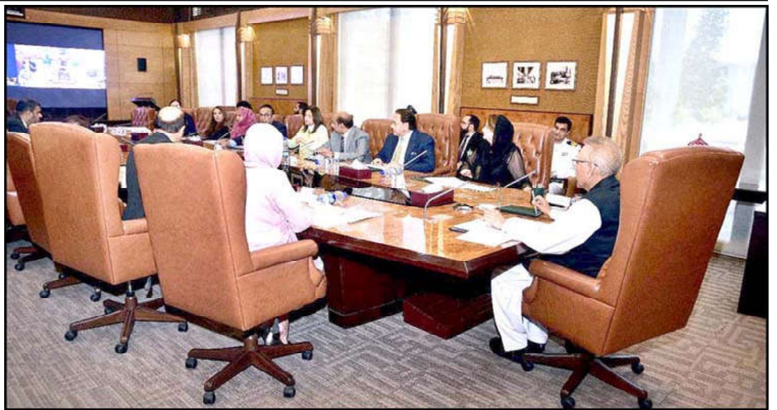
ISLAMABAD: President Dr. Arif Alvi chairing a follow-up meeting on the rights and facilitation of persons with disabilities (PWDs) at Aiwan-e-Sadr.

The representatives of provinces shared information regarding the total number of registration centres in their respective provinces.