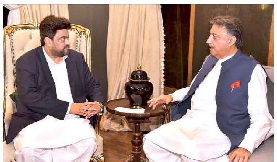
KARACHI: Governor Sindh Kamran Tessori exchanging views with Governor Balochistan Malik Abdul Wali Khan Kakar at Governor House.