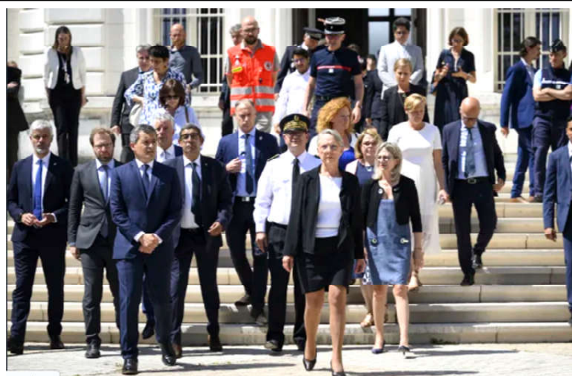
French Prime Minister Elisabeth Borne and French Interior and Overseas Minister Gerald Darmanin leave the Haute Savoie prefecture in Annecy, French Alps.