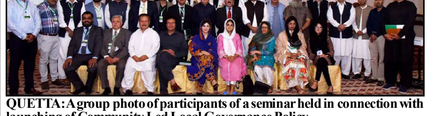
QUETTA: A group photo of participants of a seminar held in connection with launching of Community Led Local Governance Policy