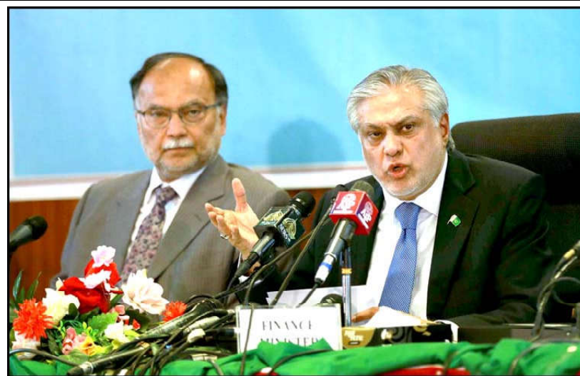
ISLAMABAD: Federal Minister for Finance and Revenue Senator Ishaq Dar presents Economic Survey for fiscal year 2022-23 during a press conference.