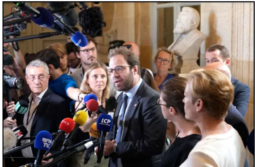
Antoine Armand, center, deputy for the Savoie region, in the French Alps, speaks at the National Assembly.

timidation and terror" by rebels in eastern Ukraine starting in 2014 and sought to replace Crimea's multiethnic community with "discriminatory Russian nationalism." Ukraine filed the case in 2017, asking the world court to order Moscow to pay reparations for attacks and crimes such as the shooting down of Malaysia Airlines flight MH17 by a Russian missile fired from territory controlled by Moscow-backed rebels on July 17, 2014, killing all 298 passengers and crew. The Ukrainian government alleges that Russia breached two treaties: the International Convention for the Suppression of the Financing of Terrorism and the International Convention on the Elimination of All Forms of Racial Discrimination. Addressing the terrorism-funding allegation, Michael Swainston, a British lawyer representing Russia, said Ukraine's legal team failed to establish that actions by pro-Moscow rebels in eastern Ukraine could be considered terrorism. "It is imperative to distinguish between terrorists who deliberately target civilians and soldiers who foresee that civilians will be killed as collateral damage while striking a military target," Swainston said. "The former is a war crime, while the latter represents lawful conduct. And of course, soldiers also make mistakes."