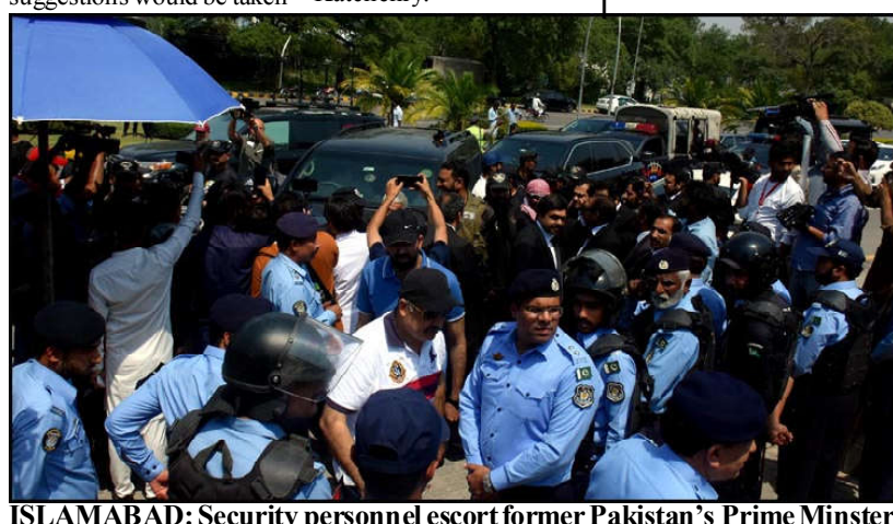
ISLAMABAD: Security personnel escort former Pakistan's Prime Minister Imran Khan at High Court.

The participants extended gratitude to the Islamabad Capital City Police Officer and DIG (Operations) for organizing the productive Open Katchehry.