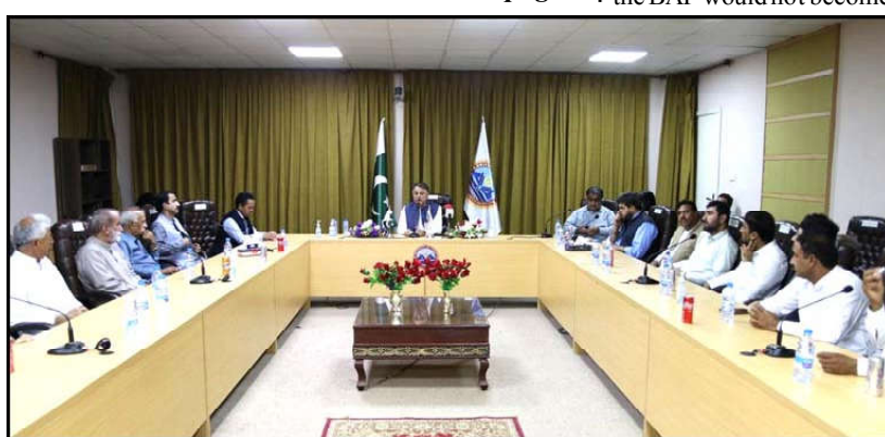
TURBAT: Governor Balochistan Malik Abdul Wali Khan Kakar presiding over a review meeting during his visit of University of Turbat