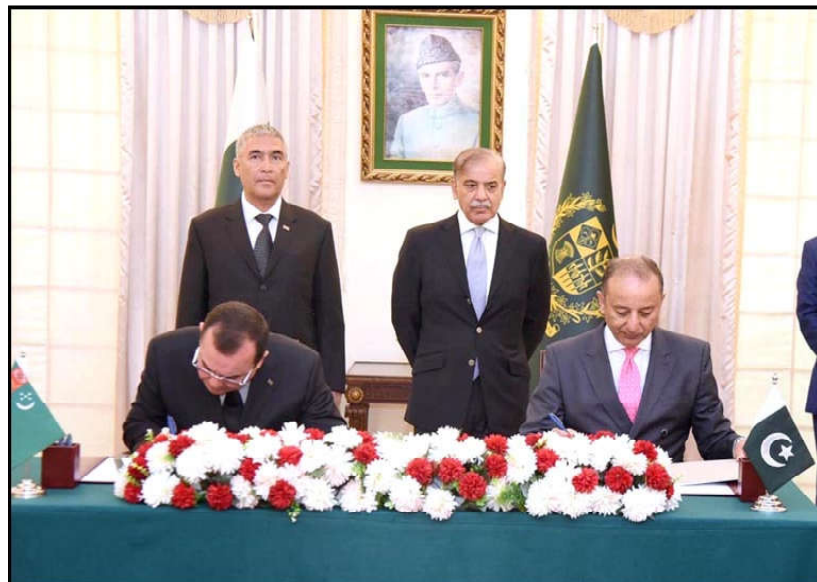
ISLAMABAD: State Minister of Turkmenistan and Head of Turkmengaz, Maksat Babayev and Minister of Petroleum of Pakistan, Dr. Musaddiq Malik signing TAPI Joint Implementation Plan while Prime Minister Muhammad Shehbaz Sharif witnesses the signing.