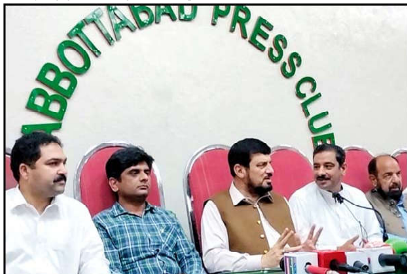
ABBOTTABAD: Governor of Khyber Pakhtunkhwa, Haji Ghulam Ali addresses to media persons during press conference held at Abbottabad press club.

Haji Ghulam Ali said that the nation is living in peace and progressing due to the efforts of the Pakistani army, rangers, and police and after the May incidents the nation has proven that it stands with the Pakistani army and those who are safeguarding the constitution.