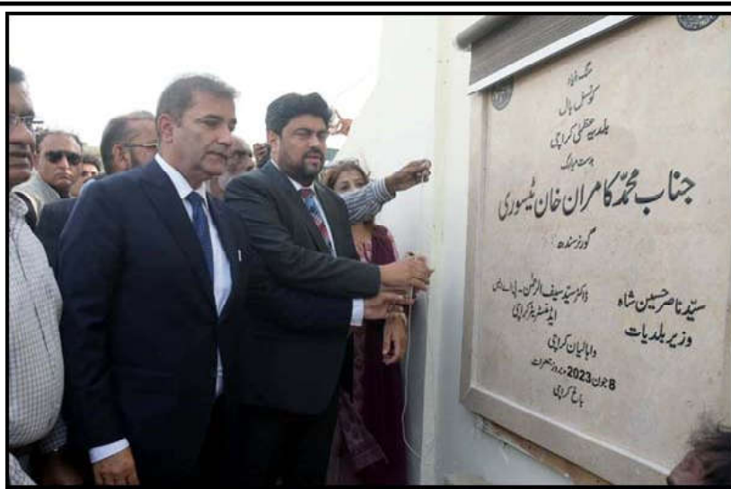
KARACHI: Sindh Governor, Kamran Khan Tessori along with others are laying Foundation Stone during ceremony of the new building of the Karachi Metropolitan Corporation, held in Karachi. SWAT: Funeral prayers of policemen who martyred during firing by terrorists near Sabzi Mandi being offered at Javed Iqbal Shaheed Police Line