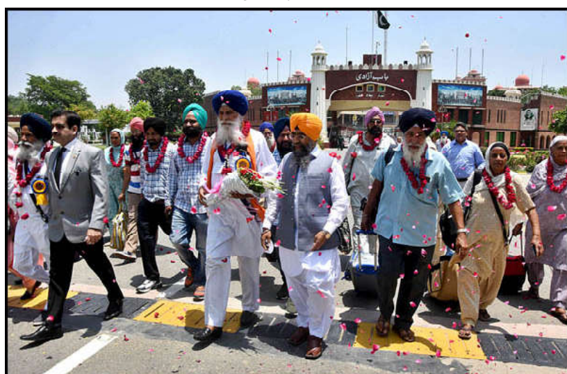
LAHORE: Evacuee Trust Property Board (ETPB) members warmly welcomed to the Sikh pilgrims at Wagah as a large number of Sikh Yatries arrived in Pakistan through Wagha Border to participate in religious rituals on the occasion of Joor Mela. Sikhs from across the country and abroad poured into Gurdwara Punja Sahib in Hassanabdal on the 417th death anniversary of the fifth of 11 Sikh gurus, Guru Arjan Dev Ji.

The company will deliver 100,000 free plastic bags for disposing of animal waste before Eid. For public convenience, awareness camps would be organized and waste bags will be provided to people coming to buy animals.