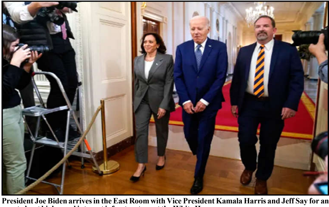
event about high speed internet infrastructure at the White House.

However, he has not publicly commented since