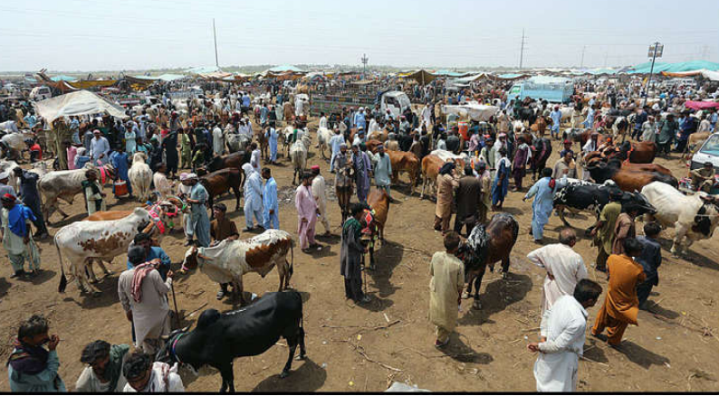
HYDERABAD: Vendors selling sacrificial animals at Animal Market Hathri Bypass in connection with upcoming Eid ul Azha.

ISLAMABAD (APP): The per tola price of 24 karat gold increased by Rs 800 and was sold at Rs 215,300 on Monday against its sale at Rs.214,500 the previous day. The price of 10 grams of 24 karat gold also increased by Rs .685 to Rs 184,585 from Rs 186,043 whereas the price of 10 grams 22 karat gold went up to Rs 169,203 from Rs 168,574, All Sindh Sarafa Jewellers Association reported. The price of per tola silver increased by Rs.50 to Rs2,550 whereas that of ten gram went up by Rs.42.87 to Rs.2,186.21.