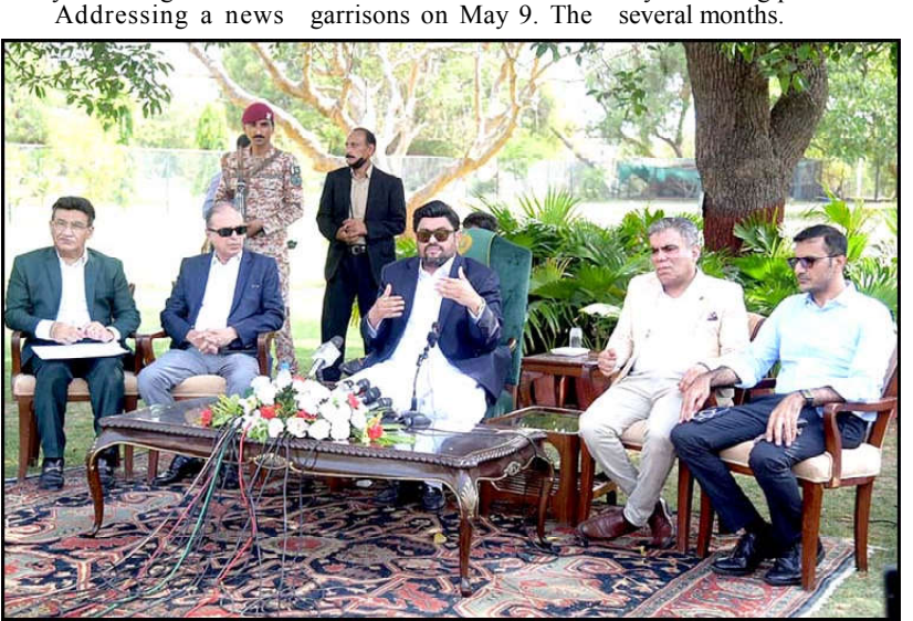
KARACHI: Governor Sindh Kamran Khan Tessori briefs media about the biggest ever ration drive of 20000 ration bags under Taqatwar Pakistan programme at Governor House.

"There is no distinction of rank or social status in the accountability proger the post, the bigger the responsibility." The DG ISPR said the investigations institutional inquiries were clearly established the conducted into the incipoint that the May 9 tragdents of violence at various edy was being planned for