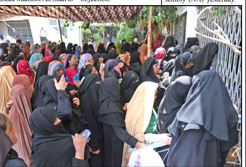
KARACHI: Woman line up at Benazir Income Support Center after Stampede broke out during the distribution of funds of the Benazir Income Support Programme (BISP) among deserving women as Several women were injured in the stampede at Benazir Income Support Center in Provincial Capital.