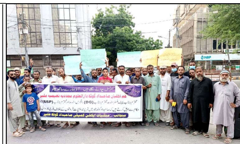
KARACHI: Members of Drugs Action Committee are holding protest demonstration against selling of drugs in Malir area, on the occasion of International Day Against Drug Abuse and Illicit Trafficking, at Karachi press club.

risdiction He further said that PMSS Kolachi was developed at the Karachi shipyard and inducted into a fleet of PMSA. The Karachi shipyard had the capability to manufacture even bigger ships that would not only further enhance the country's tional capacities of the maritime forces but Pakincy, the minister said. stan could also earn p He hoped that PMSA cious foreign exchange. stan could also earn pre-