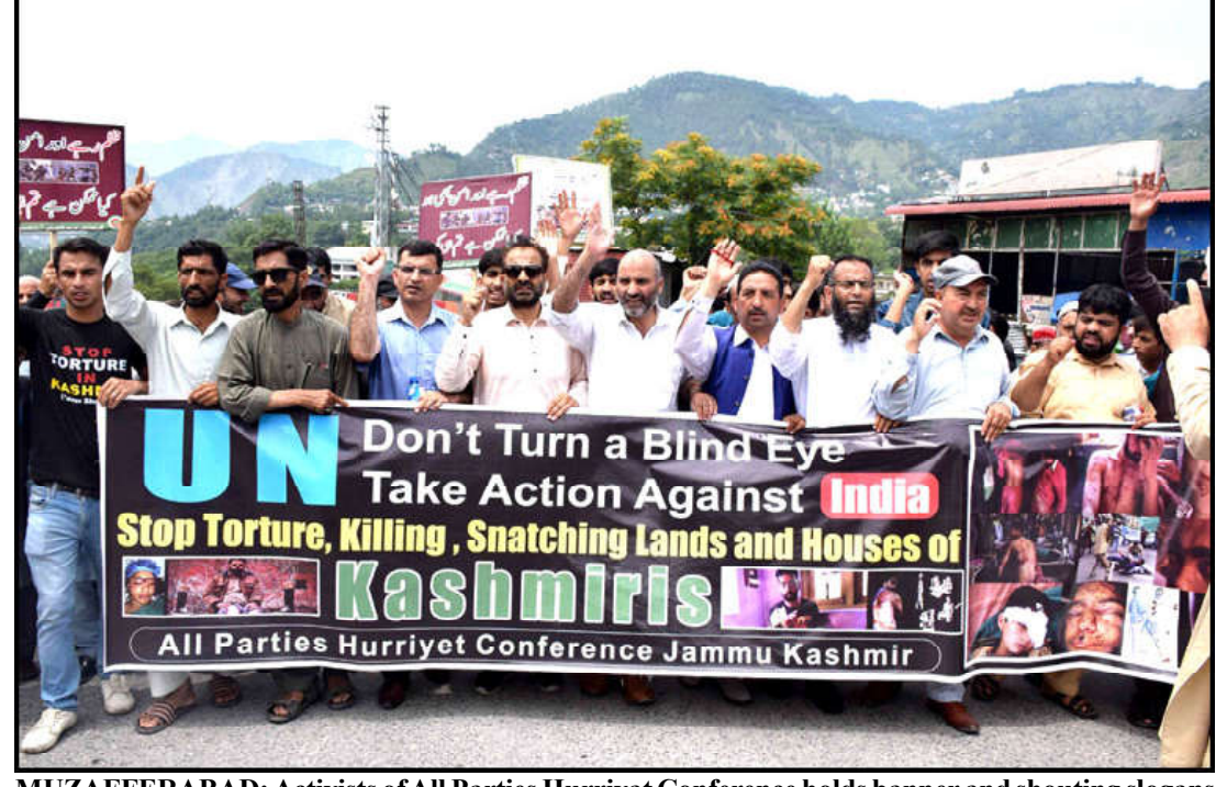
MUZAFFERABAD: Activists of All Parties Hurriyat Conference holds banner and shouting slogans during protest in the favor of their demands in the capital of AJK.