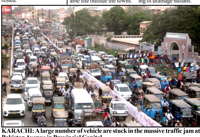
Pakistan Avenue in Provincial Capital.

The concerned officials of different government departments were instructed to ensure the cleaning of drainage nullahs.