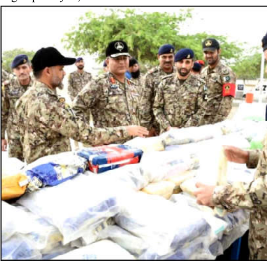
HUB: Pakistan Coast Guard Officials are showing huge apprehended drugs worth millions of rupees, during raid on local area of Kapkapar, during press conference held at PCG Headquarters in Hub.

The case has been registered after seizing the contraband items. Separately, Coast Guards seized huge quantities of contraband items, in two separate actions in Balochistan.