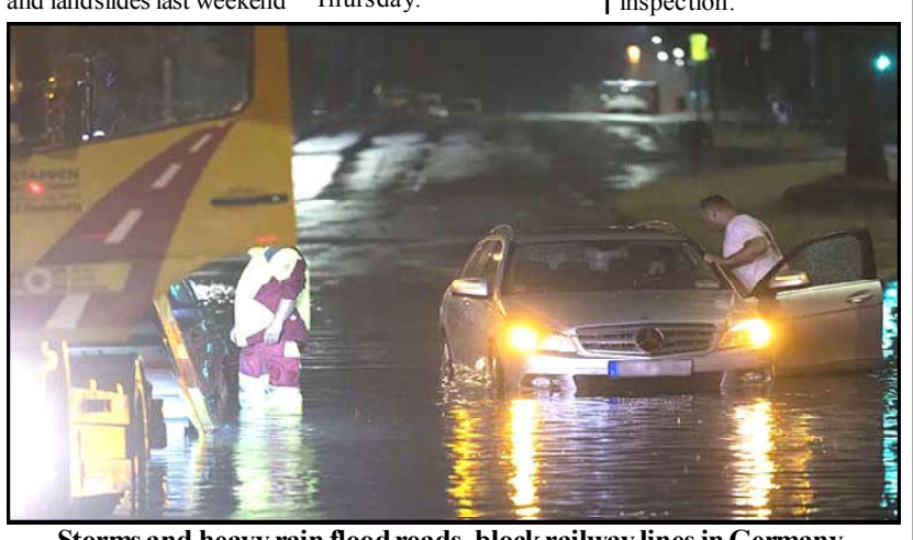
Storms and heavy rain flood roads, block railway lines in Germany.

ture and Tourism issued an mergency circular, urging all localities to investigate hidden dangers" and strengthen supervision and