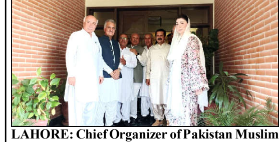
League (N) Maryam Nawaz posing for a group photo graph along with the Leadership of National Party.