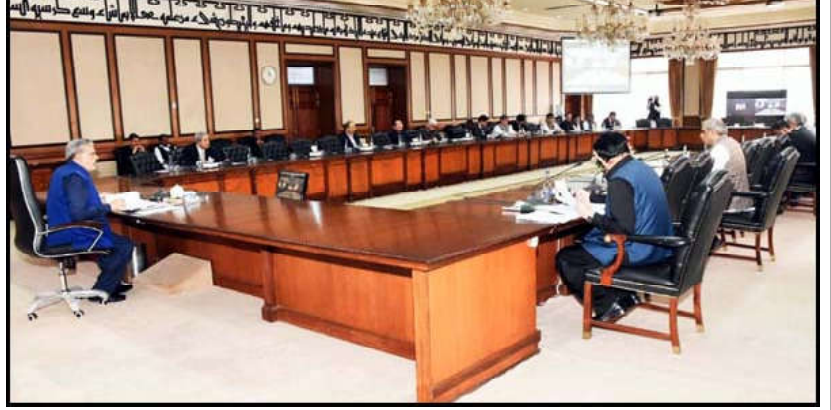
ISLAMABAD: Federal Minister for Finance and Revenue, Senator Mohammad Ishaq Dar chaired the meeting of the Economic Coordination Committee (ECC) of the Cabinet in Islamabad.

Rs 187,328 whereas the price of 10 grams 22 karat During the period from was also produced in order to gold went down to Rs tackle with local requirements 170,539 from Rs 171,718, in the last 10 months of the All Sindh Sarafa Jewellers of cooking oil were current financial year. Association reported.