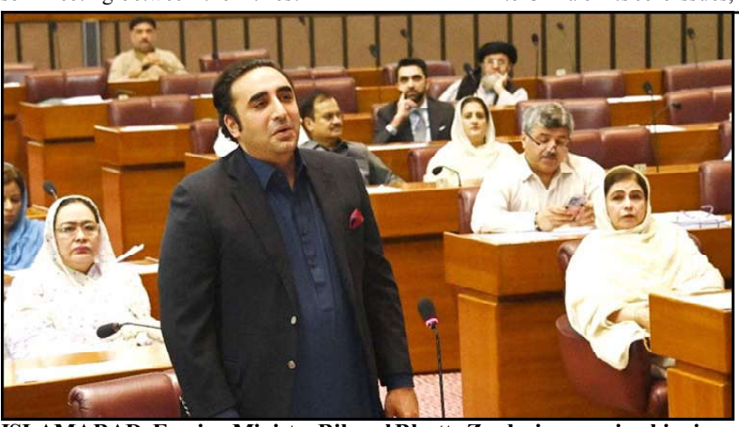
ISLAMABAD: Foreign Minister Bilawal Bhutto Zardari expressing his views