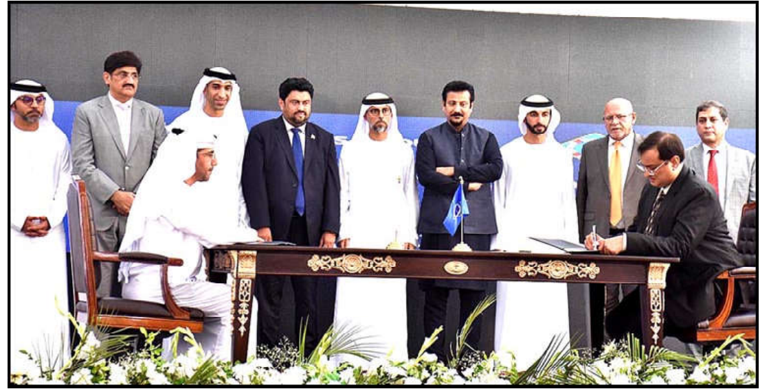
KARACHI: Federal Minister for Maritime Affairs Syed Faisal Ali Subzwari's witnessing MoU Signing Ceremony between KPT & UAE during the inauguration ceremony of Karachi Gateway Terminal Limited.

He said his government had to spend hundreds of millions of dollars from its own scarce resources to give financial assistance to the flood affectees all over the country.