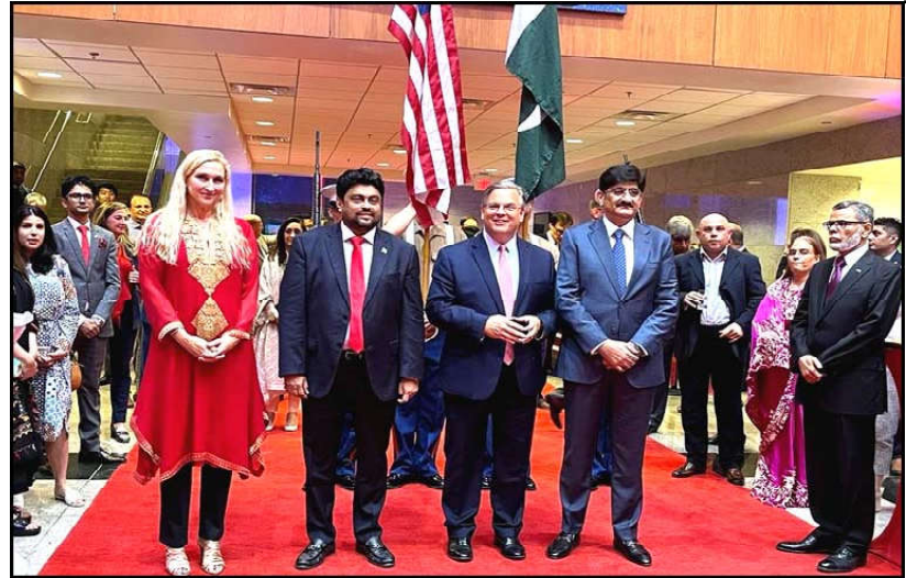
KARACHI: Sindh Governor Kamran Khan Tessori and Chief Minister Syed Murad Ali Shah attending a ceremony at US Consulate in connection with Independence Day of USA