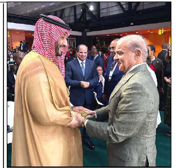
PARIS: Prime Minister Muhammad Shehbaz Sharif meets Crown Prince and Prime Minister of the Kingdom of Saudi Arabia on the sidelines of New Global Financial Pact Summit held in France.

The production of electricity by wind power plants is 1200 megawatt. The production of electricity by solar power plants is 120 megawatts. 150 MW of electricity is being generated from bagasse.