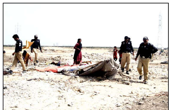
KARACHI: Anti encroachment operation in progress removed illegal encroachment during anti encroachment drive under the supervision of Sindh Police Department located on Korangi Crossing road in Karachi.