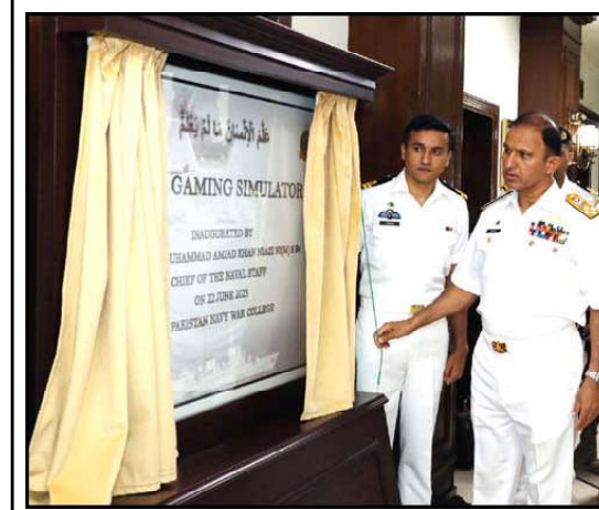
LAHORE: Chief of the Naval Staff, Admiral Muhammad Amjad Khan Niazi unveiling the plaque during the inauguration ceremony of War Gaming Simulator held at Pakistan Navy War College in Lahore.