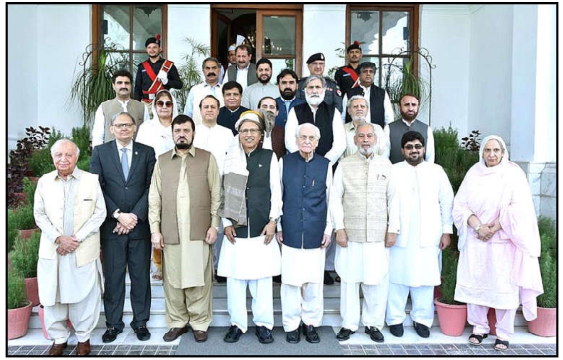
PESHAWAR: President Dr. Arif Alvi in a group photo with the Governor Khyber Pakhtunkhwa (KP), Haji Ghulam Ali, Caretaker Chief Minister KP, Muhammad Azam Khan, and members of the provincial cabinet, at Governor House.

The report calculated that Pakistan collectively suffered over $30 billion in economic and physical loss. He said funds amounting to $16.3 billion were required to execute the physical work like repair of damaged houses and infrastructure, under the '4RF' strategy i.e. resilient recovery, rehabilitation and reconstruction. The estimate was for the projects to be completed in 4 to 5 years, he added. Ishaq Dar clarified that 50 per cent expenses of reconstruction and rehabilitation work would be borne by the federal government and 50 per cent by the respective province.