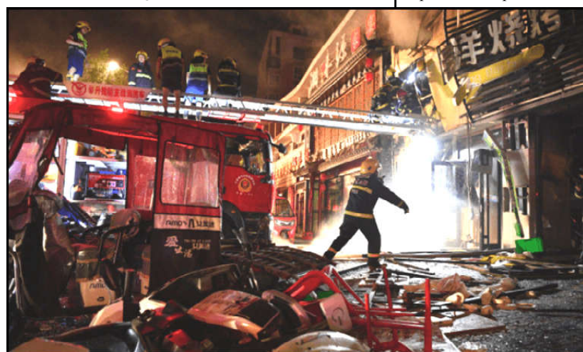
Firefighters put out fire after an explosion at a restaurant in Yinchuan, China killed at least 31 people, officials said.

DUBAI: Heavy clashes broke out between rival military factions in several parts of Sudan's capital on Wednesday as a 72-hour ceasefire that saw several reports of violations expired, witnesses said. Shortly before the truce ended at 6 a.m. (0400 GMT) fighting was reported in all three of the cities that make up the wider capital around the confluence of the Nile.