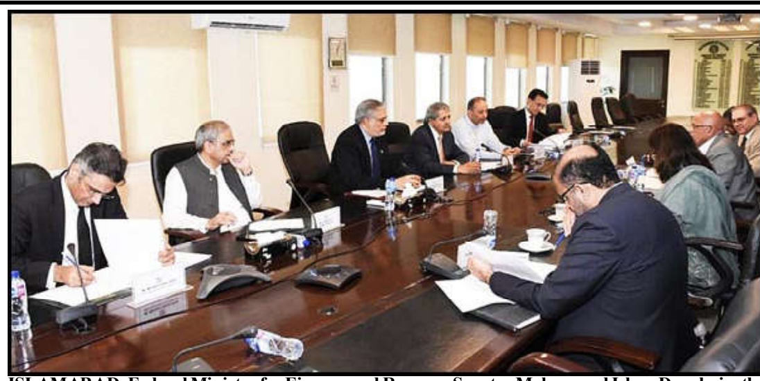
ISLAMABAD: Federal Minister for Finance and Revenue Senator Mohammad Ishaq Dar chairs the meeting of the Cabinet Committee on Inter-Governmental Commercial Transactions (CCoIGCT).

This occasion celebrates the signing of the sixth batch of the program in Pakistan. For this batch, the maximum number of slots for JDS participants in Pakistan is 17 seats for the Master's degree.