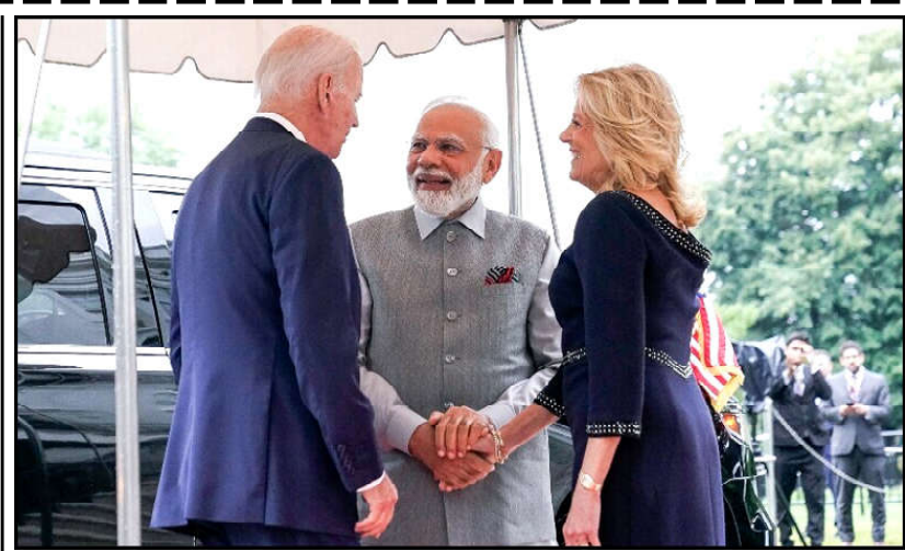
US President Joe Biden and first lady Jill Biden welcome Prime Minister of India Narendra Modi to the White House in Washington.

"The pilot would begin with a small number of cases with the intention to scale the initiative over the following one to two years," the spokesperson said while declining to define small. The steps could change and are not finalised until they are announced. The White House declined to comment.