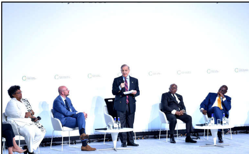
FRANCE: Prime Minister Muhammad Shehbaz Sharif addresses the round table discussion "Innovating with instruments and financing to address new vulnerabilities" at Summit for New Global Financing Pact being held in France.