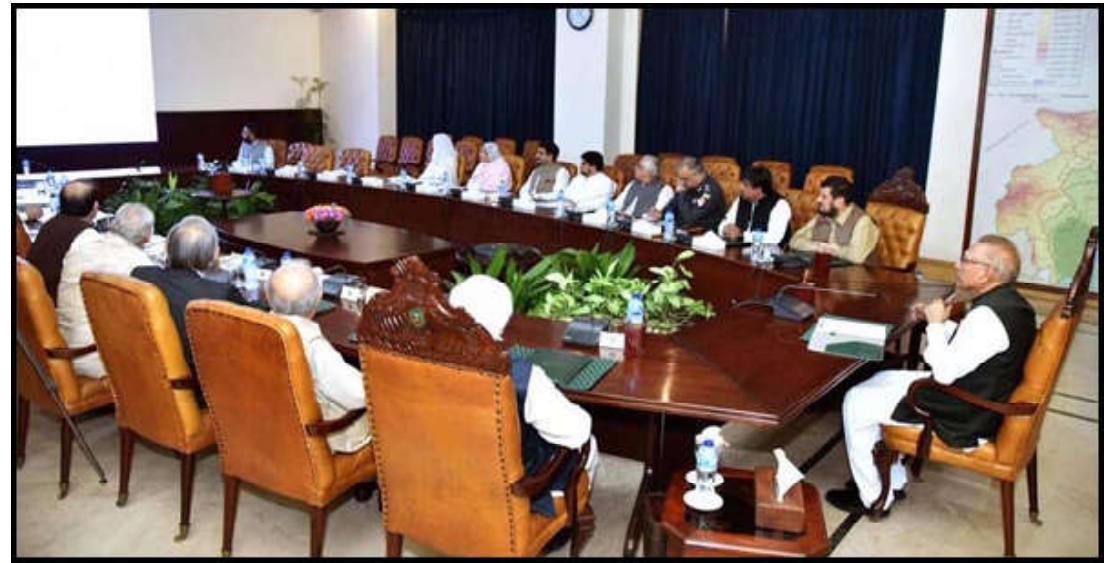
PESHAWAR: President Dr. Arif Alvi chairing a meeting on the Higher Education Sector of Khyber Pakhtunkhwa at Governor House.

Regarding mining, the cabinet approved the revision of royalty rates for limestone and argillaceous clay in large-scale mining operations.