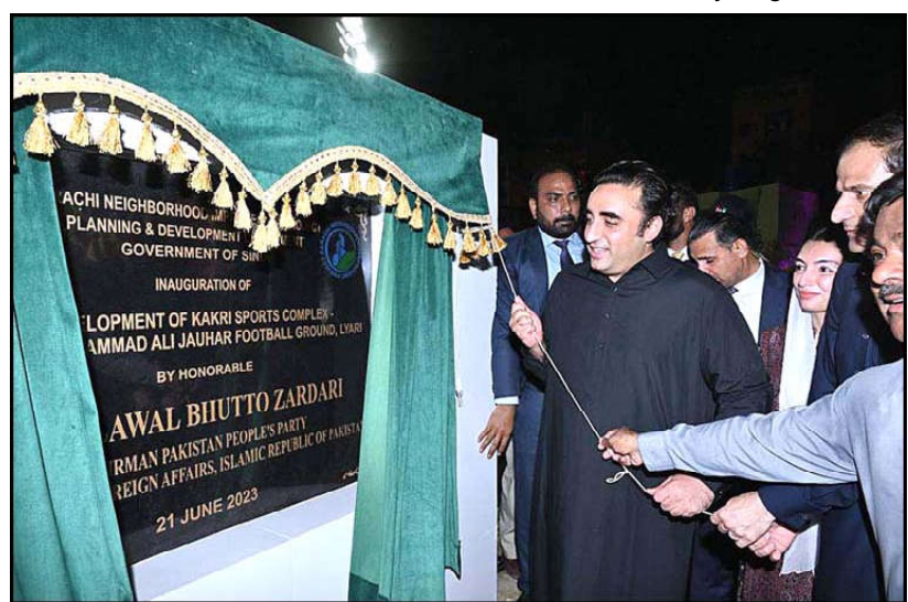
KARACHI: Bilawal Bhutto Zardari, Foreign Minister inaugurating the Muhammad Ali Jauhar Football Ground, Lyari.

checked across the province during the road checking campaign. As per details, 3901 vehicles were checked in Karachi, 7459 in Hyderabad, 3004 in Sukkur, 3124 in Larkana, 2274 in Mirpur Khas and 3813 in Shaheed Benazirabad. During the road checking campaign, 1347 vehicles were seized and documents of 1789 vehicles were confiscated, he added. The provincial minister expressed satisfaction over the performance of officers and staff of Excise and Taxation department during the road checking campaign.