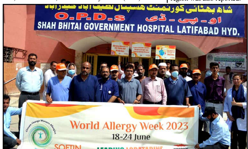
HYDERABAD: Doctors are holding awareness walk on the occasion of World Allergy Week 2023 organized by Shah Bhitai Government Hospital in Hyderabad.

acres of agri-land of Sindh province. The discharge capacity of each canal will be increased due to closure of 10 gates. He further said that Sukkur Barrage is 90 years old enormous and historical construction with Landslide Bridge, that has completed its maturity (period).