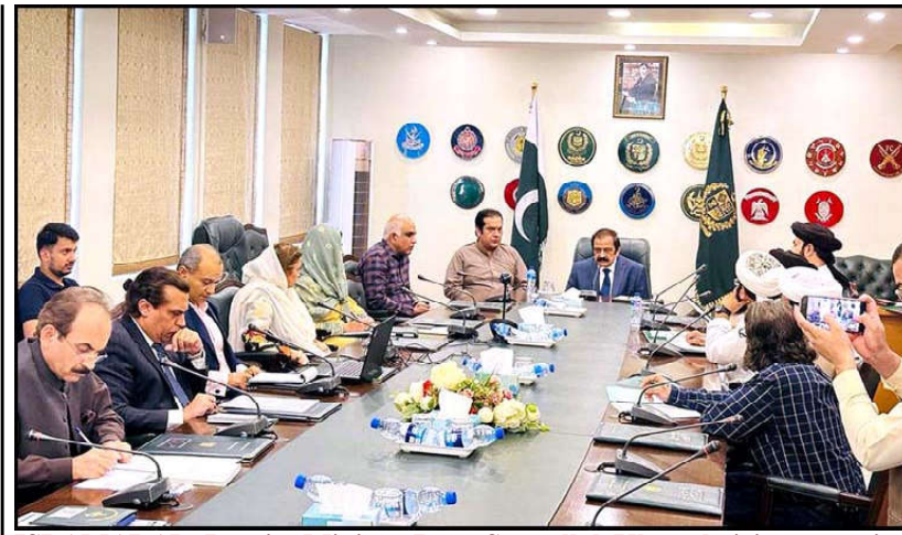
ISLAMABAD: Interior Minister Rana Sanaullah Khan chairing a meeting with Tehreek Labaik Pakistan. Minister of State for Interior Abdul Rehman Kanju is also present on the occasion.