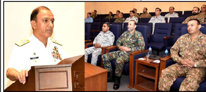
ISLAMABAD: Chief of the Naval Staff, Admiral Muhammad Amjad Khan Niazi addressing National Security & War Course members at National Defence University (NDU).

The incumbent chief justice will reach the age of superannuation on September 16, 2023, under Article 179 of the Constitution.