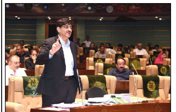
KARACHI: Sindh Chief Minister, Syed Murad Ali Shah addresses during Provincial Assembly session held at Sindh Assembly building in Karachi.

"In order to understand the greatness of Bhutto and her love for the country, one has to read the 'Sur Marvi' of the great poet of Sindh, Shah Abdul Latif Bhitai," Murad Shah added.