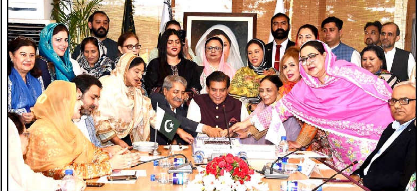
ISLAMABAD: Speaker National Assembly Raja Pervaiz Ashraf along with other PPP Parliamentarians cutting cake to celebrate 70th Birthday of Shaheed Mohtarma Benazir Bhutto in WPC.