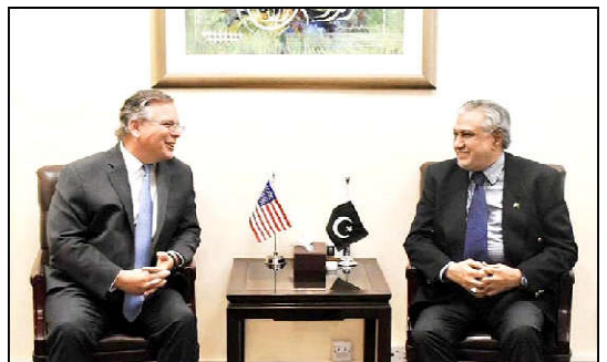
ISLAMABAD: H.E. Mr. Donald Blome, Ambassador of the United States of America to Pakistan called on Federal Minister for Finance and Revenue Senator Mohammad Ishaq Dar at Finance Division.

The two sides also exchanged views about areas of common interest and how the existing bilateral relations between the two countries can be enhanced further.