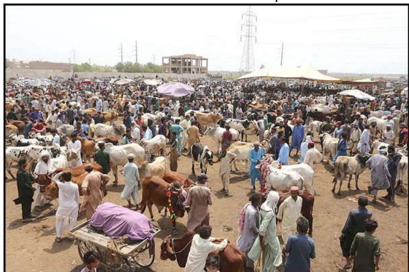
HYDERABAD: Vendors selling sacrificial animals at Animal Market Hathri Bypass in connection with upcoming Eid ul Azha.

The team of the Directorate gathered information meticulously without disturbing the business activity of the company to initiate proceedings under section 38 of the Sales Tax Act, 1990 and retrieved the record and documents from the business premises.