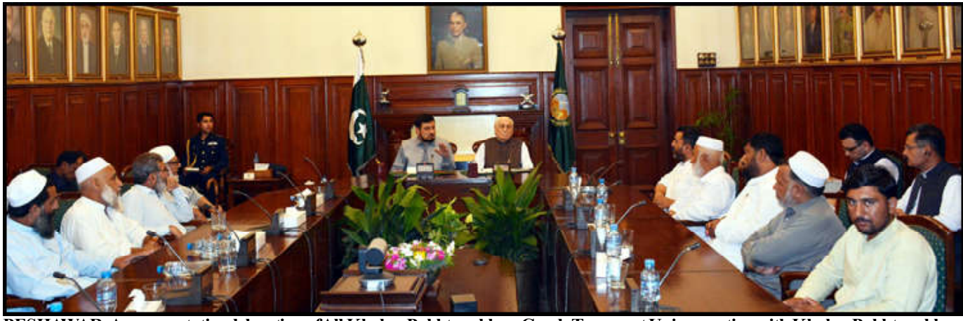
PESHAWAR: A representative delegation of All Khyber Pakhtoonkwa Goods Transport Union meeting with Khyber Pakhtoonkwa Governor Haji Ghulam Ali and Chief Minister Muhammad Azam Khan.