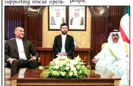
Kuwait's Prime Minister Sheikh Ahmad Nawaf Ahmad al-Sabah meeting with Iran's Foreign Minister Hossein Amir-Abdollahian, in Kuwait City.