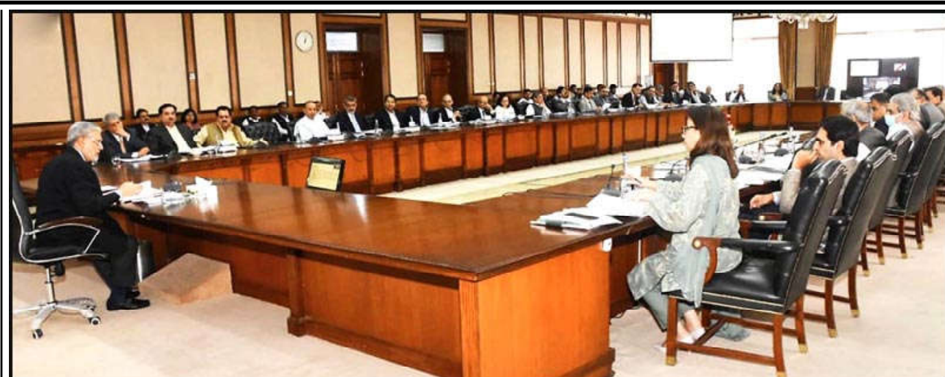
ISLAMABAD: Federal Minister for Finance and Revenue Senator Mohammad Ishaq Dar chaired the meeting of the Economic Coordination Committee (ECC) of the Cabinet.

The price of 10 grams of 24 karat gold also decreased by Rs.1,543 to Rs.187,500 from Rs.189,043 whereas the price of 10 grams 22 karat gold went down to Rs.171,875.