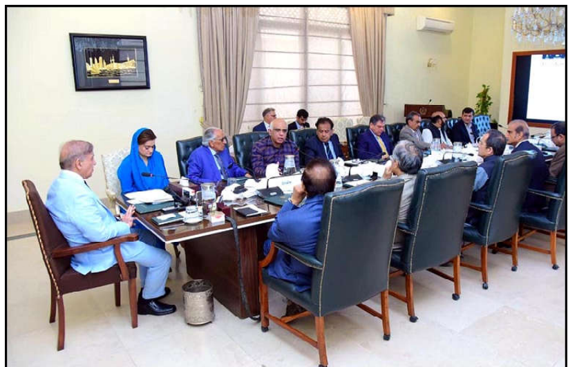
ISLAMABAD: Prime Minister Muhammad Shehbaz Sharif chairing a meeting regarding human smuggling and the recent capsizing of a boat in the Mediterranean near Greece.

At the end of his visit, the Mayor Karachi inspected the development works on the Shadman Nala where the accident took place last year.