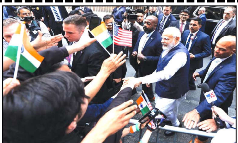
Indian PM Narendra Modi is greeted by supporters upon his arrival at a hotel in New York City.

ture or assert that we don't have challenges ourselves." "Ultimately, the question of where politics and the question of democratic institutions go in India is going to be determined within India by Indians. It's not going to be determined by the United States," Sullivan said. Modi has been to the United States five times since becoming prime minister in 2014, but the trip will be his first with the full diplomatic status of a state visit, despite concerns over what is seen as a deteriorating human rights situation under his Hindu nationalist Bharatiya Janata Party.