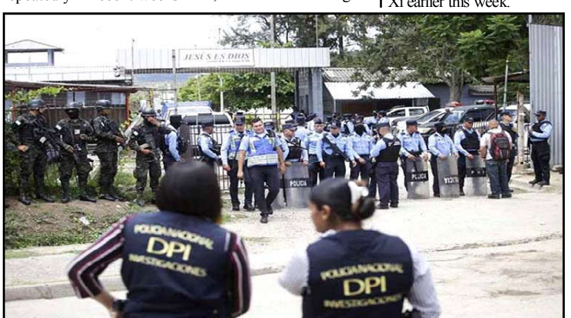
A brawl broke out at the prison between members of rival gangs Barrio 18 and the Mara Salvatrucha.

1,000 officials are subject to asset freezes and travel bans. Much work in the latest batch of sanctions has involved closing loopholes so that goods vital to Putin's war effort don't get through via nations that trade with the EU and have maintained a business-as-usual relationship with Moscow. European Commission President Ursula von der Leyen, the head of the EU's executive arm, said the new package will "deal a further blow to Putin's war machine with tightened export restrictions."