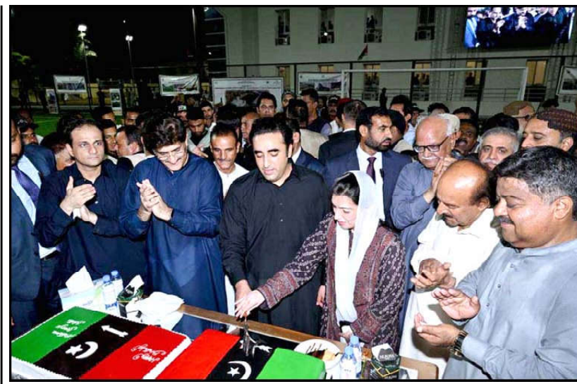
KARACHI: Bilawal Bhutto Zardari, Foreign Minister cutting cake to celebrate 70th birthday of Shaheed Mohtarma Benazir Bhutto.

The Prime Minister directed the FIA to promptly complete the detailed investigation of the matter and to take effective measures to prevent it.