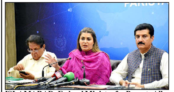
ISLAMABAD: Federal Minister for Poverty Alleviation and Social Safety and Chairperson Benazir Income Support Programme Ms. Shazia Marri address a Press Conference on 70th Birthday of Shaheed Mohtarma Benazir Bhutto. Mr. Faisal Karim Kundi, MOS PA&SS is also present.

The federal minister said that oil and gas production increased during the tenure of Shaheed Benazir Bhutto while Pakistan's relations with foreign countries were also significantly improved.