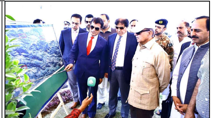
ISLAMABAD: Prime Minister Muhammad Shehbaz Sharif being briefed regarding the upgradation and rehabilitation project of Sikander e Azam Road.