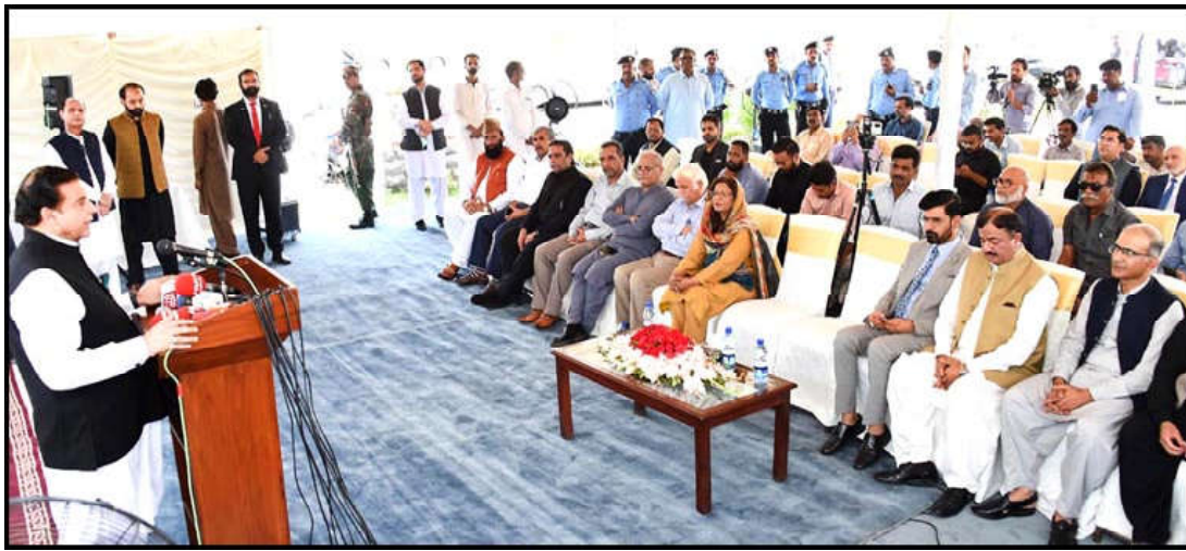
ISLAMABAD: Speaker National Assembly Raja Pervez Ashraf addressing the participants of Ground-Breaking Ceremony of Bagh-e-Dastoor at D-Chowk.