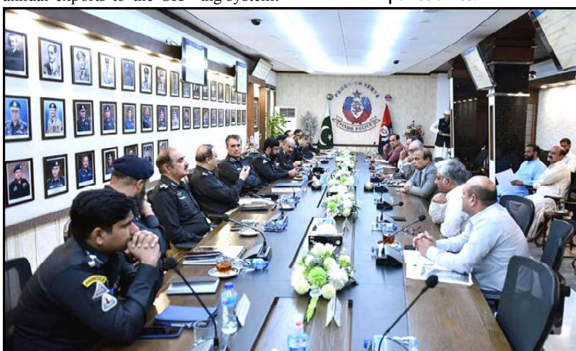
KARACHI: Inspector General of Police (IGP) Sindh, Ghulam Nabi Memon presides over the high level meeting held at CPO Headquarters in Karachi.

Under the Bill, the women employees of the public and private departments under administrative control of the Federal Government will be entitled to avail maternity leave with full pay for three times during service - 180 days for first time, 120 days for second time and 90 days for third time. Similarly, the male employees will be entitled to avail paternity leave of 30 days only for three times.