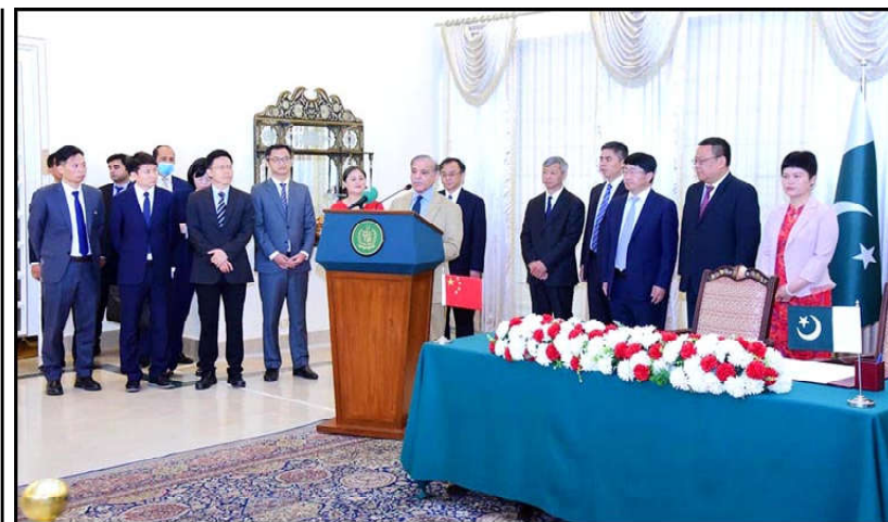
ISLAMABAD: Prime Minister Muhammad Shehbaz Sharif addressing a ceremony for signing of agreement for Unit 5 of Chashma Nuclear Power Plant (C-5).

He said all the initiatives were being taken for