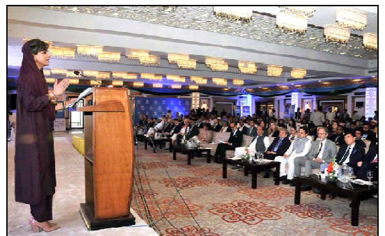
ISLAMABAD: Minister of State for Foreign Affairs, Ms. Hina Rabnani Khar addressing during World Refugee day organized by the office of the United Nations for Refugees at local hotel.

Kabulov was also part of the Russian delegation. The two sides engaged in comprehensive and productive discussions to further strengthen bilateral cooperation and to deepen understanding on regional and global issues of mutual interest. "The talks encompassed a wide range of topics including political, economic, defence, energy and people-to-people contacts," the spokesperson said. The two sides also expressed satisfaction at the upward trajectory of cooperation in the field of energy and agreed to expand cooperation.