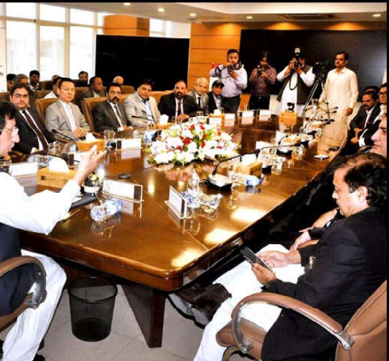
ISLAMABAD: Federal Minister for IT and Telecommunication Syed Amin Ul Haque chairing a meeting during the MoU Signing Ceremony of TDM to IP and Copper Wire to Optical Fiber Cable Migration of NTC Exchanges Phase 2 at National Telecommunication Corporation (NTC) Headquarters.

premises to provide medical assistance to the children who need it. The Federal Government will ensure the availability of paramedical staff in all government schools to provide medical assistance to the children. In case of violation, a fine of up to Rs 100,000 after the first warning, and imprisonment of up to six months thereafter can be imposed. The president approved the Bill under Article 75 of the Constitution.