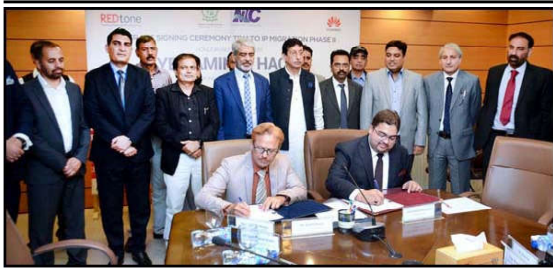
ISLAMABAD: Federal Minister for IT and Telecommunication Syed Amin Ul Haque witnessing contract signing for TDM to IP and Copper wire to Optical Fiber Cable Migration of National Telecommunication Corporation (NTC) Exchanges Phase 2.