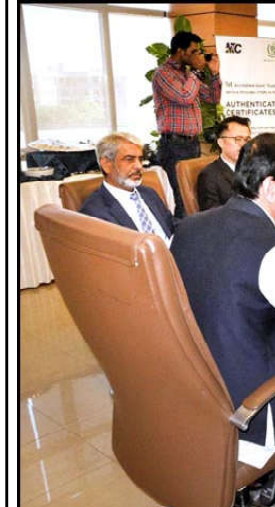
ISLAMABAD: Federal Minister for IT and Telecommunication Syed Amin Ul Haque chairing a meeting during the MoU Signing Ceremony of TDM to IP and Copper Wire to Optical Fiber Cable Migration of NTC Exchanges Phase 2 at National Telecommunication Corporation (NTC) Headquarters.

According to sources they have exchanged views with reference to petition against trial of civilians in military courts. PPP leaders requested the CJP to fix the petition for early hearing. The sources said the prevailing situation in the country and other legal matters came under discussion.