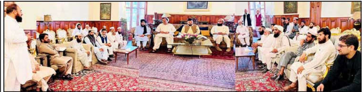
PESHAWAR: Khyber Pakhtunkhwa Governor Haji Ghulam Ali talking to 28-member delegation, consisting of elected chairpersons, councilors, and representatives from political parties.

He said that the provincial government is committed to ensure equal development in all urban and rural areas of the province. Furthermore, the federal government is also providing assistance to expedite the development process. The Governor said that local representatives are closest to the people and, therefore, funds have been allocated in the budget for elected municipal representatives to initiate developmental projects at the grassroots level. Governor Haji Ghulam Ali urged the elected representatives from all districts.