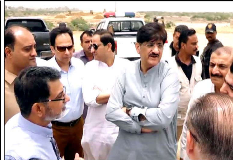
KARACHI: Sindh Chief Minister, Syed Murad Ali Shah along with others being briefed by officials about construction work of Malir Expressway road under the supervision of local government department, during his inspection visit in Karachi.

from Quaidabad to Kathore 15 percent progress had been achieved. The CM was told that the project had six interchanges and six straight bridges on which work was in progress. The Chief Minister said that with the completion of the project, the traffic congestion in the city would come down. The project would cut around 40 km distance for the traffic coming towards Karachi and going out to Jasmshoro and even to Thatta. Syed Murad Ali Shah said that the completion of the project would usher in new vistas of development in Malir, particularly in the areas of Memon Goth and its adjoining areas. Sindh Chief Minister Syed Murad Ali Shah during his visit to Malir Expressway inspected the damaged Weir at Razak Goth, RD-1 of the Malir River.