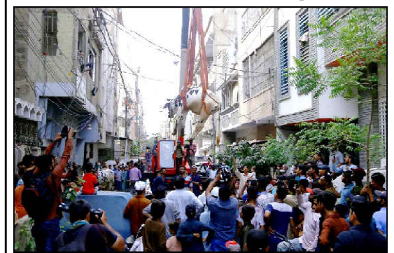
KARACHI: People use a crane to lift a young bull from the roof of a building for the upcoming festival Eid-ul-Azha, at Nazimabad in Karachi.

whom were elected from Hyderabad, expressed dissatisfaction over the performance of HESCO. They said the power outages frequently struck parts of Hyderabad during light to moderate rain during the last few days. The MNAs requested Prime Minister Shehbaz Sharif to direct the officers of HESCO to submit details of the expenditures incurred during the cyclone and rain-related operations.