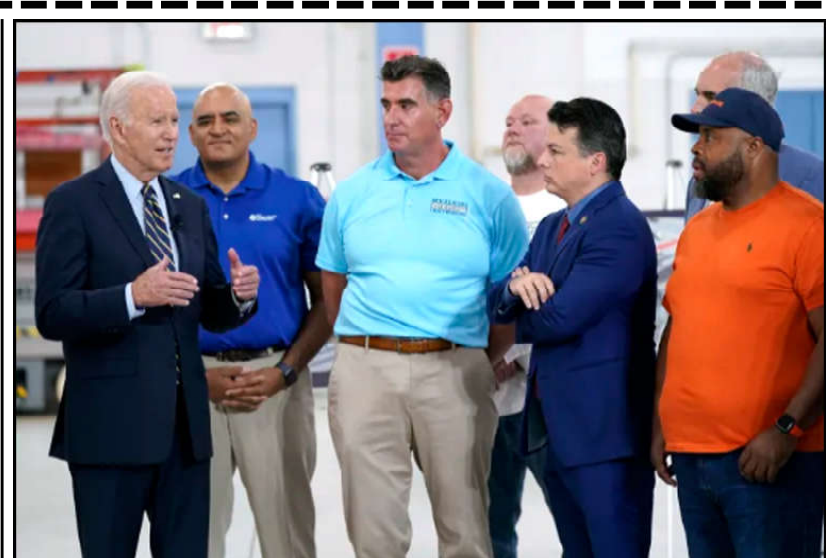
President Joe Biden speaks at the Philadelphia International Airport in Philadelphia after an aerial tour of the Interstate 95 highway collapse.

ing threats of retaliation from Russia. German Leopard 2 tanks, British Challenger 2 tanks and American Bradley and Stryker vehicles are among the Western equipment that has been sent to Ukraine. In late April, NATO Secretary-General Jens Stoltenberg said that NATO allies and partners had delivered more than 1,500 vehicles and 230 tanks to the country. During his speech in St. Petersburg, Putin said Russia had destroyed tanks "including Leopards" at the front lines.