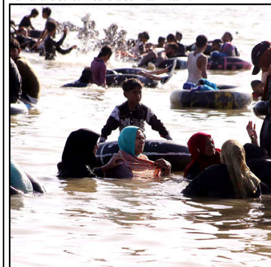
THATTA: Large number of people enjoying bathing in Keenjhar lake people come here for picnics during the summer school holidays to get relief from hot weather.