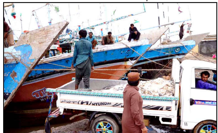
THATTA: Fishermen are anchoring on shore as they are returning to their homes after fishing at Keti Bandar Beach after removed ban on fishing on subsided of Cyclone Biporjoy, in Thatta.

INDEPENDENT REPORT KARACHI: According to the instructions of Chairman FBR Asim Ahmad and on the orders of Director General Customs Intelligence Faiz Ahmad Chadhar, the crackdown against cigarette smugglers was intensified. Customs Intelligence has seized smuggled cigarettes worth Rs 303 million during nationwide operations in the last ten days. The largest operation was carried out in Balochistan, where Customs Intelligence seized 4,280,000 cigarettes of foreign brands worth Rs 114.2 million. While in Sindh province, as a result of eight operations, 1,420,700 cigarettes of top brands worth Rs. 69.7 million were confiscated. Similarly, during intelligence-based operations in Punjab, the Customs Intelligence team recovered 1,294,000 smuggled cigarettes worth Rs 75.3 million.