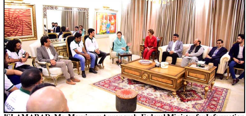
ISLAMABAD: Ms. Mariyum Aurangzeb, Federal Minister for Information and Broadcasting addressing the NASFF's high achievers who are leaving for Australia to participate in the National Amateur Film Festival Award.