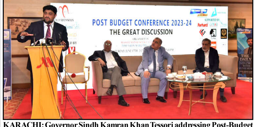
KARACHI: Governor Sindh Kamran Khan Tessori addressing Post-Budget Conference.

ISLAMABAD (Online): Pakistan and Iran have agreed to deepen cooperation in trade, energy, transport, connectivity, cultural exchanges and educational linkages. The understanding was reached during wide-ranging discussions between Pakistan's Foreign Secretary Dr. Asad Majeed Khan and Iran's Deputy Foreign Minister Ali Bagheri Kani on the occasion of 12th bilateral consultations in Tehran. According to Foreign Office, the two sides held fruitful talks on entire spectrum of relations. Foreign Secretary Asad Majeed Khan Sunday interacted with Iranian scholars and academia in Tehran. They discussed Pakistan's vision for peace and development in the region by prioritizing regional partnerships and connectivity. They underlined that Pakistan and Iran were partners in regional peace and stability.