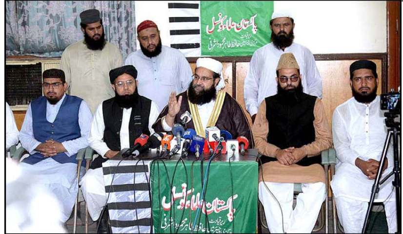
LAHORE: Special Assistant to the Prime Minister on Religious Harmony Maulana Tahir Ashrafi addressing a press conference at Begumpura GT Road.