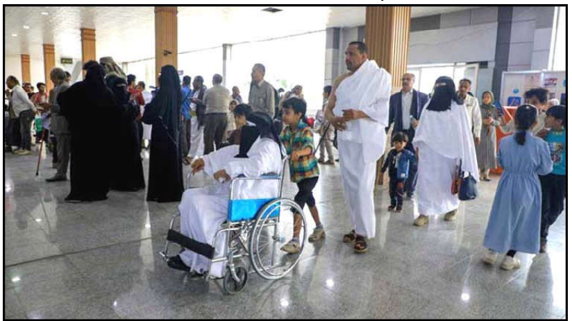
Plane leaves Yemen capital for Saudi, first since 2016.