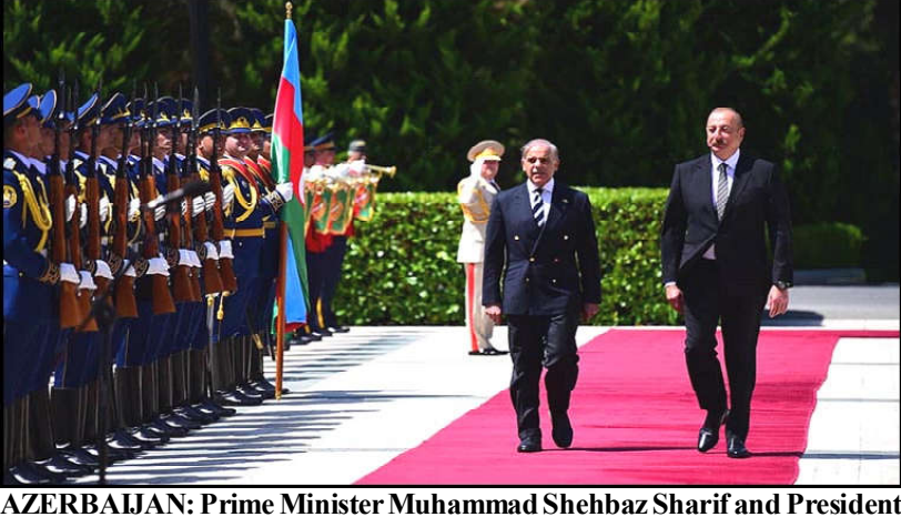
of Azerbaijan inspecting guard of honor at Zugulba Palace.

The one-way drone was launched on Wednesamong Abraham Accords countries from $853 million day from the Jask area of Iran 8-9 miles out to sea within Iran's territorial waters - against a practice barge, the official said, citing U.S. intelligence data. Essentially practicing hitting merchant vessels