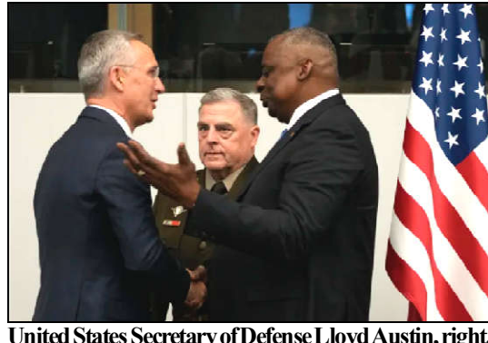
United States Secretary of Defense Lloyd Austin, right, greets NATO Secretary General Jens Stoltenberg during a meeting of the Ukraine Defense Contact Group at NATO headquarters in Brussels.

ther provocations and are maintaining readiness in close coordination with the United States," it said, terming the launches as a "grave provocation" violating UN sanctions. The missile launches were also confirmed by Tokyo, saying that they had landed in waters within Japan's exclusive economic zone.