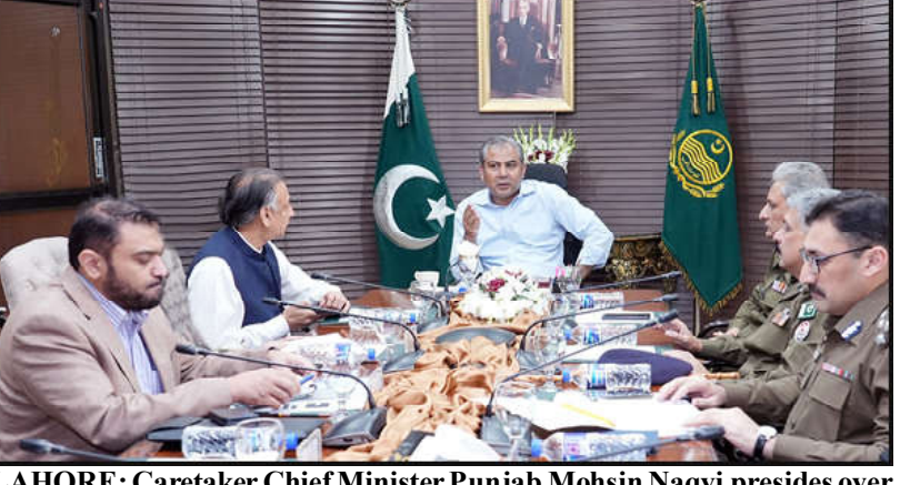
LAHORE: Caretaker Chief Minister Punjab Mohsin Nagyi presides over the meeting to review progress of taking action against the elements involved