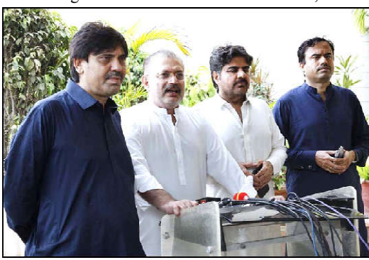
KARACHI: Sindh Information Minister Sharjeel Inam Memon holds a press conference outside Sindh Assembly building.

bent government, through the Benazir Income Sup port Programme, successfully distributed cash assistance to those affected by devastating floods and the the recent floods, she said