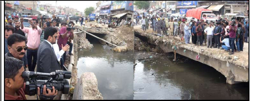
KARACHI: Governor Sindh Kamran Khan Tessori inspecting cleanliness work of Gujr Nullah Federal B Area.

from the country, were getting Rs 300,000-350,000 monthly salaries while holding their positions intact on stay orders of the courts. The minister said revenue collection was the major source of the country's income, but it was unfortunate that billions of rupees tax evasion was taking place. Citing examples of some sectors, he said in the real estate around Rs 500 billion tax was evaded with under-invoicing and on account of land evaluation, Rs 240 billion in tobacco sector as two foreign companies were paying 99 percent tax and rest of the companies which constituted 40 percent paid only 1 per cent.