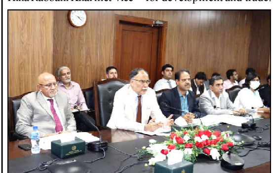
ISLAMABAD: Federal Minister for Planning Development & Special Initiatives, Ahsan Iqbal chaired a meeting to review the progress of projects in Gwadar.

During a meeting with Chair of International Trade Committee Bernd Lange, the both sides discussed the upcoming GSP Plus scheme and Pakistan's position on it. MoS Hina also met Vice Chair of sub-committee on human rights MEP Bernard Guetta where she briefed him on human rights violations in Indian Illegally Occupied Jammu and Kashmir (IIOJK). They also discussed developments in Ukraine. The two sides agreed to enhance engagements in the future. They also discussed the impetus given by GSP Plus scheme to Pakistan's exports and the importance of continued Pak-EU collaboration for development and trade.