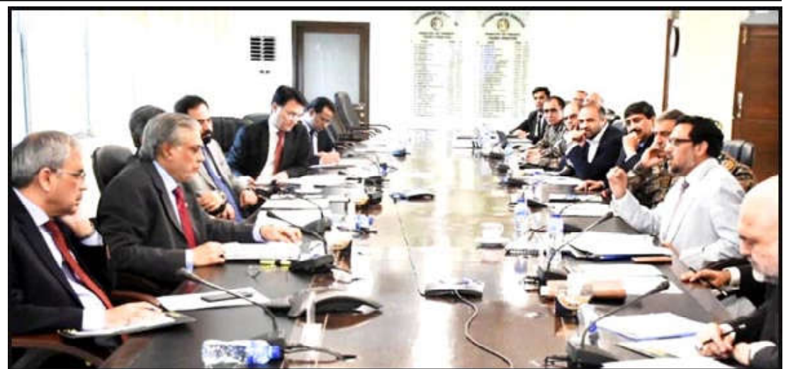
ISLAMABAD: Federal Minister for Finance and Revenue, Senator Mohammad Ishaq Dar chaired a meeting on Civil Aviation issues, at Finance Division.

France, through the French Development Agency, is providing technical and financial support in several sectors such as energy, water and sanitation, urban development, and cultural heritage. The French loan will support NTDC in the components of the projects including: Construction of a new 220kV substation and 50km of new 220kV transmission lines to be connected to it in Aarifiwala, which will be connected to the MEPCO grid.