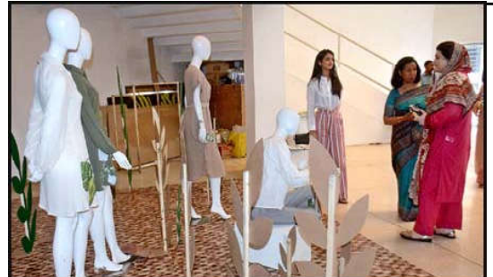
LAHORE: Students of Kinnaird College for Women taking keen interest in Textile Exhibition at Al-Hamra Art Gallery.