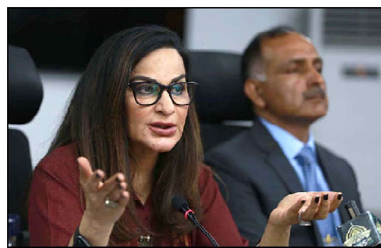
ISLAMABAD: Federal Minister for Climate Change Sherry Rehman briefs to media persons about Cyclone Biparjoy during a press conference at NDMA.

"The radius of the cyclone appears to be greater than the previous one of 1999," the minister said. Senator Rehman