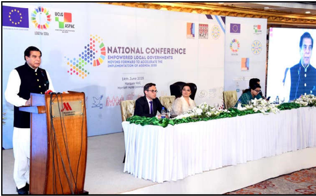
ISLAMABAD: Speaker National Assembly Raja Pervez Ashraf addressing the participants of National Conference—Local Democracy Moving Forward for Achieving Sustainable Development Goals in Pakistan.