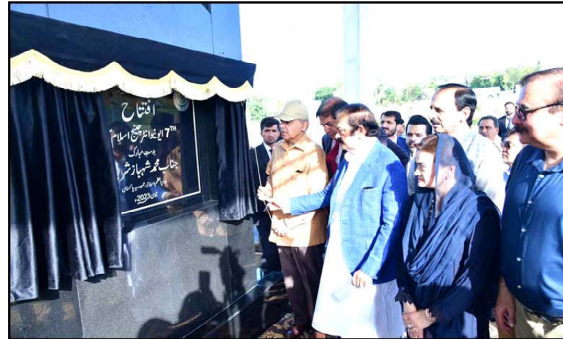
ISLAMABAD: Prime Minister Muhammad Shehbaz Sharif inaugurates 7th Avenue Interchange on Srinagar Highway.

The May 9 incidents ashamed the whole nation, he said adding the martyrs sacrificed their lives for the sake of the country's security and saved hundreds of thousand children from becoming orphan by making their own children orphans.