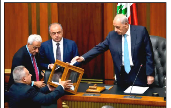
Lebanese Parliament Speaker Nabih Berri casts his vote as parliament gathers to elect a president at the parliament building in downtown Beirut, Lebanon.

Lukashenko said in an interview with the Rossiya-1 Russian state TV channel which was posted on the Belarusian Belta state news agency's Telegram channel. "The bombs are three times more powerful than those (dropped) on Hiroshima and Nagasaki," he said, speaking on a road in a forest clearing with military vehicles parked nearby and some kind of military storage facility visible in the background. Russian President Vladimir Putin said on Friday that Russia, which will retain control of the tactical nuclear weapons, would start deploying them in Belarus after special storage facilities to house them were made ready.