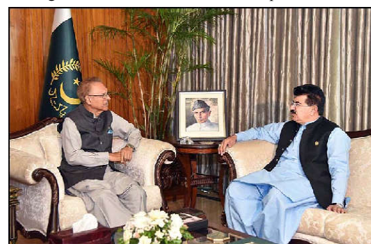
ISLAMABAD: Chairman Senate, Muhammad Sadiq Sanjrani, called on President Dr. Arif Alvi at Aiwan-e-Sadr.

Further asked whether Pakistan consulted with the U.S. before the deal, he said, "I'm not going to speak to any private diplomatic conversations, other than to say that we consult with partners all around the world on these questions."