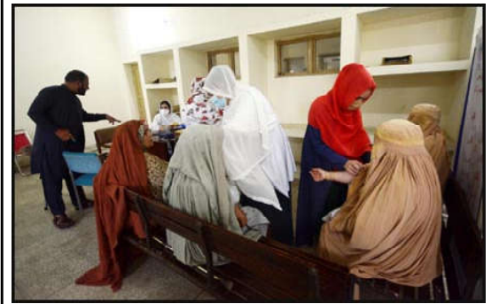
PESHAWAR: People receiving vaccination at a Haj center in Peshawar, Hayatabad.

associates announced to join Qaumi Watan Party. Sikandar Sherpao said due to the incompetence of the previous rulers, the province is the victim of financial instability and the economic crisis is looming here. The policies of the previous government have not only affected the people and economy of the province but rather have also increased backwardness to an extent. He said that keeping in view the current situation the federal government should not only hand over the net profit on electricity net profit to the province, rather also take steps to increase the shares of small provinces by ensuring the early holding of the NFC.