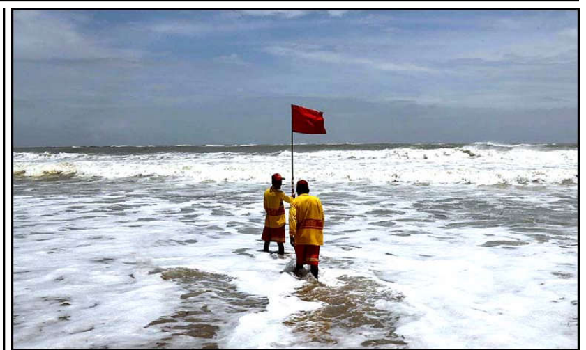
KARACHI: Officials placing red flag after alerts issued by the authorities regarding the effects of cyclone "Biparjoy" at the Hawksbay Beach.

The Minister underlined that the cyclone was at 370 km distance from Karachi and 290 km from Ketu Bandar and was near Sir Creek.