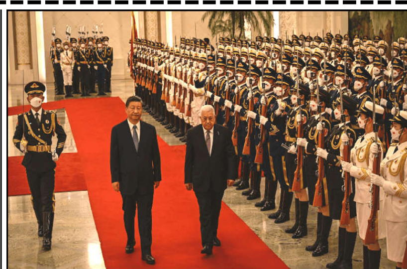
China's President Xi Jinping (C) and Palestinian President Mahmud Abbas attend a welcoming ceremony at the Great Hall of the People in Beijing.

But finding a lasting solution to Israeli-Palestinian tensions may prove more elusive, as peace negotiations between the two sides have been stalled since 2014.