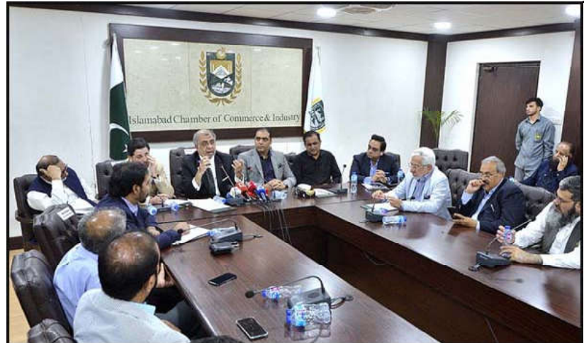
ISLAMABAD: Minister of State and Chairman Reforms and Reduces Mobilization Committee Ashfaq Yousuf Tola addressing to the post budget session at Islamabad Chamber of Commerce & Industry.