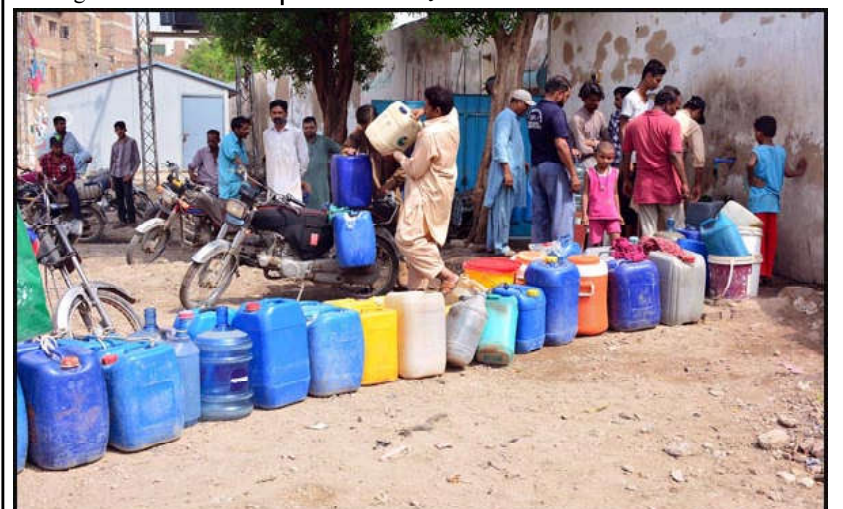
HYDERABAD: People filling their pots with clean water from Filter plant at Latifabad.