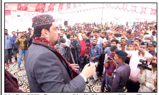
KARACHI: Governor Sindh Kamran Khan Tessori addressing during his visit to Chashma Ghot Ibrahim Haidri.

Those who took oath include 10 candidates of Town Municipal Committee HM Khoja, 9 of Union Committees of Town Municipal Committee Old Nawabshah of Municipal Corporation Nawabshah and specified candidates of 5 union councils of tehsil Nawabshah.