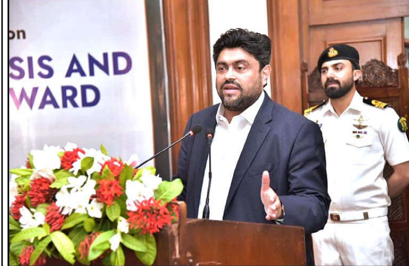
KARACHI: Governor Sindh Kamran Tessori addressing a seminar 'energy and environment'.