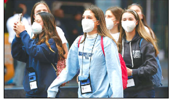
People wear masks during the morning rush hour as smoke from wildfires in Canada affected New York.

zations for international humanitarian organizations, the U.N. Office for the Coordination of Humanitarian Affairs said in a situation report. It said the suspension of aid activities "could not have come at a worse time" because of the arrival of the annual monsoon season. The report did not say why the military government's Disaster Management Committee suspended the travel authorizations. Myanmar's military has long kept access to many parts of the country under tight restrictions, especially areas seen as sensitive because of tensions with ethnic minorities, as is the case with Rakhine, where a brutal counterinsurgency campaign in 2017.