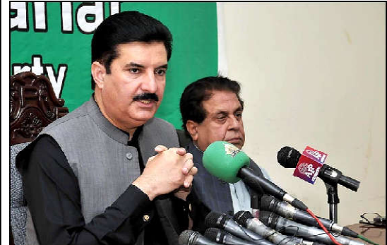
ISLAMABAD: Minister of State for Poverty Alleviation and Social Safety Faisal Karim Kundi addressing a press conference at PPP Office.

Further Maryam maintained that Rs.6210 billion tax collected which was 348.2 billion Pkr last year. Current fiscal year despite the target of 7 lacs, 9 lacs 12 thousand new tax payer were registered. This is proving of increase in tax net. 1.15 trillion Pkr was allocated for development budget which will increase economic activities in country.