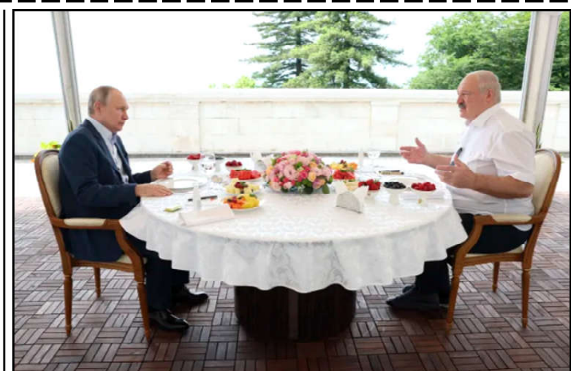
Russian President Vladimir Putin and Belarusian President Alexander Lukashenko talk during their meeting at the Bocharov Ruchei residence in the resort city of Sochi, Russia.

start the activities linked to the deployment of those weapons on your territory." Tactical nuclear weapons are intended to destroy enemy troops and weapons on the battlefield. They have a relatively short range and a much lower yield than nuclear warheads fitted to long-range strategic missiles that are capable of obliterating whole cities. Putin announced the planned deployment of the short-range nuclear weapons in Belarus earlier this year in a move widely seen as a warning to the West as it stepped up military support for Ukraine.