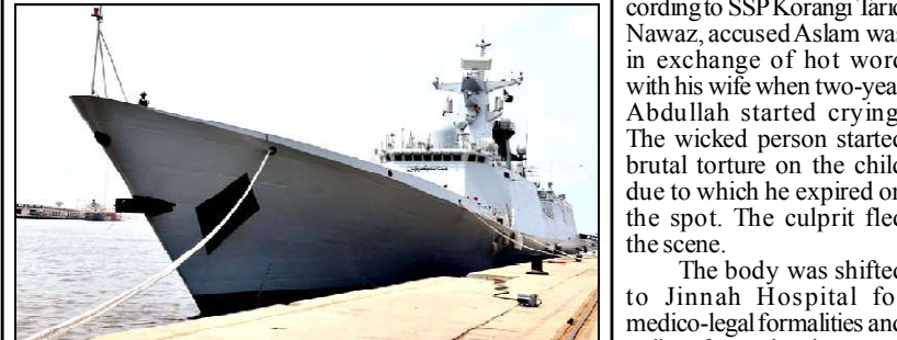
KARACHI: Pakistan Navy Ship Shahjahan arrives at Karachi Port.

During her maiden voyage to Pakistan, PNS Shahjahan visited Malaysia and participated in Langkawi International Maritime and Aerospace Exhibition (LIMA) along with other 30 participating countries, said a Pakistani Navy news release on Friday.