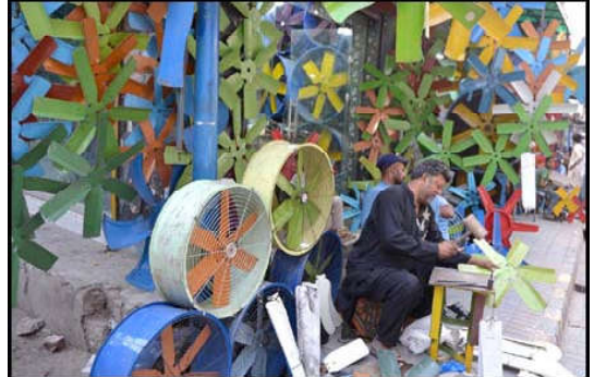
LAHORE: An electrician busy to repairing room-coolers at his workplace in the Provincial Capital.

The Pakistani transportation system needs modernization and the National Transport Master Plan is in the final stages of approval many actions under the policy and the plan are being already adopted and implemented. In recent years the work in the transport infrastructure projects was carried out in the districts of southern Punjab, southern KP.