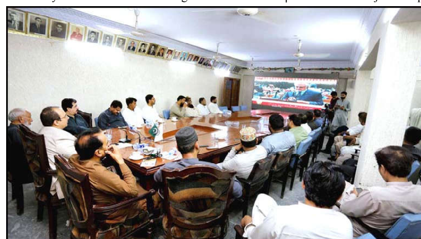
HYDERABAD: Business community listening the budget speech at Chamber of Commerce by Finance Minister Senator Mohammad Ishaq Dar for the fiscal year 2023-24.

One of the key provisions of the agreement is the allocation of an additional cash assistance amounting to Rs 30 million to the flood victims, aiming to provide immediate relief and address their urgent needs.