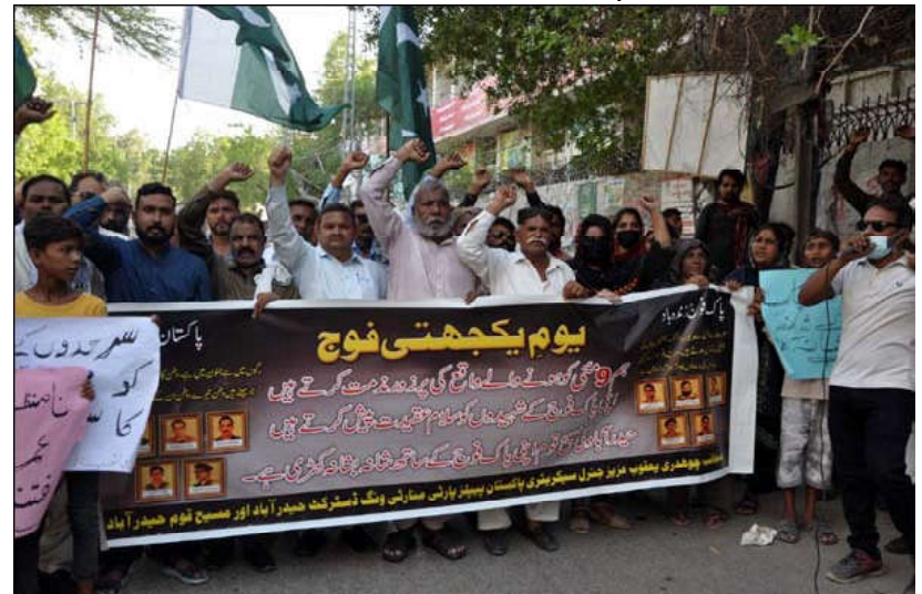
HYDERABAD: Members of Christian Community are holding demonstration in support of Pakistan Armed Forces, at Hyderabad press club.