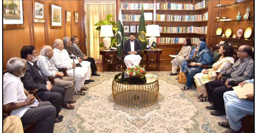
KARACHI: A delegation of Department of Yadgar-e-Ghalib Library meeting with Governor Sindh Kamran Tessori at Governor house.

Even with a significant increase in debt servicing, the fiscal deficit reduced to 4.6 percent of the gross domestic product (GDP) in July-April FY 2022-23 against 4.9 percent for the same period last year, while the primary balance reverted from deficit to surplus. During the first 11 months of the outgoing fiscal year, the trade deficit was narrowed down by 40 percent and the current account deficit by 76 percent during July 2022-April 2023.