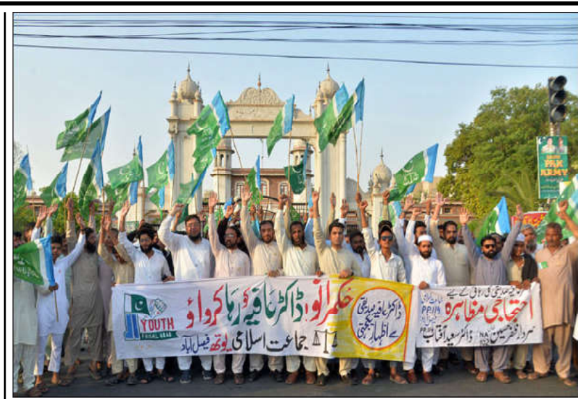
FAISALABAD: Workers of Jamat-e-Islami (Youth Wing) are shouting slogans holding banner and flags during protest to show solidarity with Aafia Siddiqui, at District Council Chowk in City.