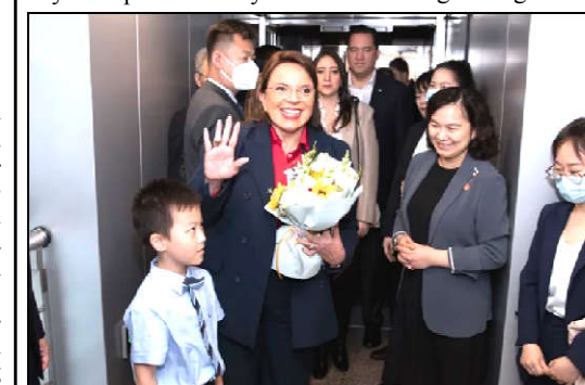
Honduras' President Xiomara Castro waves as she arrives in Shanghai, China.

On Wu's Europe trip, which Taiwan's government has not officially confirmed, he is expected to speak at a think-tank event in Prague immediately after Czech President Petr Pavel. Reuters reported on Thursday. Asked about the visit on Friday, Czech Minister Lipavsky said he had "been informed" about Wu coming to Prague.