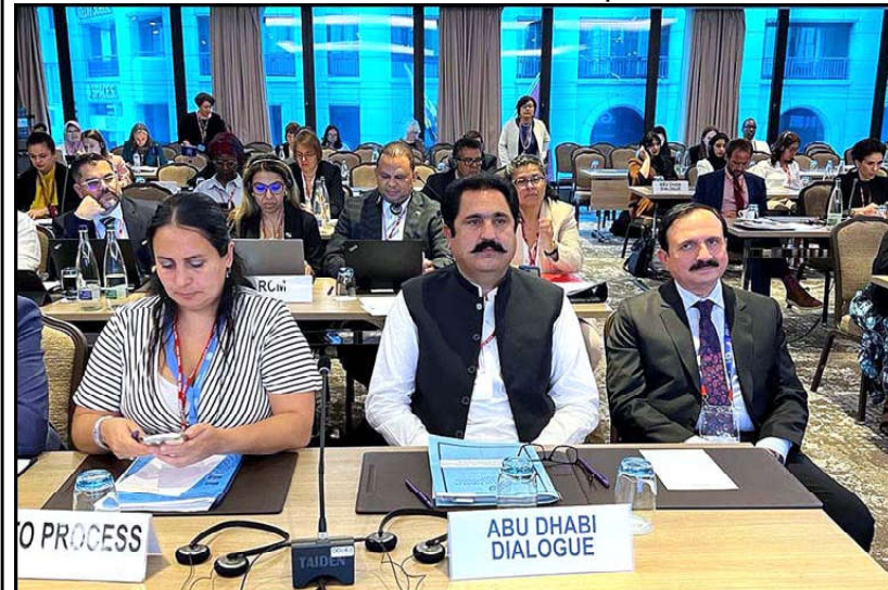
GENEVA: Pakistan's delegation in the "Tenth Global Meeting of Inter-State Consultation Mechanisms on Migration (GRCP10) led by Federal Minister Sajid Hussain Turi.

MARDAN (Online): Pakistan Tehreek-e-Insaf (PTI) leader Ali Muhammad Khan was arrested once again on Friday right after being released on the orders of the Peshawar High Court (PHC) from a day earlier. The PTI leader's lawyer told reporters that the current arrest was made on corruption charges; he was subsequently transferred to the Toru police station. Yesterday, the PHC had order Khan's release after hearing a petition against his arrest under Section 3 of the Maintenance of Public Order (MPO).