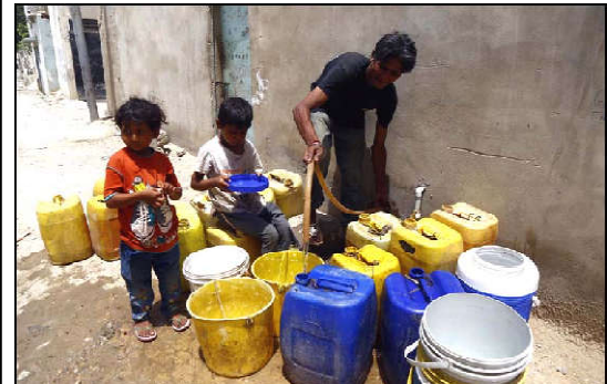
KARACHI: People are filling their water cans from public tap as they facing shortage of drinking water in their area, at Malir area in Karachi.

Minister Kundi said fruitful discussions were also held regarding strengthening cooperation between the two countries in the trade, tourism, and health sectors.