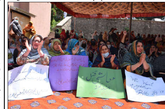
MUZZAFFARABAD: Azad Kashmir school teachers are holding a banner shouting slogan during protest due to up gradation of teachers at Azadi Chowk.