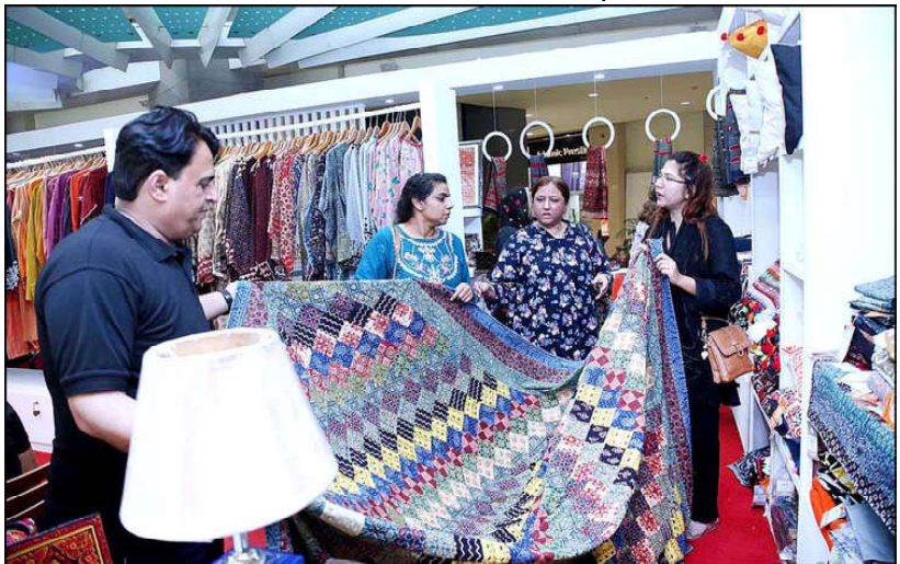
KARACHI: Visitors showing their keen interest in handicrafts during 13th Sartayon Sang Crafts Exhibition organized by the Sindh Rural Support Organization (SRSO) in collaboration with the Sindh Government to facilitate better incomes for the women artisans of rural Sindh.