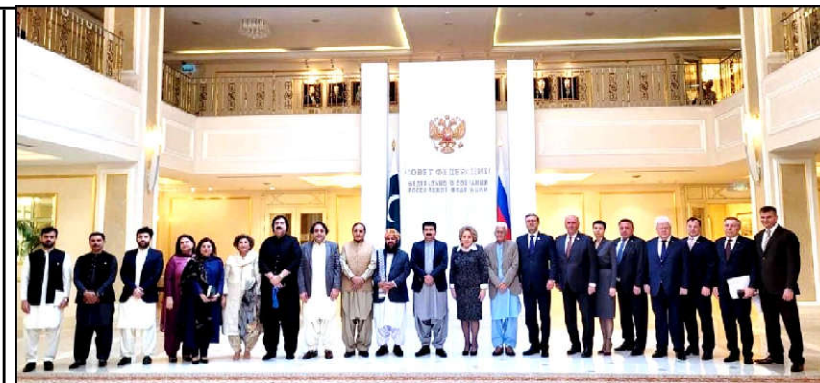
MOSCOW: Chairman Senate Muhammad Sadiq Sanjrani and Senators in a group photo with Speaker of the Federation Council of the Federal Assembly of the Russian Federation, Valentina Matvienko.