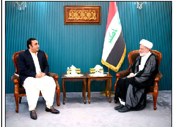
IRAQ: Minister of Foreign Affairs of Pakistan Bilawal Bhutto Zardari in a meeting with head of Islamic Supreme Council of Iraq Dr Sheikh Humam Hamoudi during his visit of Iraq for bilateral relations in various fields of cooperation.

During his meeting with President of Al-Hikmet Party of Iraq Ammar Hakeem, Bilawal Bhutto Zardari discussed the historic, religious and cultural linkages between the two countries deep-rooted in mutual respect and understanding.