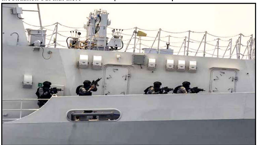
Philippines, Japan, US hold first trilateral coast guard manoeuvres.

Monitoring Desk OSLO: Finland will expel nine diplomats working at the Russian embassy in Helsinki, accusing them of working on intelligence missions, the Finnish president's office said on Tuesday. "Their actions are contrary to the Vienna convention on diplomatic relations," the president's office said in a statement, adding that it would inform the Russian ambassador of the expulsions.