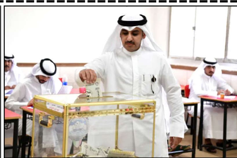
A man casts his vote for National Assembly elections at a religious school in Sabahiya district, Kuwait.

anti-missile systems and is a big generational leap in the field of missiles." "It can bypass the most advanced anti-ballistic missile systems of the United States and the Zionist regime, including Israel's Iron Dome," Iran's state TV said. Fatah's top speed reached mach 14 levels (15,000km/h), it added. Despite US and European opposition, the Islamic Republic has said it will further develop its defensive missile programme. However, Western military analysts say Iran sometimes exaggerates its missile capabilities.