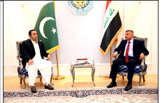
IRAQ: Minister of Foreign Affairs of Pakistan Bilawal Bhutto Zardari in a meeting with Minister of Interior of Iraq Lt General Abdulmimir Kamel Al-Shammari during his visit of Iraq for bilateral relations in various fields of cooperation.

ISLAMABAD (Online): Differences remain between Pakistan and International Monetary Fund (IMF) on targets of estimate tax collection in upcoming fiscal budget 2023-24. According to media reports IMF executive board meeting scheduled on 14 June and due to failure in making staff level agreement Pakistan's issue was not included in schedule.