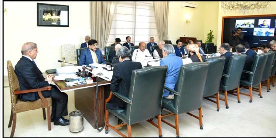
Prime Minister Muhammad Shehbaz Sharif chairs meeting of the National Economic Council in Islamabad.

Shedding light on the three tenures of PML-N, Sanaullah said that Nawaz Sharif did not bother about international pressure and conducted nuclear tests in 1998. "He made Pakistan a nuclear power, and due to nuclear deterrence, our enemy cannot attack us."