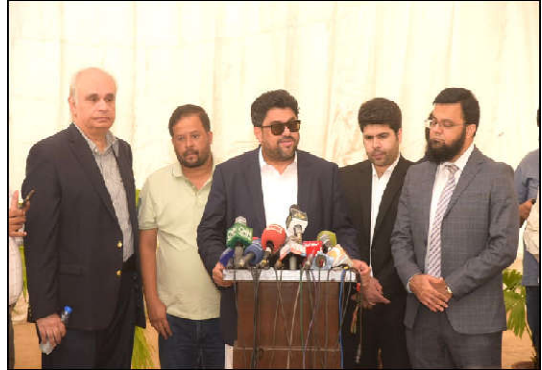
KARACHI: Sindh Governor Kamran Khan Tessori addressing a press conference.

The constitutional petitions against formation of audio leaks inquiry commission came up for hearing before a five members bench of SC presided over by CJP Umar Ata Bandial here Tuesday.