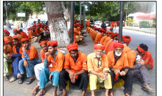
KARACHI: Collies are sitting at a roadside and waiting for the passenger at the Cantt station, in Provincial Capital.