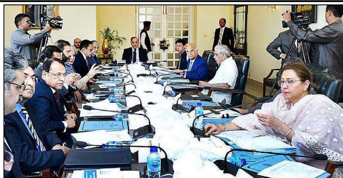
ISLAMABAD: Prime Minister Muhammad Shehbaz Sharif chairs a meeting on budget proposals regarding IT and Telecom Sector.

During the previous tenure of the PML-N government, they had distributed laptops among the country's youth and by utilizing this facility, the young people brought foreign reserves during the Covid pandemic, he observed.