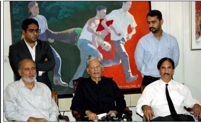
LAHORE: Senior Lawyer Aitzaz Ahsan addresses to media persons during press conference held at his residency in Lahore.