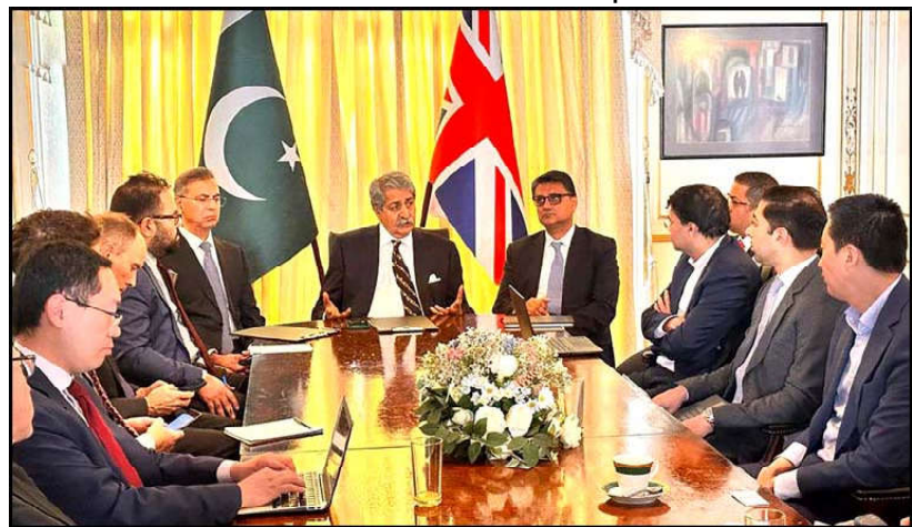
LONDON: Minister for Commerce Syed Naveed Qamar holding a productive meeting with leading investment firms at the Pakistan High Commission, London.

KARACHI (APP): The Pakistan Meteorological Department on Tuesday forecast very hot and dry weather for most parts of the province, including Karachi during the next 24 hours. The minimum and maximum temperatures recorded (in °C) were: in Karachi 35-37, Hyderabad 40-42, Sukkur 40-42, Thatta 36-38, Mohenjodaro 42-44, Dadu 43-47, Mithi 41-43, and in Nawabshah 41-43. Mainly very hot and dry weather is likely to prevail in the province.