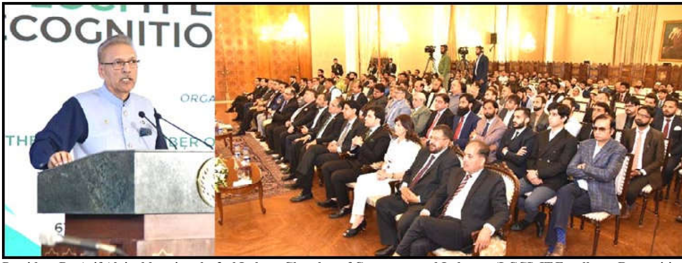
President Dr. Arif Alvi addressing the 3rd Lahore Chamber of Commerce and Industry (LCCI) IT Excellence Recognition Ceremony, at Aiwan-e-Sadr, Islamabad.