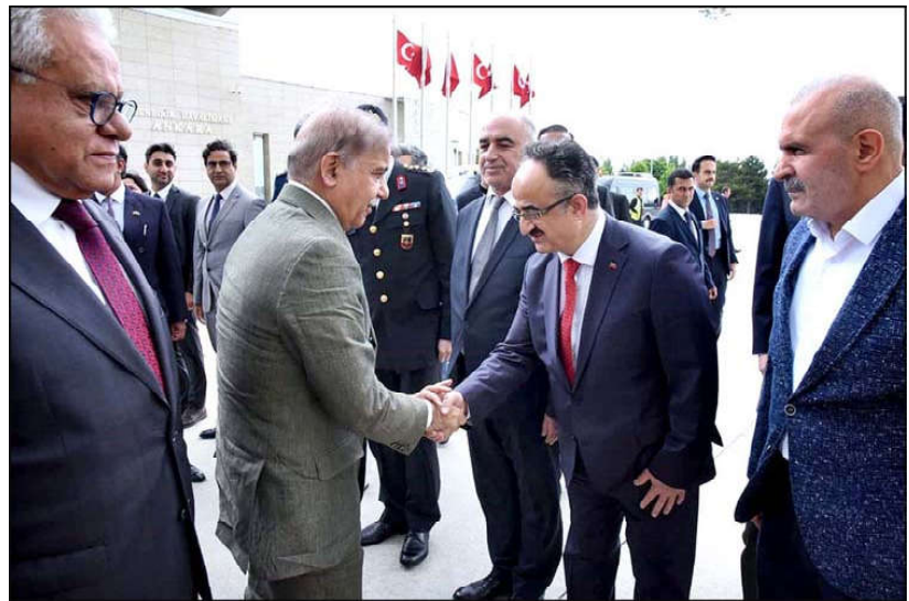
ANKARA: Prime Minister Muhammad Shehbaz Sharif departs from Ankara after completing his two day official visit of Turkiye.

He said that only operation of the airports would be outsourced and not the land or property. As a result of the arrangement, new contractors would develop, improve and operate the airports, and after completion of the agreement period, the contractors would hand over it to the government again. He said that the current administration had put it on the track and soon agreements would be signed with the best international airport operators. A credible company, International Finance Corporation (IFC) of the World Bank.