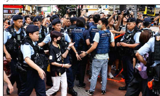
Police detain a person in downtown on the 34th anniversary of the 1989 Beijing's Tiananmen Square crackdown, near where the candlelight vigil is usually held, in Hong Kong, China.

Dagalo. For weeks, Saudi Arabia and the United States have been mediating between the warring parties. On May 21, both countries successfully brokered a temporary cease-fire agreement to help with the delivery of much-needed humanitarian aid to the war-torn country. Their efforts, however, were dealt a blow when the military announced on Wednesday it would no longer participate in the cease-fire talks.