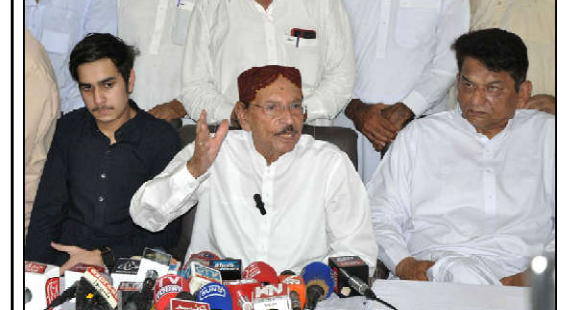
HYDERABAD: Former Chief Minister Sindh and senior leader Pakistan People's Party (PPP) Syed Qaim Ali Shah addressing a press Conference at Ansari House.

She would also meet lawmakers and local entrepreneurs.