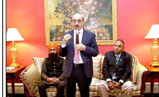
WASHINGTON: Ambassador Masood Khan addressing faith and community leaders at Pakistan House.

ISLAMABAD (APP): Minister for Climate Change Sherry Rehman Sunday strongly condemned the violent incidents of 9 th May terming it as 'a black stain on Pakistan's history and expressed full solidarity with families of martyrs.' The whole nation stands with armed forces and those who insulted the martyrs deserve the worst punishment', she said while talking to PTV news channel. The vandalism of the civil properties and defence installations on May 9 has exposed the wicked face of Imran Niazi and the government would have zero tolerance by taking strict action against attackers, she added. The minister said that it was our priority to look after the fami-