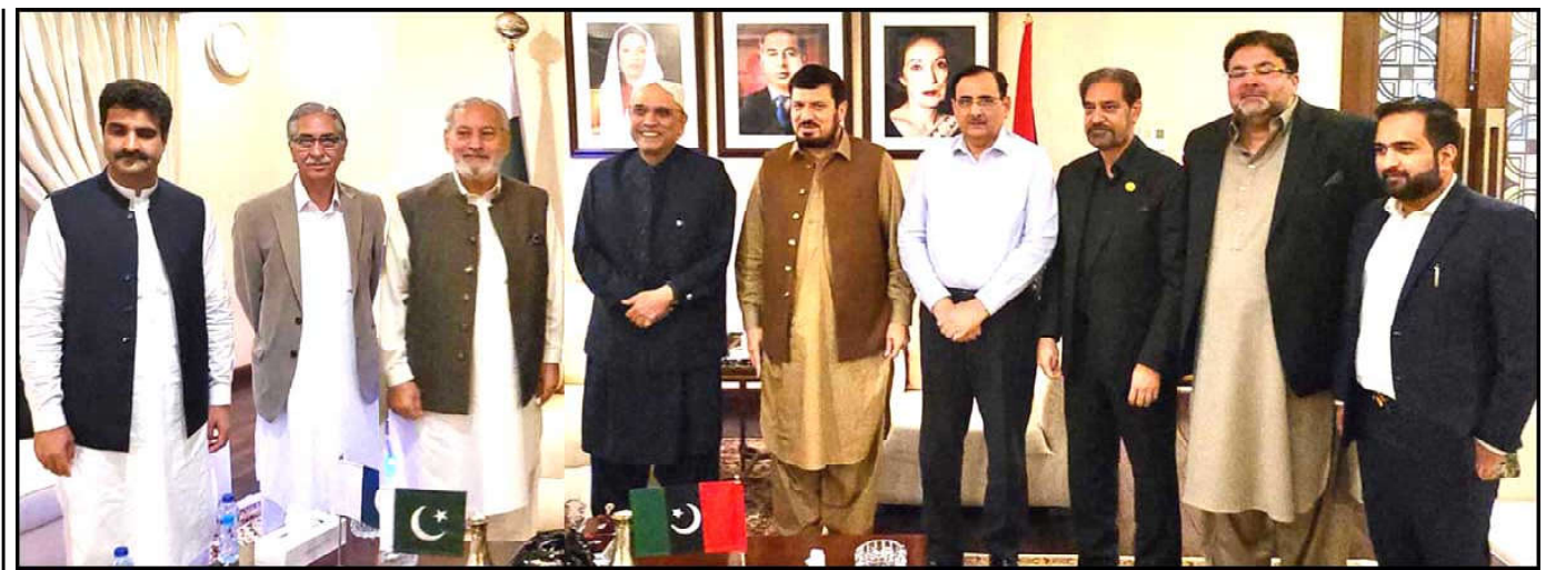
LAHORE: Pakistan People Party co-chairman and former president Asif Ali Zardari in a group photo with Khyber Pakhtunkhwa Governor Haji Ghulam Ali along with Caretaker Provincial Ministers during meeting.

On the occasion, he also met with Kosovo's President Vjosa Osmani-Sadriu.