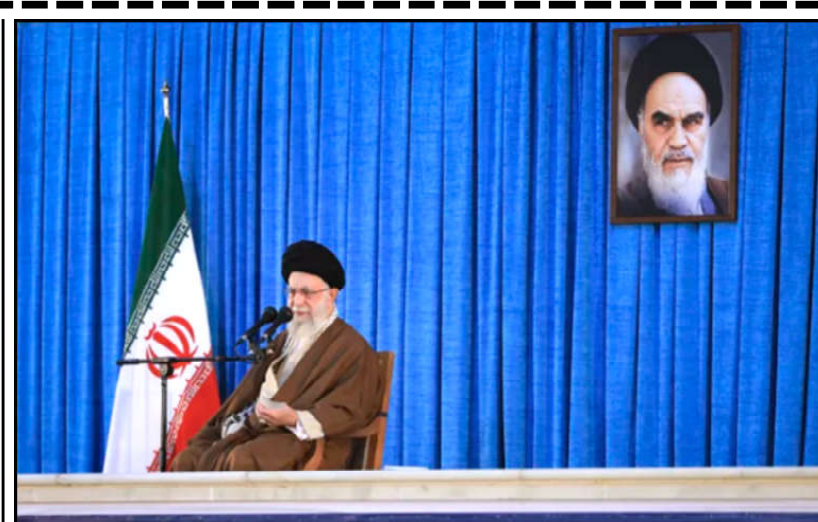
Supreme Leader Ayatollah Ali Khamenei speaks during a ceremony commemorating the death anniversary of the late revolutionary founder Ayatollah Khomeini at his mausoleum just outside Tehran, Iran.

Biden said that Congress has now preserved "the full faith and credit of the United States." But even with the House and Senate putting aside differences to finally rush through the agreement over the last week, the US economy's reputation took a hit.