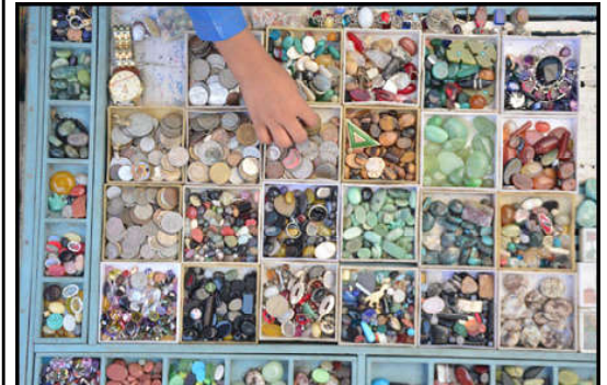
RAWALPINDI: A man is busy in selecting and purchasing gemstone and rings from roadside vendor in the city.

During the meeting, representatives of MFA highlighted the growth of Sharia compliant mutual funds and proposed that short term Sharia compliant sukuk should be launched.