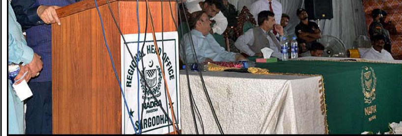
FAISALABAD: Interior Minister Rana Sana Ullah Khan addressing a public gathering during inauguration ceremony of NADRA Registration Center Aminpur Bangla and Passport Counter in Chak No.30-JB on Narwala-Aminpur Road.

that the ministry had taken steps to secure buildings at more affordable rates. He revealed that the ministry had rented buildings between SR1,800 and SR2,300, compared to the higher rental fee of SR2,600 in 2019. Despite the significant difference in inflation rates between 2023 and 2019, the ministry managed to secure accommodations at lower prices, he maintained. Furthermore, the minister emphasized the importance of efficient management of medicines for the pilgrims stating that more than fifty per cent of the required medicines could be obtained through donations, while the remaining medications could be purchased from pharmaceutical companies at their actual cost of production. By effectively managing these resources, the ministry could have saved a substantial amount of money allocated for the pilgrims' medications, he observed. Regarding the pilgrims' food, Senator Talha informed that the contract was already awarded but it