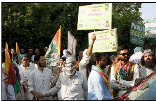
LAHORE: Members of Pakistan Nazriyati Party are holding protest demonstration against detention of Dr. Aafia Siddiqui by US authorities, at Lahore press club.