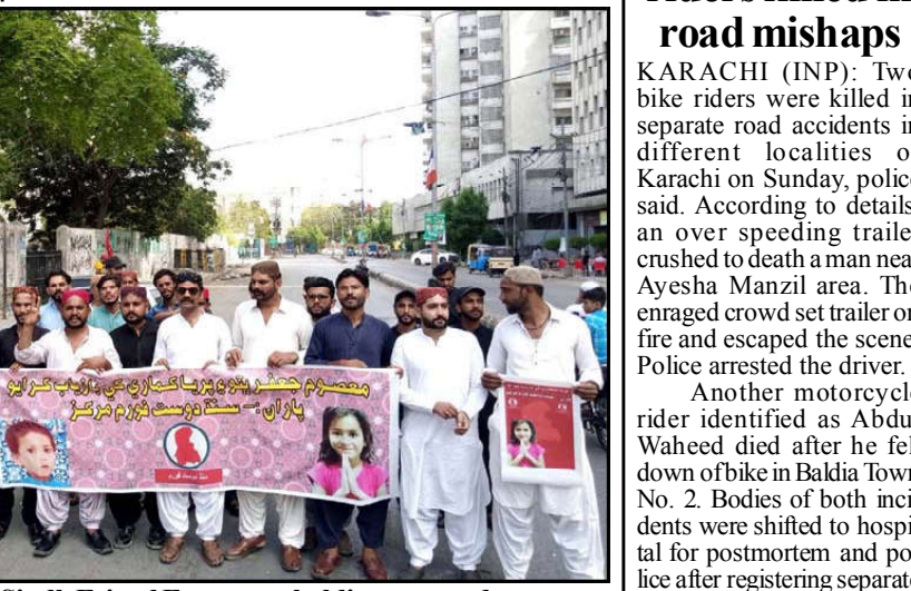
KARACHI: Members of Sindh Friend Forum are holding protest demonstration for acceptance of their demands, at Karachi press club.