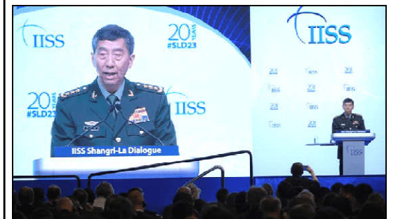
Chinese Defence Minister Li Shangfu speaks at the IISS Shangri-La Dialogue in Singapore.

cord that restricted it. Trump restored crippling sanctions on Iran that have contributed to a severe economic crisis without forcing any concessions from its leaders. Iran has also lent support to Russia's invasion of Ukraine, supplying armed drones that have wreaked havoc on the Ukrainian capital, Kyiv. "Some people are mistaken to think if we back down from our stances in certain cases that will cause the enmity of the U.S., the global arrogance, or Israel toward us to diminish," said Khamenei, who has the final say on all major Iranian policies. "This is a mistake."