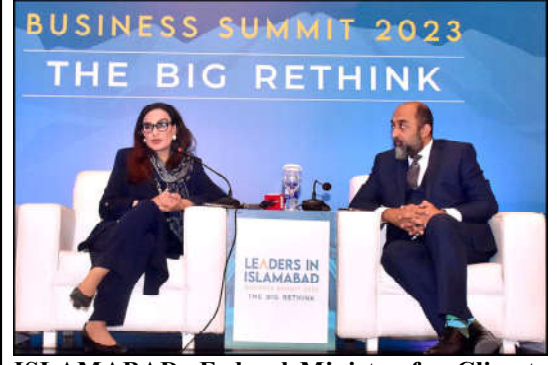
ISLAMABAD: Federal Minister for Climate Change Senator Sherry Rehman addressing the concluding session of the second day of the Leaders in Islamabad Business Summit.