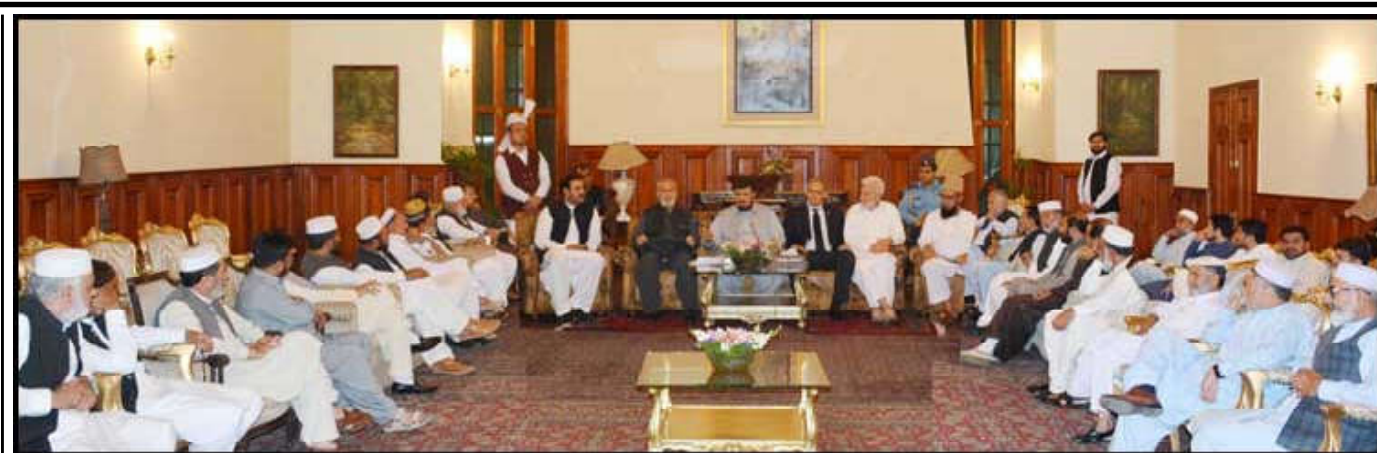
PESHAWAR: Governor Khyber Pakhtunkhwa Haji Ghulam Ali talking to a 30-member delegation of the Ittehad Malikan (Alliance of Maliks) which called on him here at the Governor's House.

The CM has extended unwavering solidarity and heartfelt condolences to the families of the martyrs.