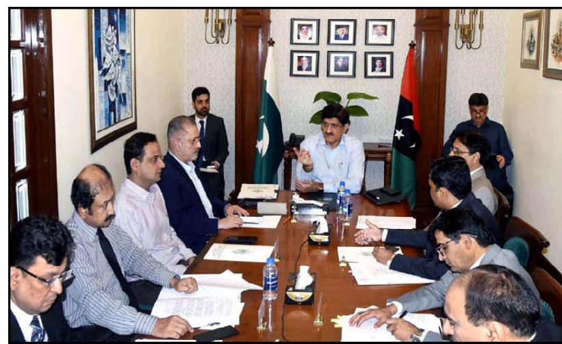
KARACHI: Sindh Chief Minister, Syed Murad Ali Shah presides over a meeting regarding Karachi Circular Railways (KCR), held at CM House in Karachi.