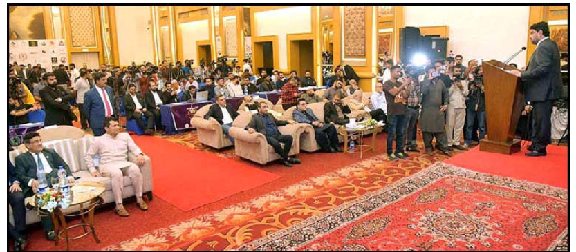
KARACHI: Governor Sindh Kamran Khan Tessori addressing during inauguration ceremony of Cricket tournament organized by Upleta Memon Association.

mand & control room. The transport minister further directed authorities concerned to activate the intelligent transport system (ITS) in all the buses of the service. He said the mobile app will facilitate citizens in tracking buses in real-time and make payments online, while CCTV cameras, screens, live tracking and monitoring facilities will be activated with the installation of the ITS in the buses.