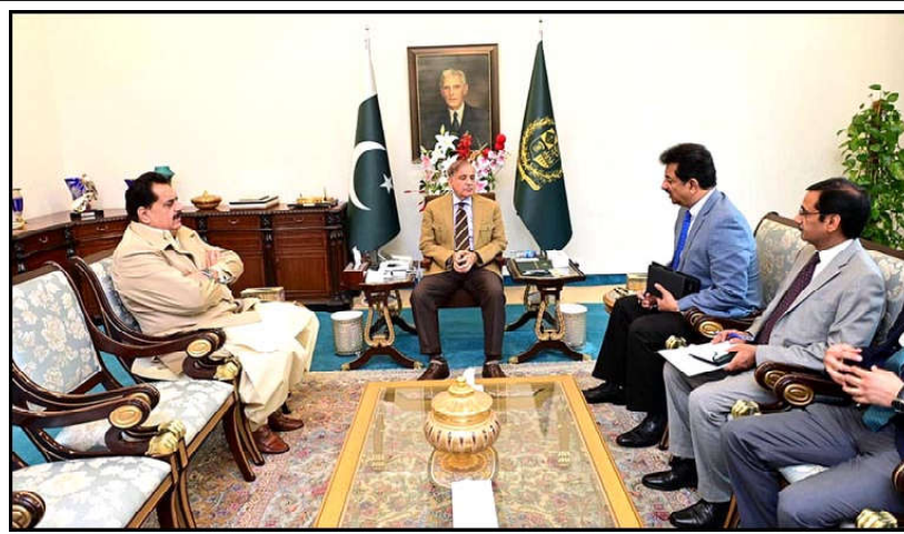
ISLAMABAD: Minister for National Food Security, Tariq Bashir Cheema calls on Prime Minister Muhammad Shehbaz Sharif.

Ahsan Iqbal said that the base of conflict and violence is prejudice and intolerance as it leads to extremism.