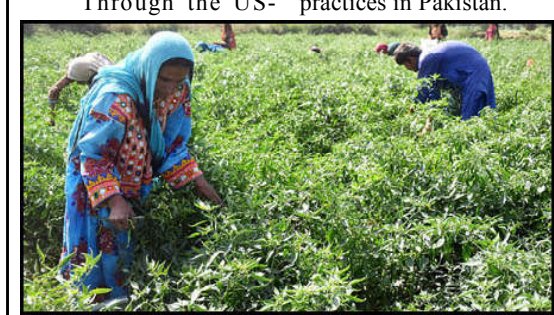
HYDERABAD: Farmers are engaged in harvesting peas in the field.

ISLAMABAD (APP): Pakistani rupee gained 08 paise against the US Dollar (USD) in the interbank trading on Thursday as it closed at Rs285.38 against the previous day's closing of Rs285.46. However, according to the Forex Association of Pakistan (FAP), the buying and selling rates of dollars in the open market stood at Rs 290 and Rs 293, respectively. The price of the Euro increased by 19 paise to close at Rs 304.67 against the last day's closing of Rs304.48, according to the State Bank of Pakistan (SBP).