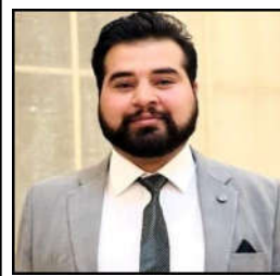
By Hamza Shahzad

Balochistan has confronted the security challenges over the years. Balochistan has struggled with security challenges posed by terrorism, insurgency, and religious violence. These disastrous incidents have had a damaging effect on the province's reputation and stalled its tourism potential. The unstable security condition in the past has discouraged tourists and damaged the province's image, leading to a weakening in tourism opportunities.