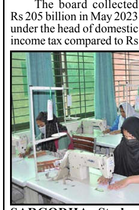
SARGODHA: Student attends classes during Skill Summer Camp 2023 at Government College of Technology for Women.

131 billion in May 2022, thereby showing a growth of 57%. A healthy year-on-year growth of 28% was achieved in the domestic sales tax with collection of almost Rs 100 billion. Around Rs 41 billion were collected as Federal Excise Duty (FED) showing a year-on-year increase of 32%. A cumulative growth of almost 44% has been achieved in the collection of domestic taxes. "This is despite the fact that the economy has slowed down and GDP growth rate has been revised downward.