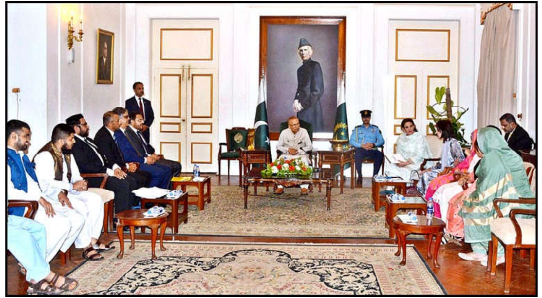
KARACHI: President Dr. Arif Alvi along with Begum Samina Arif Alvi holding a meeting with delegation of Association of Retarded Children Karachi and special children at Governor House.

ation of retarded children for more than 50 years and encouraged the association to look into possibility of joining other organisations working for the same cause to strengthen their efforts and outreach. Begum Samina Arif Alvi, at the occasion, also emphasized the need of coordination among all relevant associations and organisations to reinforce the efforts aimed at rehabilitation of special children through education and vocational training.