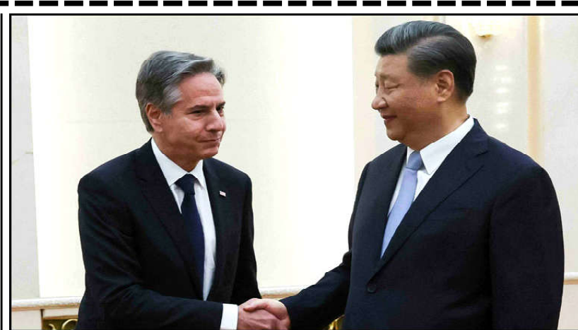
US State Secretary Antony Blinken (L) shakes hands with China's President Xi Jinping at the Great Hall of the People in Beijing.

hour, came after Blinken held more than 10 hours of talks over two days with other top officials. At the ornate Diaoyutai State Guesthouse earlier on Monday, Blinken and China's foreign policy supremo Wang Yi offered polite smiles before talks with their aides, who unlike their bosses wore masks in line with lingering Covid-19 protocols. Away from the cameras, Wang told Blinken that his trip "comes at a critical juncture in China-US relations", according to state broadcaster CCTV.