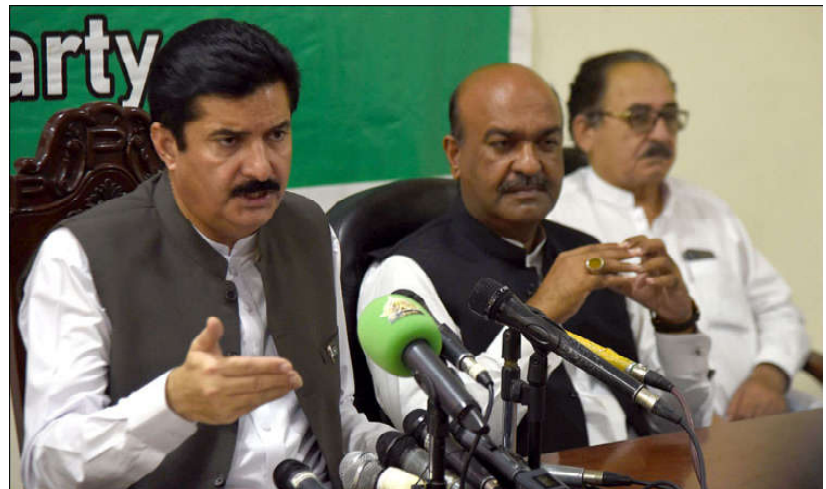
ISLAMABAD: Minister of State Faisal Karim Kundi addressing a press conference along with Leader of Pakistan People Party Nadeem Afzal Chan at PPP Secretariat in Federal Capital.