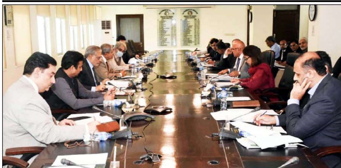
ISLAMABAD: Federal Minister for Finance and Revenue, Senator Mohammad Ishaq Dar chaired the meeting of the Cabinet Committee on Inter-Governmental Commercial Transactions (CCoIGCT) held in Islamabad.

ISLAMABAD (APP): The Senate on Monday proposed 55 recommendations related to Finance Bill 2023 and gave 31 recommendations regarding the public sector development program.