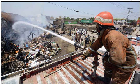
PESHAWAR: Rescue I122 worker using water gun to douse fire in a cargo godown near Ring road.

The CM also inspected the primary angiography facilities for cardiac patients and observed the arrangements made for maintaining cleanliness. He acknowledged the dedicated efforts of doctors and paramedics who continue to provide exemplary service despite the increased demand. Mohsin Naqvi expressed his commitment to further enhancing the treatment facilities and mentioned that the health secretary had been directed to address the shortage of angioplasty guiding catheters in the ICU.