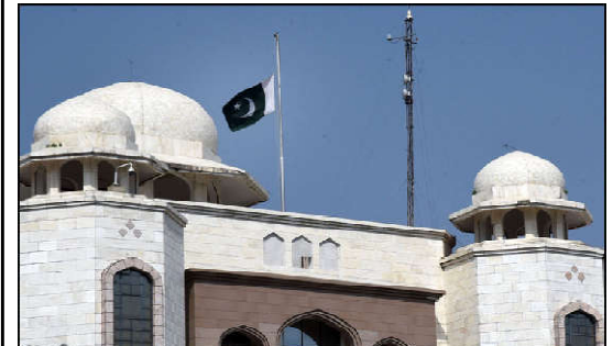
ISLAMABAD: A view of the Pakistan Flag flying half mast on PM Secretariat, as Federal Government announces bereaved for today on the sad incident of the drown refugee boat from Libya to Italy, in which hundreds of Pakistanis are dead.

He said Balochistan was blessed with many natural resources, but the local people were not getting any benefits from them. Their livelihood largely depended on agriculture and border trade as there was no industry in the province, he added.