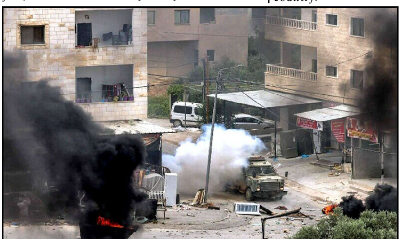
An explosive device left by Palestinians, detonates during an Israeli army raid in Jenin in the occupied West Bank.

SAO LEOPOLDO: A cyclone which tore through southern Brazil has killed at least 13 people and forced thousands from their homes, authorities said on Sunday. Torrential rain and strong winds on Thursday and Friday caused damage in dozens of towns in the state of Rio Grande do Sul, including its capital Porto Alegre — the latest in a string of weather-related disasters to hit South America's biggest country.