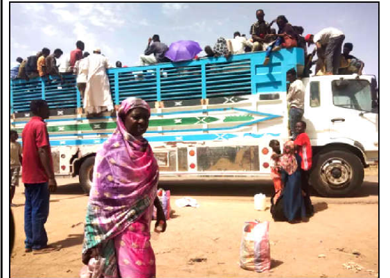
People board a truck as they leave Khartoum, Sudan.

been funded. "Without strong international support, Sudan could quickly become a locus of lawlessness, radiating insecurity across the region," Guterres told a fundraising conference hosted by Germany, Saudi Arabia, Qatar, Egypt and the United Nations. "I appeal to you all today to provide funding to deliver lifesaving humanitarian aid and support to people living in the most difficult and dangerous conditions," Guterres said.