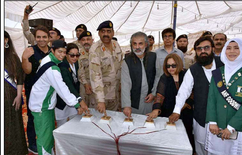
QUETTA: Federal Minister for Narcotics Control Nawabzada Shahzain Bugti pressing button to burn recovered smuggled narcotics at Kuch-More area.

The Federal Minister torched and destroyed around 85 metric tons of different types of drugs in the ceremony.