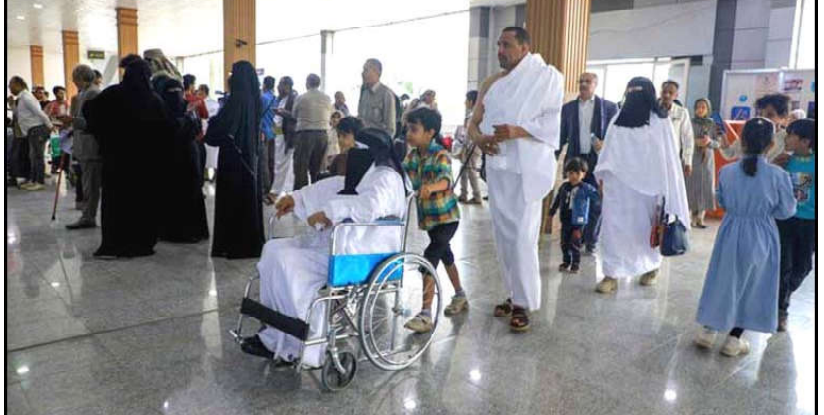
Plane leaves Yemen capital for Saudi, first since 2016.