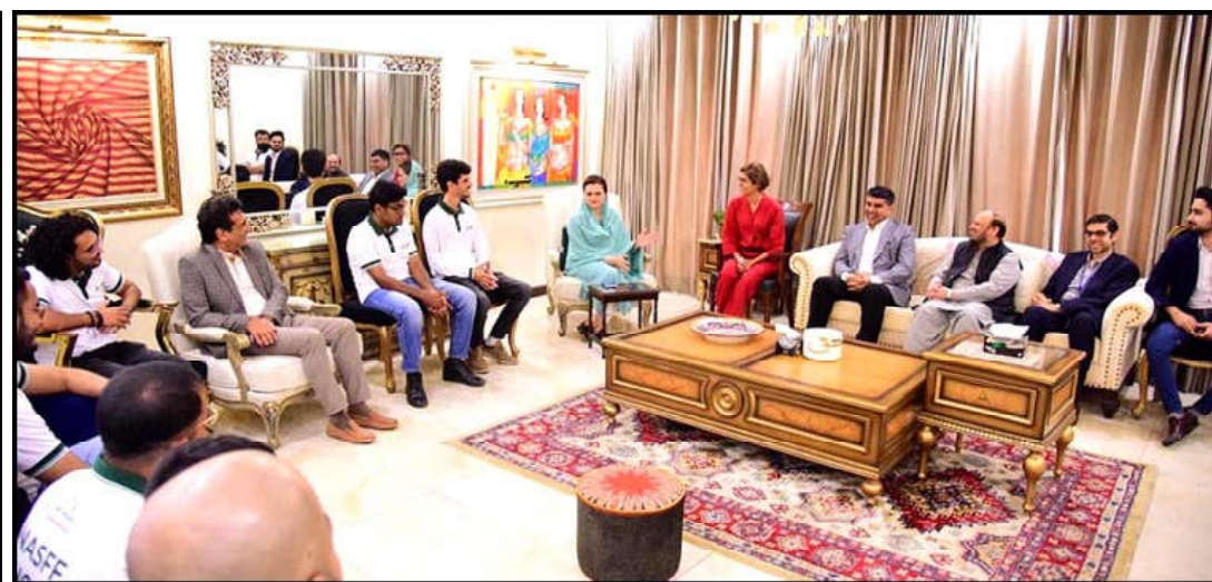
ISLAMABAD: Ms. Marriyum Aurangzeb, Federal Minister for Information and Broadcasting addressing the NASFF's high achievers who are leaving for Australia to participate in the National Amateur Film Festival Award.

The people rescued so far included 43 Egyptian nationals, 47 Syrian nationals, 12 Pakistani nationals, and two Palestinians, the Hellenic Coast Guard were quoted by international media outlets. Eight of those rescued were minors.