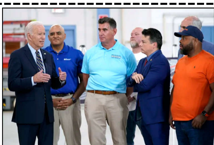
President Joe Biden speaks at the Philadelphia International Airport in Philadelphia after an aerial tour of the Interstate 95 highway collapse.

Monitoring Desk MOSCOW: Russian President Vladimir Putin has warned there is a "serious danger" of NATO being drawn further into the Ukraine war if members of the alliance continue to supply military weaponry to Kyiv. "NATO, of course, is being drawn into the war in Ukraine, what are we talking here," Putin said at the St. Petersburg International Economic Forum on Friday. "The supplies of heavy military weaponry to Ukraine are ongoing, they are now looking into giving Ukraine the jets." The comment appeared to be a reference to the F-16 fighter jets some members of the NATO alliance are making plans to supply Ukraine with. NATO, or the North Atlantic Treaty Organization, was formed in the aftermath of World War II to defend Western nations from the Soviet Union and the alliance contains a mutual defense clause where an attack on any one member is considered an attack on all. While Ukraine is not a member of NATO, some NATO members have been supplying Kyiv with tanks, armored vehicles and other weaponry - prompting threats of retaliation from Russia. German Leopard 2 tanks, British Challenger 2 tanks and American Bradley and Stryker vehicles are among the Western equipment that has been sent to Ukraine. In late April, NATO Secretary-General Jens Stoltenberg said that NATO allies and partners had delivered more than 1,500 vehicles and 230 tanks to the country. During his speech in St. Petersburg, Putin said Russia had destroyed tanks "including Leopards" at the front lines.