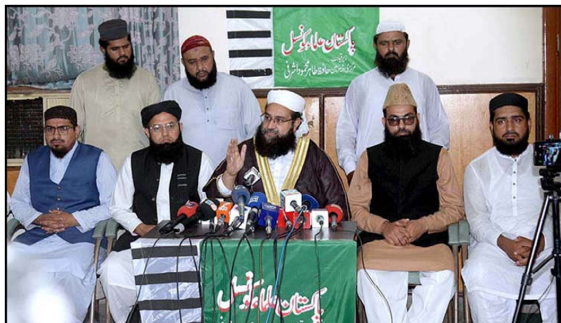
LAHORE: Special Assistant to the Prime Minister on Religious Harmony Maulana Tahir Ashrafi addressing a press conference at Begumpura.

The minister disclosed that the corporate entities providing funds for film production can claim CSR tax credits from the Federal Board of Revenue (FBR), making it a significant incentive.