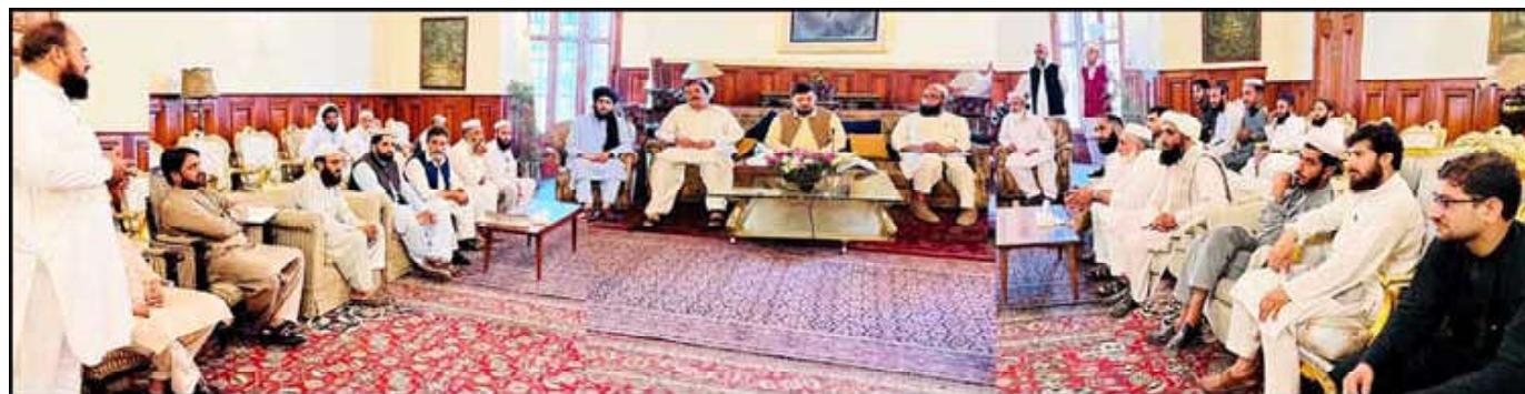
PESHAWAR: Khyber Pakhtunkhwa Governor Haji Ghulam Ali talking to 28-member delegation, consisting of elected chairpersons, councilors, and representatives from political parties.

He said that the provincial government is committed to ensure equal development in all urban and rural areas of the province. Furthermore, the federal government is also providing assistance to expedite the development process. The Governor said that local representatives are closest to the people and, therefore, funds have been allocated in the budget for elected municipal representatives to initiate developmental projects at the grassroots level. Governor Haji Ghulam Ali urged the elected representatives from all districts.