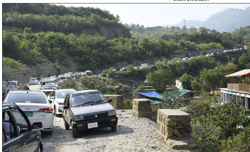
ISLAMABAD: A large numbers of vehicles stuck in traffic jam during arrival at Shahdara picnic point during hot weather, in the Federal Capital.