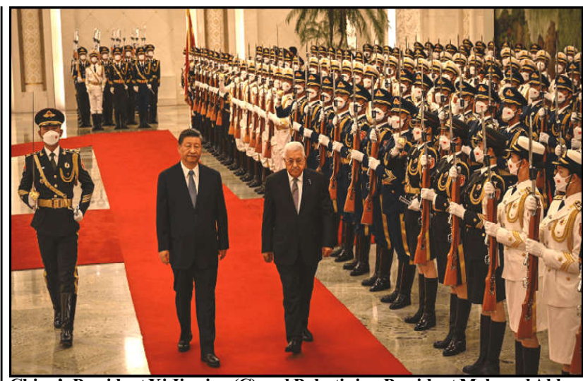
China's President Xi Jinping (C) and Palestinian President Mahmud Abbas attend a welcoming ceremony at the Great Hall of the People in Beijing.

in the Middle East, brokering the restoration of ties in March between Iran and Saudi Arabia — rivals in a region where the United States has for decades been the main powerbroker. But finding a lasting solution to Israeli-Palestinian tensions may prove more elusive, as peace negotiations between the two sides have been stalled since 2014. In April, Chinese Foreign Minister Qin Gang told his Israeli and Palestinian counterparts that his country was willing to aid peace negotiations, Xinhua reported. And Qin told Palestinian foreign minister Riyad Al-Maliki that Beijing supports the resumption of talks as soon as possible, according to the state news agency. In both calls, Qin emphasized China's push for peace talks on the basis of implementing a "two-state solution".