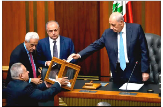
Lebanese Parliament Speaker Nabih Berri casts his vote as parliament gathers to elect a president at the parliament building in downtown Beirut, Lebanon.