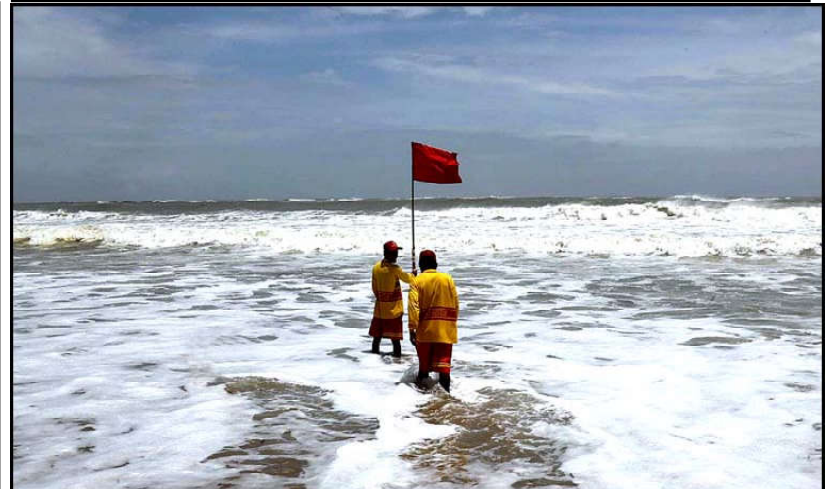
KARACHI: Officials placing red flag after alerts issued by the authorities regarding the effects of cyclone "Biparjoy" at the Hawksbay Beach.