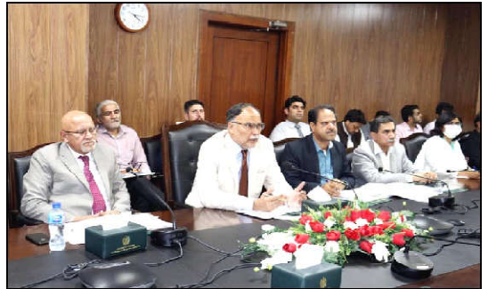
ISLAMABAD: Federal Minister for Planning Development & Special Initiatives, Ahsan Iqbal chaired a meeting to review the progress of projects in Gwadar.

All major projects under CPEC in Gwadar, including Gwadar Power Plant, Distribution of 2000 Boat engines to fishermen of Gwadar, Khuzdar-Panjgur Transmission line (via Nag-Basima) which connect Markran with National Grid, New Gwadar International Airport Project, the China-Pak Friendship Hospital, China-Pak Technical and Vocational Institute in Gwadar, the Gwadar East-bay Expressway Project, Gwadar Free Zone, and Gwadar Port would become a shining pearl in the region.