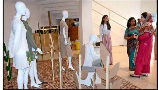
LAHORE: Students of Kinnaird College for Women taking keen interest in Textile Exhibition at Al-Hamra Art Gallery.

associates announced to join Qaumi Watan Party. Sikandar Sherpao said due to the incompetence of the previous rulers, the province is the victim of financial instability and the economic crisis is looming here. The policies of the previous government have not only affected the people and economy of the province but rather have also increased backwardness to an extent. He said that keeping in view the current situation the federal government should not only hand over the net profit on electricity net profit to the province, rather also take steps to increase the shares of small provinces by ensuring the early holding of the NFC.