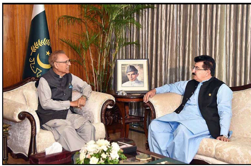
ISLAMABAD: Chairman Senate, Muhammad Sadiq Sanjrani, called on President Dr. Arif Alvi at Aitwan-e-Sadr.

However, rain and thunderstorms were also expected and a forecast of 110mm which was a conservative estimate of rainfall for Karachi and 330mm for Thatta was projected.