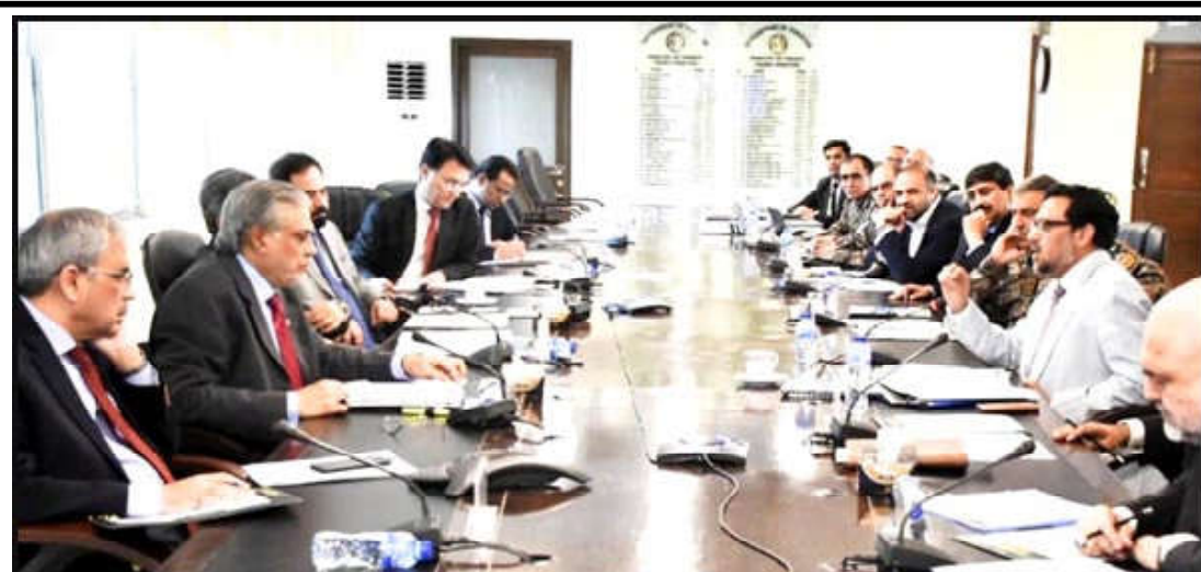
ISLAMABAD: Federal Minister for Finance and Revenue, Senator Mohammad Ishaq Dar chaired a meeting on Civil Aviation issues, at Finance Division.

France, through the French Development Agency, is providing technical and financial support in several sectors such as energy, water and sanitation, urban development, and cultural heritage. The French loan will support NTDC in the components of the projects including: Construction of a new 220kV substation and 50km of new 220kV transmission lines to be connected to it in Aarifiwala, which will be connected to the MEPCO grid.