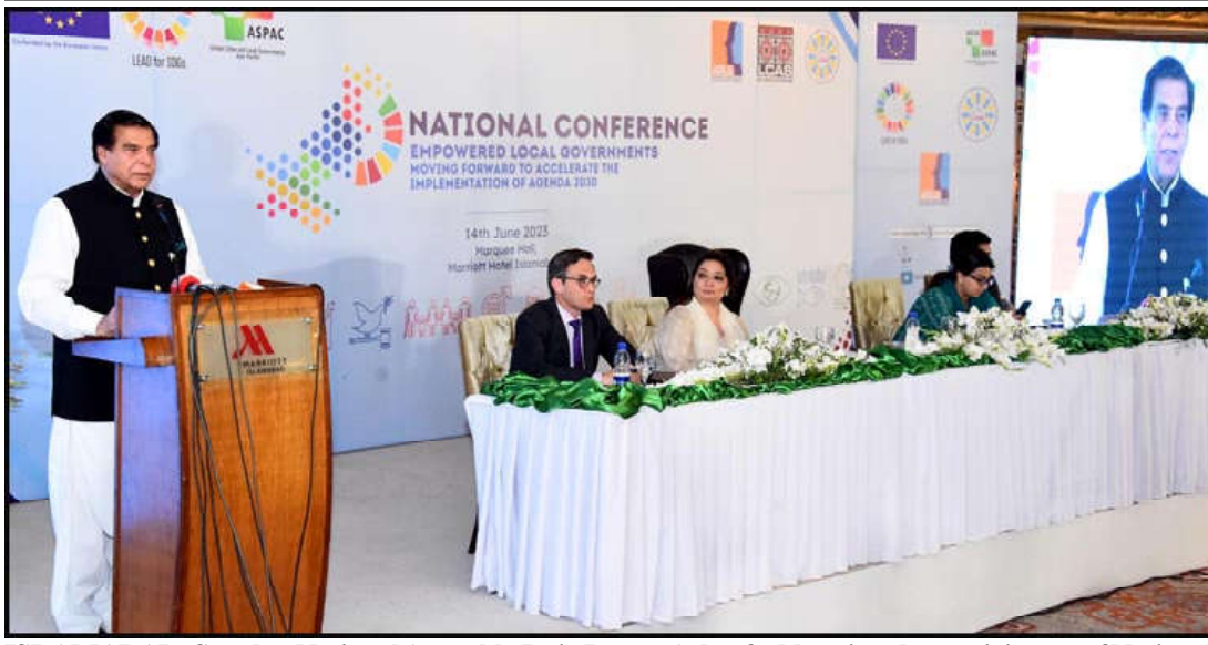
ISLAMABAD: Speaker National Assembly Raja Pervaiz Ashraf addressing the participants of National Conference-Local Democracy Moving Forward for Achieving Sustainable Development Goals in Pakistan