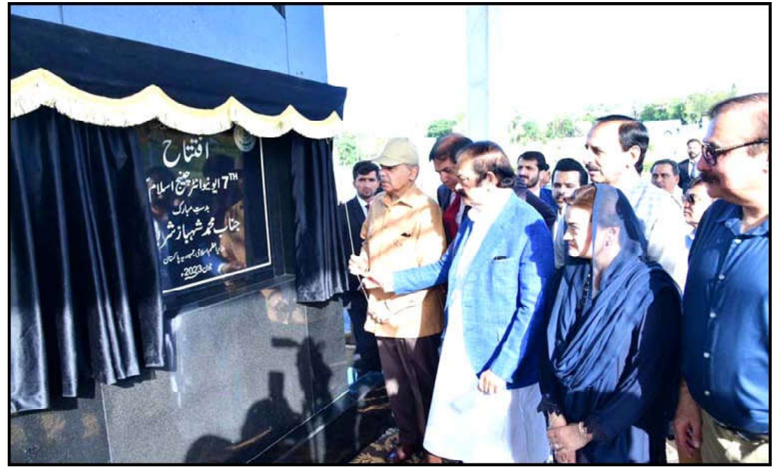
ISLAMABAD: Prime Minister Muhammad Shehbaz Sharif inaugurates 7th Avenue Interchange on Srinagar Highway.

PM Shehbaz resolved that "under the leadership of Nawaz Sharif, we all together would bring the country out of all crises and make it a stable and developed Pakistan." He said the previous government had ignored development projects and the progress on reconstruction of IJP Road was also going on at a snail's pace. However, he said current government made it possible to complete it in the stipulated time. Appreciating the team responsible for the project to complete it on time, the prime minister said the project, previously known as IJ Principal Road, had now been named after Captain Karnal Sher Khan Shaheed (Nishan-e-Haidar).