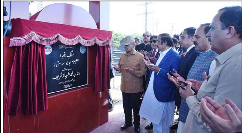
ISLAMABAD: Prime Minister Muhammad Shehbaz Sharif laid the foundation stone of the construction of 11th Avenue.

The minister said revenue collection was the major source of the country's income.