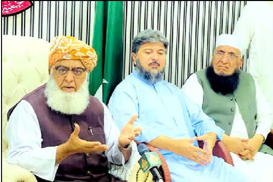
PESHAWAR: Jamiat Ulema-e-Islam (JUI-F) Chief, Maulana Fazal-ur-Rehman addresses to media persons during press conference, in Peshawar.