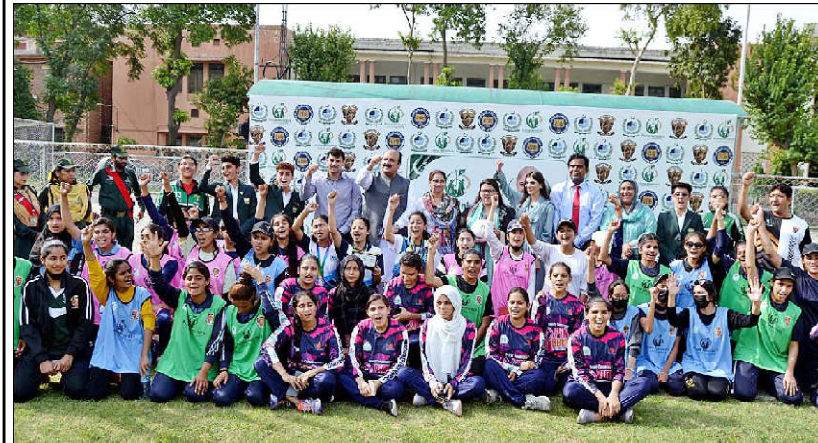
LAHORE: Ms. Shaza Fatima Khawaja, SAPM for Youth Affairs in a group photograph with students during inauguration ceremony of Sports Talent Hunt under Prime Minister's Youth Programme at Lahore College for Women University

To facilitate citizens in checking their e-challan status, a convenient online system has been established. By entering their vehicle registration number on the provided link, citizens can easily access information regarding any pending e-challans.