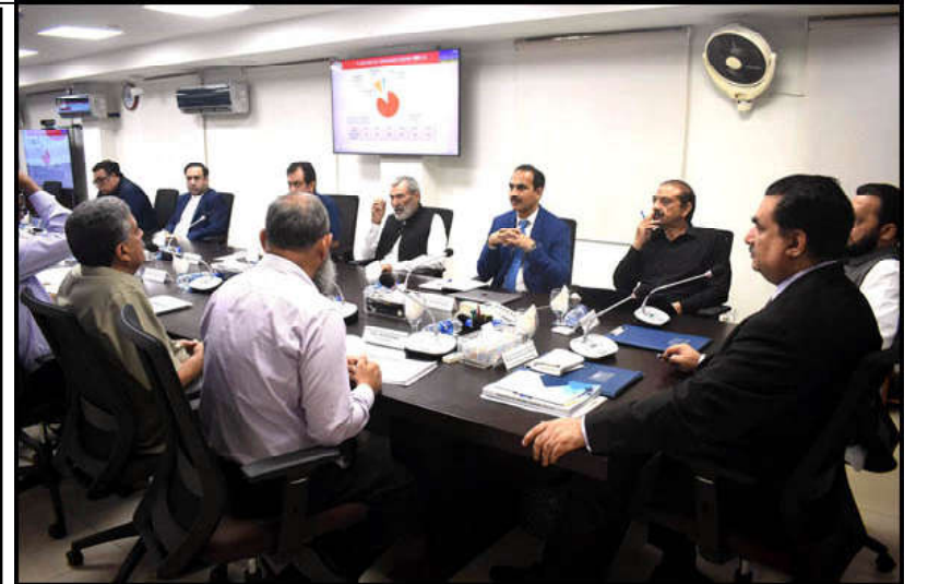
LAHORE: Federal Minister for Power Khurram Dastgir Khan presiding over the meeting of LESCO officials at LESCO Headquarter.

The meeting also approved a plan to bring 50,000 acres of barren land under cultivation. Pilot projects will be initiated in Mankera, Choubara, and Norpur Thal for land reclamation. Soil and water testing laboratories will be established at the tehsil level in Punjab.