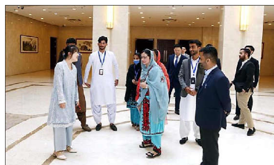
ISLAMABAD: A delegation of student of University of Gwadar visiting Chinese Consulate

The court stated that the federal government had been issuing emergency notifications from time to time and preventive measures were taken to deal with the Coronavirus epidemic.