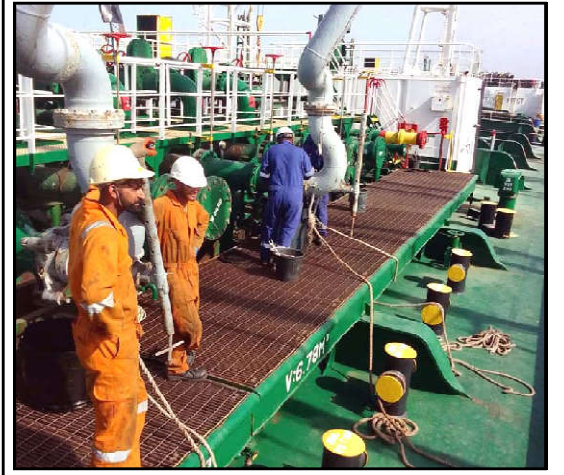
KARACHI: Labours unload the discounted Russian crude oil from the tanker of the cargo ship transporting the first shipment, at Karachi Port Trust.

Expressing their deep sense of dismay and resentment, the House deplored these attacks and demanded that those responsible for planning, facilitating, and instigating them be brought to justice under the full extent of the law.