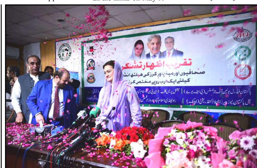
Ms. Marriyum Aurgangzeb, Federal Minister for Information and Broadcasting participating in a thanksgiving reception held in view of allocating funds for health insurance in the budget for the journalists & Media workers at National Press Club, Islamabad.