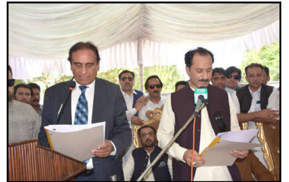
MUZAFFARABAD: Speaker Legislative Assembly of Azad Kashmir Ch. Latif Akbar taking oath from newly elected Sardar Zia - Ul-Qamar at the Capital of AJK.