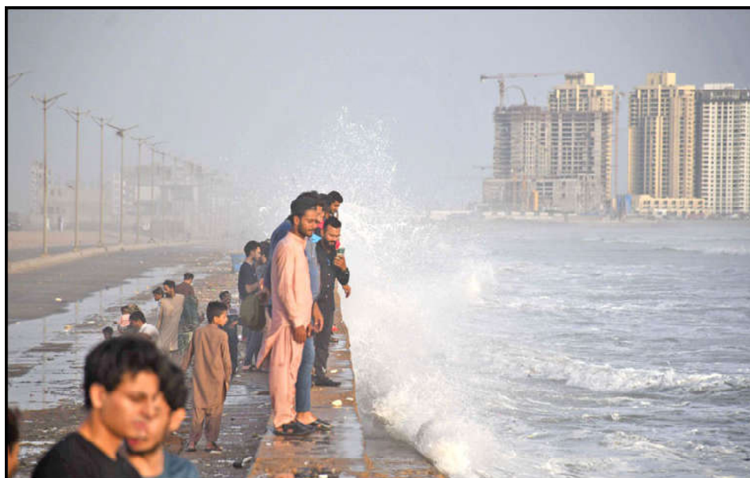
KARACHI: People openly defy Section 144 imposed by the administration as a preventive measure in anticipation of tropical cyclone Biparjoy. Sindh government has decided to evacuate residential areas and other human settlements located near the coast areas of Sindh due to threat of cyclone Biparjoy

The Prime Minister said we are moving one step at a time toward prosperity, economic growth, energy security and affordability.