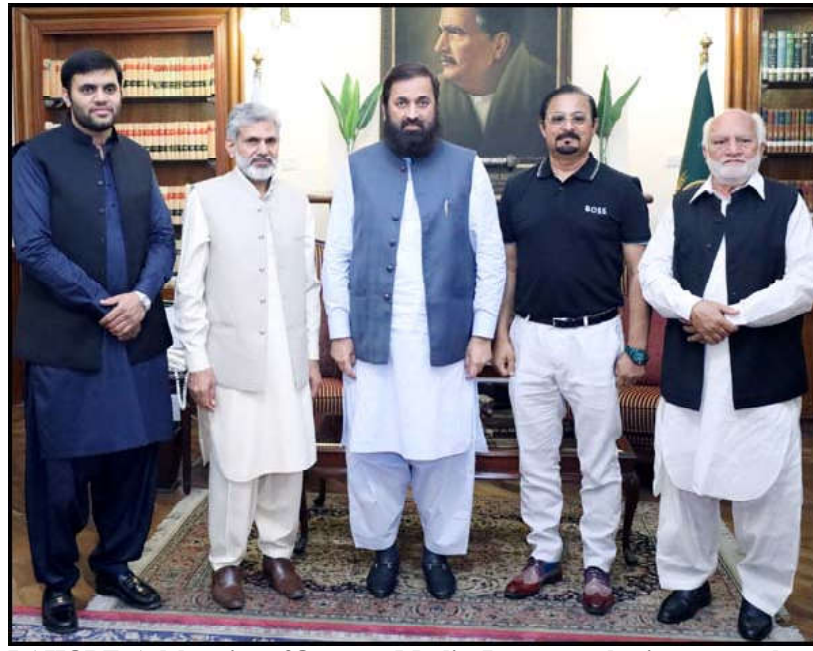
LAHORE: A delegation of Overseas Muslim League worker in a group photo with Governor Punjab Balighur Rehman at Governor House.

the North-Northeast direction towards Southeast Sindh-Indian Gujarat coast. He quoted the PDMA and Met Office reports saying, "Now cyclonic storm lies near Latitude 19.5°N & Longitude 67.7°E at about 600km South of Karachi, 580km South of Thatta, and 710 km southeast of Ormara. He further said that maximum sustained surface winds were 160-180 Km/hour gusts, 180 Km/hour around the system center and maximum wave height was 35-40 feet.