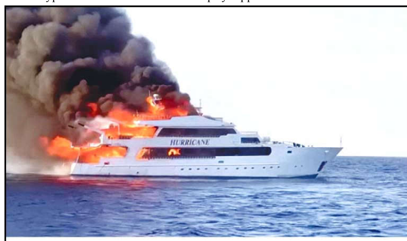
MARSAALAM: Plumes of smoke erupt from a yacht.

Monitoring Desk MOSCOW: President Vladimir Putin on Monday marked the Day of Russia national holiday by lauding the country's patriotic tradition as a support for soldiers fighting in Ukraine. "This public holiday marks the inseparability of centuries-old history, the greatness and glory of the Fatherland, affirms the unity of the multinational people, devotion to their country, a warm, sincere attitude towards their beloved Motherland," he said at a ceremony presenting state awards. "Such keen feelings... in a difficult time for Russia, they unite our society even more strongly, serve as a reliable support for our heroes, the participants in the special military operation," Putin said, using the Russian official terminology for the Ukraine conflict. The holiday comes amid intensifying counter-offensive operations by Ukraine against Russian forces that occupy about 20% of the country. Ukrainian officials in recent days claimed to have regained control of some villages and to have made advances at some points along the front line. Although Russia has been widely criticized for strikes on civilian targets including apartment buildings, Putin told recipients of the state awards that he was shocked by Ukraine attacking civilian areas.