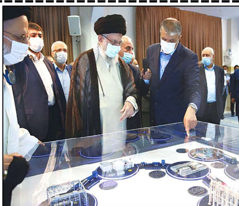
TEHRAN: Iran's Supreme Leader Ali Khamenei views a model of a nuclear facility.

ers of union with Greece. Turkish Cypriots declared independence nearly a decade later, but that's only recognized by Turkey, which maintains more than 35,000 troops and an array of armaments in the north. U.N.-led peace talks haven't resolved the dispute. The most recent round in July 2017 broke down over a Turkish insistence on maintaining military intervention rights and a permanent troop presence under any new arrangement. Another stumbling block was a Greek Cypriot rejection of a Turkish Cypriot demand for the right to veto all government decisions on a federal level.