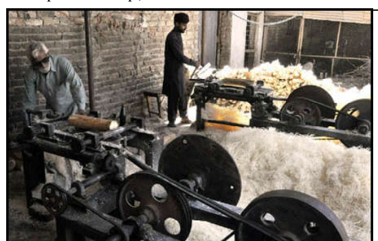
RAWALPINDI: Workers busy producing khas from wood pieces with the help of machine to be used in making of room cooler at his workplace.

the masses in their daily lives, leading to financial constraints for the country. Minister Dar emphasized that the coalition government of Pakistan Muslim League-N (PML-N) was taking all necessary measures to renegotiate with the International Monetary Fund (IMF) on more favorable terms and conditions. He expressed hope that the IMF would be satisfied with Pakistan's progress, as the country has fulfilled the necessary requirements. Furthermore, He expressed optimism that Pakistan would achieve the growth rate set by the government, indicating a positive outlook for the nation's economic development in the coming year.