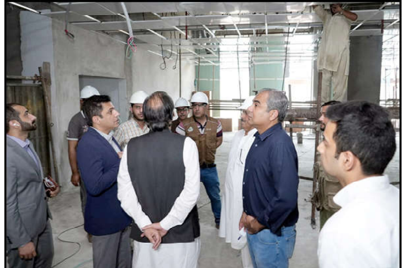
LAHORE: Caretaker Chief Minister Punjab Mohsin Naqvi inspecting the under construction work during his visit to Punjab Agricultural, Food and Drug Authority Project.

during July to March, FY2023. In pursuance of the commitment to provide Universal Primary Education as a part of SDGs, the government launched a Co-Responsibility Cash Transfer initiative for providing an additional cash per quarter to BISP beneficiary families in October, 2012 for Primary Education. Since July 01, 2021, scope of the programme has been expanded from Primary to Secondary and Higher Secondary level and is currently operational all over the country. The overall objective of this initiative is to encourage education through regular cash transfers to invest in human capital development. B-form/ CRC verification through NADRA database is mandatory for the enrollment of child in the programme. A beneficiary child must attend school or college for at least 70 percent of the school or college effective days within a quarter to receive cash transfers from second quarter and onwards.