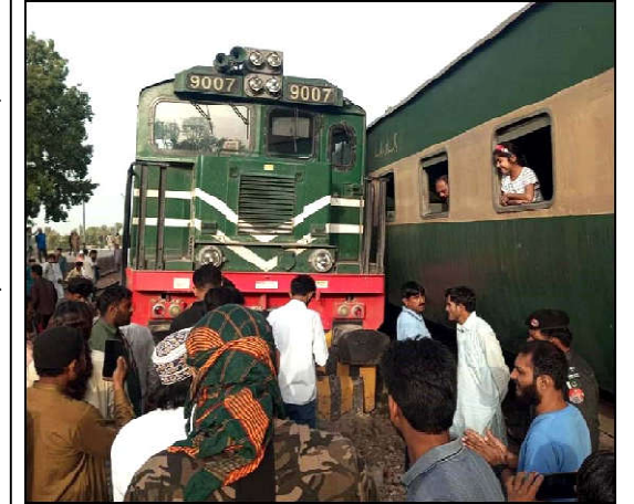
GHOTKI: View of site after Green Line Express derailed near Ghotki.

could be able to find locations easily and get accurate information about the routes. In an interview in the federal metropolis on Sunday, Prime Minister Chaudhry Anwar Haq said that the government provided full support for holding Tourism Festival in Haveli. He said that Government Minister Raja Faisal Mumtaz Rathore has been active in this regard. He said that tourism festivals should be organized all across Azad Kashmir so that people can get access and see the beauty of Kashmir.