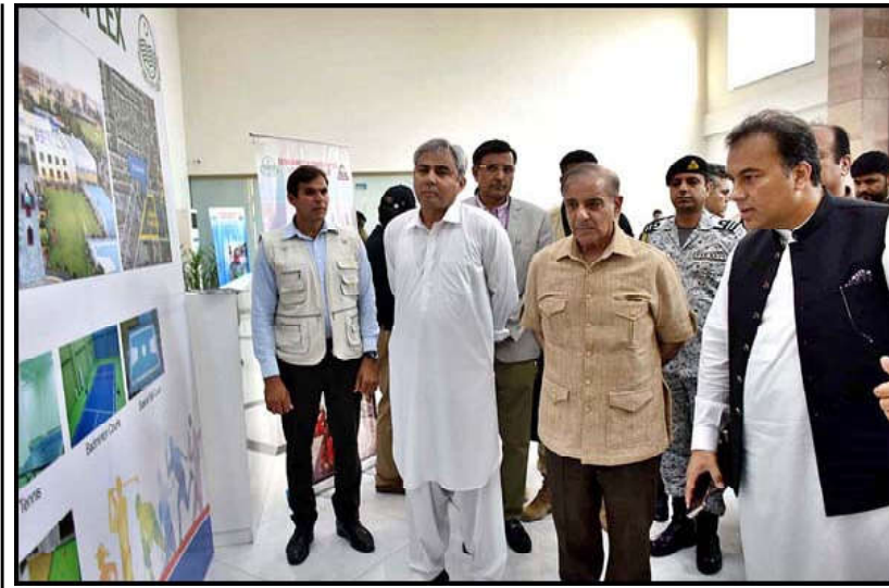
LAHORE: Prime Minister Muhammad Shehbaz Sharif being briefed about Sabzazar Sports Complex.

Meanwhile, Caretaker Chief Minister Punjab Mohsin Naqvi visited the Punjab Agriculture, Food and Drug Authority project to review ongoing construction works. He inspected construction work of auditorium, sample centres, labs, meeting room, other sections and expressed satisfaction over the pace of work. While directing the authorities concerned to continue construction work at the same speed, he said that the project of public importance should be made functional at the earliest.