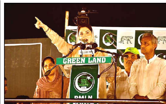
MULTAN: Chief Organizer PML-N Maryam Nawaz addressing the Youth Convention at Shujaabad.

ISLAMABAD (INP): Federal Minister for Climate Change, Sherry Rehman has said that Pakistan is not responsible for the climate change but it has still become the 'Ground Zero' of the climate change. Taking to her twitter handle on Sunday, she tweeted: "Deeply grieved over the loss of 29 precious lives in Khyber Pakhtunkhwa and Punjab rain related incidents. Equally shares the grief of the victim family. Pray for earlier recovery of the injured." Sherry Rehman lauded the Pakistan Army, PDMA and other related local organizations for their instant action, launched rescue and relief activities after the disaster. After Sindh, pre-monsoon showers, gusts and disaster caused by them in Punjab and Khyber Pakhtunkhwa was matter of grave concern, she added. The minister climate change said that windstorm, heavy rain and hailstorm adversely affected human being, cattle, standing crops, dilapidated buildings and wood-stone made houses. The PPP leader said that all provincial government and concerned organizations have been directed to remain vigilant for tackling the climate change related incidents.