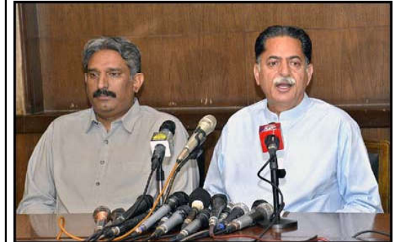
LAHORE: Federal Minister Mian Javed Latif addressing a Press conference.

heavy rains in Khyber Pakhtunkhwa. He was given a detailed briefing by the management of both PESCO and Tribal Electric Supply Company (TESCO) regarding losses inflicted on the power transmission system in the province. The PM's aide said that the people have now acknowledged that the panacea for all problems and Imran Khan lying with only Nawaz Sharif and PML-N. Amir Muqam said that rehabilitation work on the restoration of rain affected power supply system was in full swing and all staff from Chief Executive Officers (CEOs) to Lineman level of both power distribution companies is in the field.