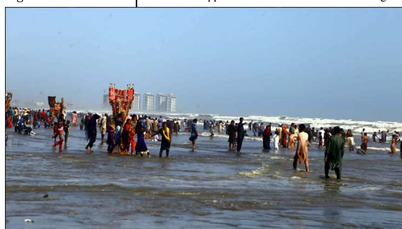
KARACHI: People are seen at Seaview beach despite alerts to remain away ahead of the Extremely Severe Cyclonic Storm Biparjoy.

coast". The tides could rise up to 10 feet as soon as the cyclone that has gained strike the coastal belt. Fishermen are reportedly ignoring the warnings, while some families have also been spotted at beaches. According to the Pakistan Meteorological Department (PMD) alert issued around 9.45pm on Saturday, the system was located 840km south of Karachi, 830km south of Thatta and 930km southeast of Ormara.