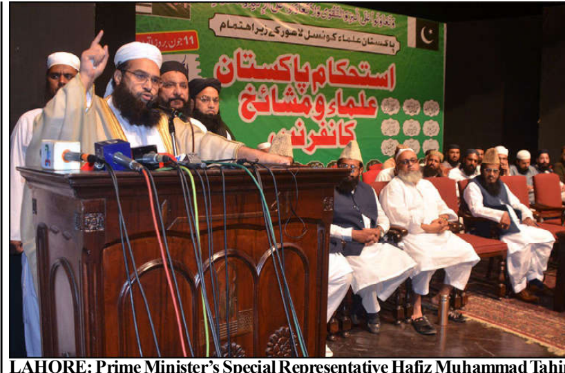
LAHORE: Prime Minister's Special Representative Hafiz Muhammad Tahir Mahmood Ashrafi addressing during Istehkam Pakistan Ulema Mashaikh conference.

The Ulema-Mashaykh conference called for adherence to the rule of law and transparency in legal proceedings. It rejected unjustified opposition to cases conducted under the Army Act, emphasizing the importance of upholding the Constitution and ensuring individual rights are respected. Addressing concerns about the misuse of blasphemy laws, the conference clarified that these laws should not be exploited for personal or political gains. It emphasized that the law is not being misused against any political party and called for international organizations and countries to understand the true context. To address the prevailing challenges, the PUC announced the formation of a 15-member committee tasked with gathering comprehensive details regarding the May 9 events.