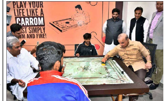
LAHORE: Prime Minister Muhammad Shehbaz Sharif playing carrom board during his visit to various sports facilities at Sabzazar Sports Complex.

administration and actively participate in the rescue and relief activities in rain hit areas of the two province especially in Khyber Pakhtunkhwa. He said that due to climate change, monsoon in Pakistan was proving to be tragic as the country had to face worst situation. The foreign minister said that though hundreds of thousands people were rescued during tragic incidents relating monsoon but the affected were still waiting for the pledged financial assistance. Putting the burden of the climate change on developing country like Pakistan would be injustice, Bilawal Bhutto said urging the global community.