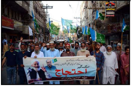
HYDERABAD: Activists of Jamat-e-Islami (JI) are holding protest demonstration against stolen of party mandate in mayoral elections in Karachi, in Hyderabad.

provincial government has taken immediate and pragmatic steps to help the citizens in the affected districts. On the direction of caretaker Chief Minister Muhammad Azam Khan, rescue and relief activities have been started immediately and funds have already been released. The provincial government will reach out to every citizen affected by the recent wind and rain. The caretaker provincial minister said that the provincial government has immediately released Rs. 40 million for the affected districts so that the rescue and relief activities would continue there as quickly as possible.