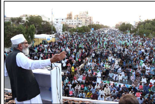
KARACHI: Jamat-e-Islami (JI) Chief, Siraj-ul-Haq addresses to his supporters during protest demonstration against stolen of party mandate in mayoral elections, at Shahrah-e-Quaideen in Karachi.