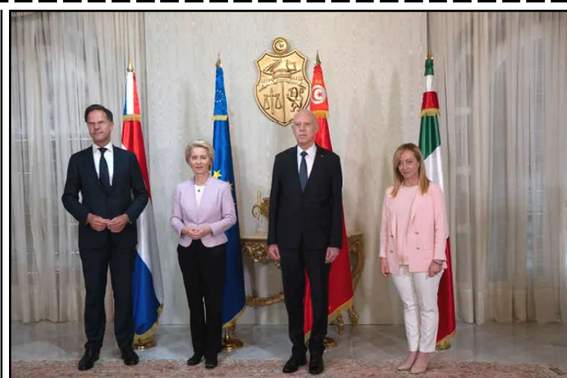
Dutch Prime Minister Mark Rutte, European Commission President Ursula von der Leyen, Tunisian President Kais Saied, and Italian Premier Giorgia Meloni meet in Tunis.

On the eve of the talks, Saied made an unannounced visit to a migrant camp in the coastal city of Sfax, a central jumping-off point for boat journeys crossing the Mediterranean to Italy. Saied spoke with families living in the camp, and pleaded for international aid for Africans who converge on Tunisia as a transit point to reach Europe. His caring words, and sympathetic images posted on the president's Facebook page, contrasted sharply with Saied's stance earlier this year, when he stoked racist abuse of Black African migrants in