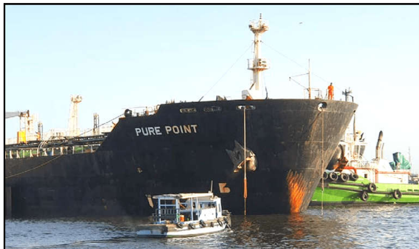
A Cargo ship carrying crude oil from Russia arrived at Karachi Port

supplies after which the government announced that it would purchase discounted crude oil, petrol, and diesel from Russia. In January 2023, a Russian delegation arrived in Islamabad for talks to finalise the deal. During the three-day meeting, the countries decided to address all technical issues — insurance, transportation and payment mechanism — to sign an agreement by late March this year. "After consensus on the technical specifications achieved, the oil and gas trade transaction will be structured in a way it has a mutual economic benefit for both countries," a joint statement issued by the two sides had then stated.