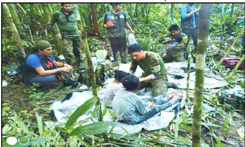
Colombian military soldiers attend to child survivors from a Cessna 206 plane that crashed on May 1 in the jungle in this handout photo released.

Monitoring Desk BOGOTA: Four Indigenous children who had been missing for more than a month in the Colombian Amazon rainforest were found alive and flown to the capital Bogota early on Saturday. The children, who survived a small plane crash in the jungle, were transported by army medical plane to a military airport. They were taken off the plane on stretchers.