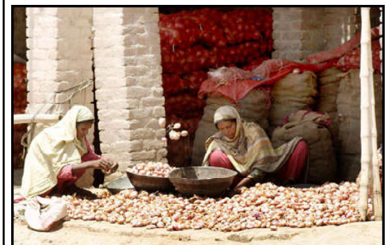
MULTAN: Women are busy sorting good quality onions at the vegetable Market.

Jinping and Vice Chairman of the Standing Committee of the National People's Congress Peng Qinghua attended Nigerian President Bola Tinubu's inauguration ceremony which vividly reflected true spirits of trust, harmony and respect between two sides. Even respective political leaders and foreign ministers from a number of African countries, including the Democratic Republic of the Congo, Eritrea, Ethiopia and Sierra Leone visited Beijing which has successfully translated political cooperation into sustainable cooperation in the diverse economic sectors.