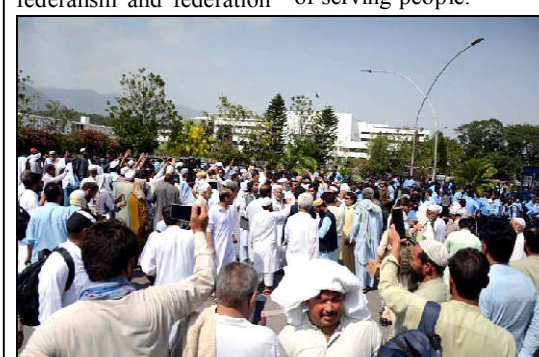
ISLAMABAD: Government Employees holding protest demonstration during the acceptance of their demands during the Federal Budget Session 2023-24, outside Parliament House in Islamabad.

He congratulated the newly elected Member of Legislative Assembly (MLA) and urged him to expedite the PPP mission of serving people.