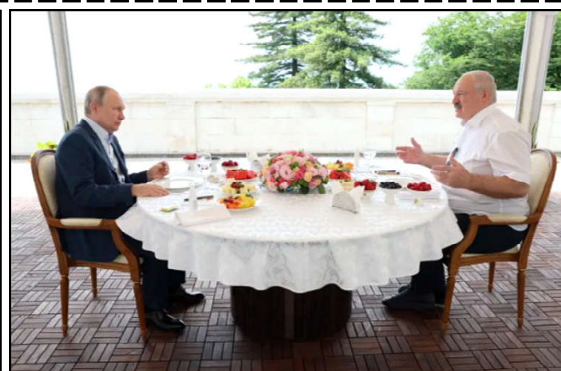
Russian President Vladimir Putin and Belarusian President Alexander Lukashenko talk during their meeting at the Bocharov Ruchei residence in the resort city of Sochi, Russia.

start the activities linked to the deployment of those weapons on your territory." Tactical nuclear weapons are intended to destroy enemy troops and weapons on the battlefield. They have a relatively short range and a much lower yield than nuclear warheads fitted to long-range strategic missiles that are capable of obliterating whole cities. Putin announced the planned deployment of the short-range nuclear weapons in Belarus earlier this year in a move widely seen as a warning to the West as it stepped up military support for Ukraine.