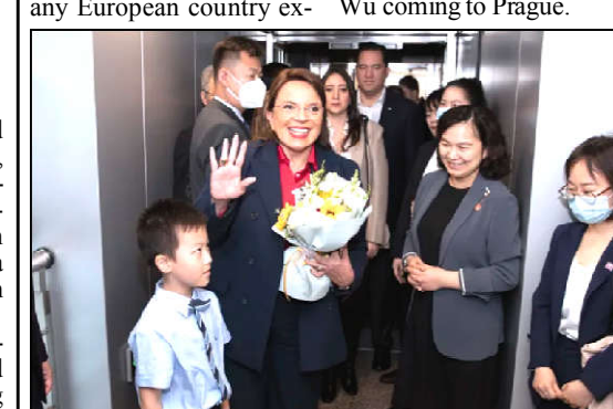
Honduras' President Xiomara Castro waves as she arrives in Shanghai, China.

Taiwan, which is claimed by China, has no formal diplomatic ties with any European country except the Vatican. Beijing regularly denounces any form of contact between Taiwanese and foreign officials, viewing it as encouraging global recognition of Taiwan's separate status from China. On Wu's Europe trip, which Taiwan's government has not officially confirmed, he is expected to speak at a think-tank event in Prague immediately after Czech President Petr Pavel. Reuters reported on Thursday. Asked about the visit on Friday, Czech Minister Lipavsky said he had "been informed" about Wu coming to Prague.