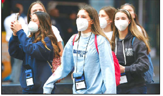
People wear masks during the morning rush hour as smoke from wildfires in Canada affected New York.

Monitoring Desk MOSCOW: Russia reported heavy fighting in the Zaporizhzhia region of southern Ukraine on Friday after saying it had repelled repeated attempts by the Ukrainian army this week to smash through the front line and drive a wedge through Russian forces. Russia's top military brass briefed President Vladimir Putin on Thursday that Russia had successfully repelled the attacks which Moscow says are part of an attempted major counter-offensive by Ukraine.