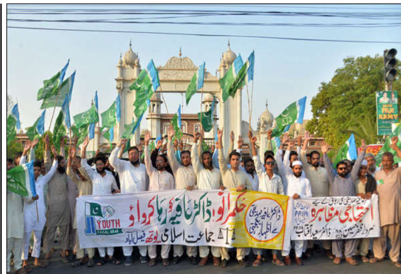
FAISALABAD: Workers of Jamat-e-Islami (Youth Wing) are shouting slogans holding banner and flags during protest to show solidarity with Aafia Siddiqui, at District Council Chowk in City.