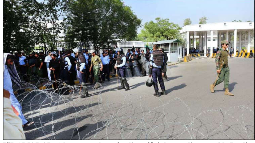
ISLAMABAD: A large number of police officials standing outside Parliament House for budget session.