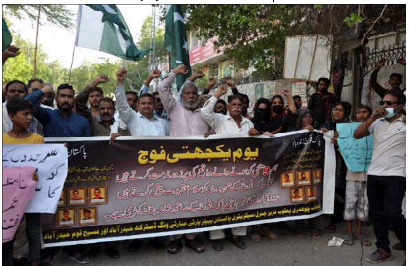
HYDERABAD: Members of Christian Community are holding demonstration in support of Pakistan Armed Forces, at Hyderabad press club.