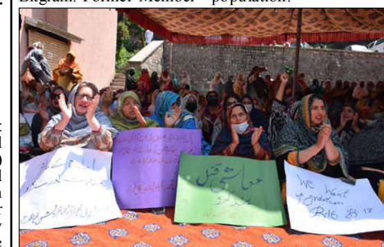
MUZAFFARABAD: Azad Kashmir school teachers are holding a banner shouting slogan during protest due to up gradation of teachers at Azadi Chowk.