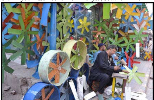
LAHORE: An electrician busy to repairing room-coolers at his workplace in the Provincial Capital.

fertilizers, pesticides and agriculture credit facilities at affordable costs for revival of the crops. Moreover, increased productivity of livestock subsector is imperative for the revival of the sector. The revival of cotton and sufficient production of wheat will not only support growth momentum but will also ease out balance of payments pressures through lesser import requirements. During the outgoing fiscal year (2022-23), the agriculture sector was envisaged to grow by 3.9% in the Annual Plan 2022-23 given a strong crop sector performance of previous year.