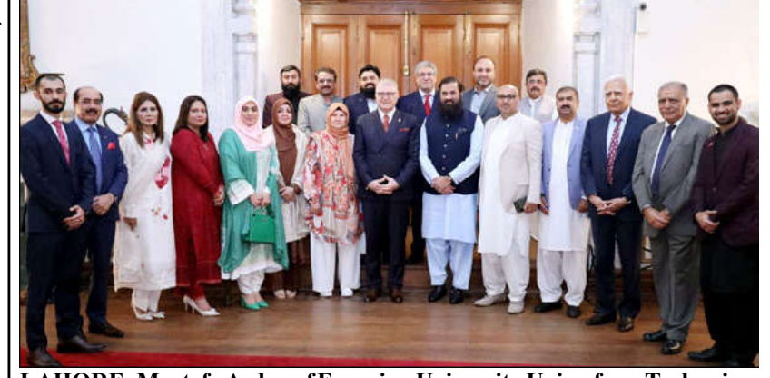
LAHORE: Mustafa Ayden of Eurasian University Union from Turkey in a group photo with Governor Punjab Muhammad Balighur Rehman at Governor House.