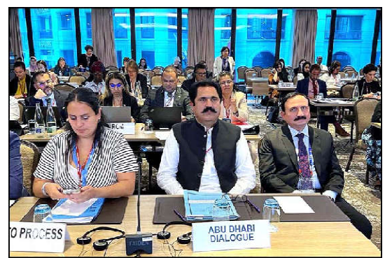
GENEVA: Pakistan's delegation in the "Tenth Global Meeting of Inter-State Consultation Mechanisms on Migration (GRCP10) led by Federal Minister Sajid Hussain Turi.