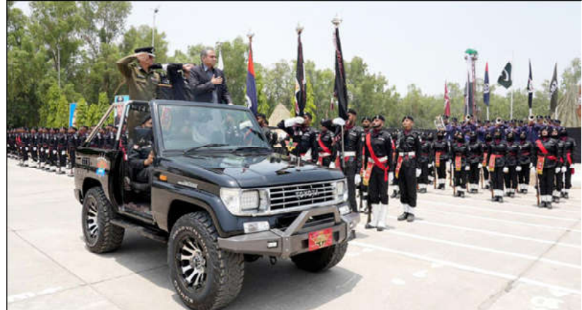
LAHORE: Caretaker Chief Minister Mohsin Naqvi inspecting the 24th passing out parade of Basic Elite Combat Course at Elite Police Training School.