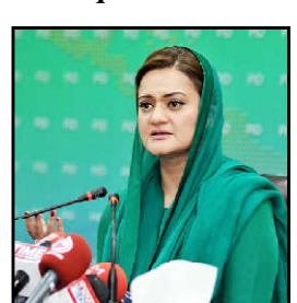
Maryam Aurangzeb speaking at a podium.

"I thank Prime Minister Shehbaz Sharif and Finance Minister Ishaq Dar for providing money for this important step, as the Minister of Information, it was one of my prime objectives to provide this facility to work-