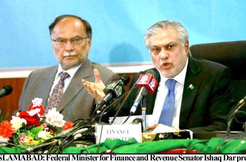
ISLAMABAD: Federal Minister for Finance and Revenue Senator Ishaq Dar pre-sents Economic Survey for fiscal year 2022-23 during a press conference.

The economy has been severely impacted by the devastating floods. The estimated damage amounts to $14.9 billion, with a loss of $15.2 billion to the GDP and a required investment of $16.3 billion for the The global inflation rate rehabilitation of the dam-