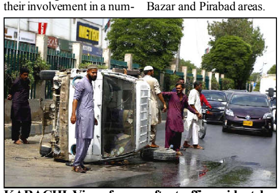
KARACHI: View of venue after traffic accident due to over speeding and break failure, while people busy in rescue work, located on Shahrah-e-Faisal Project. road in Karachi.

According to a spokesman for SIU, the unit on a tip-off conducted a raid near Eidgah Ground, Nazimabad and arrested the accused identified as Imran, Irshad and Rehmatullah during initial investigations revealed