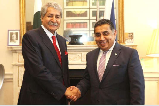
LONDON: Minister of State Foreign Commonwealth & Development Affairs UK, Lord, Tariq Ahmed and Federal Minister for Commerce Syed Naveed Qamar hold a productive meeting in London to discuses the current political and economic situation in Pakistan as well as trade and investment opportunities between both countries.

directives have been issued to the members of tained