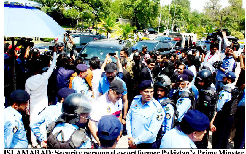
ISLAMABAD: Security personnel escort former Pakistan's Prime Minster Imran Khan at High Court.