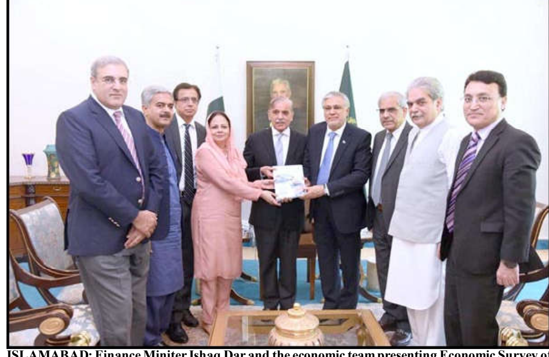
ISLAMABAD: Finance Miniter Ishaq Dar and the economic team presenting Economic Survey of Pakistan for FY-2022-23 to Prime Minister Muhammad Shehbaz Sharif.

tackle the growing challenges of food insecurity, malnutrition, and disease outbreak prevention." Moreover, she said the funding would empower humanitarian partners to deliver nutritious meals to mothers and children, aid in the reconstruction of local infrastructure to mitigate future disasters and expand.