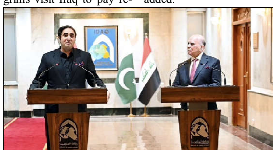
BAGHDAD: Foreign Minister Bilawal Bhutto Zardari along with his Iraqi counterpart Dr. Fuad Hussein addressing a joint press.

"I want to reiterate our desire to transform our bilateral relations into mutually beneficial economic ties. During my visit, we would have range of exchanges with the Iraqi leadership and private sector. We would be signing bilateral agreements focusing on strengthening our collaboration in diverse fields," he added.