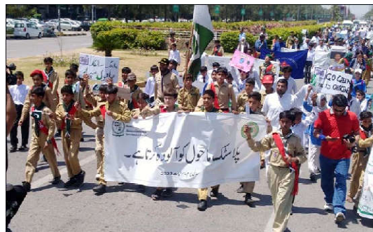
ISLAMABAD: Participants are holding awareness walk in connection of Climate Change to increased knowledge on plastic pollution organized by Ministry of Climate Change, held at D Chowk.