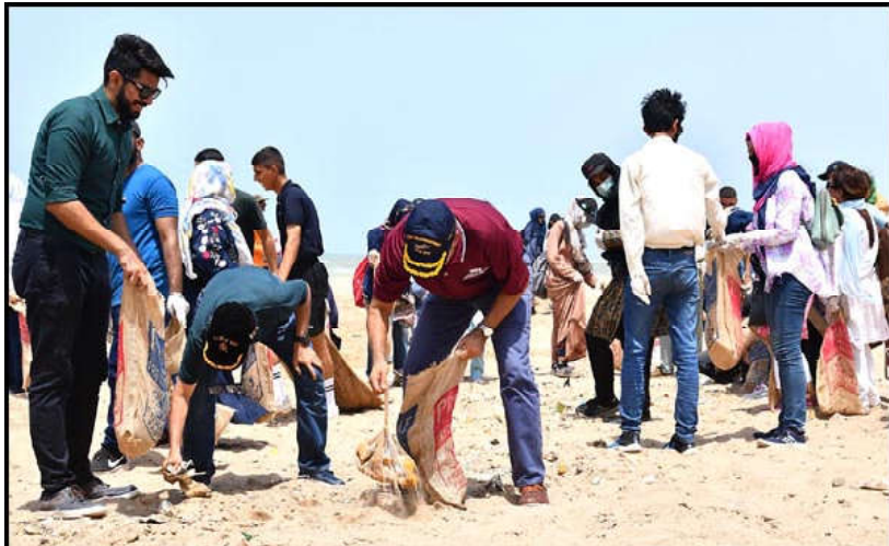
KARACHI: Pakistan Navy Personnel and students of Bahria University cleaning the beach on the occasion of World Environment Day.