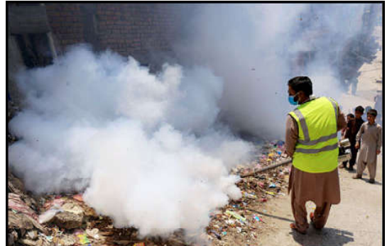
RAWALPINDI: Health workers spraying anti dengue spray in the residential areas to protect from dengue fever at Pirwadhai neighbourhood.

Lines. Officers and jawans of all ranks from various units and departments of the police force participated in large number in the darbar. DIG Malakand, DPOs Swat Lower Dir, Bajaur, Buner and other senior police officials were also present on the occasion. The police chief said that every officer and jawan of Khyber Pakhtunkhwa Police had performed their duties beyond the expectations despite all kinds of adverse conditions for the past two decades and every rank of officer.