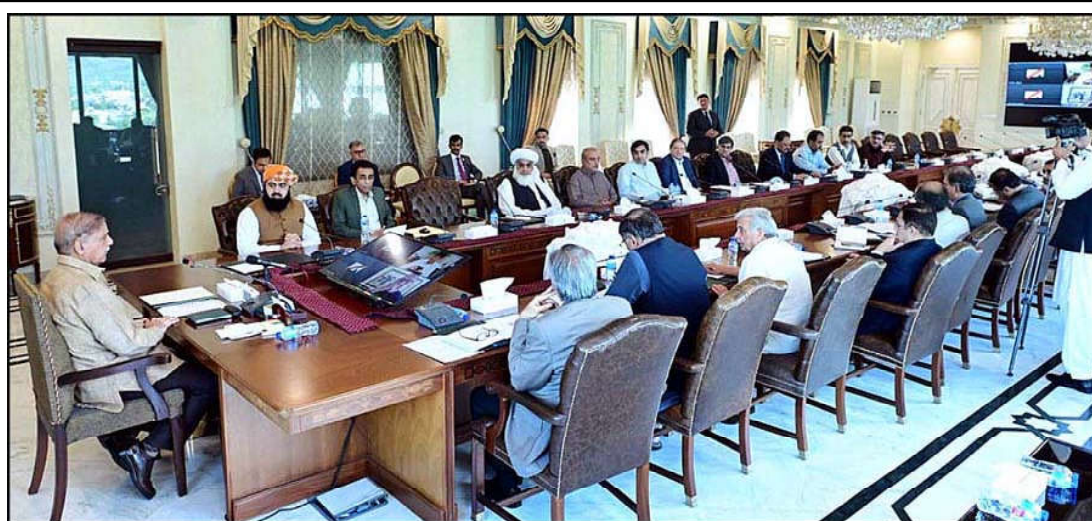
ISLAMABAD: Prime Minister Muhammad Shehbaz Sharif chairs a meeting of coalition partners for consultation on proposals for Public Sector Development Programme 2023-24.