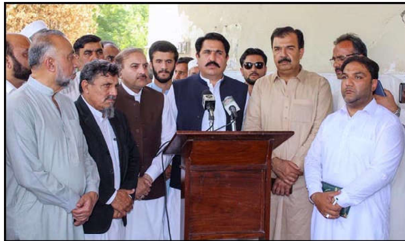
PESHAWAR: Media briefing by Federal Minister for Overseas Pakistanis & Human Resource Development Mr. Sajid Hussain Turi at Radio Pakistan.