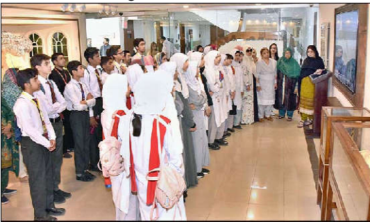
ISLAMABAD: Students of the International Islamic University Shaheed, 1-8 Campus visiting Senate Museum at Parliament House.

ISLAMABAD (APP): Pakistan Navy on Monday celebrated World Environment Day to underscore the significance and emphasize on taking suitable measures to protect the marine ecosystem. World Environment Day is observed globally on 5 June to raise awareness of the significance of a healthy and green environment. It aims to promote healthy measures for improving quality of life. This year's theme for World Environment Day is 'Solutions to Plastic Pollution', which aims to bring focus on the importance of pollution caused by plastic material and promote its responsible use to protect the environment, a Pakistan Navy news release said. To show firm resolve and create awareness, Pakistan Navy organised various lectures, harbour cleaning campaign at Karachi and an awareness walk at Manora Beach to highlight the importance of preserving the environment. Additionally, PN has launched various initiatives to conserve the environment ranging from a collection of solid waste from the harbour.