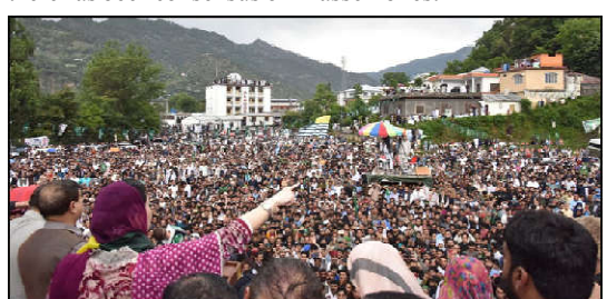
KASHMIR: Chief Organizer of Pakistan Muslim League (N) Maryam Nawaz addressing to the huge crowd during public gathering at Bagh area.

The ministry has further said in the petition that the Supreme Court should withdraw its order for elections in Punjab in view of the security situation and order the exercise after the completion of the term of the Sindh and Balochistan assemblies.