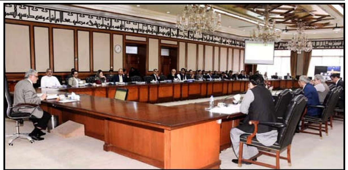
ISLAMABAD: Federal Minister for Finance and Revenue Senator Mohammad Ishaq Dar chaired the meeting of the Economic Coordination Committee (ECC) of the Cabinet.

The ECC on the summary of Ministry of National Health Services, Regulations and Coordination approved fixation of maximum retail prices (MRPs) of 49 new drugs on the basis of being lower as compared to their prices in the neighbouring countries.