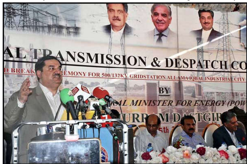
FAISALABAD: Federal Minister for Power Engineer Khurram Dastgir Khan is addressing a gathering after laying foundation stone for the construction of 500/132-KV grid station of Allama Iqbal Industrial City (AIIC) near Sahianwala.