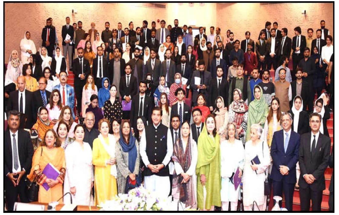
ISLAMABAD: Speaker National Assembly Raja Pervez Ashraf in a group photo with participants at seminar "Reclaiming the Space: Reading the Constitution from Women's perspective organized by WPC."